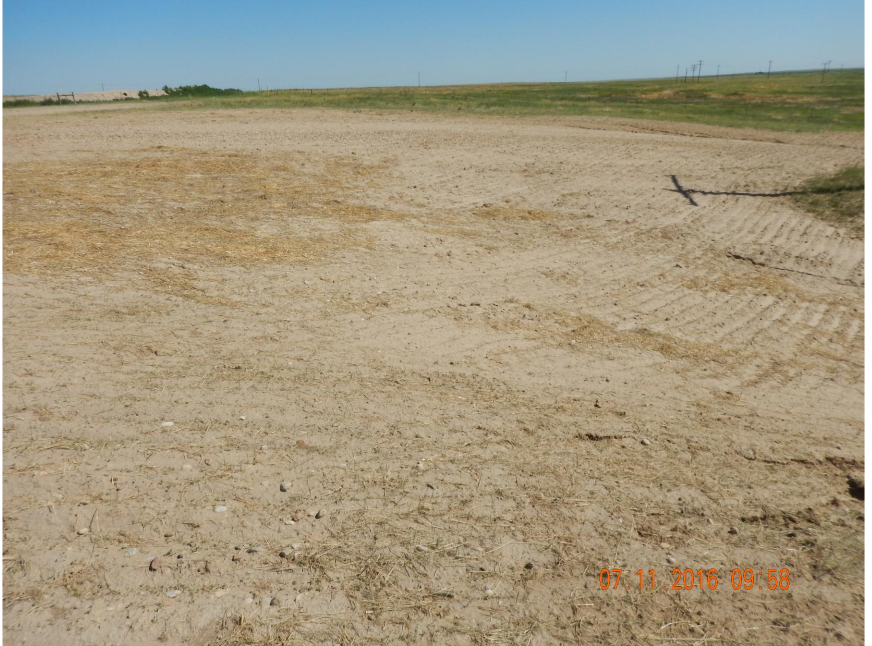
Figure 6: Photo taken from the east end of the location, facing north. Photo shows gully erosion beginning to reform on the right of the photo.