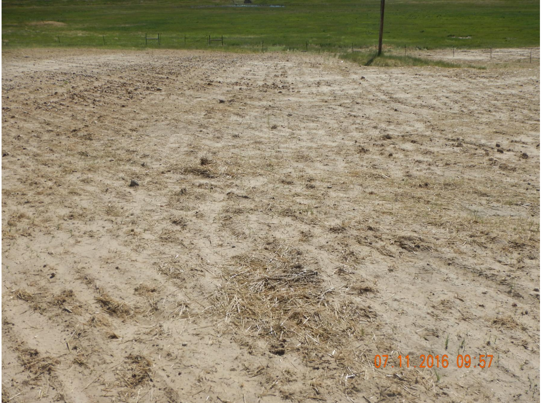
Figure 2: Photo taken from the south end of the location, facing east. Photo shows area where gully erosion had occurred had been repaired and seeded.