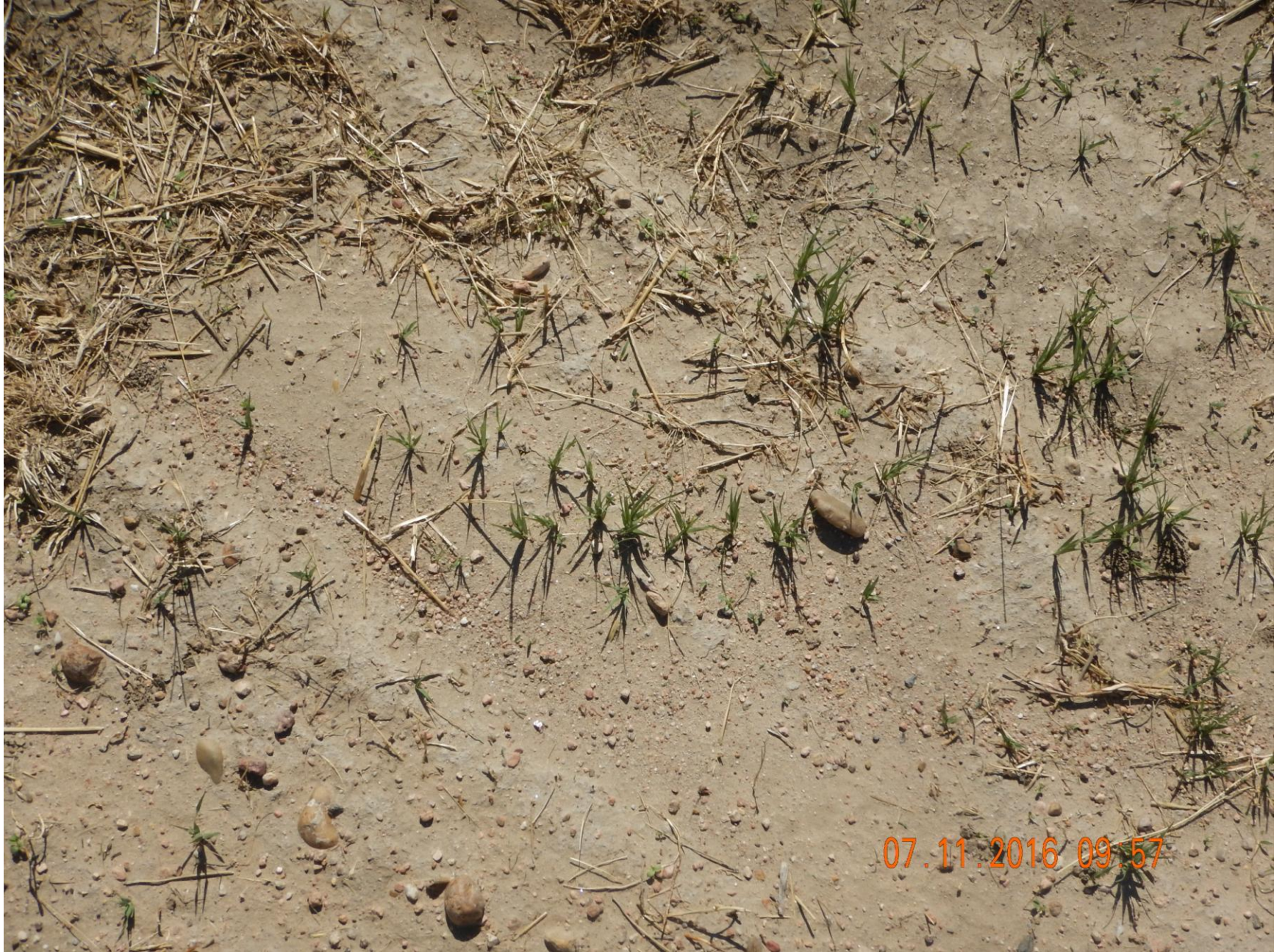
Figure 5: Photo taken from the east end of the location. Photo shows germination over the seeded area.