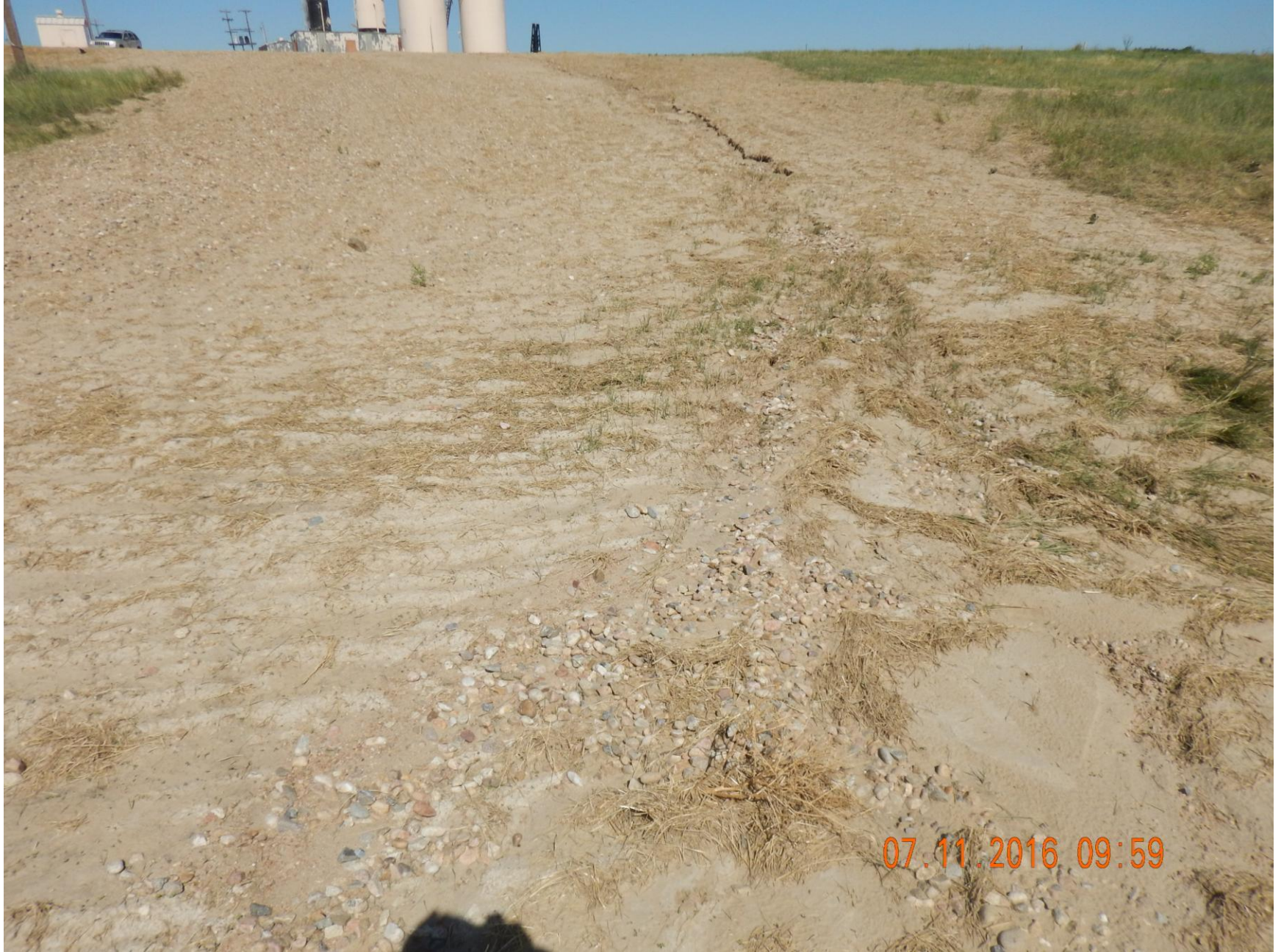
Figure 8: Photo taken from the east end of the location, facing west. Photo shows erosion occurring over the reclamation area. Note rock/gravel bottom of photo was transported via stormwater from battery location