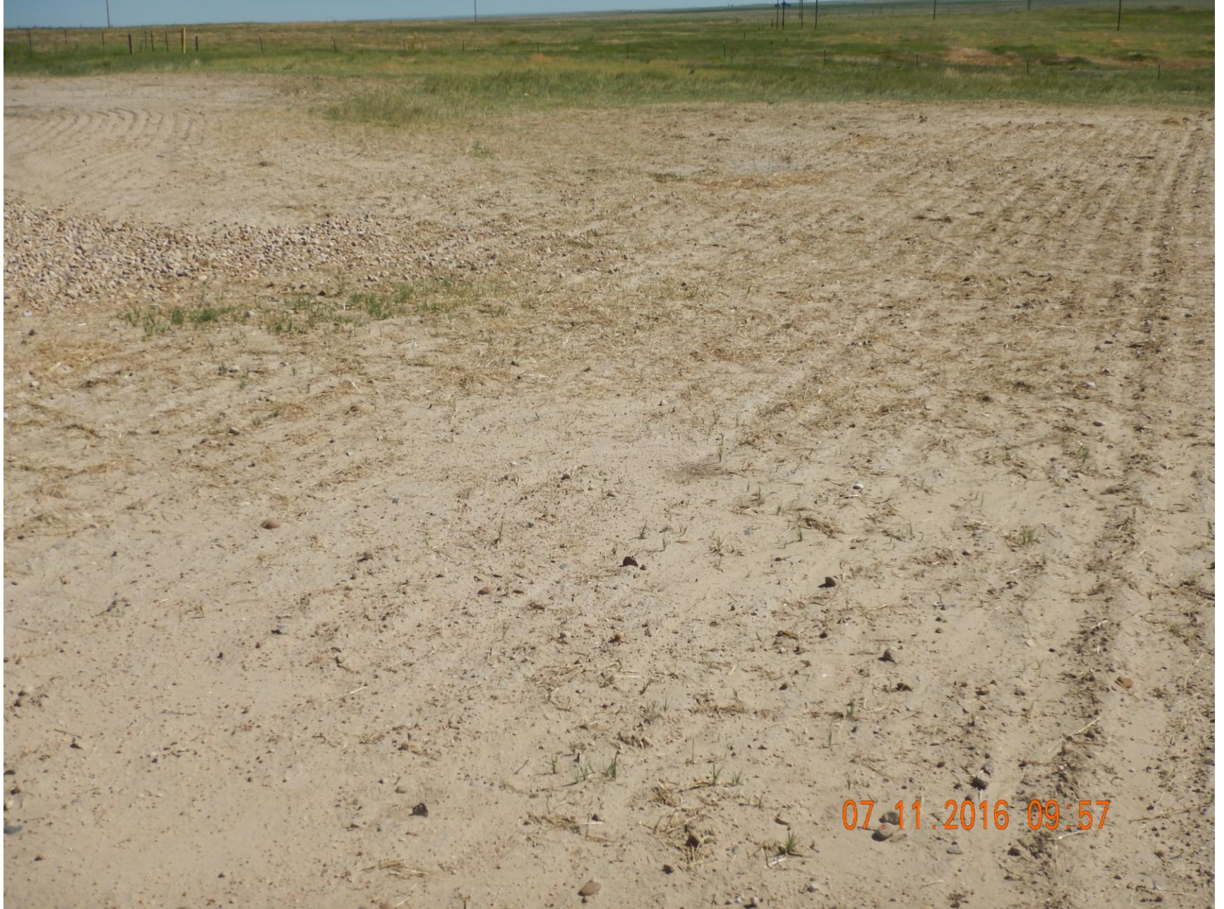
Figure 3: Photo taken from the south end of the location, facing northeast. Photo shows area where gully erosion had occurred had been repaired and seeded.