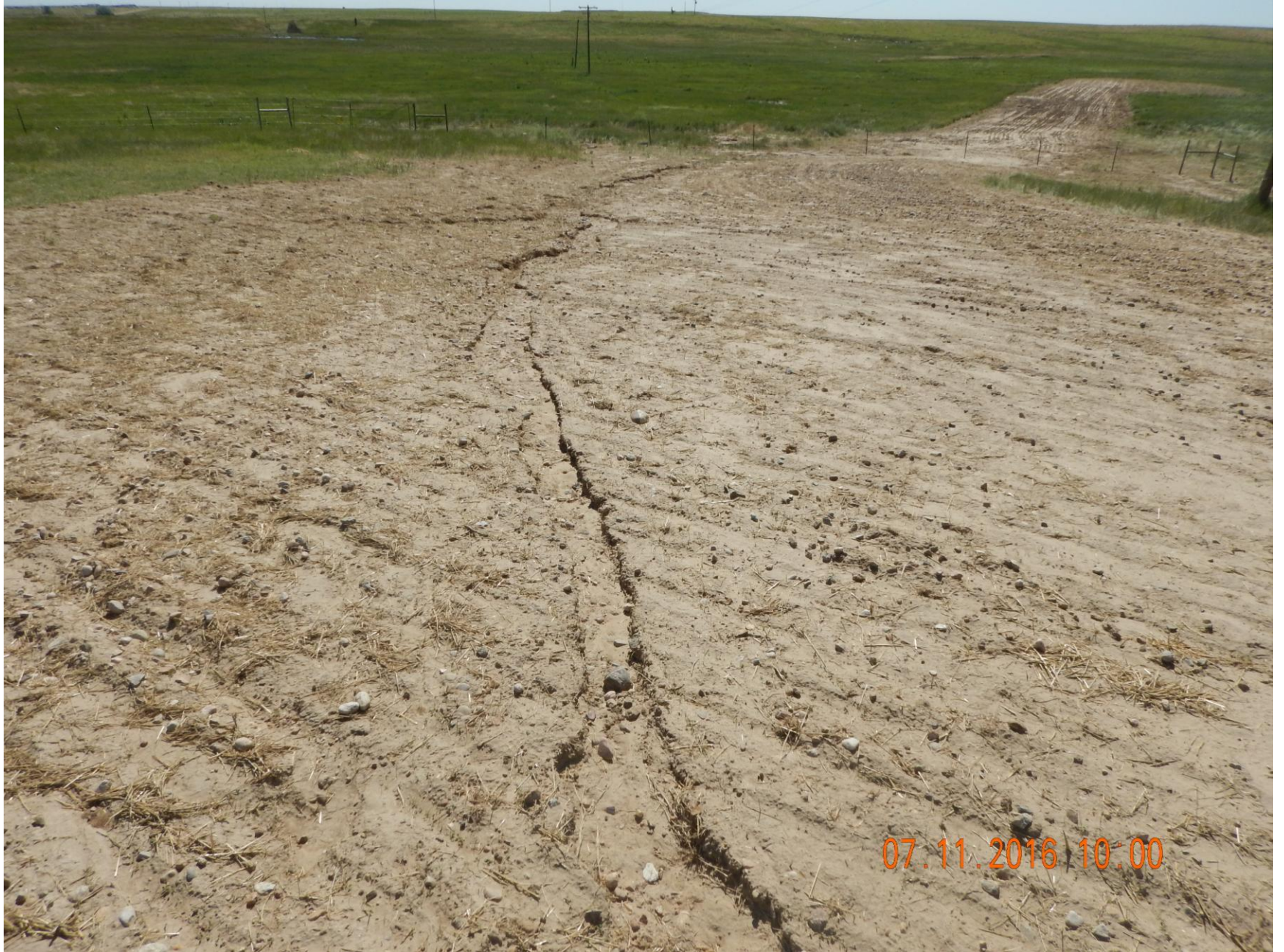
Figure 10: Photo taken from the east end of the location, facing east. Photo shows erosion occurring over the reclamation area.