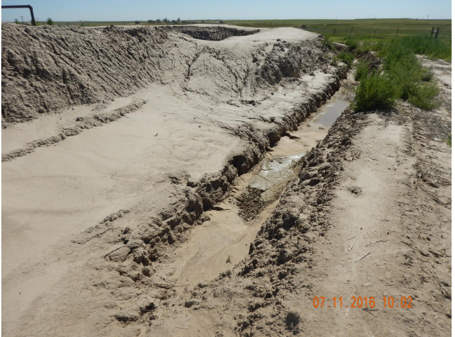
Figure 11: Photo taken from the south end of the pit location, facing east. Photo shows berm has been reworked, stormwater and sediment ditch constructed.