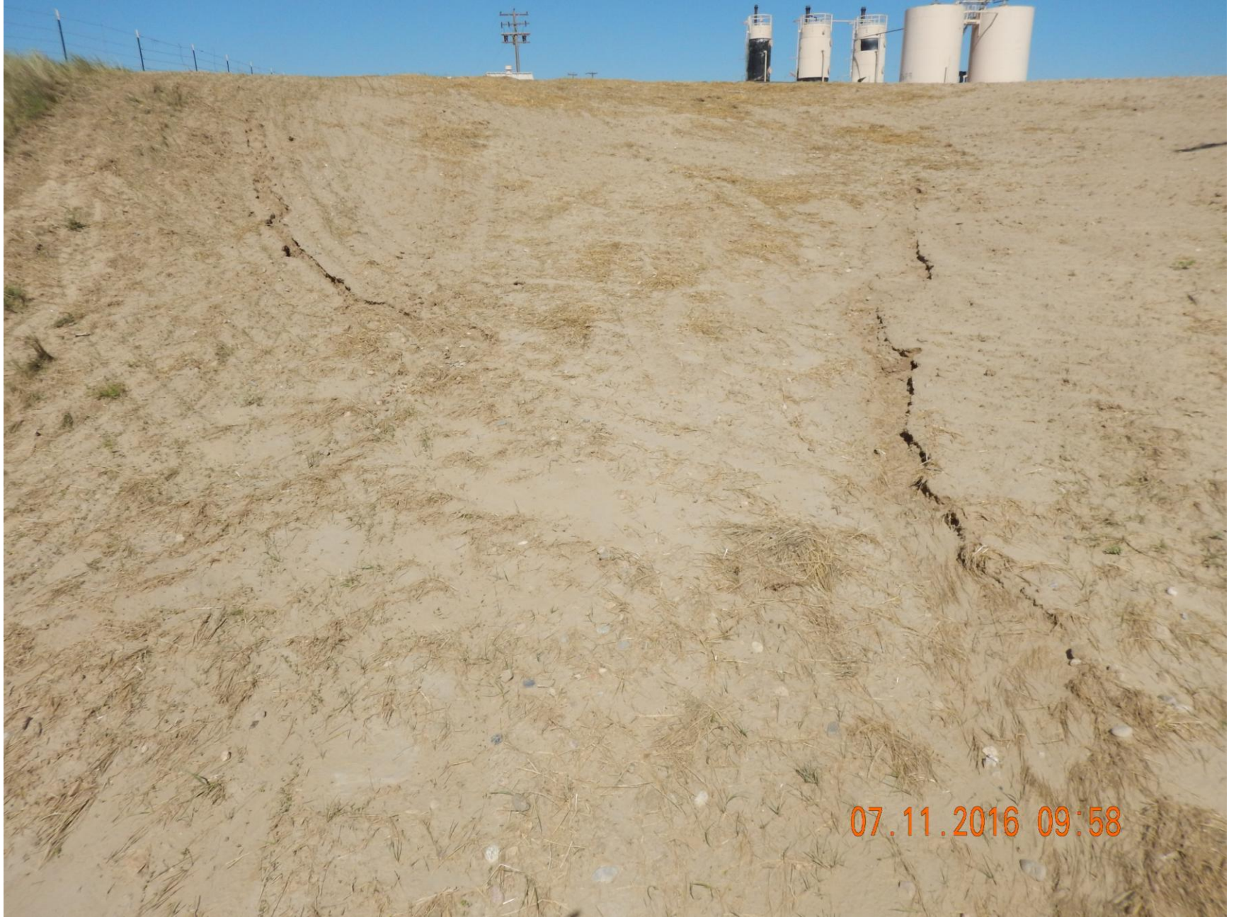
Figure 7: Photo taken from the east end of the location, facing west. Photo shows erosion occurring over the reclamation area.