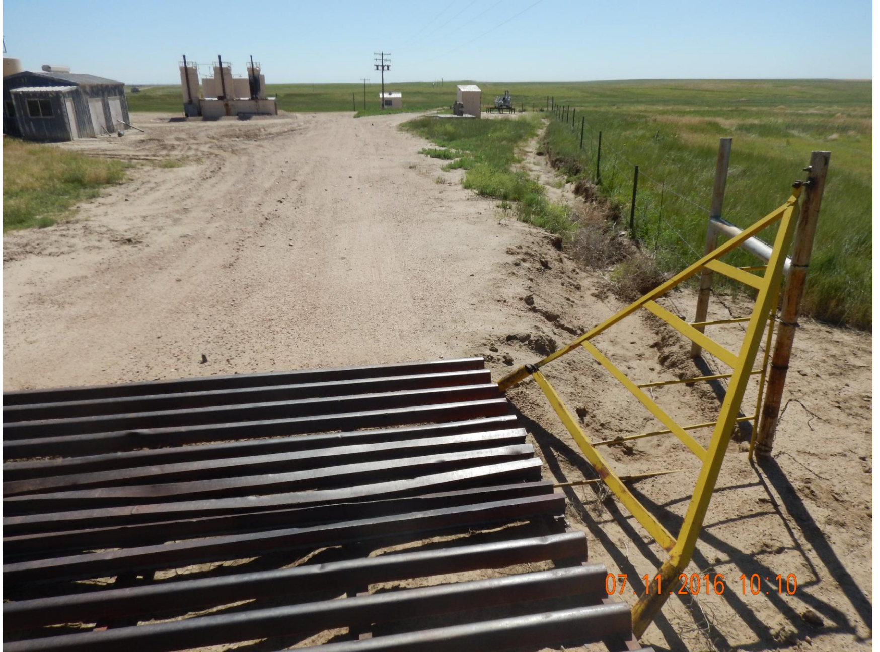
Figure 13: Photo taken from access road on the west end of the location. Photo shows stormwater diversion ditch constructed on the south end of the location.