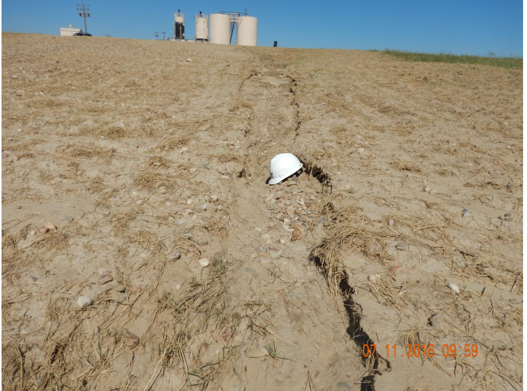
Figure 9: Photo taken from the east end of the location, facing west. Photo shows erosion occurring over the reclamation area. White hard hat used for reference.