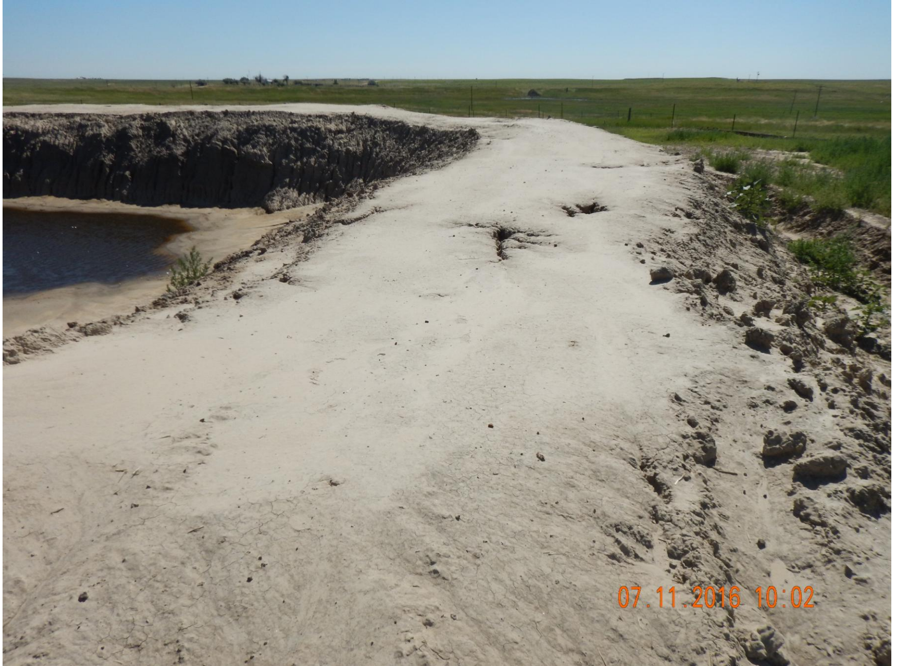
Figure 12: Photo taken from the south end of the pit location, facing east. Photo shows berm has been reworked.