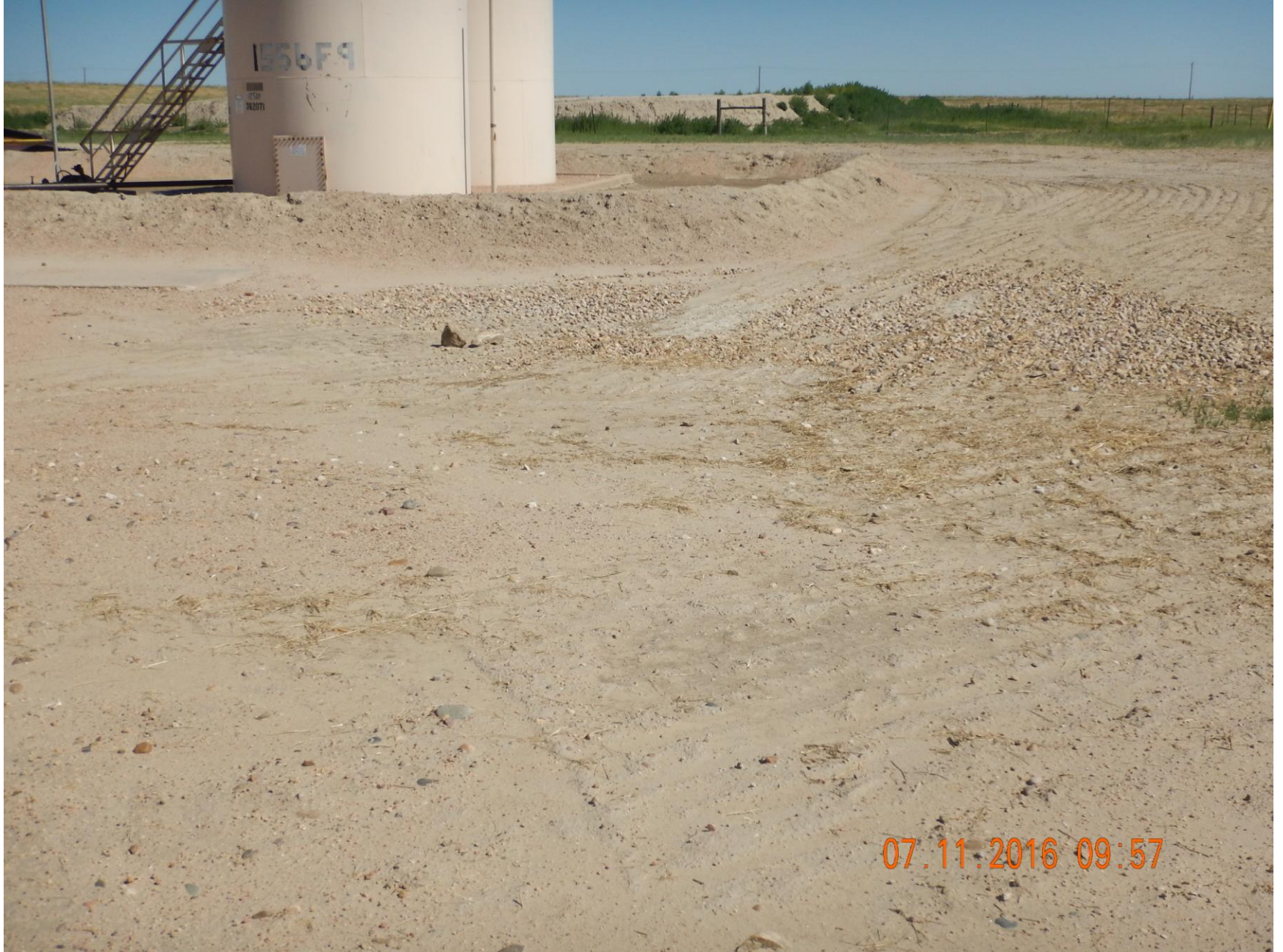
Figure 4: Photo taken from the south end of the location, facing north. Photo shows area where gully erosion had occurred had been repaired and seeded.