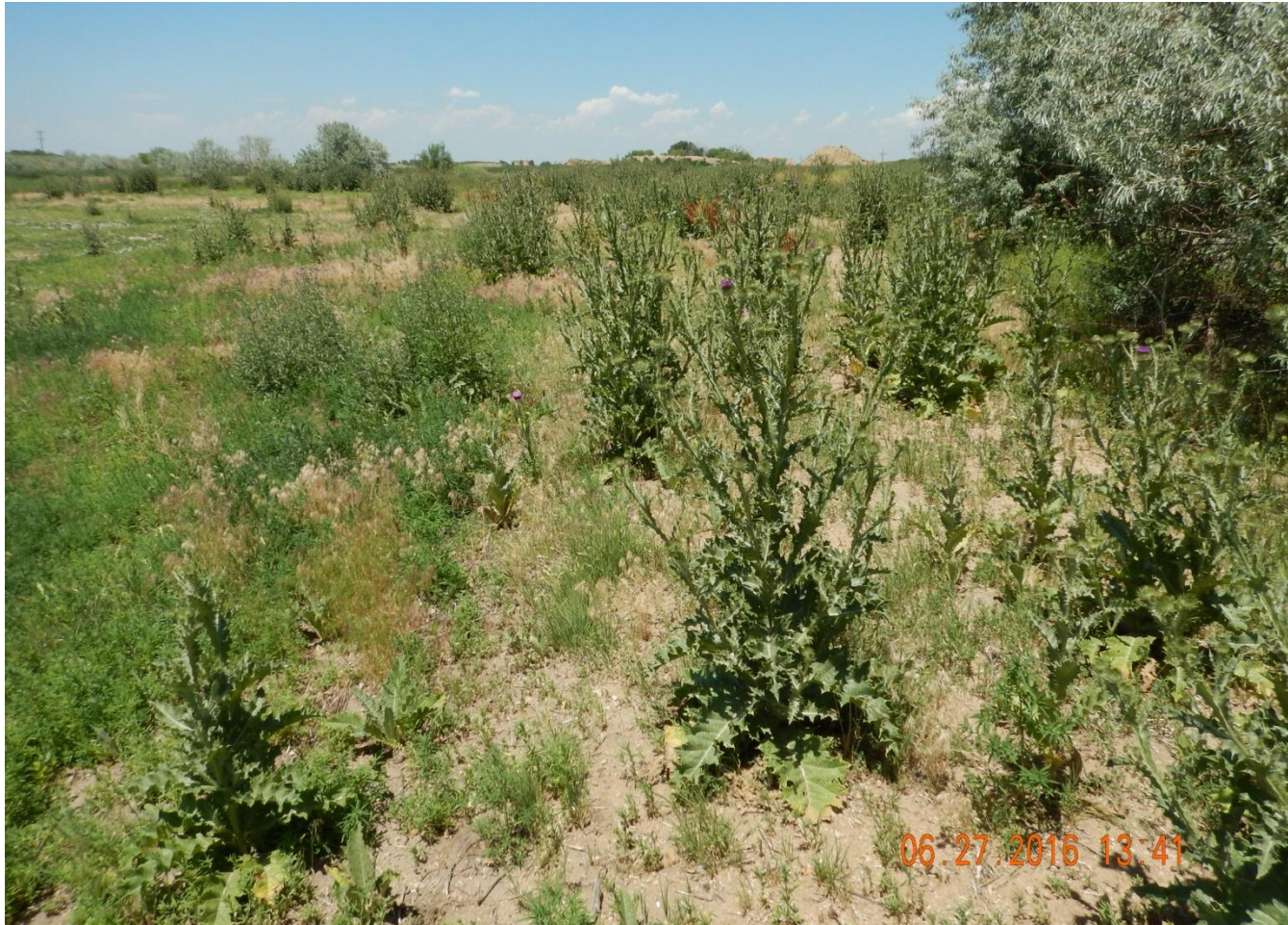
Photo 7. Photo taken from southern well location, facing North. A List B Colorado Noxious weed has infested large portions of the location- Scotch thistle ( Onopordum acanthium )- and needs to be removed from location by 7/26/2016.