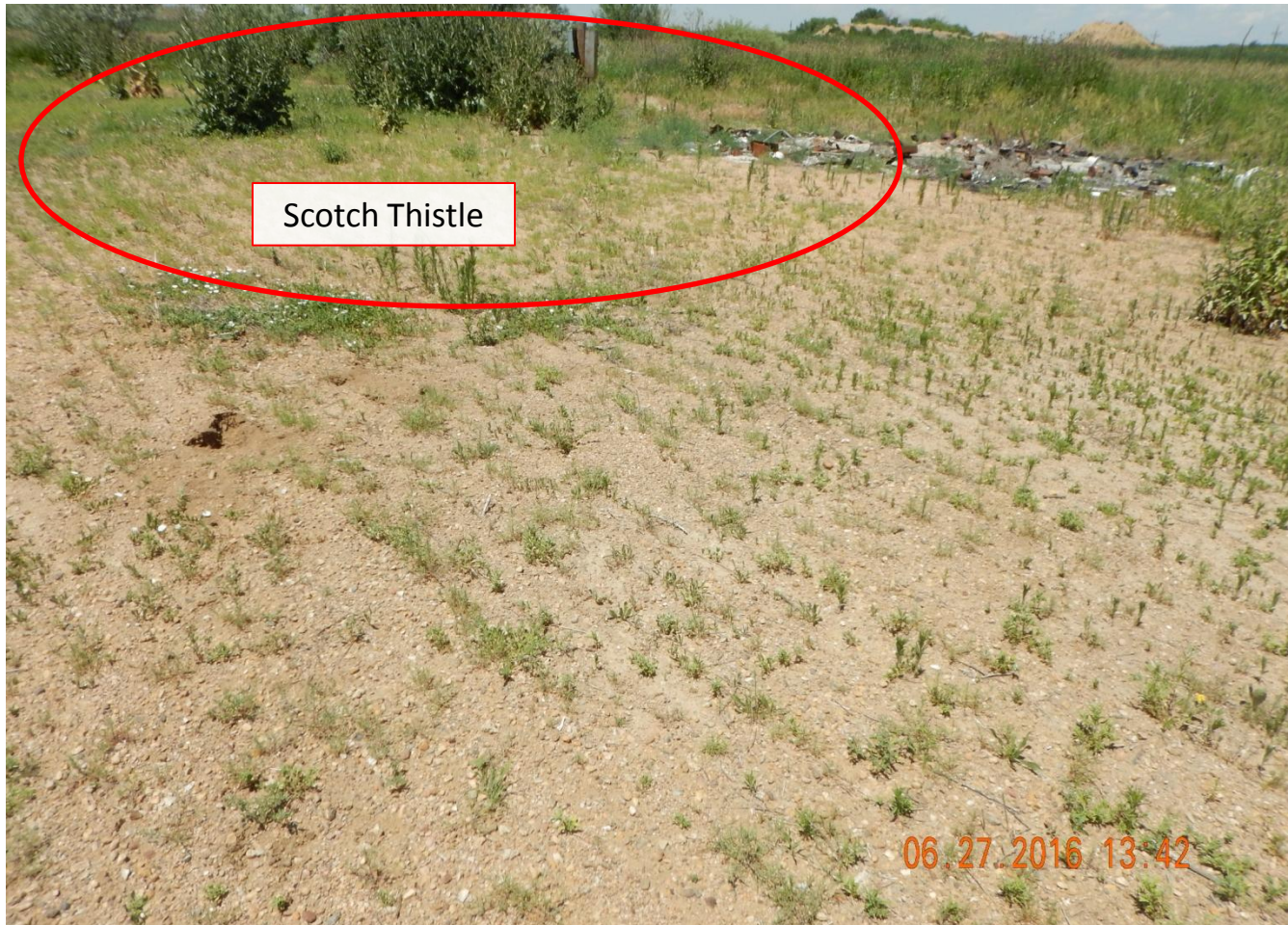
Photo 3. Photo taken from well location, facing North. Need to reclaim location per Rule 1004. A seeding attempt was made but gravel was not removed preventing proper vegetative establishment.