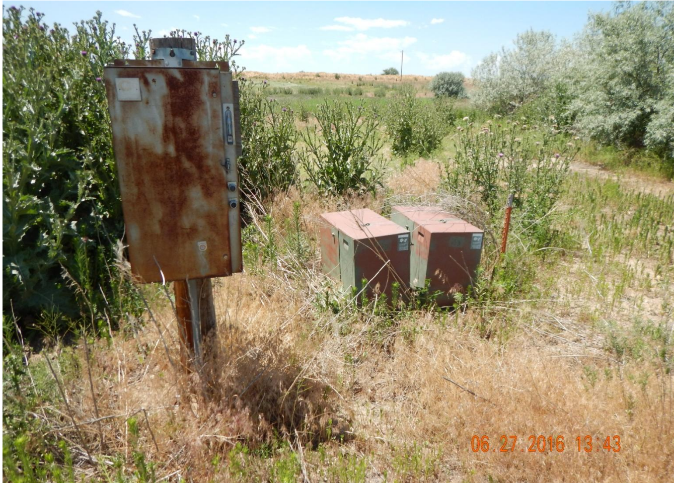
Photo 8. Photo taken from well location illustrating equipment and debris that still remains and needs to be removed per Rule 1004.