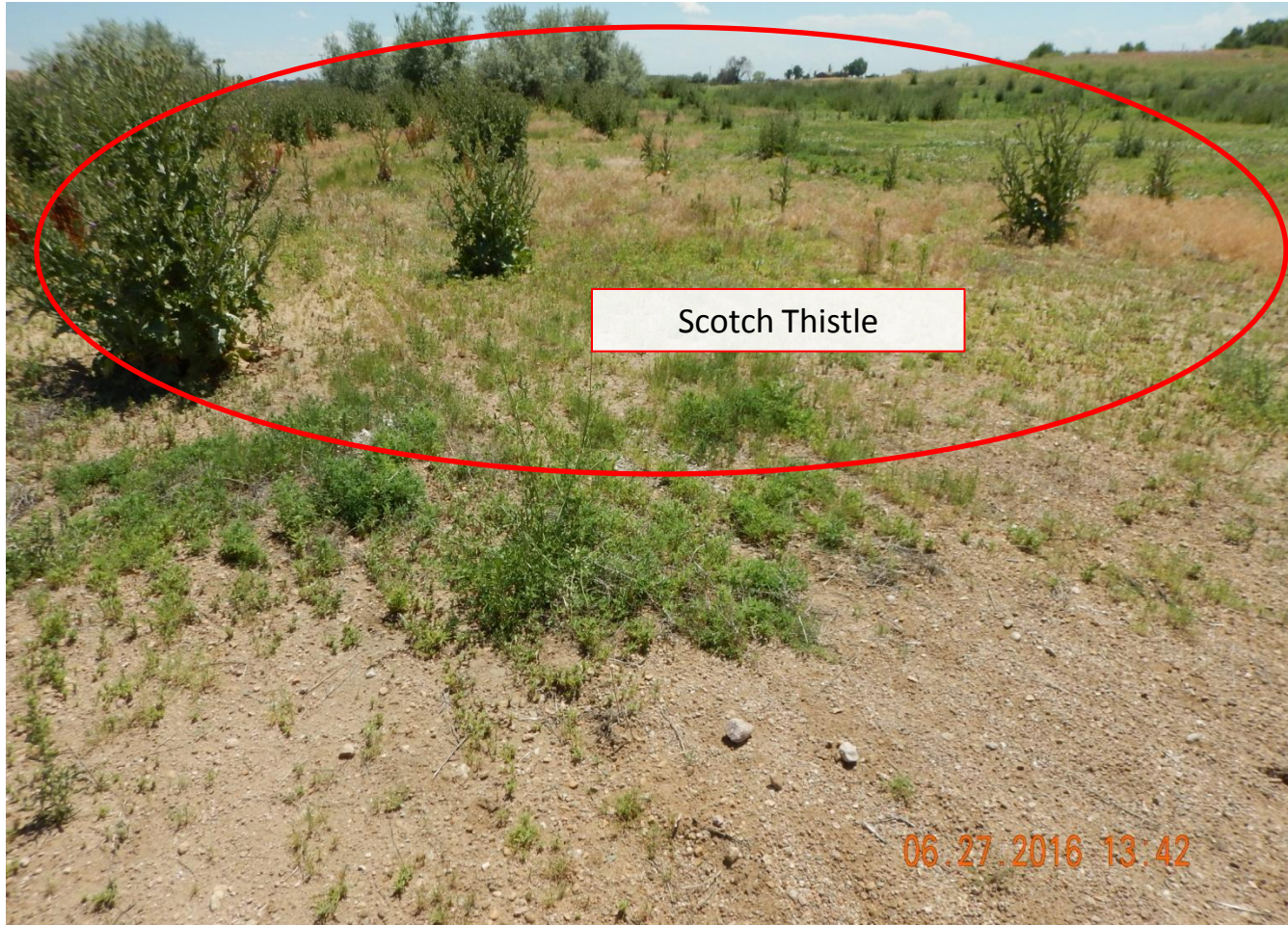
Photo 5. Photo taken from well location, facing South. Need to reclaim location per Rule 1004. A seeding attempt was made but gravel was not removed preventing proper vegetative establishment.