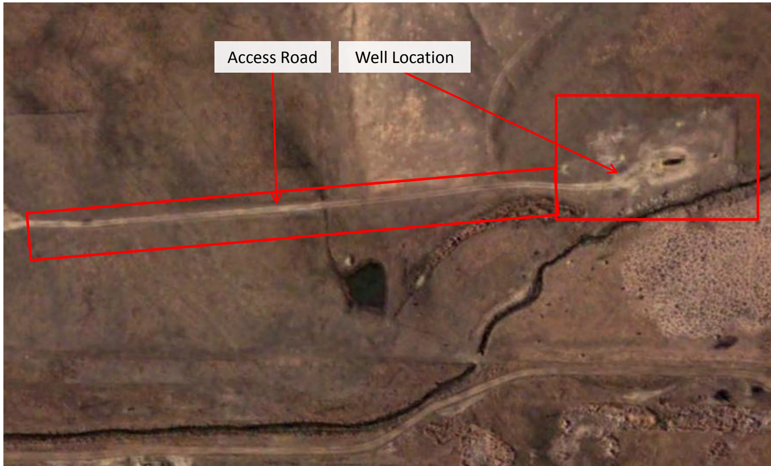
Photo 1. Aerial imagery from 12/2/2002, illustrating total areas that have not been reclaimed per Rule 1004 (highlighted in red). Large portions of the well location are infested with a List B Colorado Noxious weed- see following photos.