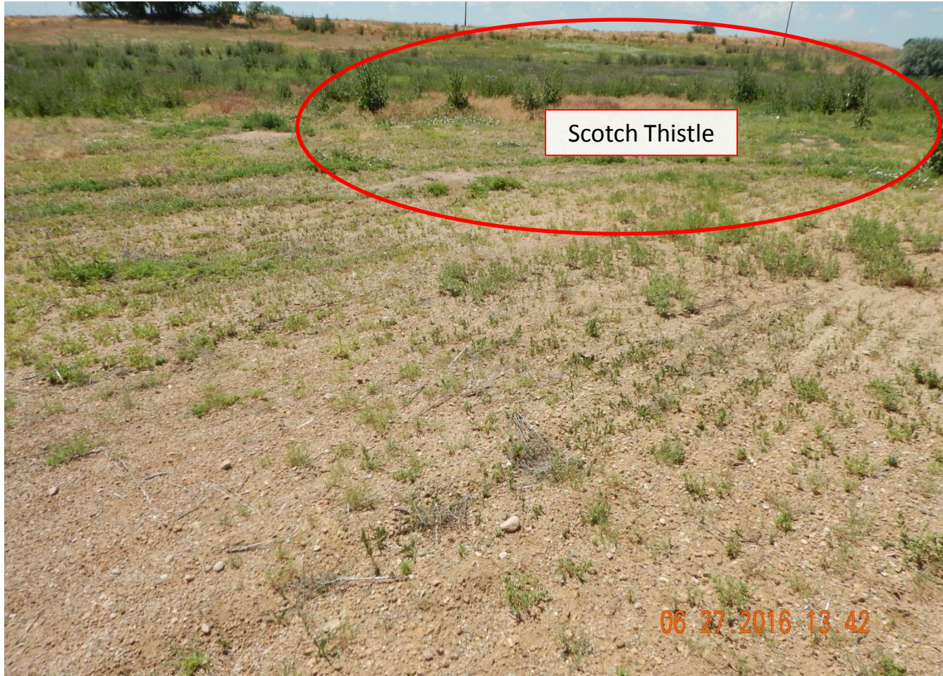
Photo 2. Photo taken from well location, facing West. Need to reclaim location per Rule 1004. A seeding attempt was made but gravel was not removed preventing proper vegetative establishment.