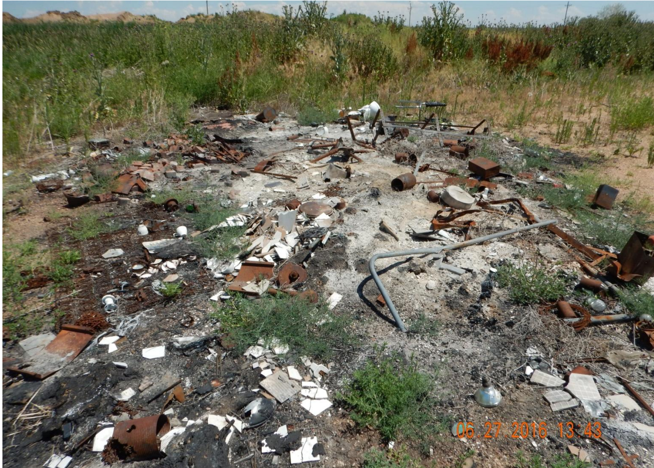
Photo 6. Photo taken from northeast well location. Need to remove trash per Rule 603.f.