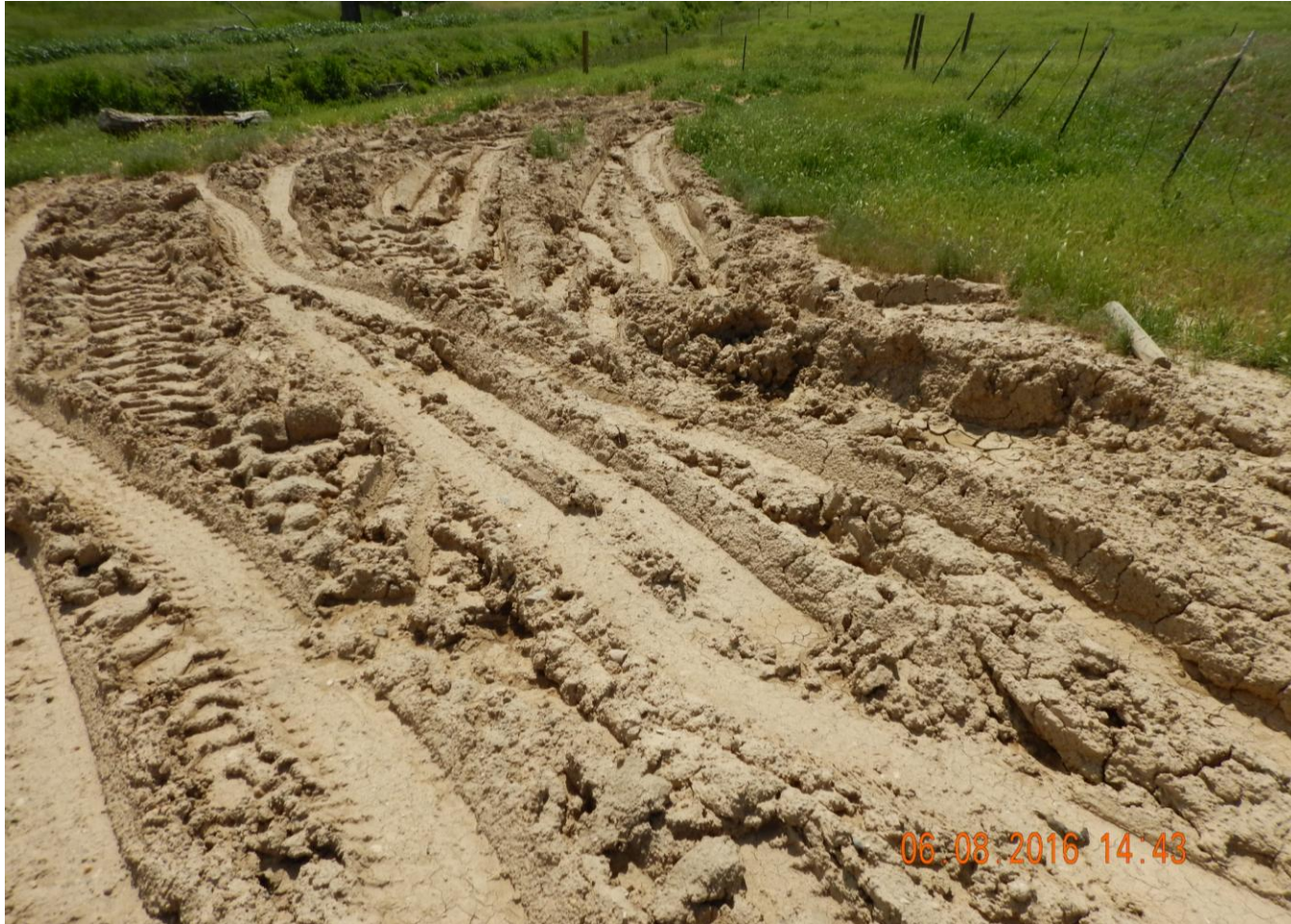
Photo 3. Photo taken from southwest of tank batteries, facing West. Need to maintain access road to prevent vehicle tracking and rutting.