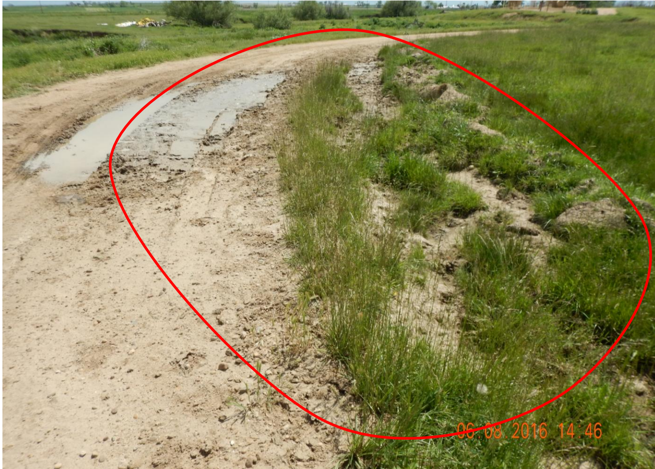
Photo 5. Photo taken north of tank batteries, facing South. Access road was widened. Need to repair access road and reseed portions that will be disturbed. Reseeding may have to wait until the Fall when more favorable conditions are permitted.