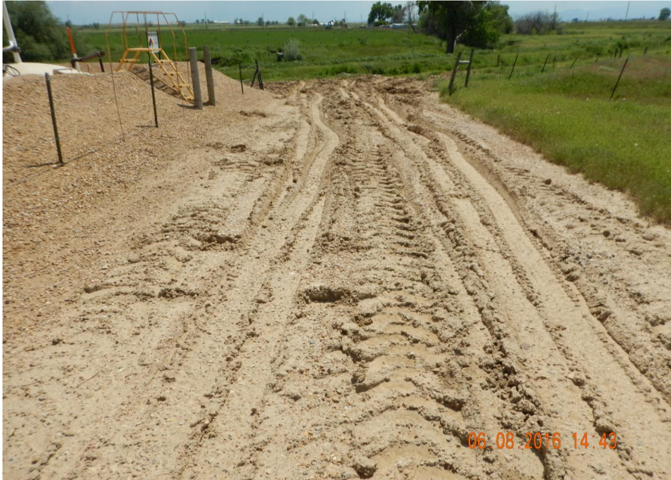
Photo 2. Photo taken from west of tank batteries, facing South. Need to maintain access road to prevent vehicle tracking and rutting.