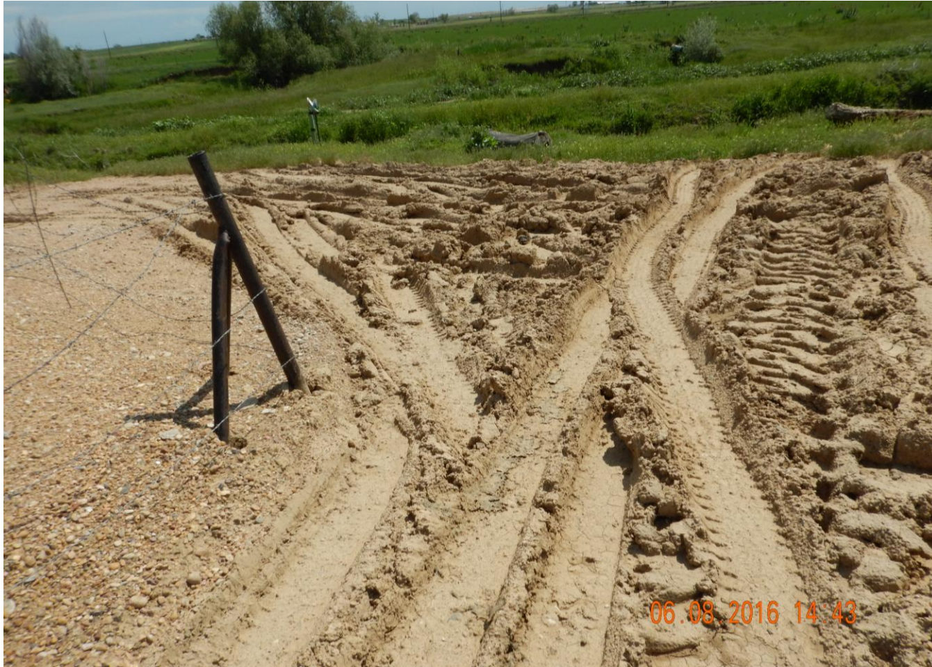
Photo 4. Photo taken from southwest of tank batteries, facing East. Need to maintain access road to prevent vehicle tracking and rutting.