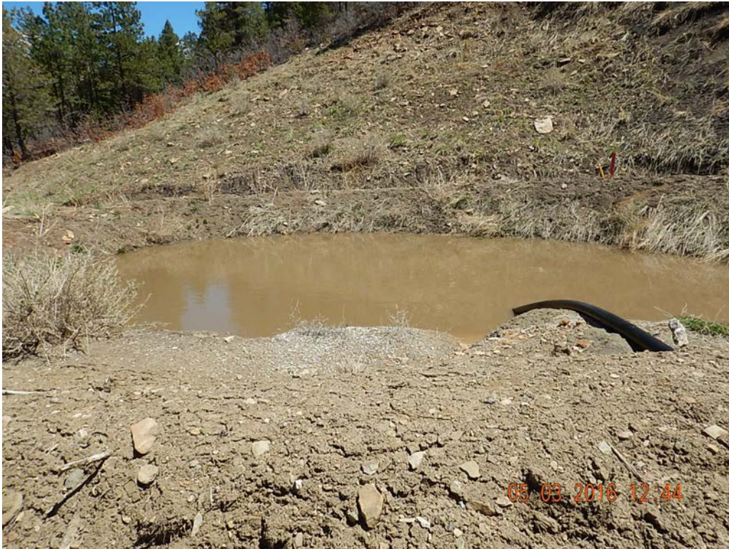
Figure 3 – Pit