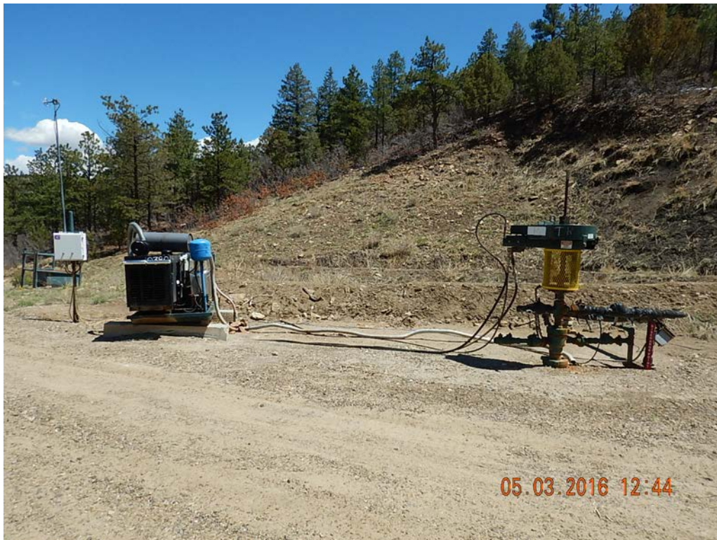
Figure 2 – Wellhead