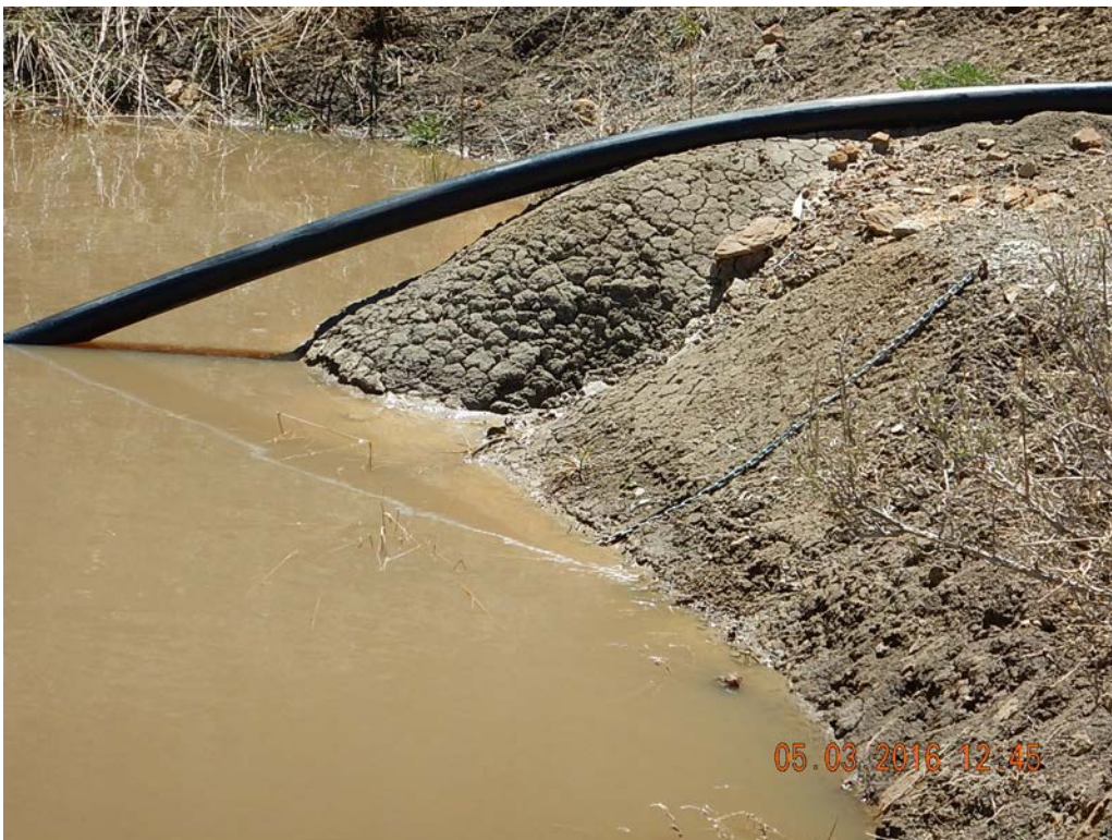
Figure 4 – Freeboard marker (chain). Fluid level is at bottom of marker.