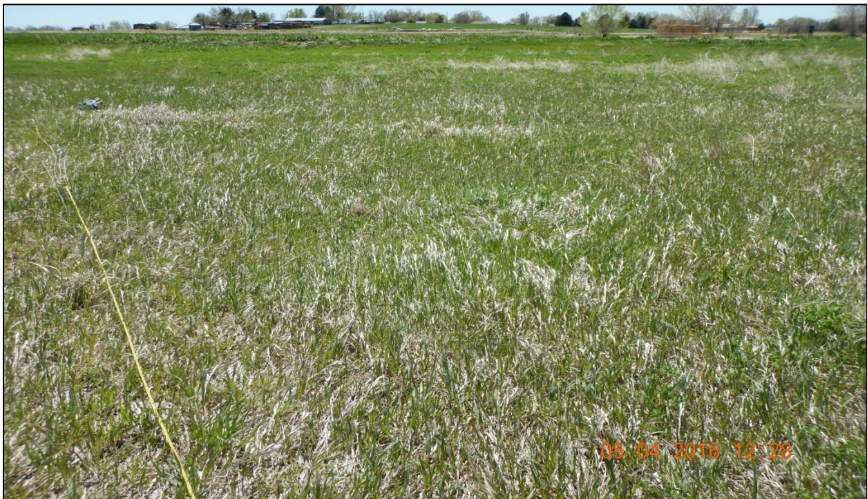
Photo 6: Photo taken 5/4/16 from midpoint of Reference #1 transect, facing South.