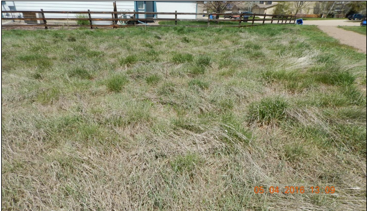
Photo 11: Photo taken 5/4/16 from midpoint of Reference #2 transect, facing North.