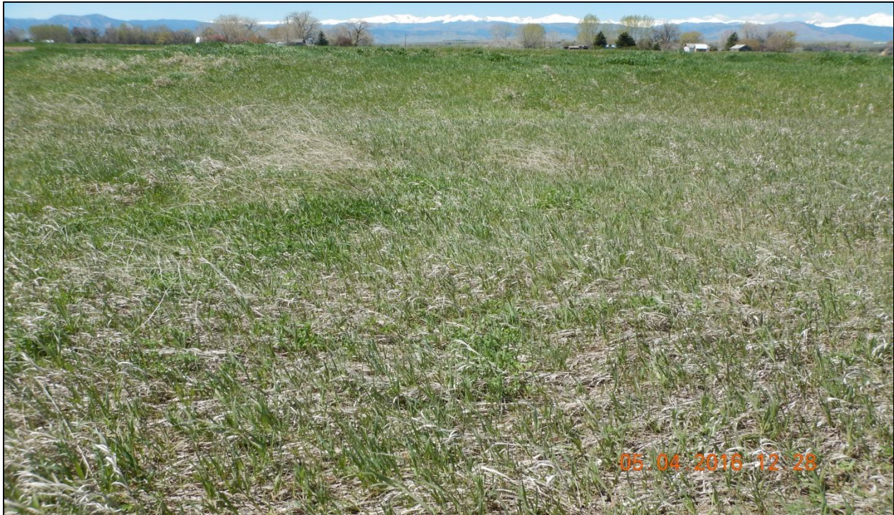
Photo 3: Photo taken 5/4/16 from midpoint of Reference #1 transect, facing West.