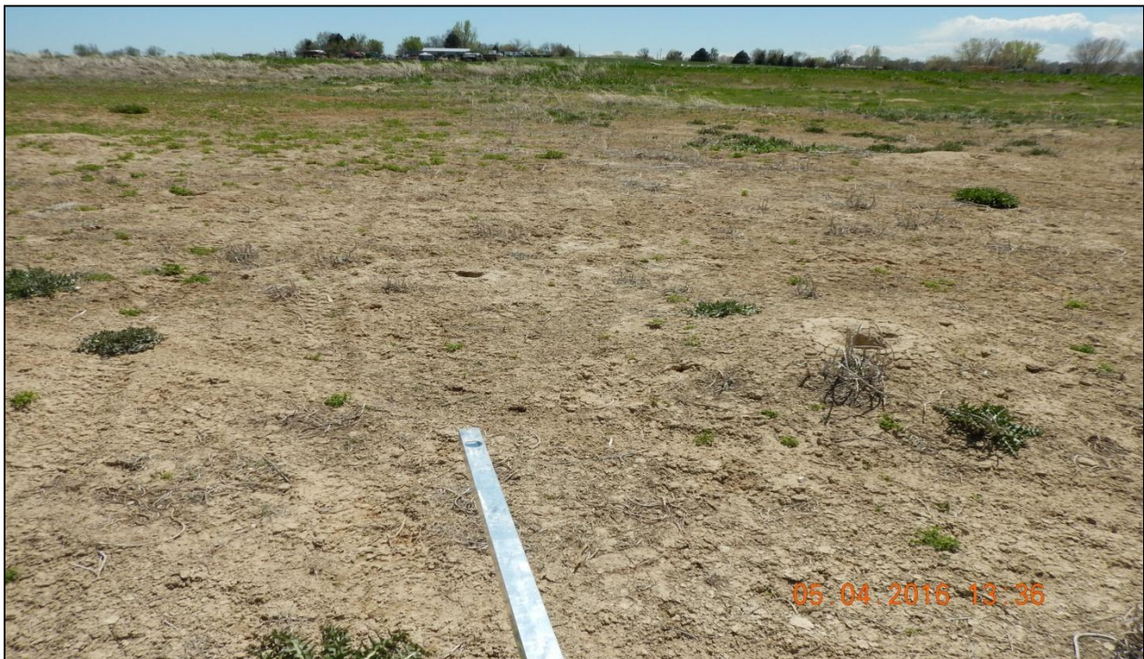
Photo 20: Photo taken 5/4/16 from midpoint of Disturbance #1 transect, facing South.