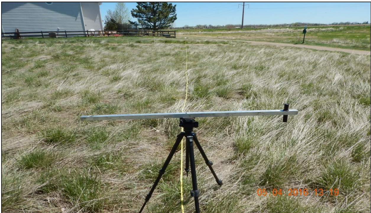
Photo 14: Photo taken 5/4/16 from end of Reference #2 transect, facing East.