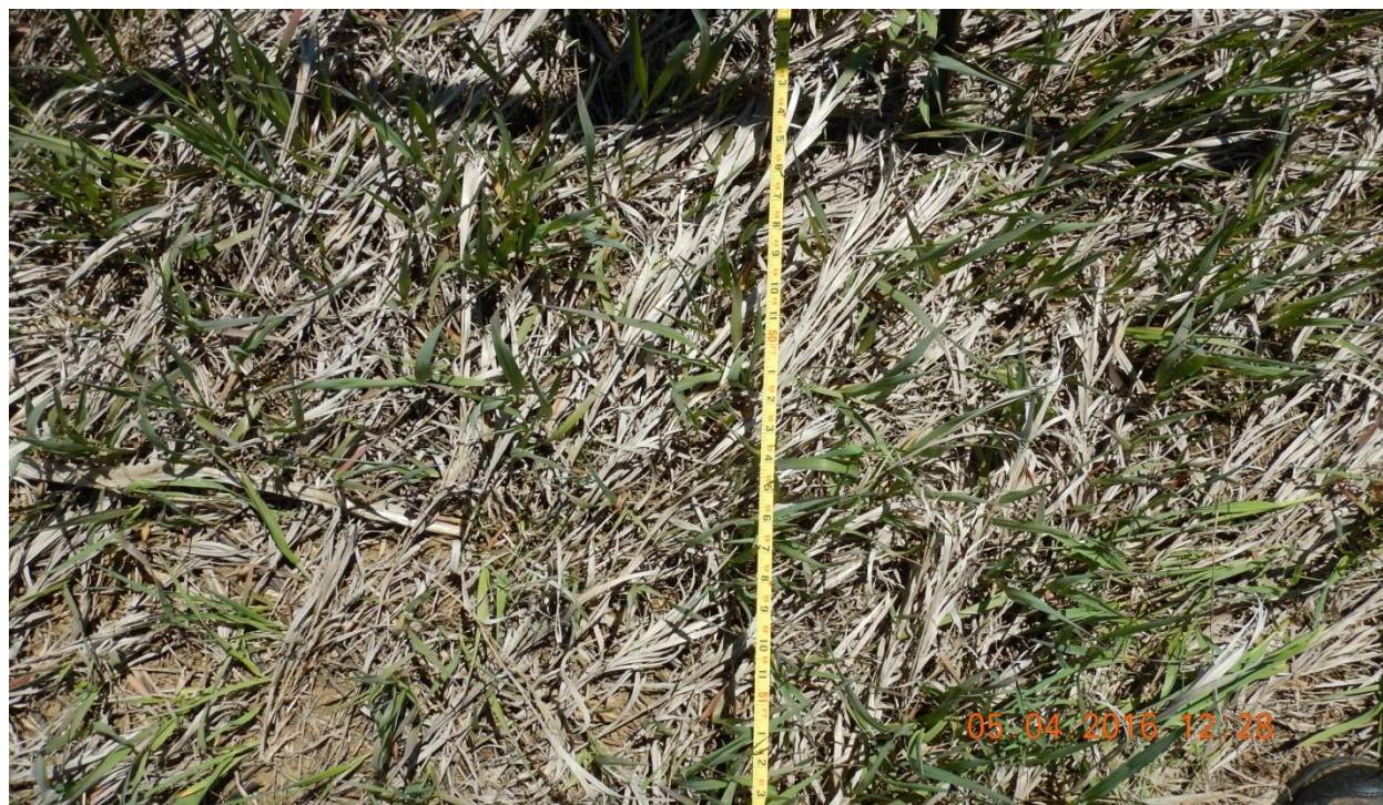
Photo 2: Photo taken 5/4/16 from midpoint of Reference #1 transect.