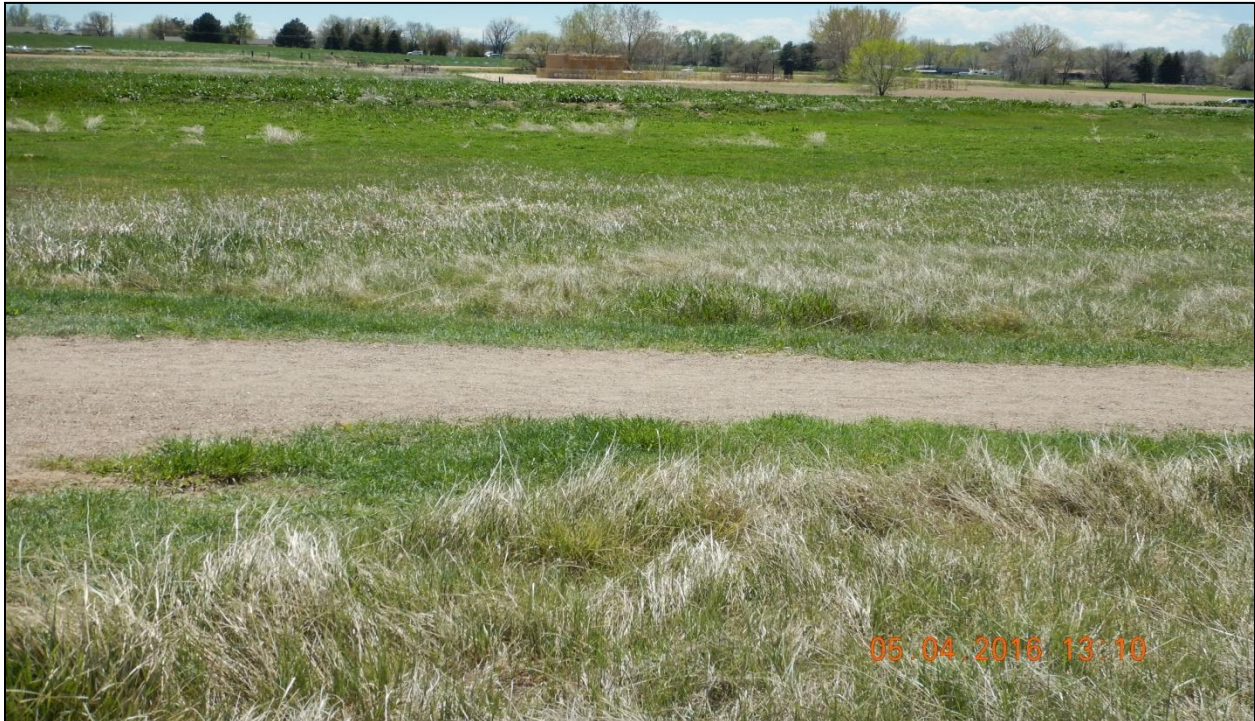
Photo 13: Photo taken 5/4/16 from midpoint of Reference #2 transect, facing South.