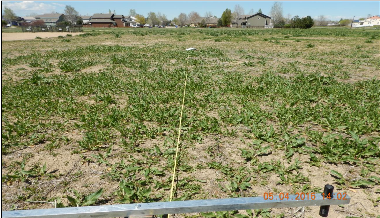
Photo 25: Photo taken 5/4/16 from midpoint of Disturbance #2 transect, facing North.