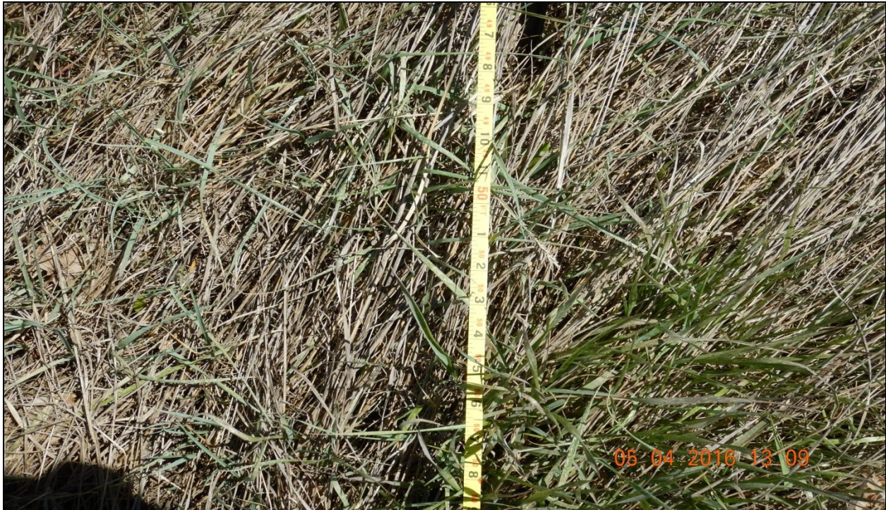
Photo 9: Photo taken 5/4/16 from midpoint of Reference #2 transect.