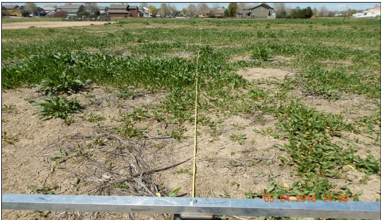
Photo 28: Photo taken 5/4/16 from end of Disturbance #2 transect, facing North.