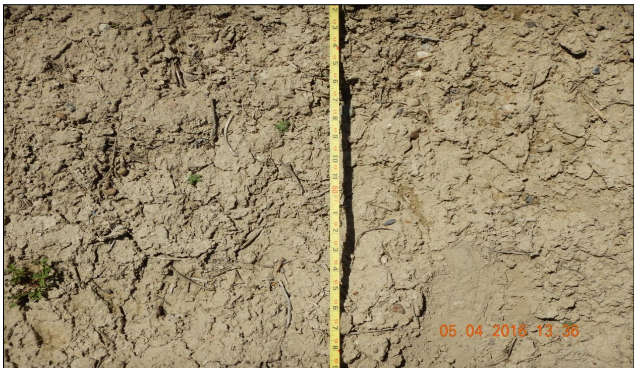
Photo 16: Photo taken 5/4/16 from midpoint of Disturbance #1 transect.