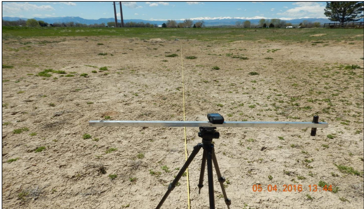
Photo 21: Photo taken 5/4/16 from end of Disturbance #1 transect, facing West.