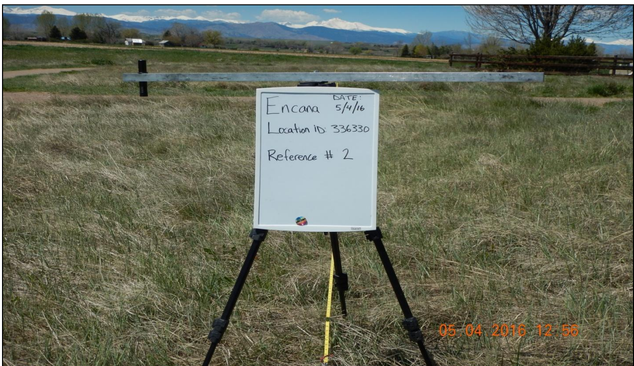
Photo 8: Photo taken 5/4/16 from start of Reference #2 transect, facing West. Location dominated by western wheatgrass ( Pascopyrum smithii ) and crested wheatgrass ( Agropyron cristatum ). Refer to cover datasheet for total vegetation composition.