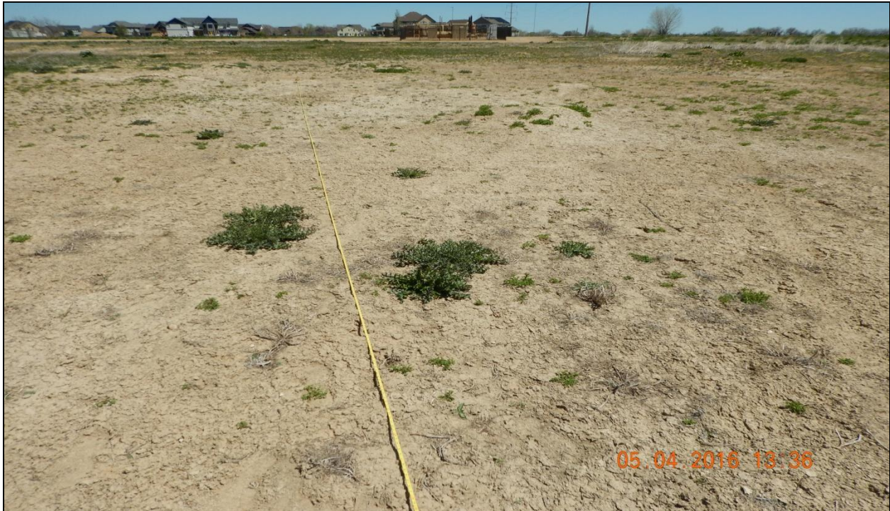
Photo 19: Photo taken 5/4/16 from midpoint of Disturbance #1 transect, facing East.