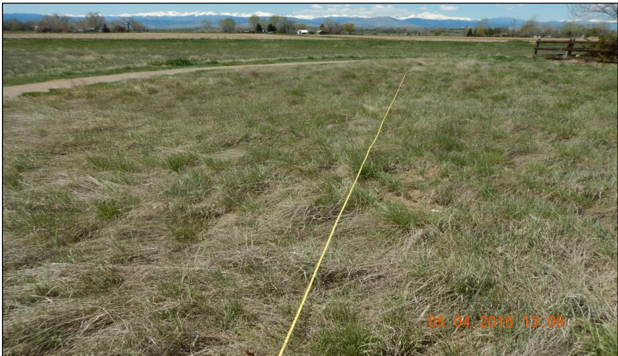
Photo 10: Photo taken 5/4/16 from midpoint of Reference #2 transect, facing West.