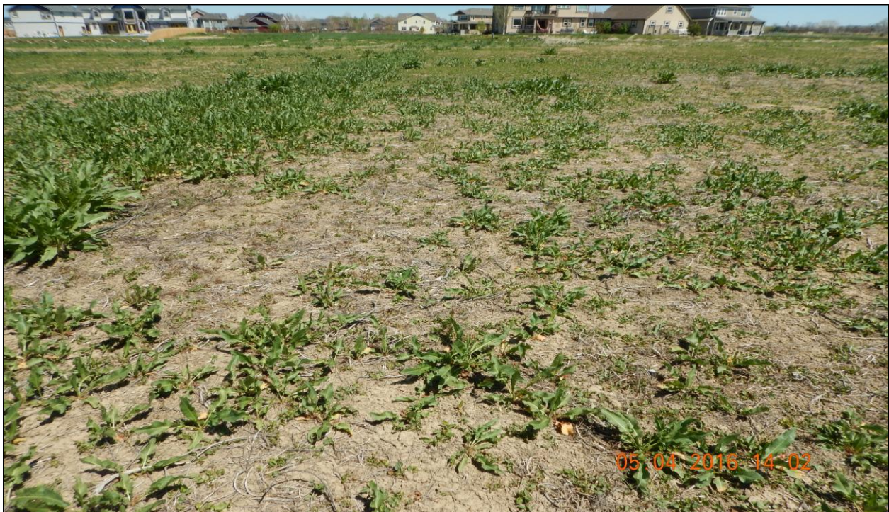
Photo 26: Photo taken 5/4/16 from midpoint of Disturbance #2 transect, facing East.