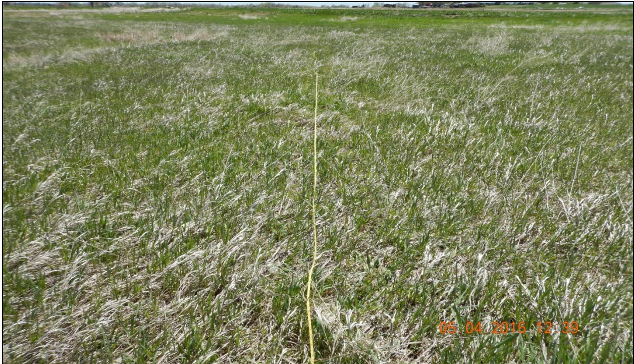
Photo 7: Photo taken 5/4/16 from end of Reference #1 transect, facing Southeast.