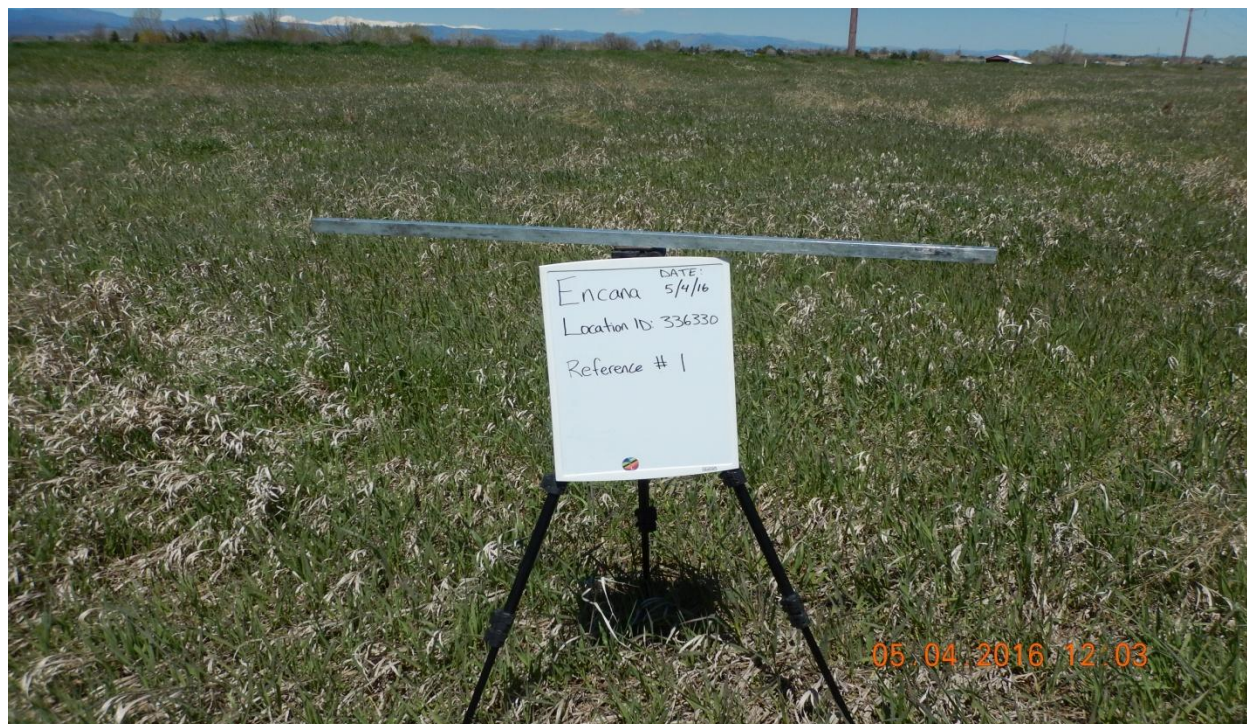
Photo 1: Photo taken 5/4/16 from start of Reference #1 transect, facing Northwest. Location dominated by smooth brome ( Bromus inermis ). Refer to cover datasheet for total vegetation composition.