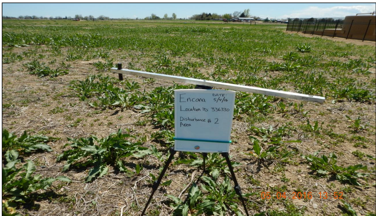
Photo 22: Photo taken 5/4/16 from start of Disturbance #2 transect, facing South. Location dominated by curly dock ( Rumex crispus ) and bindweed ( Convolvulus sp. ). Refer to cover datasheet for total vegetation composition.