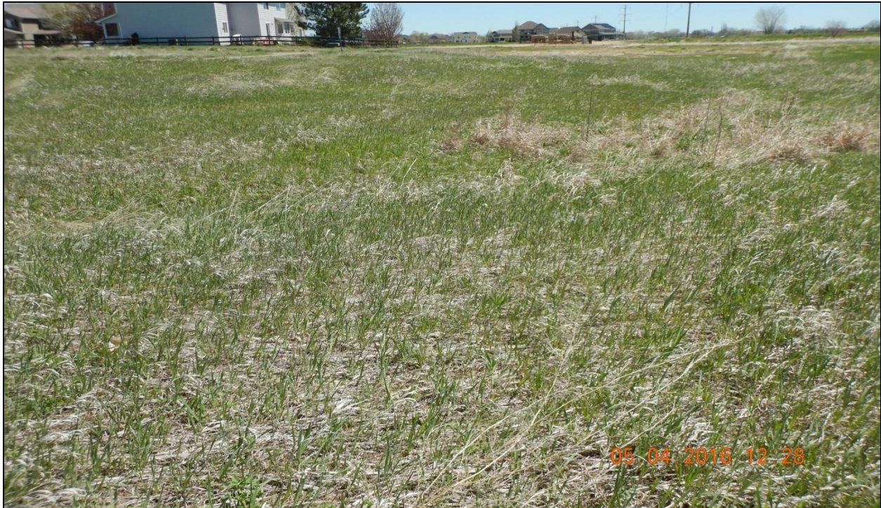
Photo 5: Photo taken 5/4/16 from midpoint of Reference #1 transect, facing East.