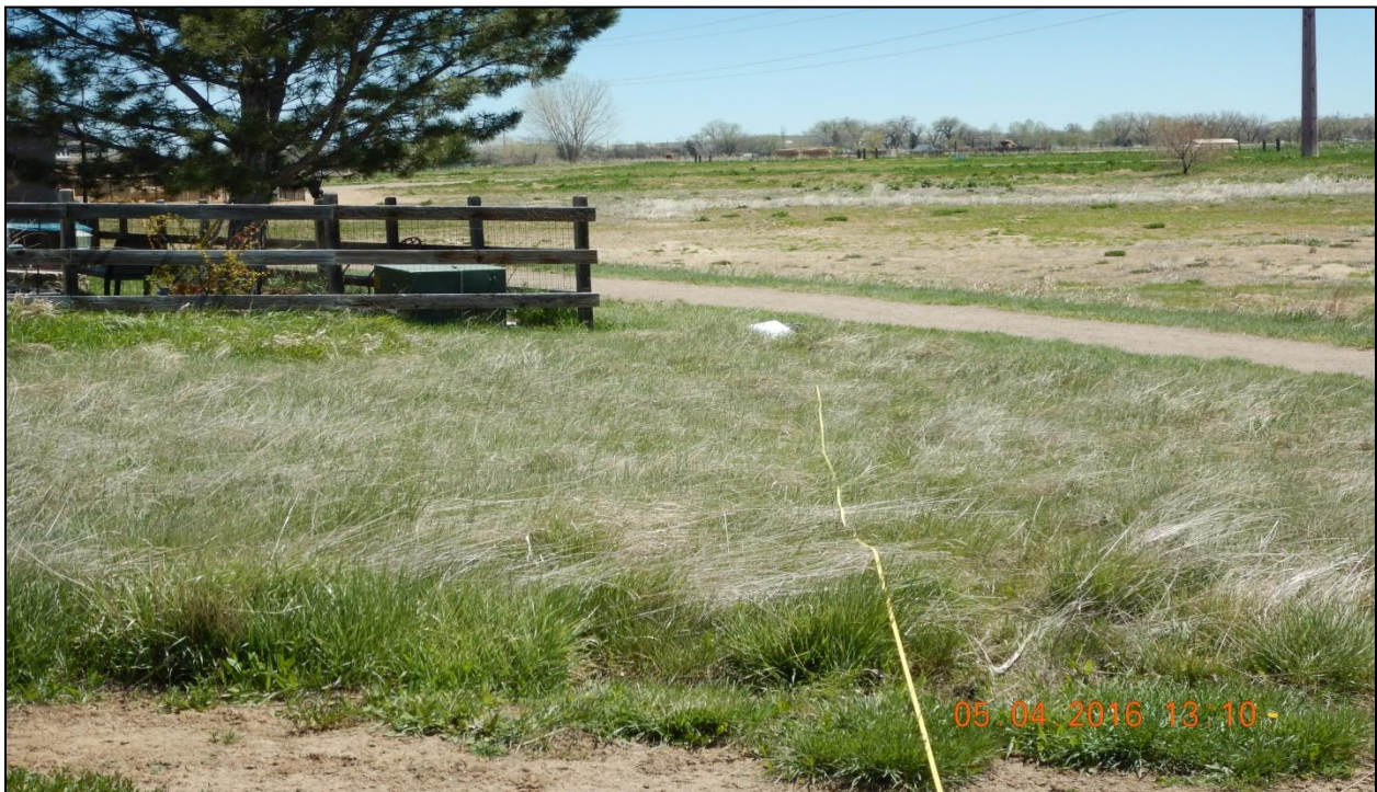
Photo 12: Photo taken 5/4/16 from midpoint of Reference #2 transect, facing East.