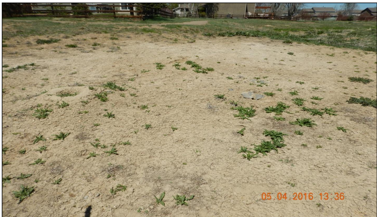
Photo 18: Photo taken 5/4/16 from midpoint of Disturbance #1 transect, facing North.