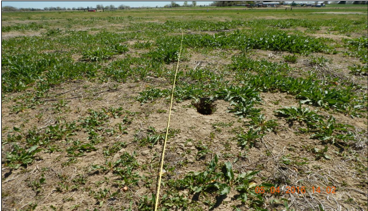
Photo 27: Photo taken 5/4/16 from midpoint of Disturbance #2 transect, facing South.