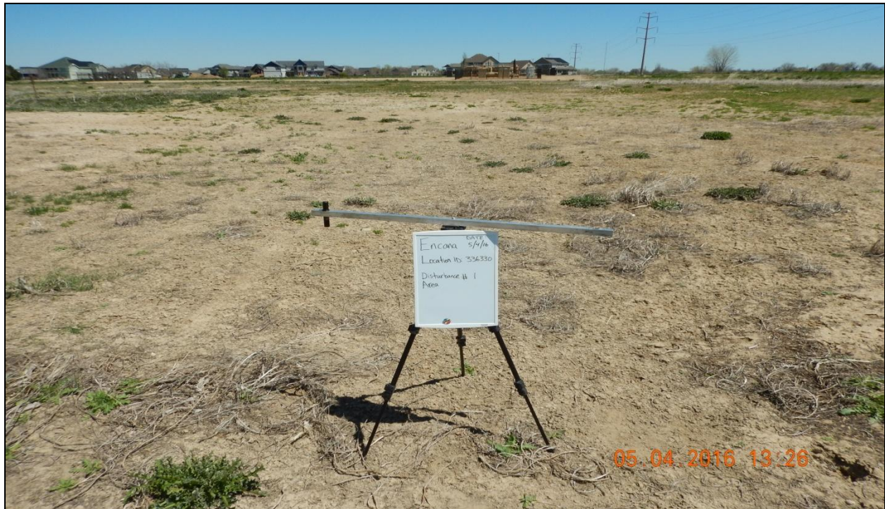
Photo 15: Photo taken 5/4/16 from start of Disturbance #1 transect, facing East. Location lacks vegetative growth. Refer to cover datasheet for total vegetation composition.