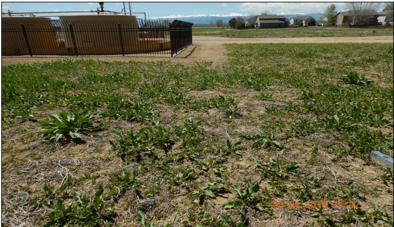
Photo 24: Photo taken 5/4/16 from midpoint of Disturbance #2 transect, facing West.