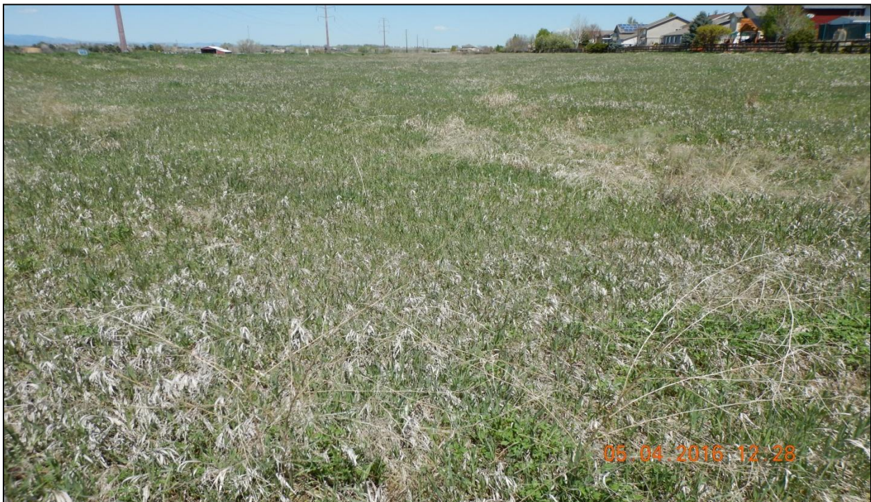
Photo 4: Photo taken 5/4/16 from midpoint of Reference #1 transect, facing North.