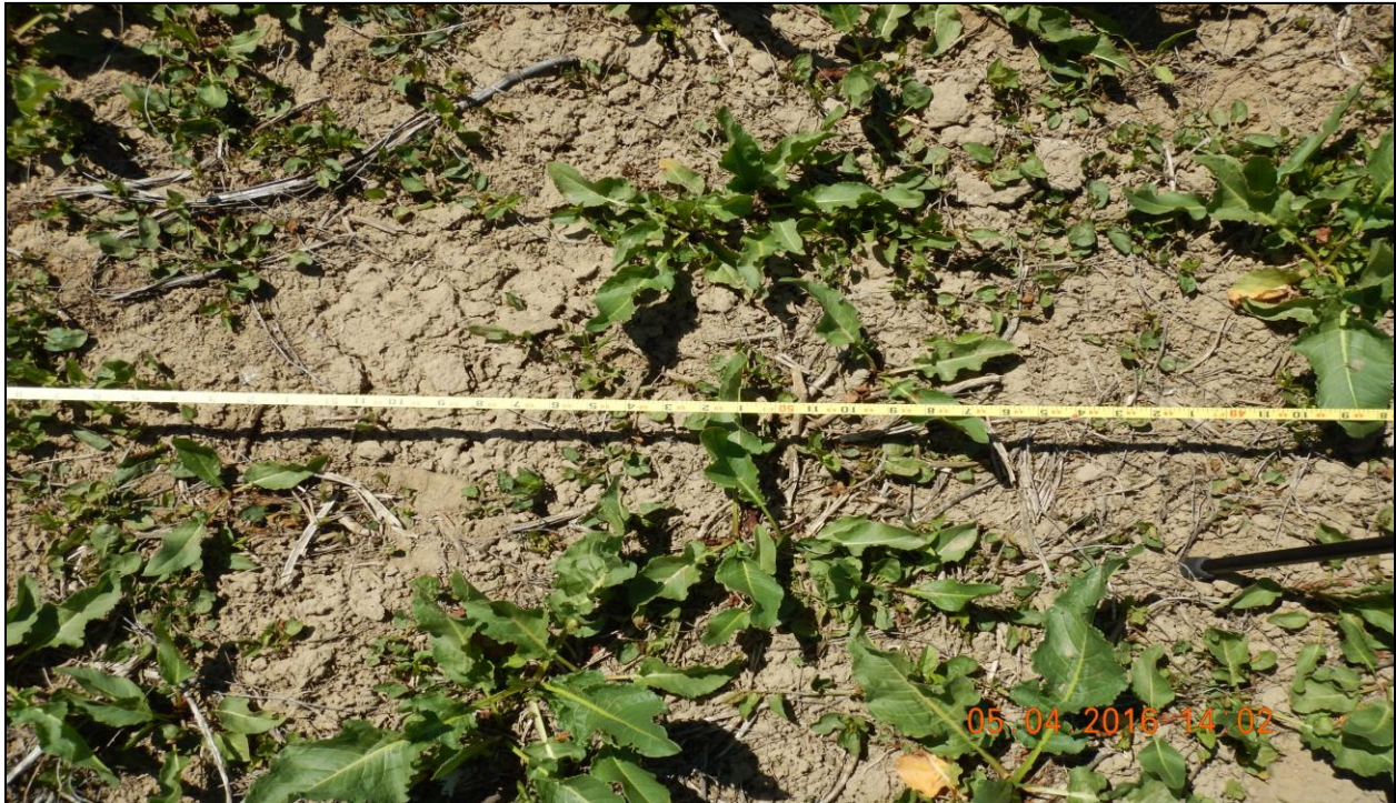
Photo 23: Photo taken 5/4/16 from midpoint of Disturbance #2 transect.