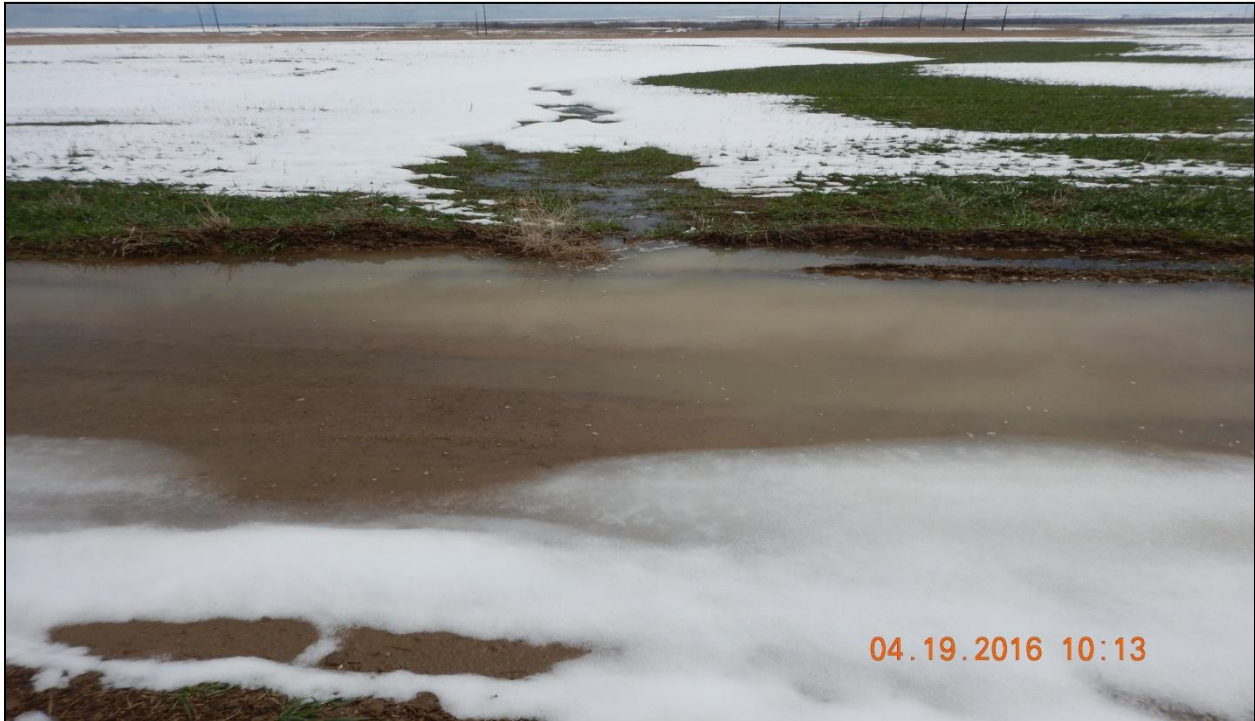
Photo 4: Photo taken 4/19/16 from location where run-off leaves lease road, facing East and onto the adjacent cropland.