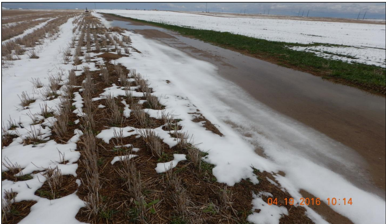
Photo 5: Photo taken 4/19/16 from previous location, facing North along the lease road. This photo illustrates stormwater traveling along the path of the lease road to this low point along the lease road.