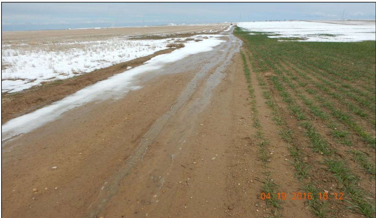
Photo 3: Photo taken 4/19/16 south of well, facing North. This photo illustrates stormwater traveling along the path of the lease road.