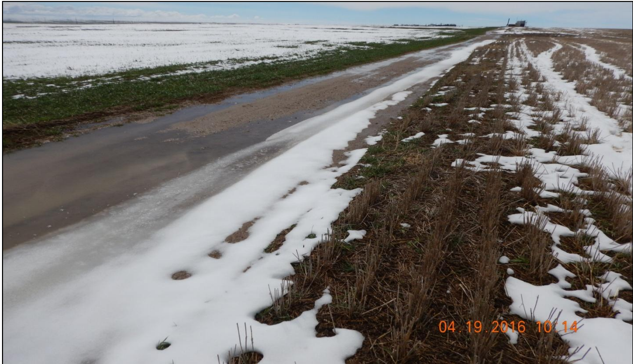
Photo 6: Photo taken 4/19/16 from previous location, facing South along the lease road. This photo illustrates stormwater traveling along the path of the lease road to this low point along the lease road.