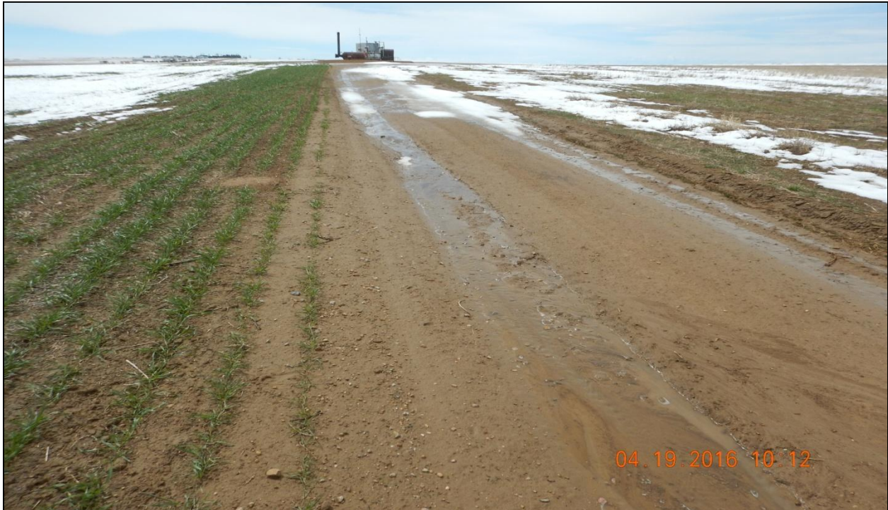
Photo 2: Photo taken 4/19/16 south of well, facing South. This photo illustrates stormwater traveling along the path of the lease road.