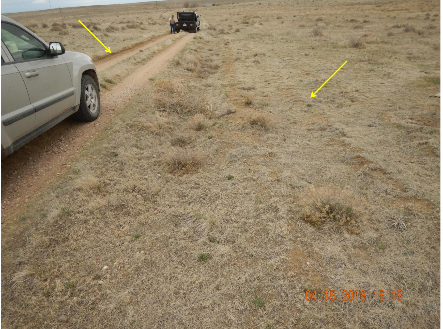
Figure 7: Photo taken from access road, facing west. Photo shows access road (left), and pre-existing two-track (right).