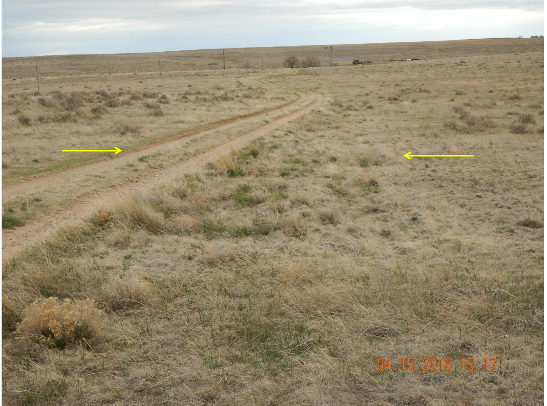
Figure 6: Photo taken from access road, facing west. Photo shows current access road (left), and pre-existing two-track (right)