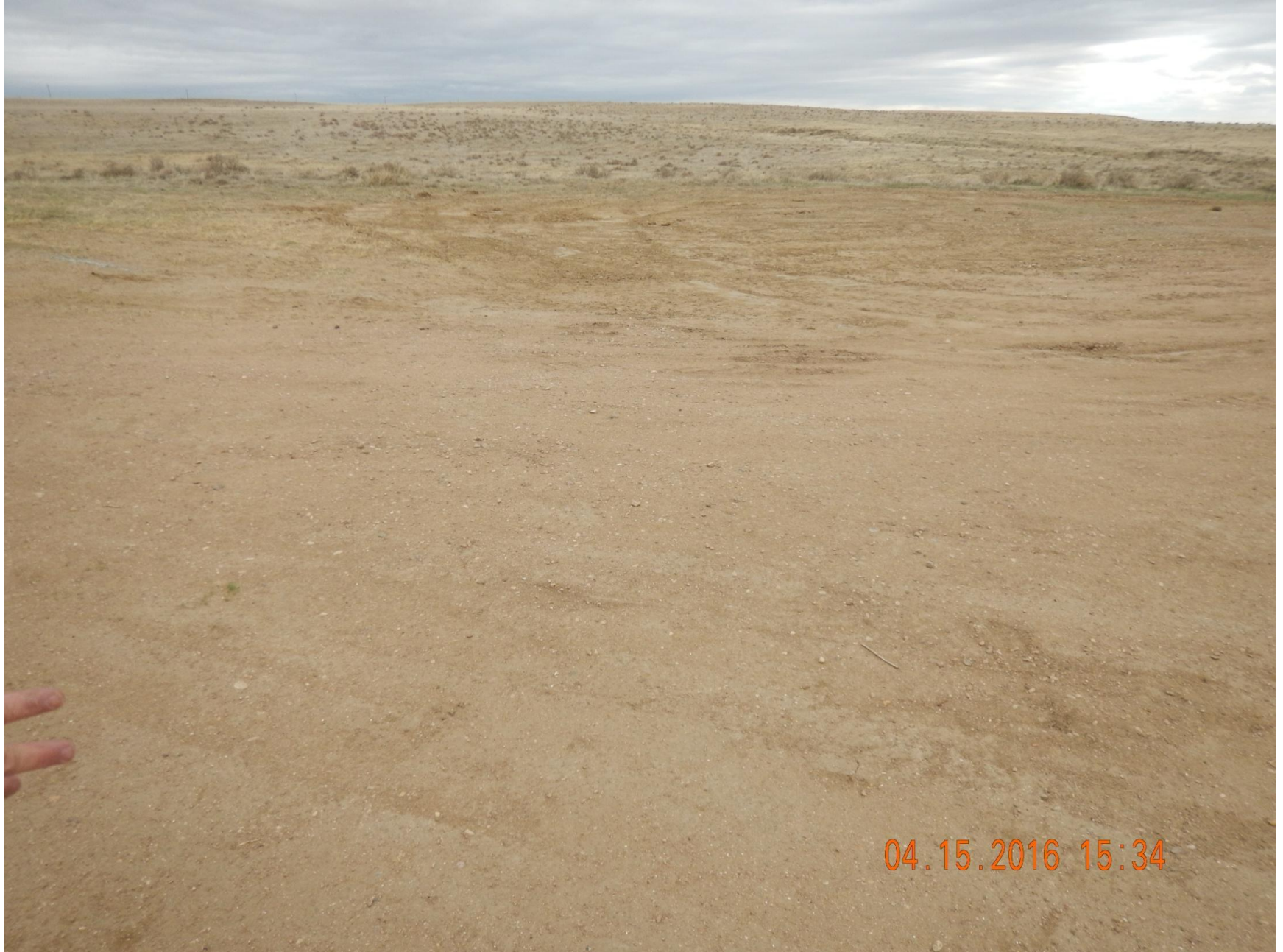
Figure 9: Photo taken from the north end of the location, facing southeast. Photo shows equipment and facilities have been removed.