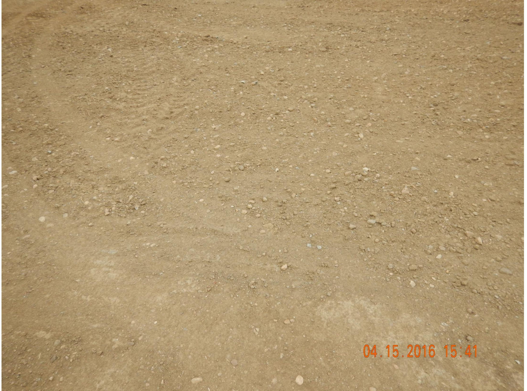
Figure 14: Photo taken from location. Location requires decompaction.