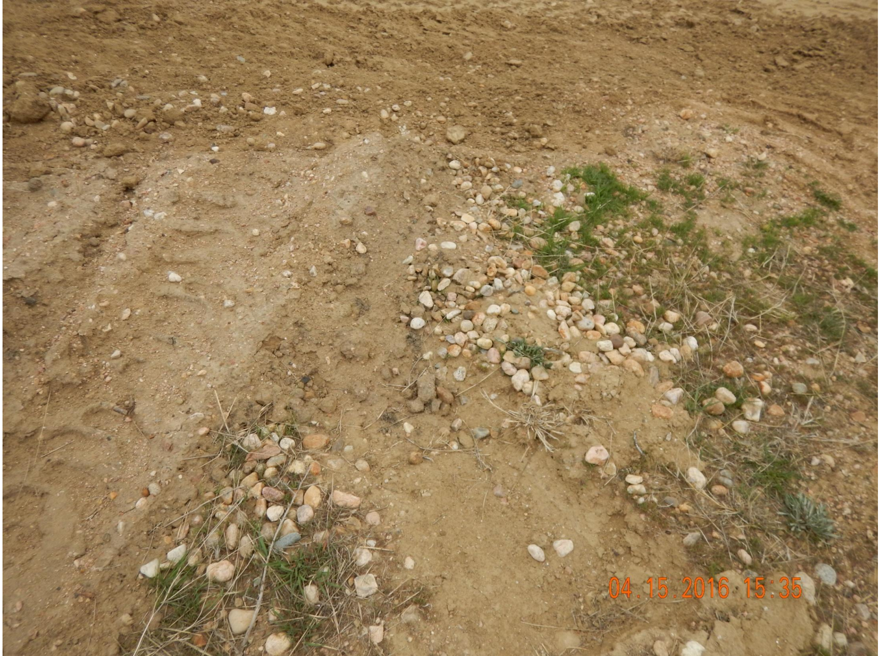
Figure 13: Photo taken from the west end of the location. Photo shows gravel remaining on location.