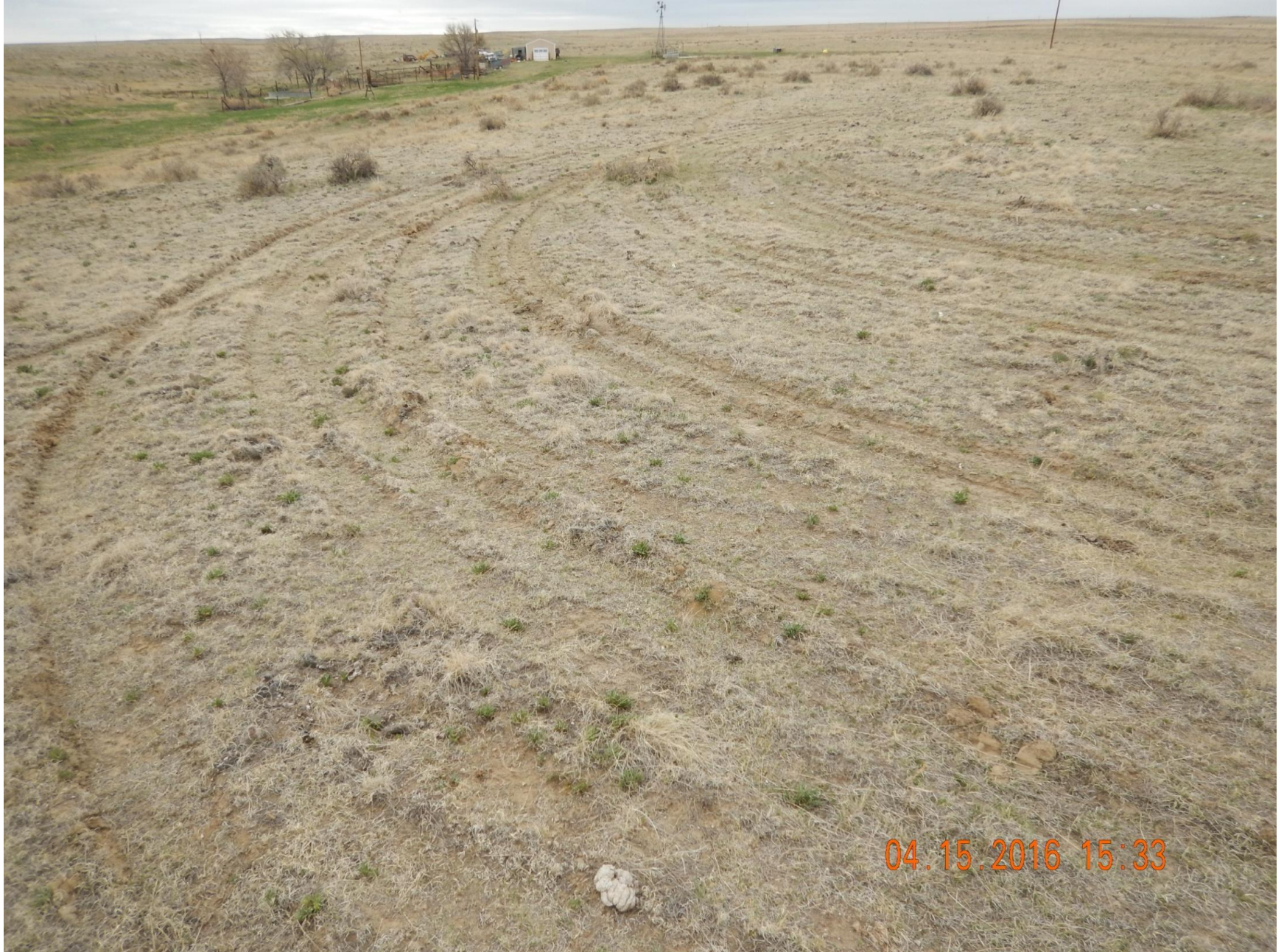
Figure 17: Photo taken from the north end of the location, facing north. Photo shows additional disturbance created during the removal of equipment/facilities outside of the location. Rule 1002.e(4) requires all vehicles used by the operator, contractors, and other parties associate with the well shall not travel outside of the original access road boundary.