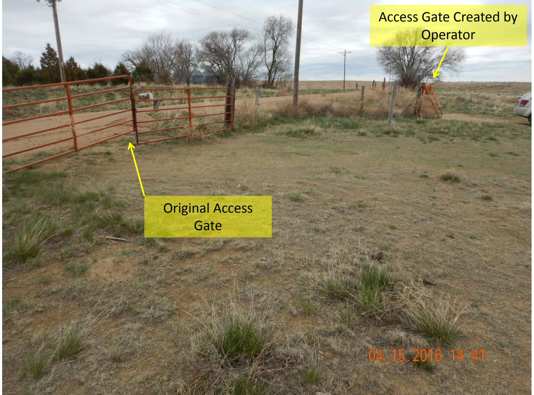
Figure 2: Photo taken at access road entrance and Morgan CR-2. Photo shows original access gate to the property on left side of image, and operator entrance on top right of image.