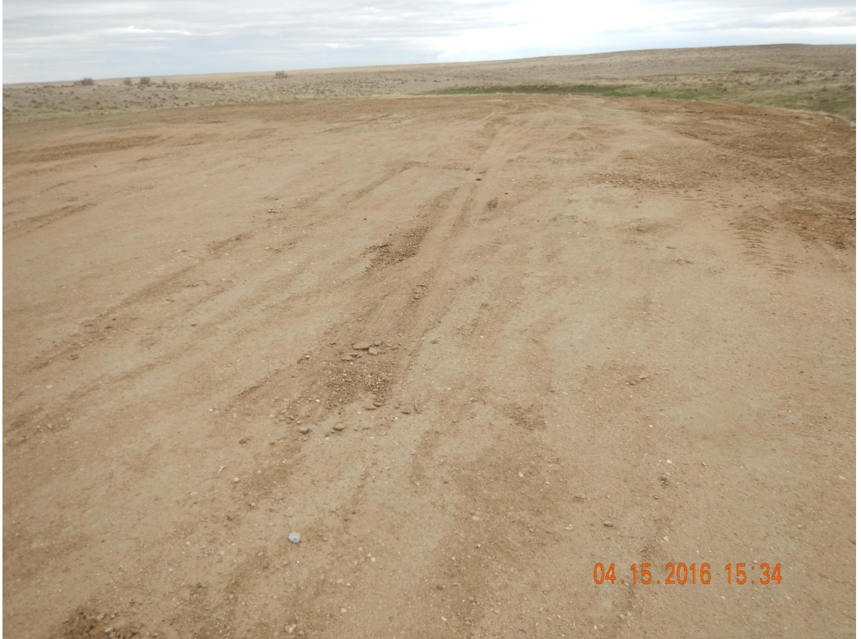
Figure 11: Photo taken from the north end of the location, facing southwest. Photo shows equipment and facilities have been removed.