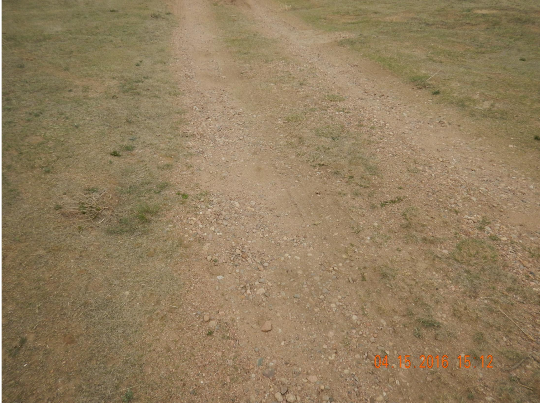
Figure 8: Photo taken from access road. Photo shows gravel on road.