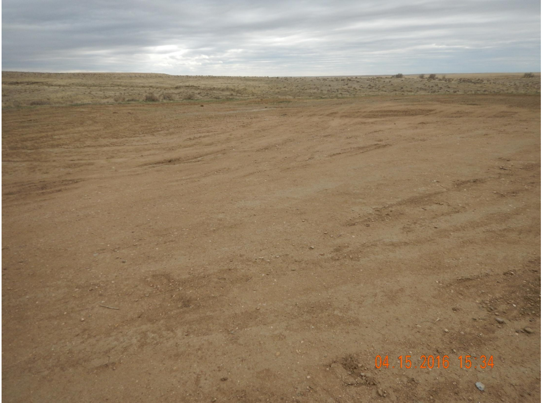
Figure 10: Photo taken from the north end of the location, facing south. Photo shows equipment and facilities have been removed.