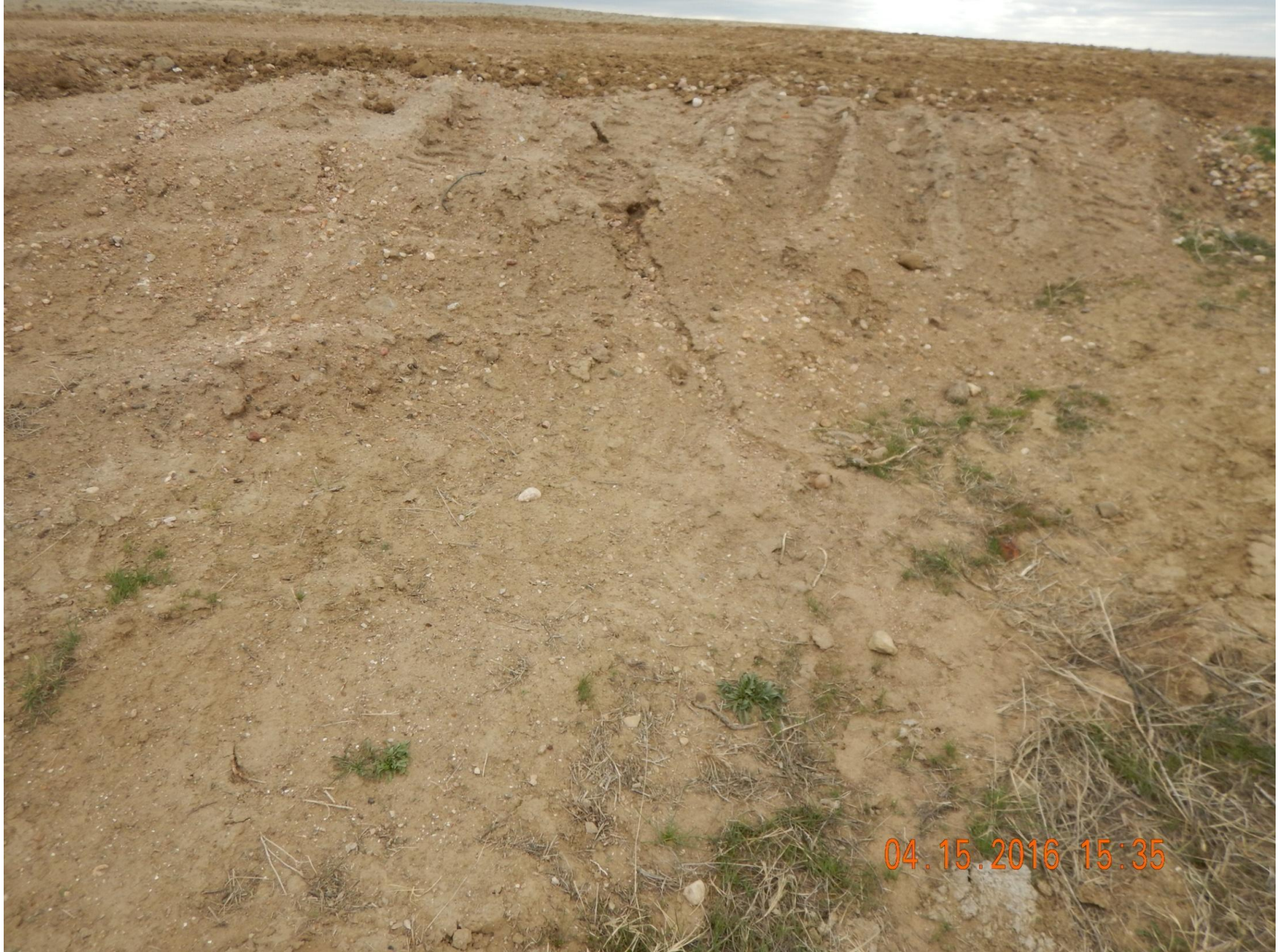
Figure 16: Photo taken from the west end of the location, facing east. Multiple rills forming on slope.