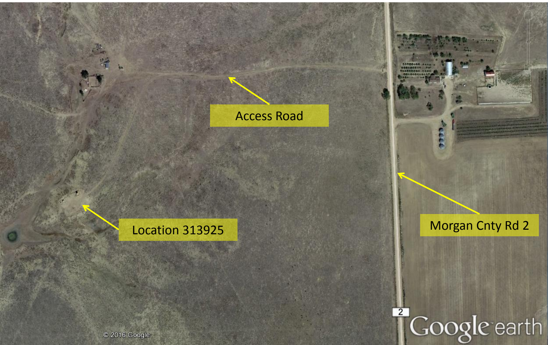
Figure 1: Current aerial imagery (2013) showing overview of location.