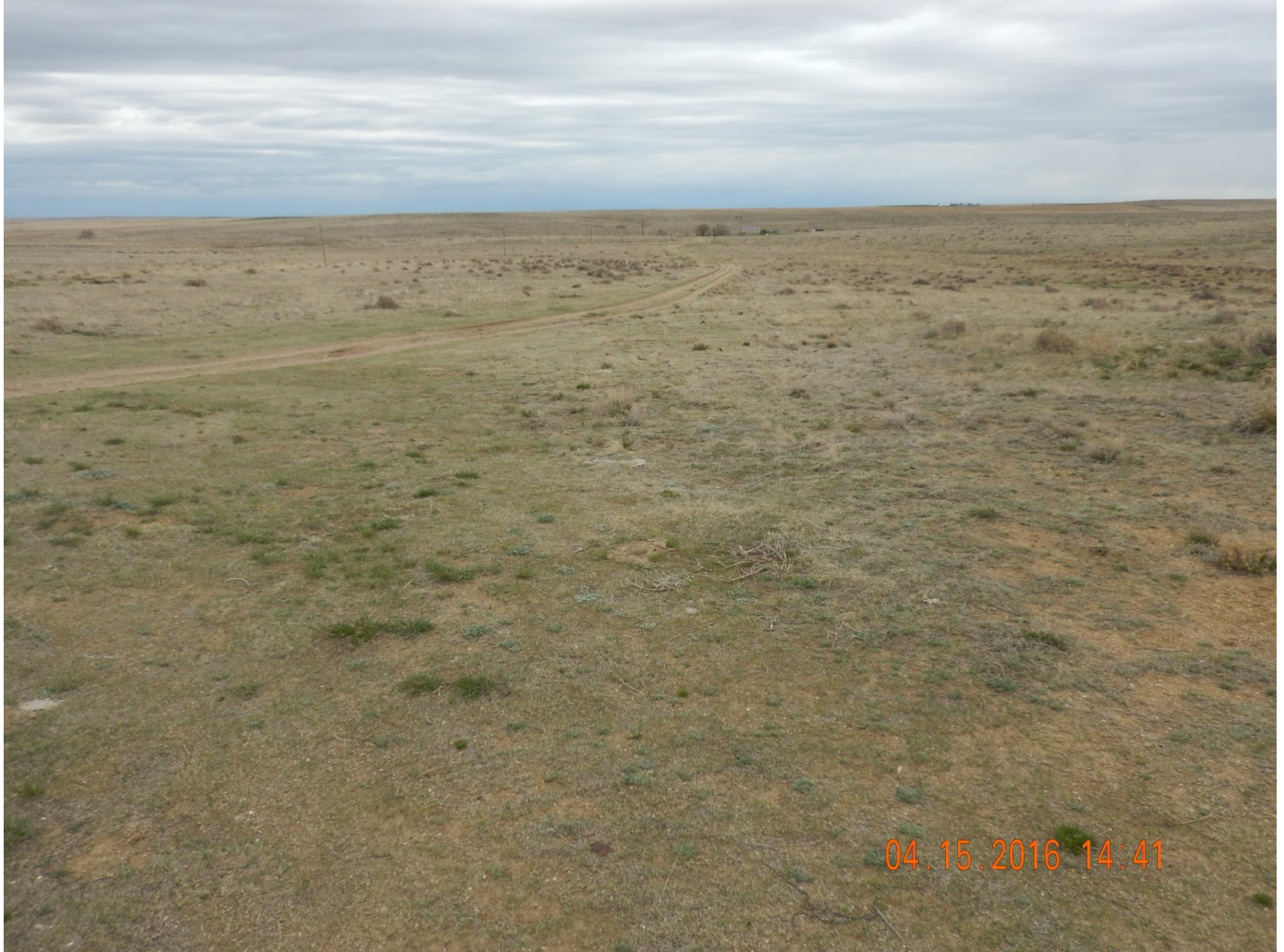
Figure 3: Photo taken at access road entrance, facing west. Photo shows access road leading to location.