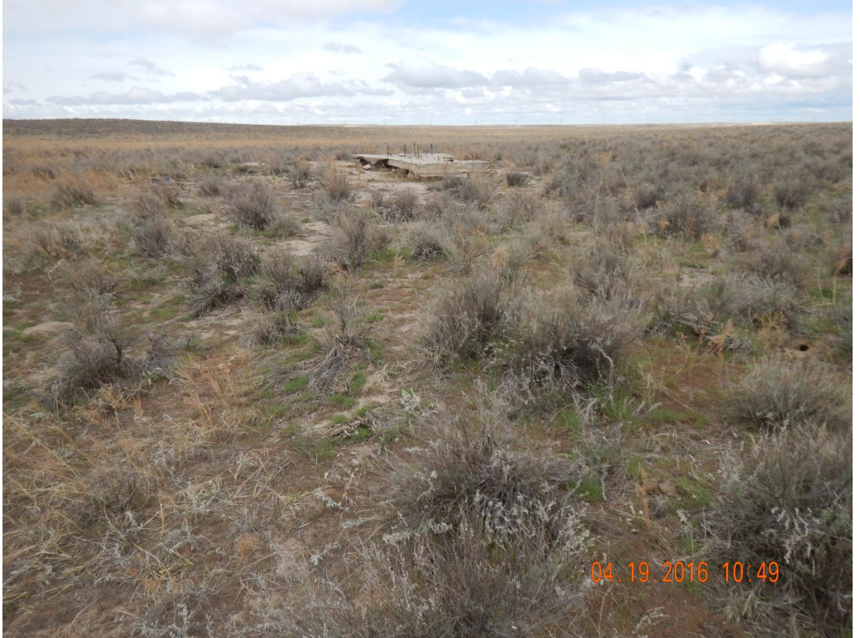
Figure 1: Photo taken from the east end of the location, facing west. Photo shows cement pump-pad identified in Doc. # 673502676