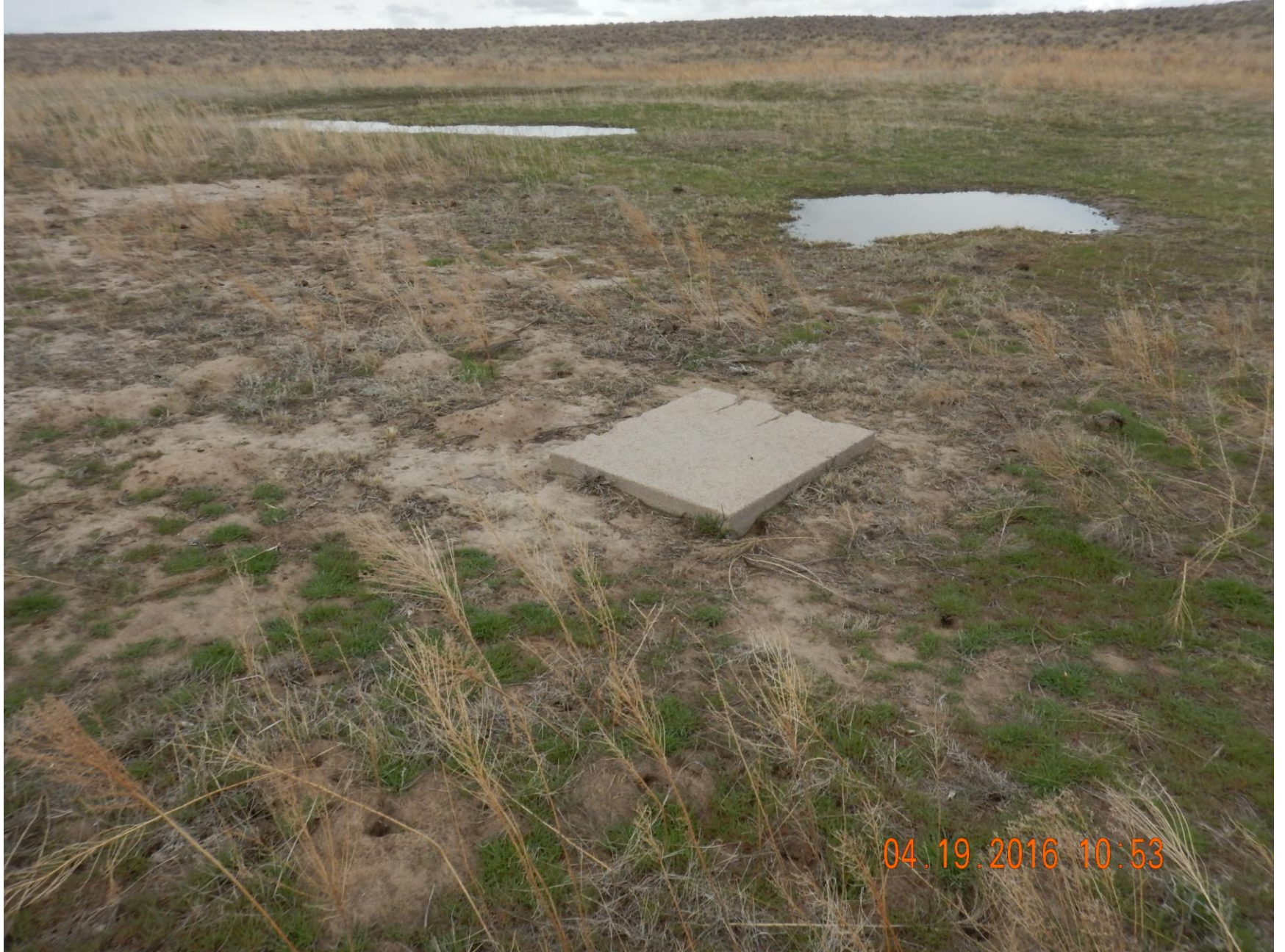
Figure 1: Photo taken west of the cement pump-pad, facing west. Photo shows additional cement pad (approx 3'x3'x6") remaining.