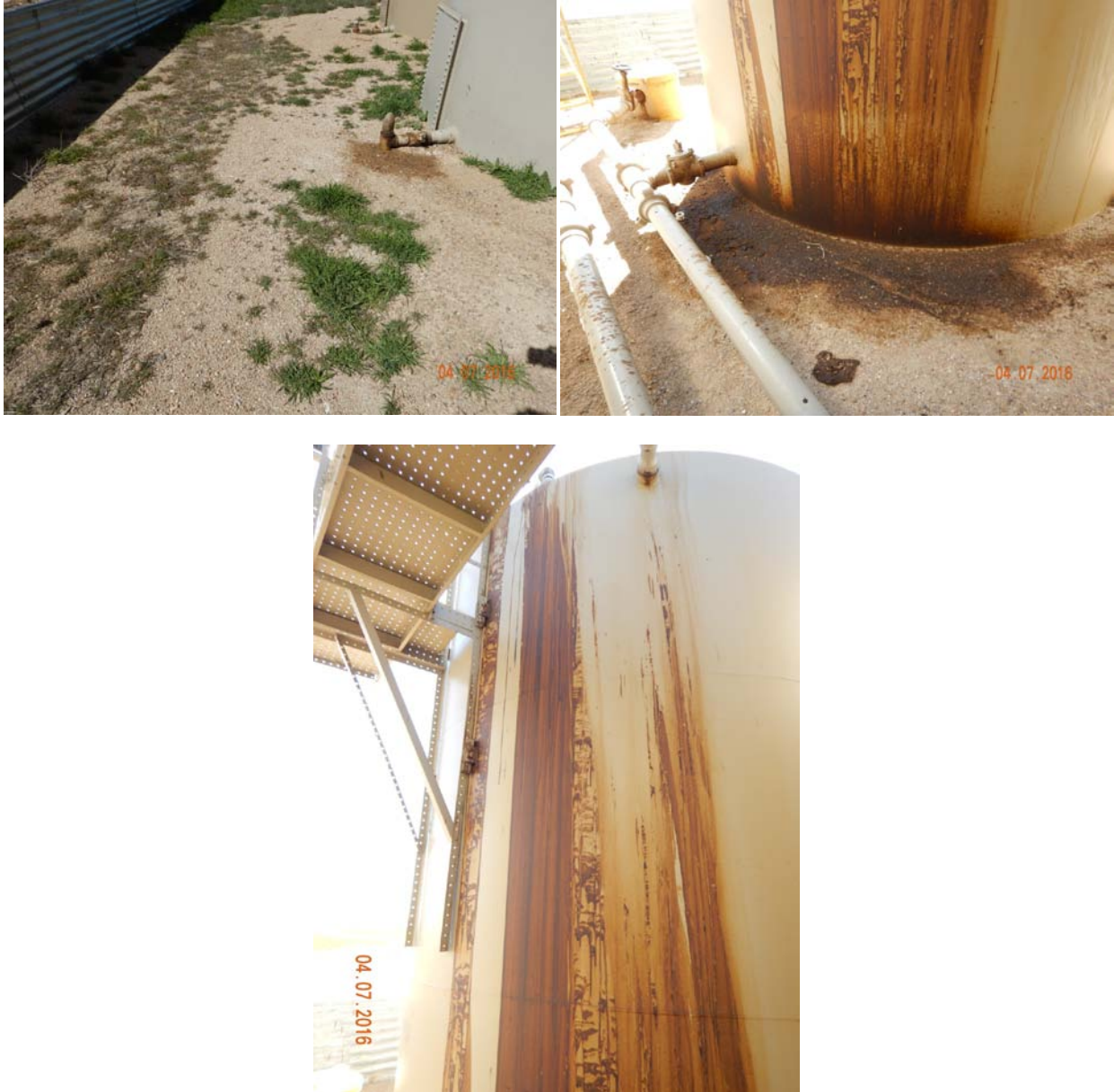
Figure 2 - Localized, oil-stained soil at tank battery and oil staining on north side of SE tank.