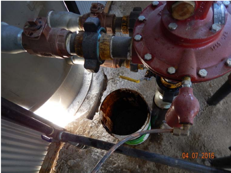
Figure 4 - Various chemical storage containers with localized stained soil inside of heater treater berm and open bucket used to capture oil/grease.