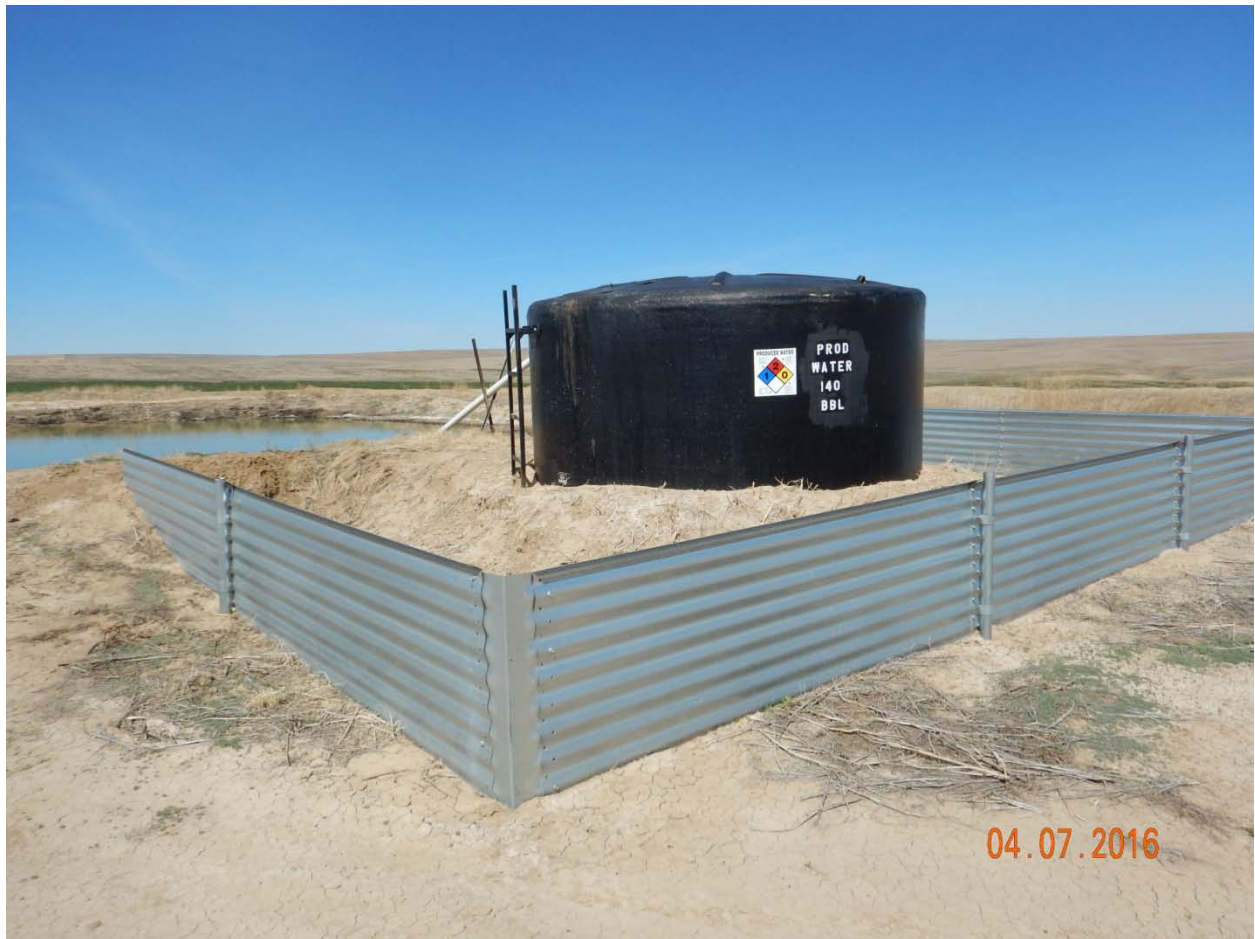
Figure 10 - Produced water vessel.