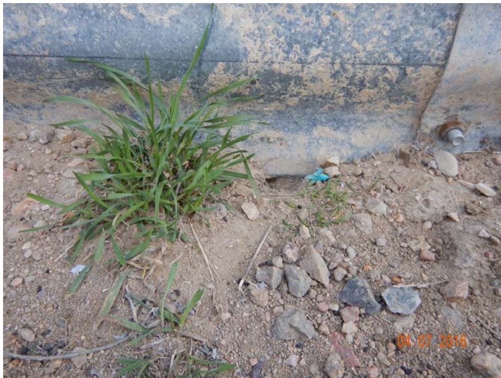
Figure 3 – Erosion rill outside of north berm of tank battery (above) and view of gap beneath berm from the inside (below).