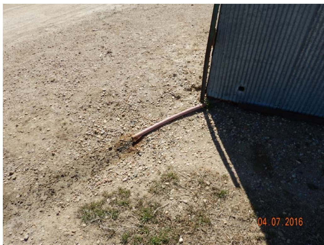
Figure 8 – Localized, oil-stained soil associated with exhaust lines on east side of pump jack shed.