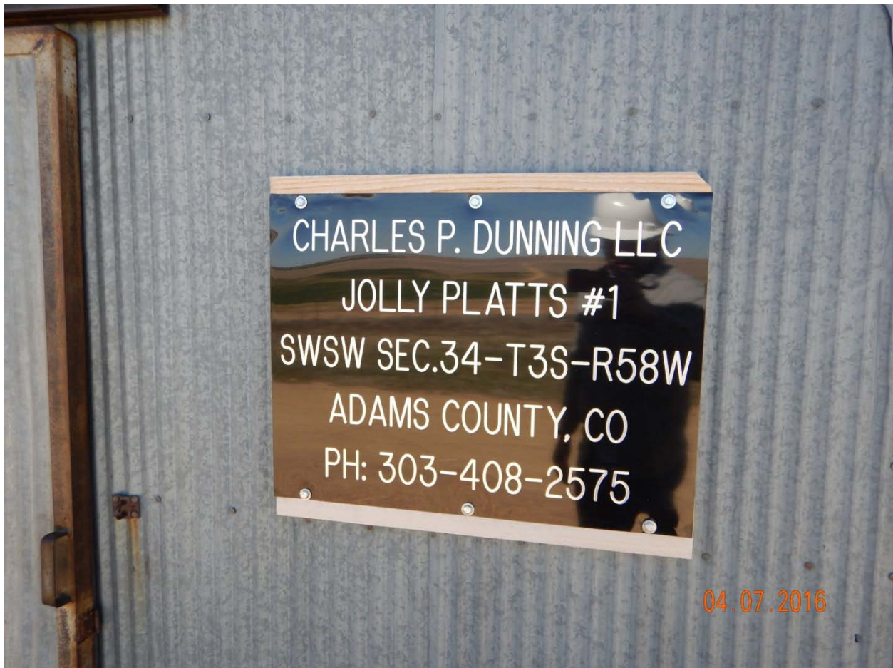
Figure 7 - Well sign.