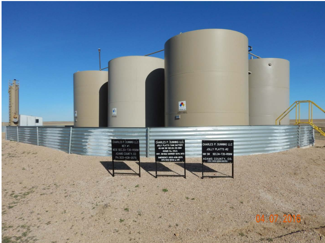
Figure 1 - Tank battery signs.