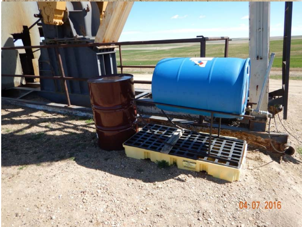
Figure 9 – Chemical storage containers at pumping unit lacking secondary containment.