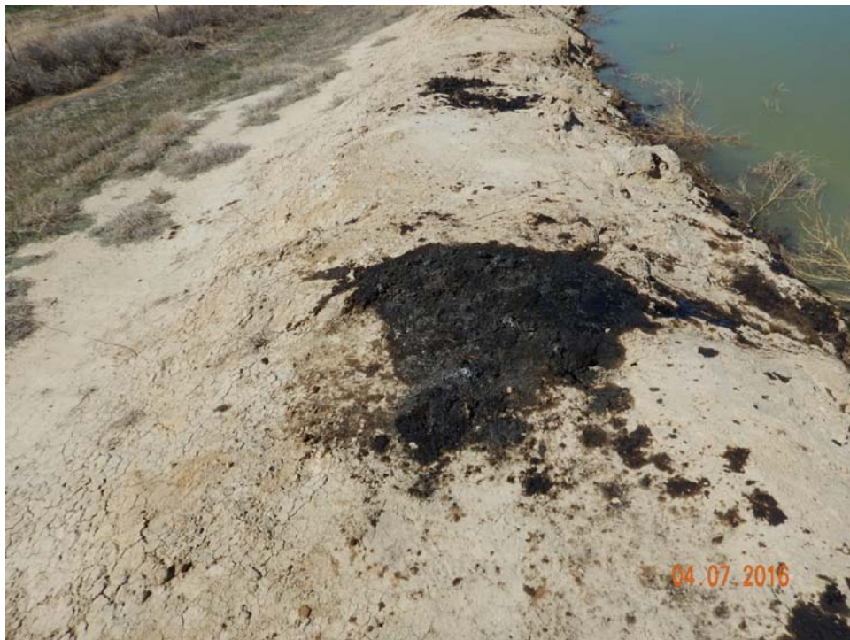
Figure 11 - Oil and stained soil around perimeter of SE produced water pit.