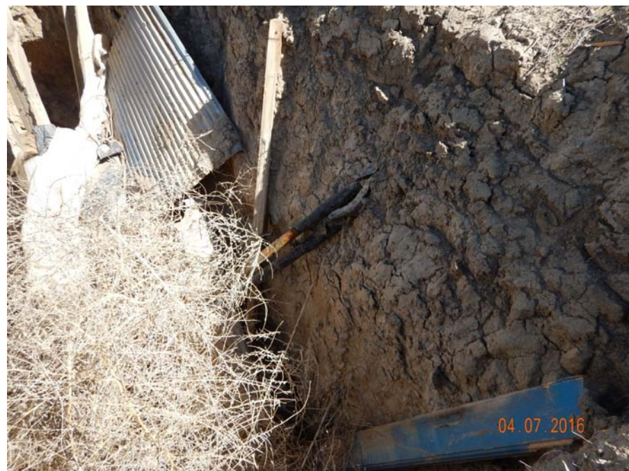
Figure 6 - Excavation observed SE of pit complex. Bottom photo is centered on possible flowlines leading into excavation.