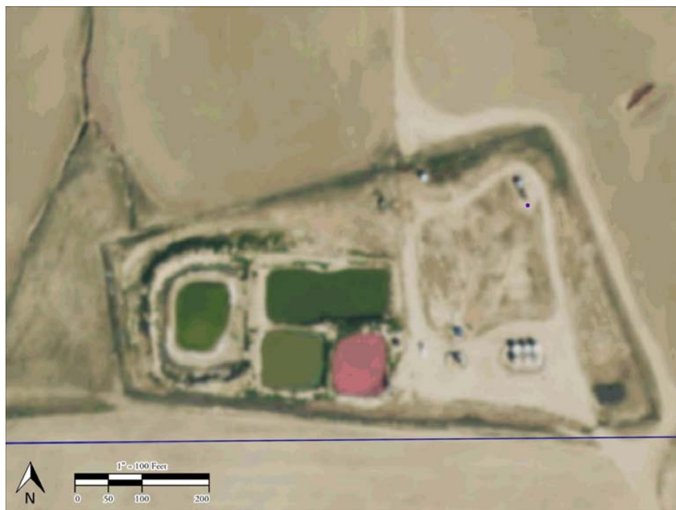
Figure 12 - Aerial photographs from 2013 (above) and 2015 (below) illustrate expansion of northern production pit and addition of three (3) crude oil tanks to tank battery.