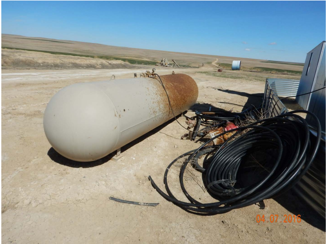
Figure 5 - Propane tank west of heater treater berm with oil stain.