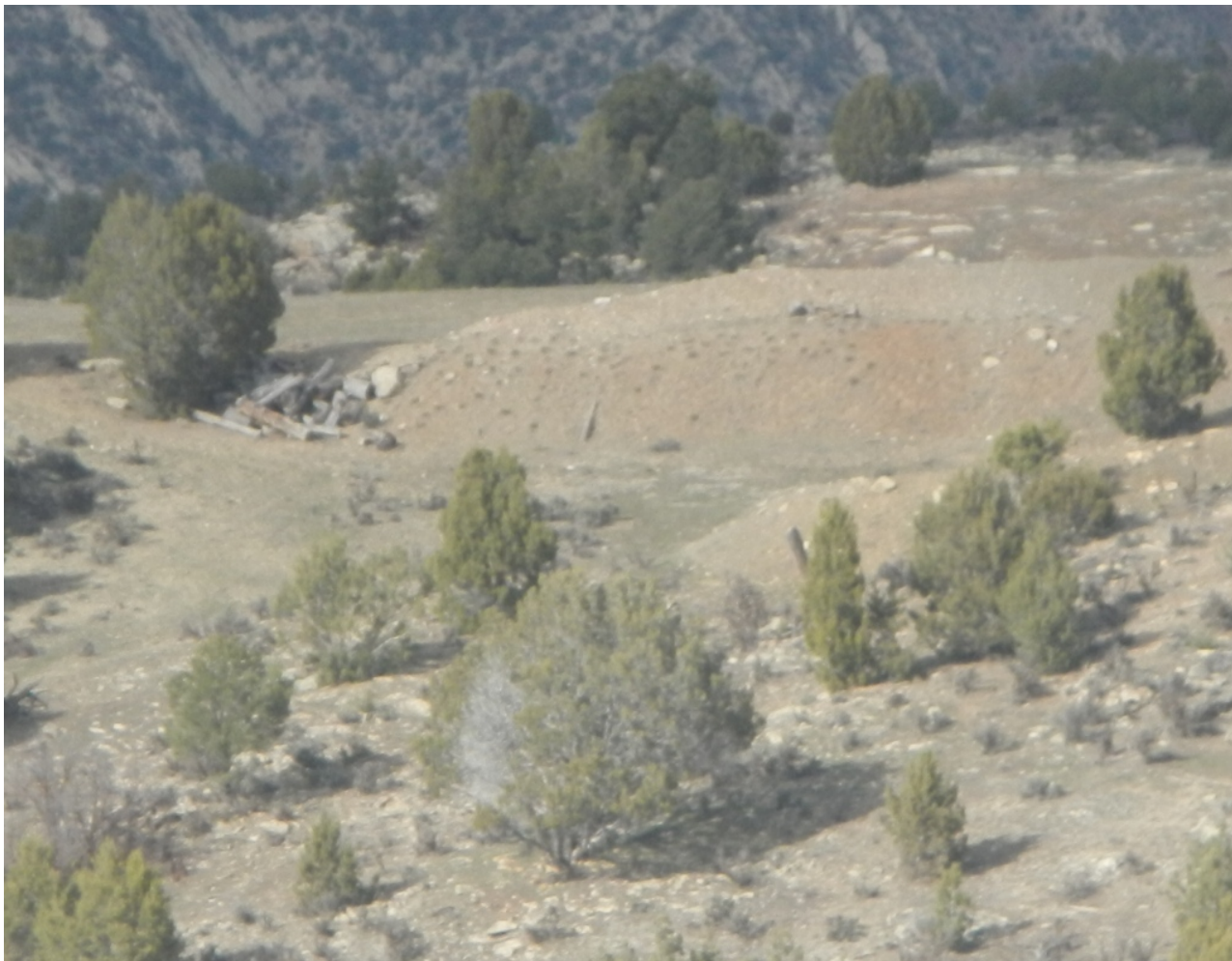
Photo#1: Looking North at Location from Ridge approx. ¼ Mile to South.