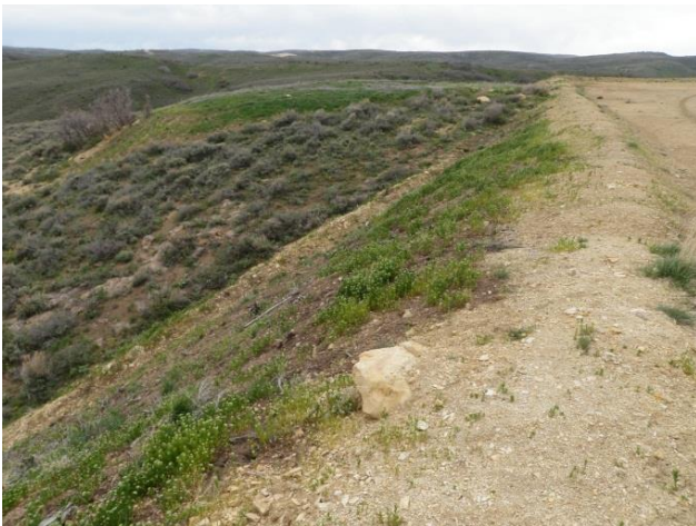
Southern edge of pad