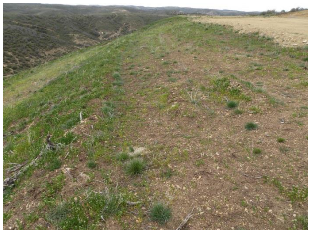
Western edge of pad