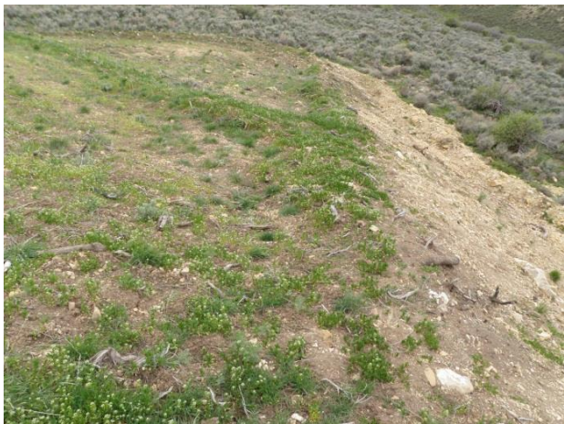
Southwest corner of pad