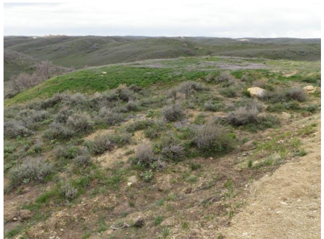
Top soil pile