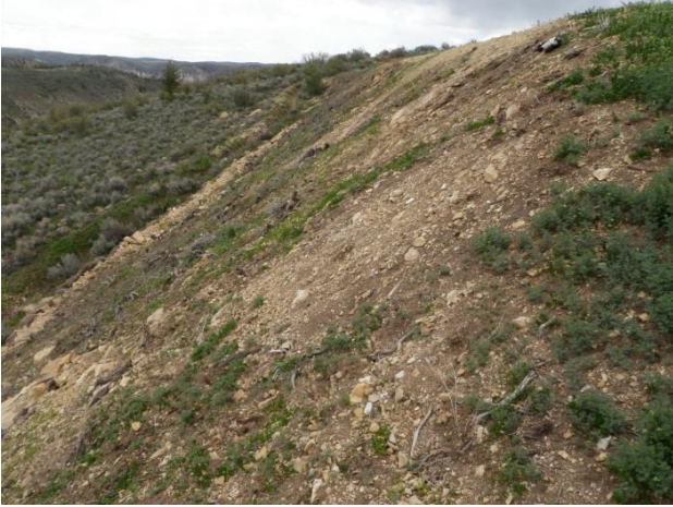
Western edge of pad