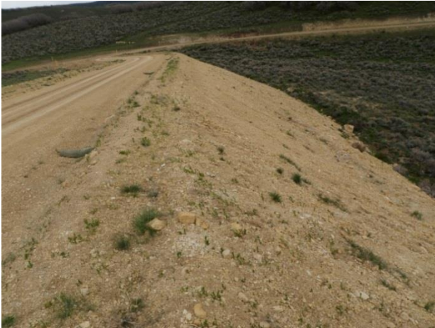
South-facing fill slope for access road