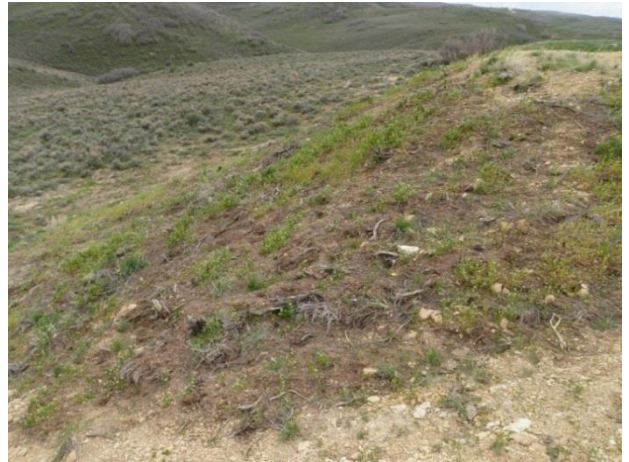
Southeast corner of pad