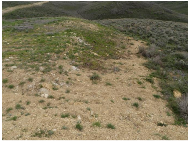
Top soil pile