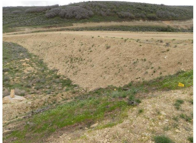
North-facing fill slope for access road