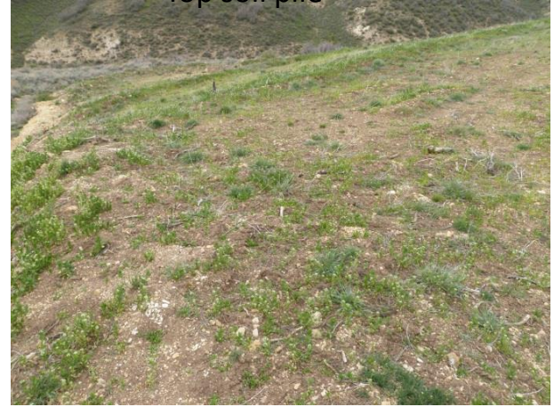
Southwest corner of pad