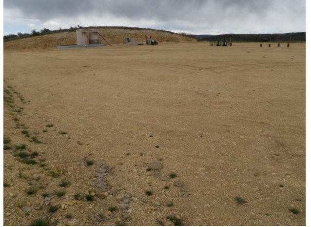
Looking northeast across pad