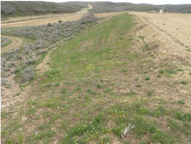
Eastern edge of pad