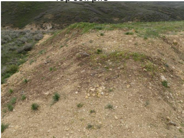
Southern edge of pad