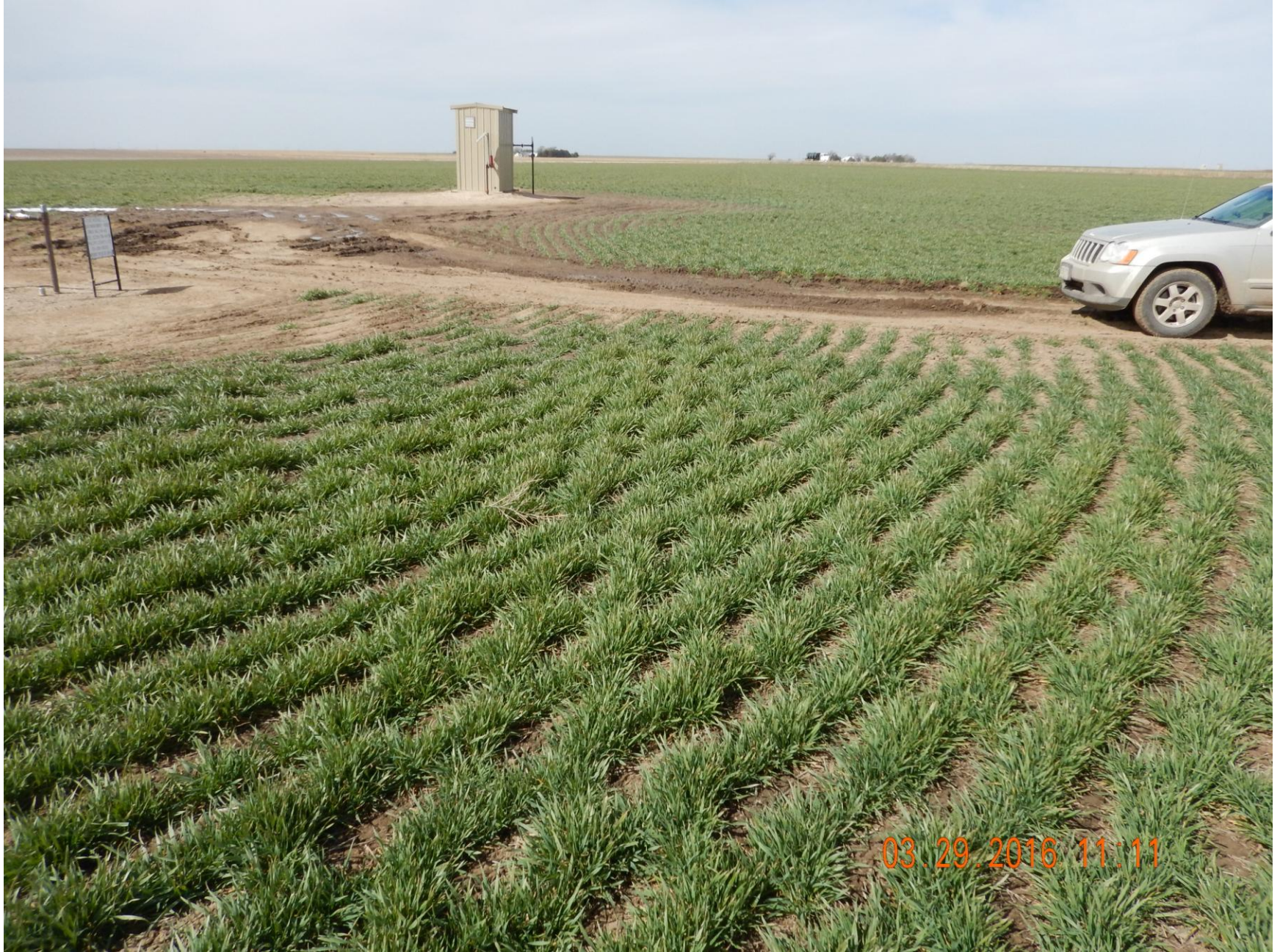
Figure 2: Photo Taken from the northeast end of the location, facing west. Photo shows interim and project areas.