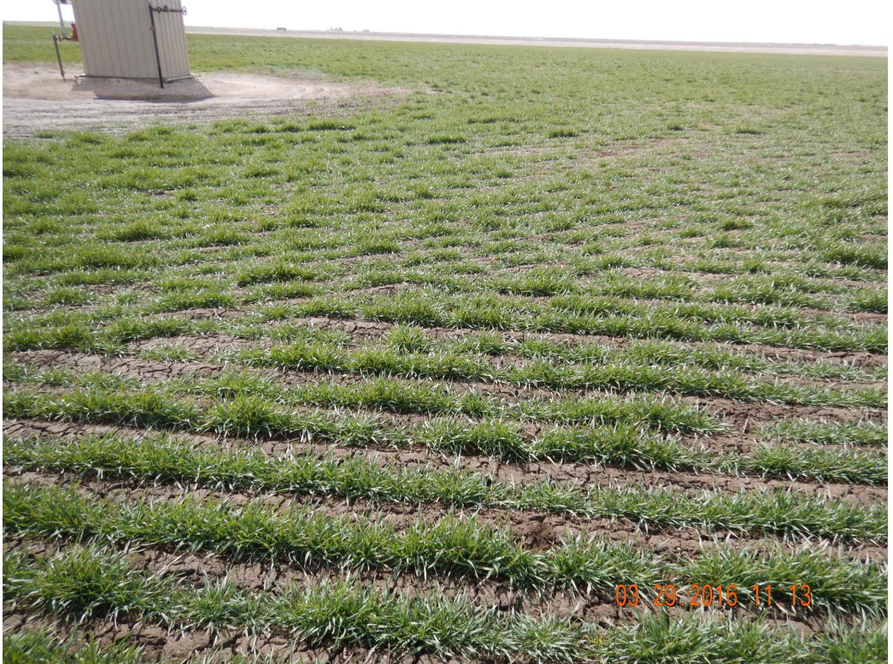
Figure 8: Photo taken from the northwest end of the location, facing south. Photo shows interim and project areas.