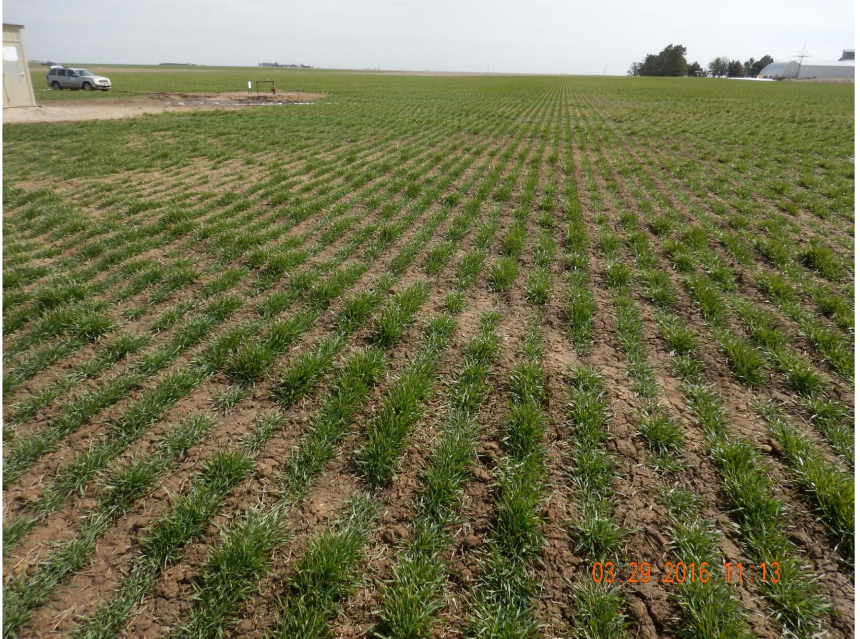
Figure 6: Photo Taken from the southwest end of the location, facing east. Photo shows interim and project areas.