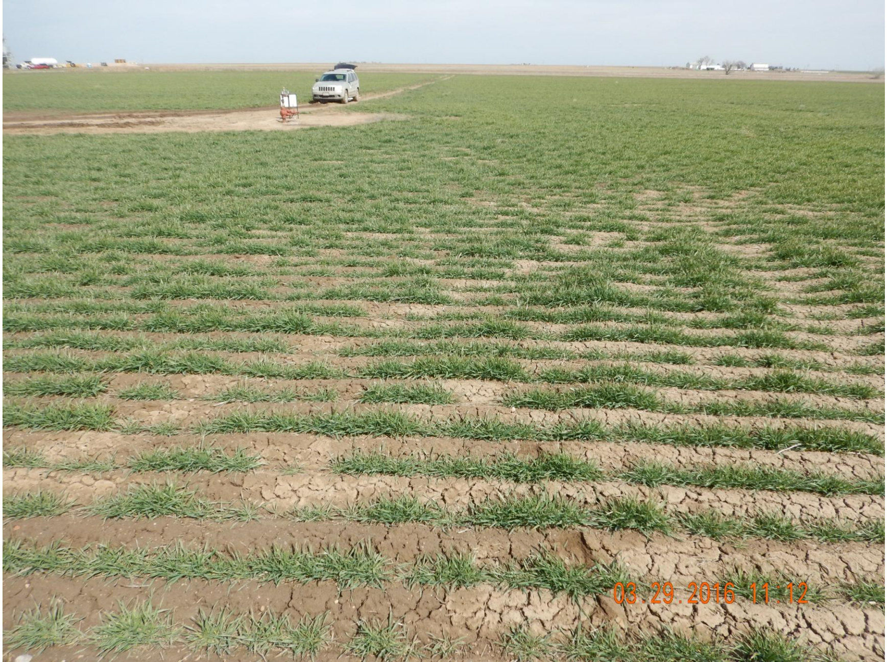
Figure 4: Photo Taken from the southeast end of the location, facing north. Photo shows interim and project areas.