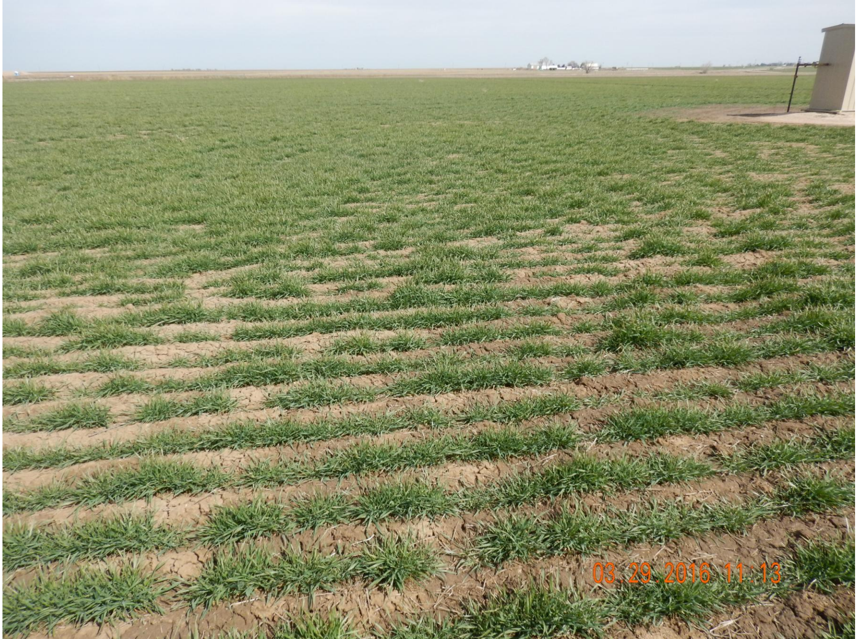
Figure 7: Photo Taken from the southwest end of the location, facing north. Photo shows interim and project areas.