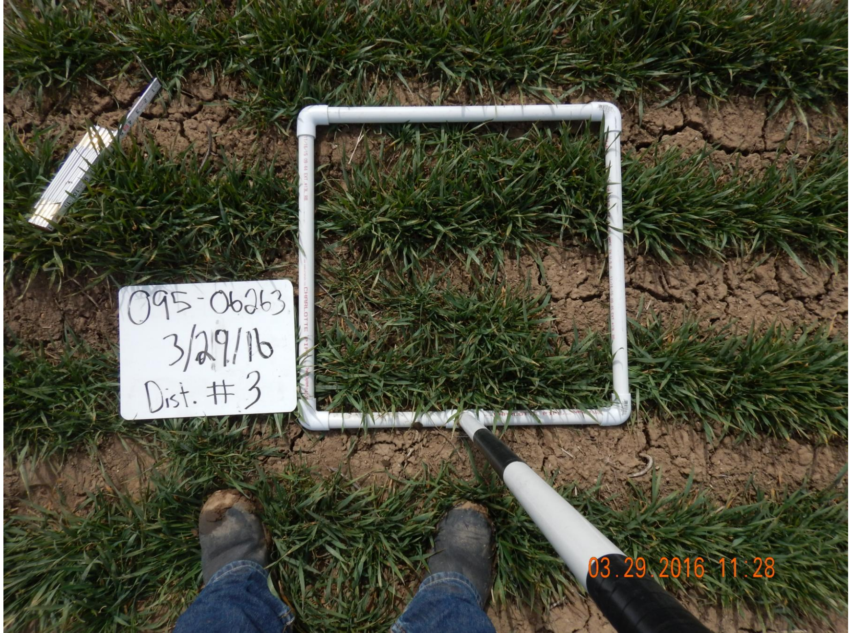
Figure 12: Photo of disturbance quadrat #3. Transect conducted on the southern end of the interim area.