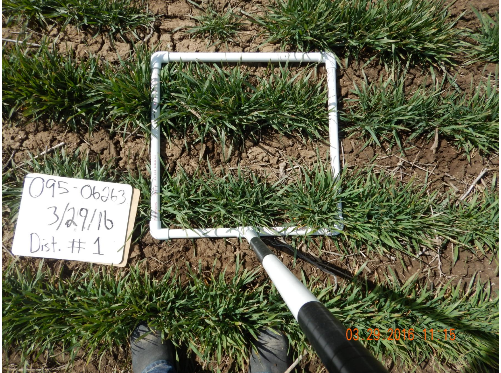
Figure 10: Photo of disturbance quadrat #1. Transect conducted on the northeast end of the interim area.