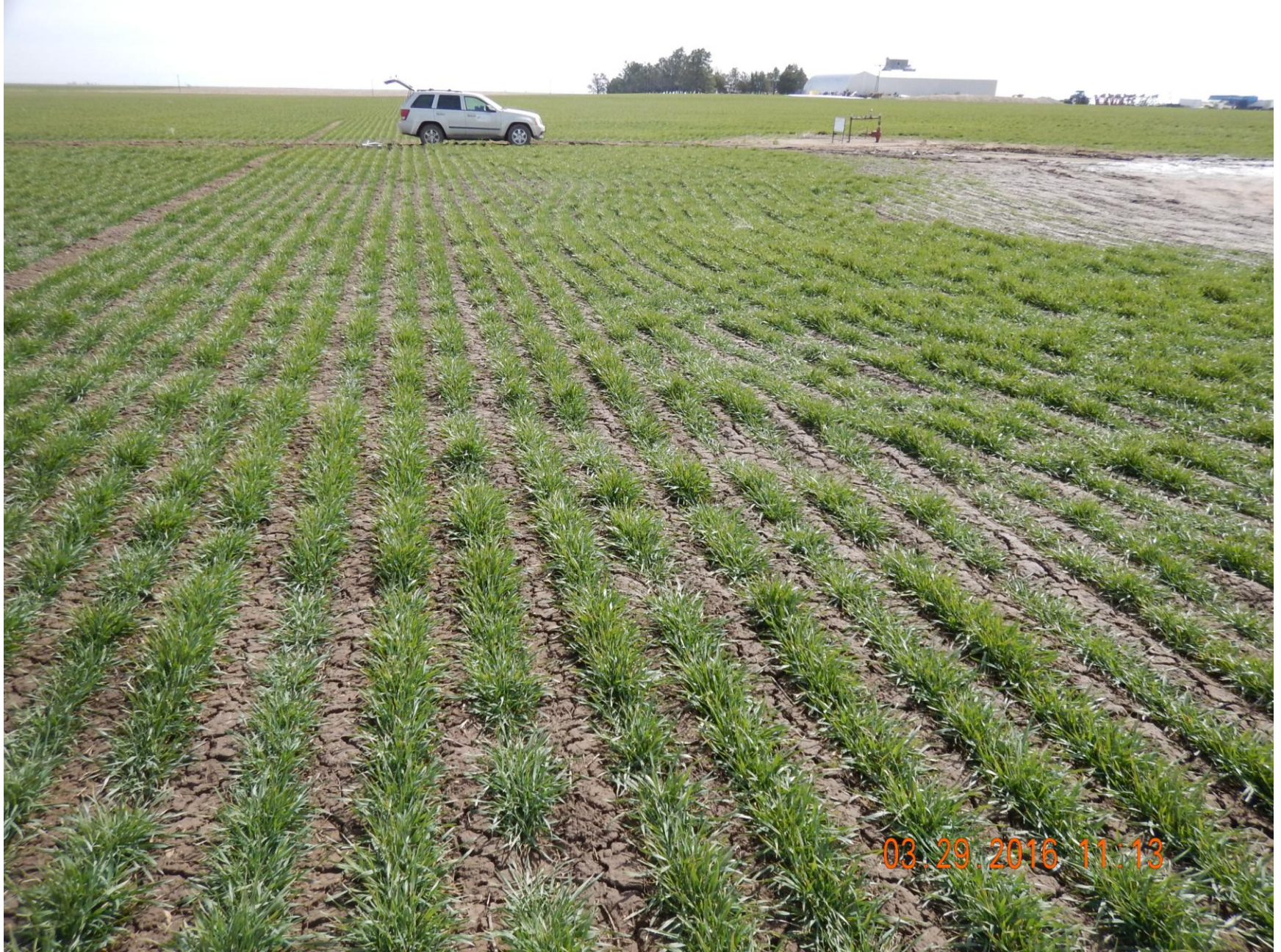
Figure 9: Photo taken from the northwest end of the location, facing east. Photo shows interim and project areas.