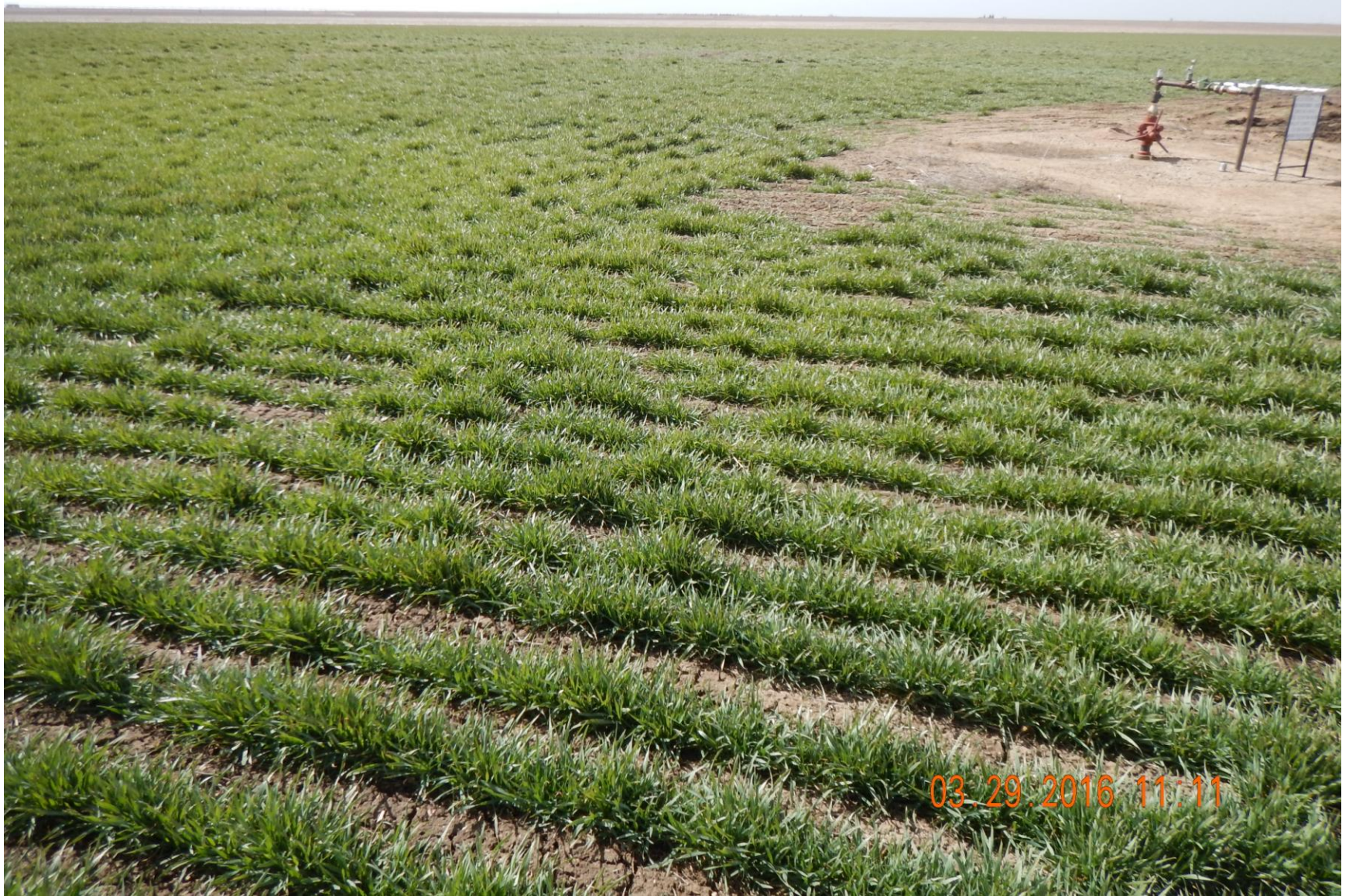
Figure 3: Photo Taken from the northeast end of the location, facing south. Photo shows interim and project areas.