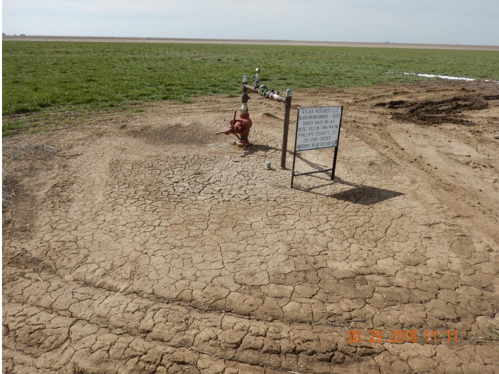
Figure 1: Photo of wellhead and sign.