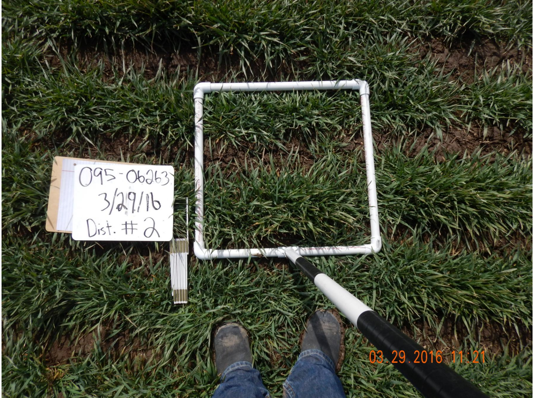
Figure 11: Photo of disturbance quadrat #2. Transect conducted on the northwest end of the interim area.