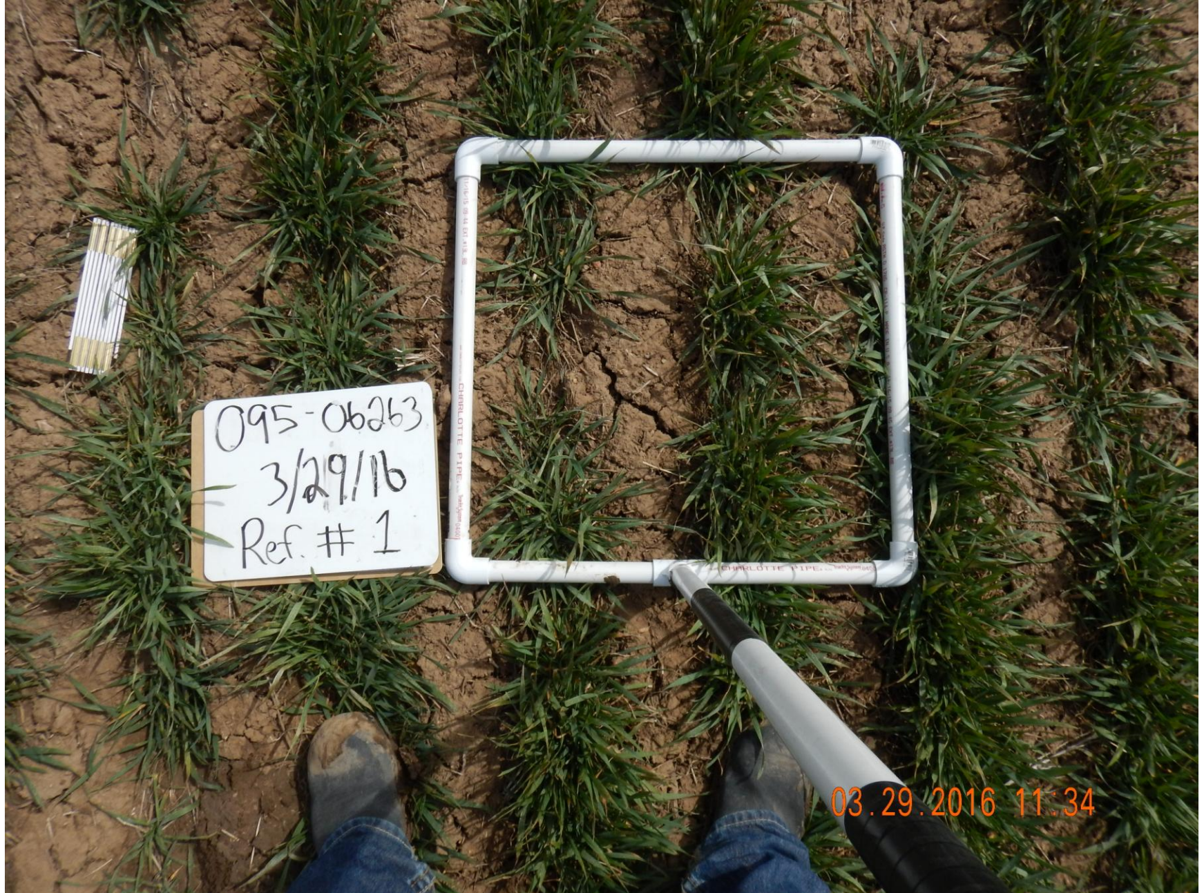
Figure 13: Photo of reference quadrat #1. Transect conducted south of the location.