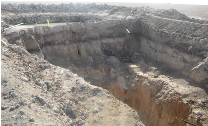
Former skim pit and new berms looking southwest