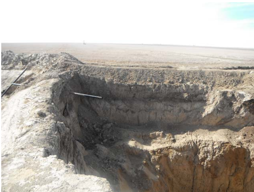
Siphon pipe between pits