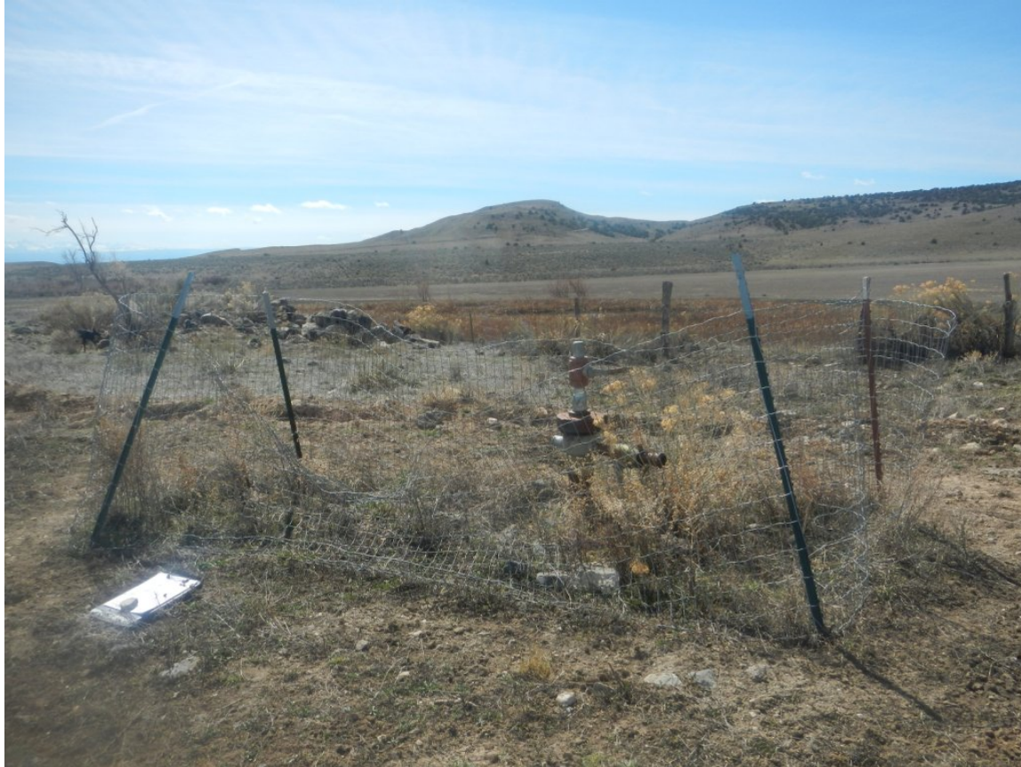
Photo#2: View of Location to South, showing sagging fence in disrepair.