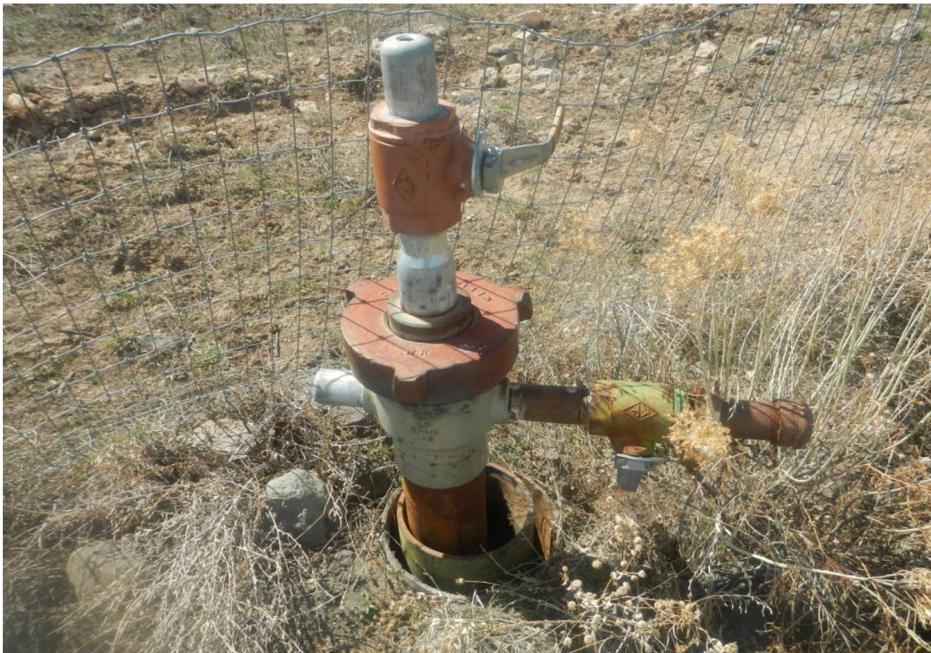
Photo#5: View of Wellhead showing open area between Conductor and Surface casing that needs to be covered.