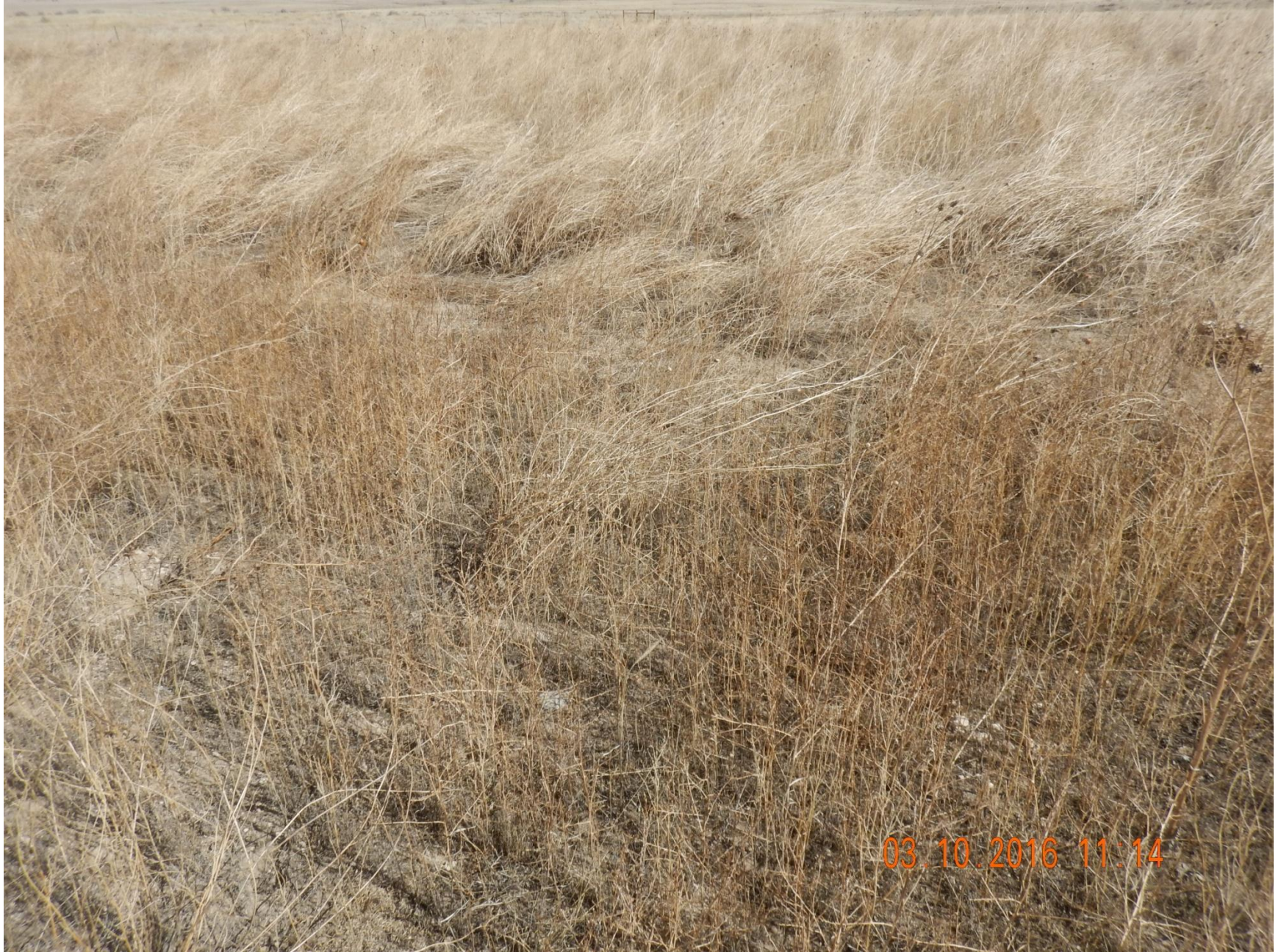
Figure 2: Photo taken from the north end of the interim area. Photo shows interim area composed predominantly with undesirable weedy vegetation.