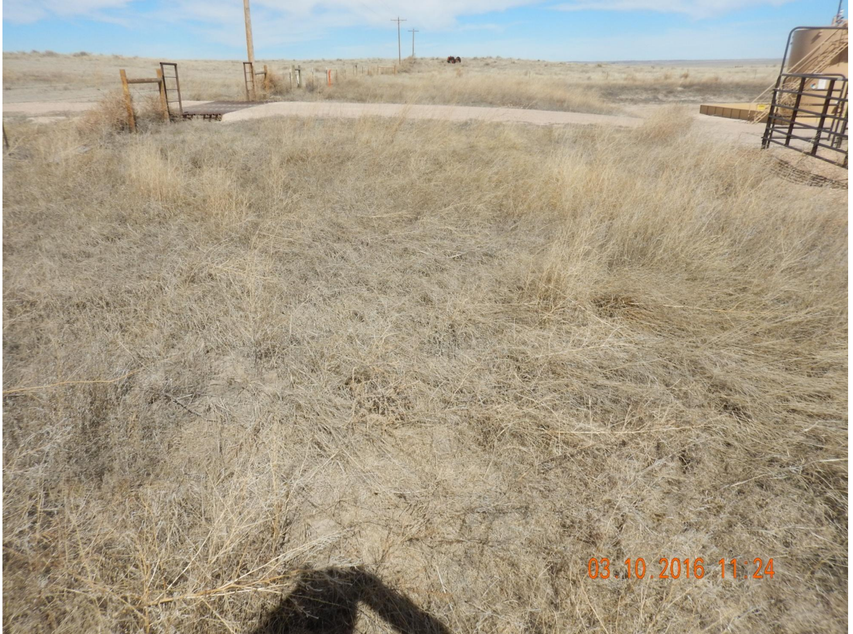
Figure 11: Photo taken from the southwest corner of the location, facing north. Photo shows interim area.