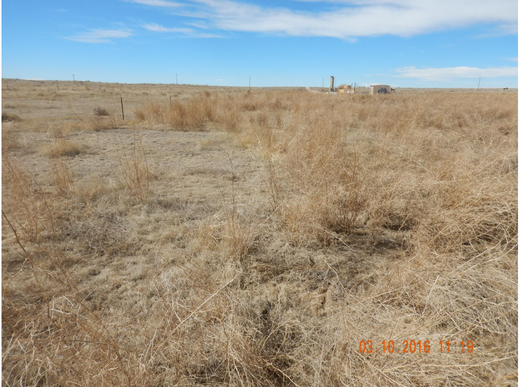
Figure 8: Photo taken from the southeast corner of the interim location, facing west. Photo shows vegetation on interim area.