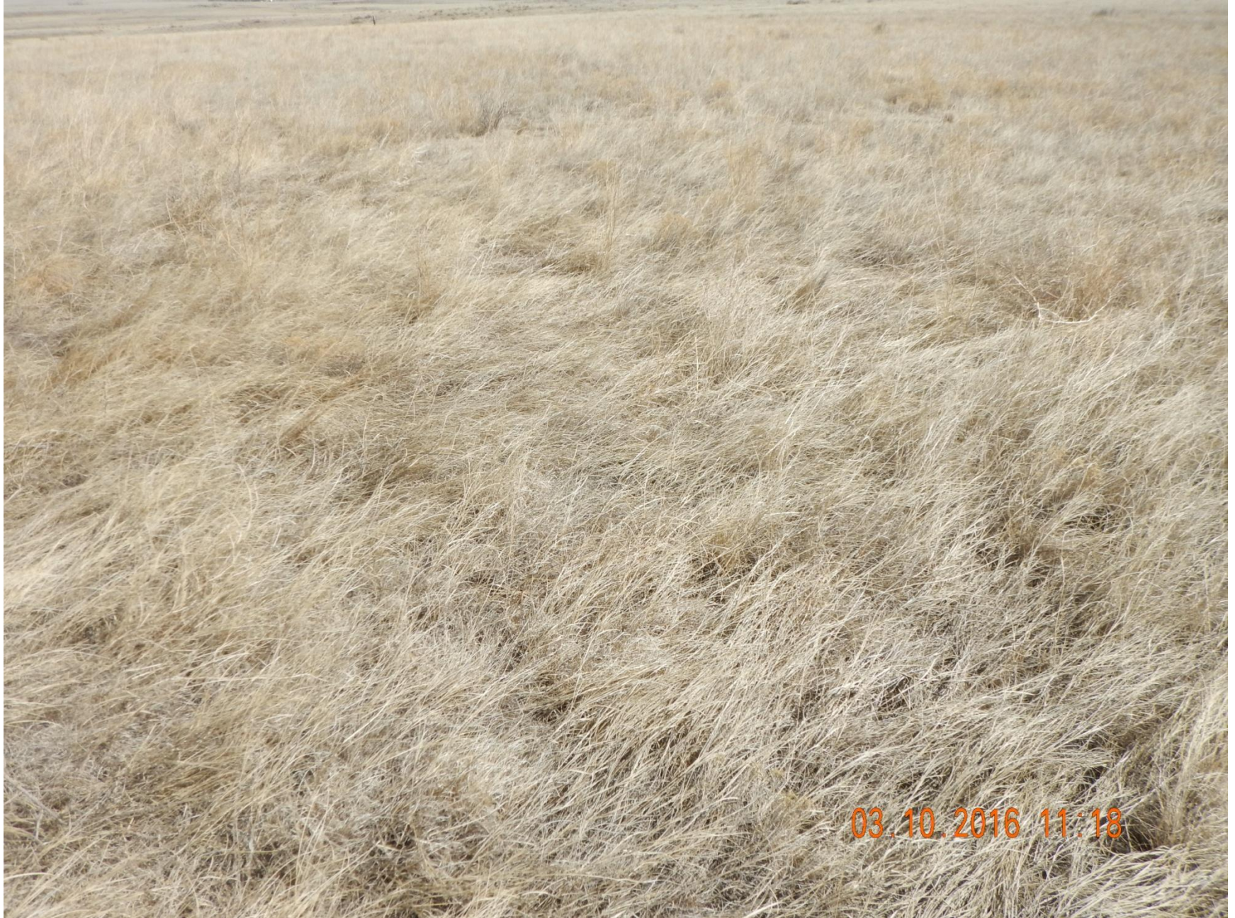
Figure 6: Photo east of location. Photo shows vegetation on reference area.