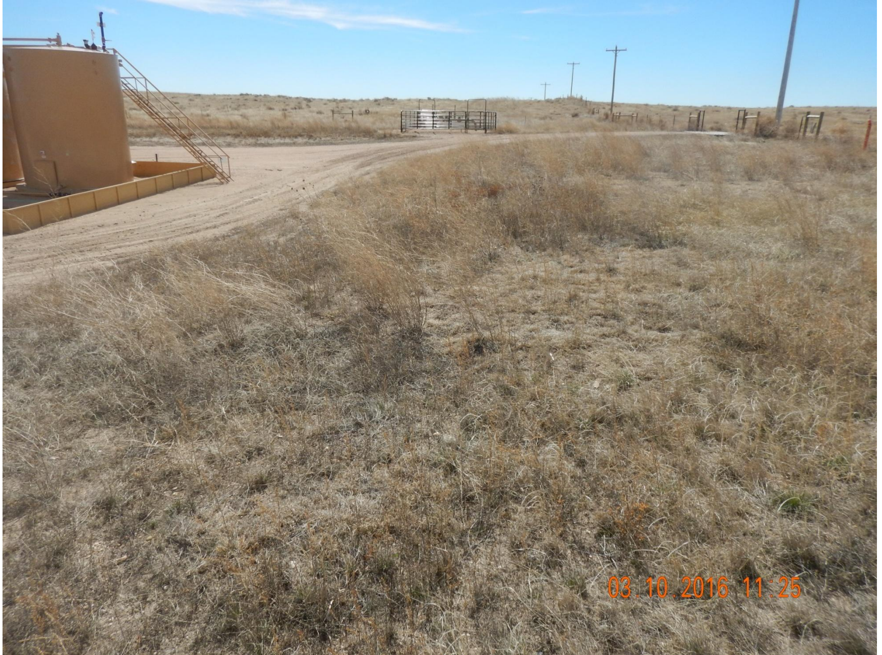
Figure 12: Photo taken from the northwest corner of the location, facing south. Photo shows interim and project areas.