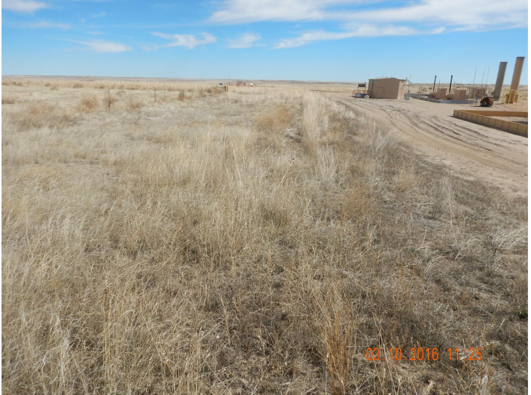
Figure 13: Photo taken from the northwest corner of the location, facing south. Photo shows interim and project areas.