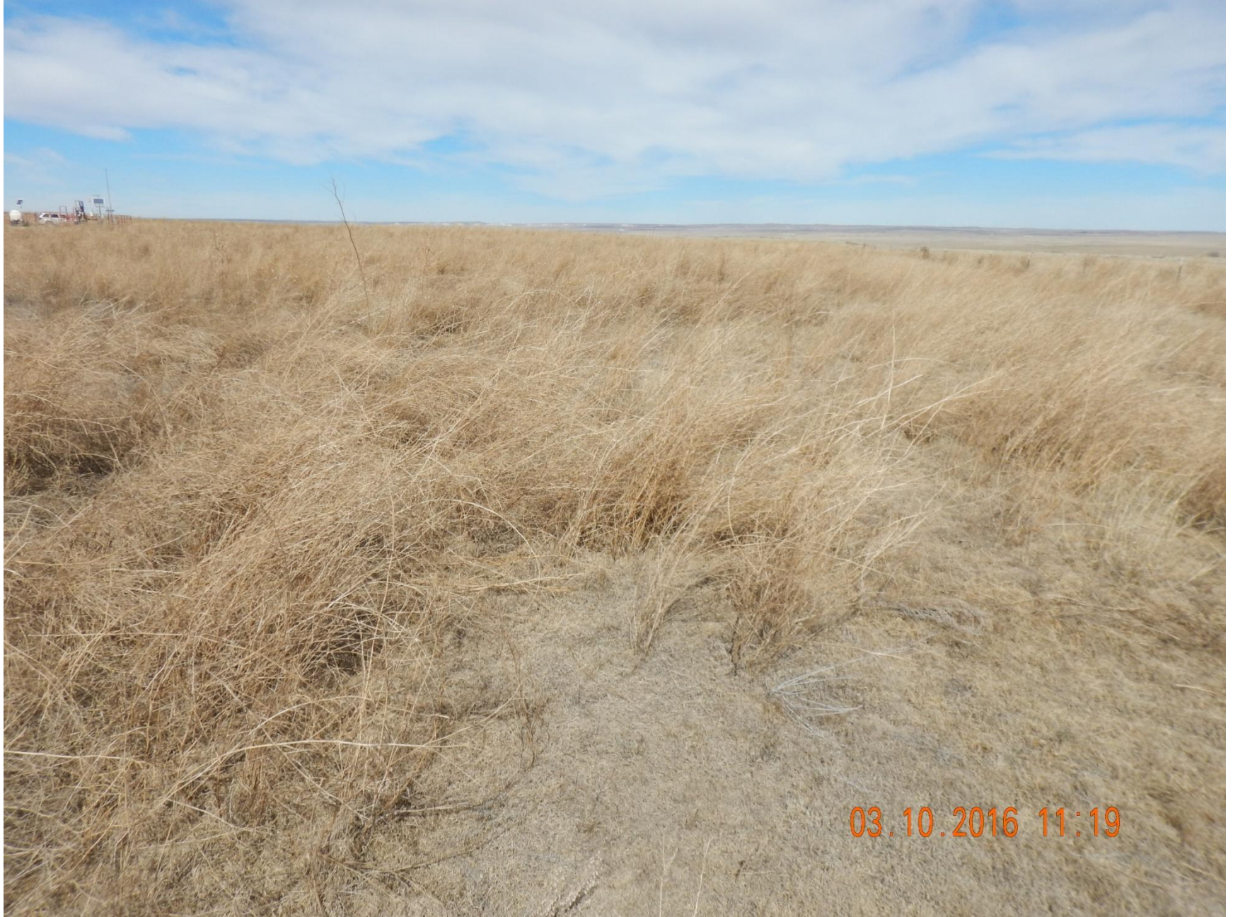
Figure 7: Photo taken from the southeast corner of the interim location, facing north. Photo shows vegetation on interim area.