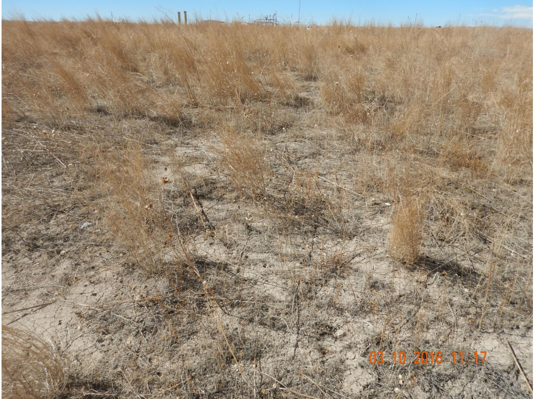
Figure 5: Photo taken from the east end of the interim area, facing west. Photo shows vegetation not uniformly distributed, and predominantly undesirable weedy plant species.