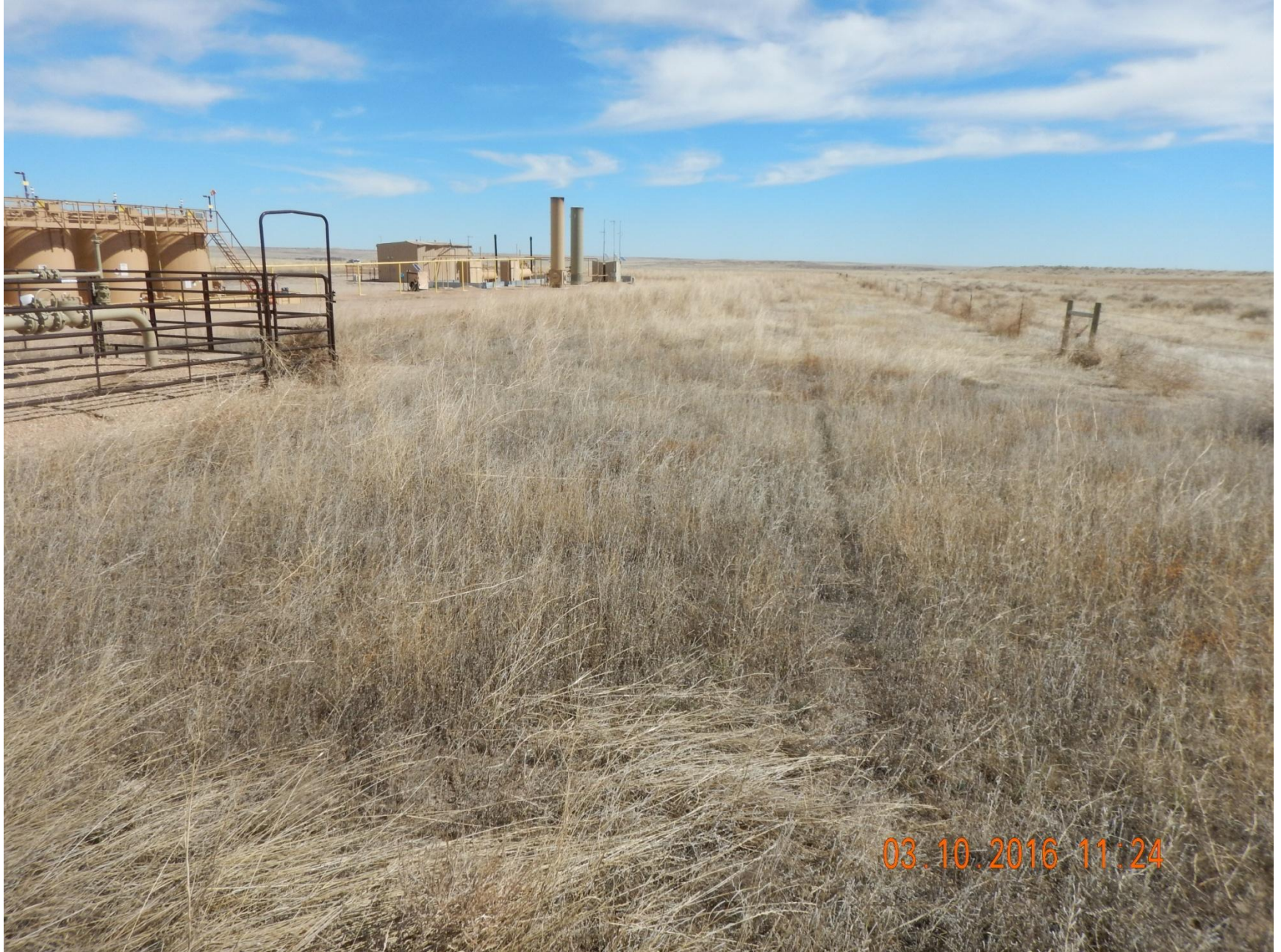
Figure 10: Photo taken from the southwest corner of the location, facing east. Photo shows interim area.