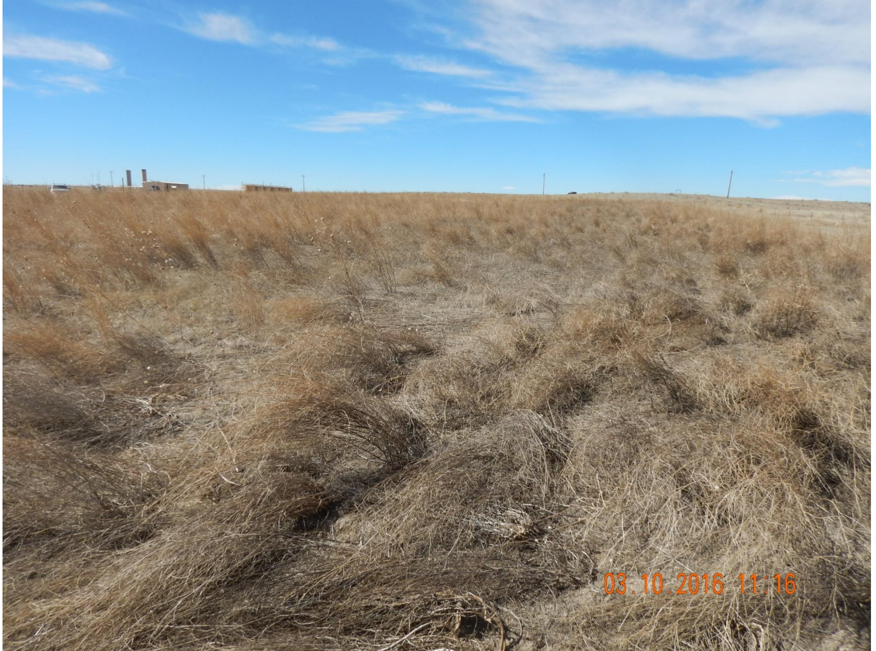
Figure 3: Photo taken from the northeast corner of the interim location, facing west. Photo shows vegetation on interim area.