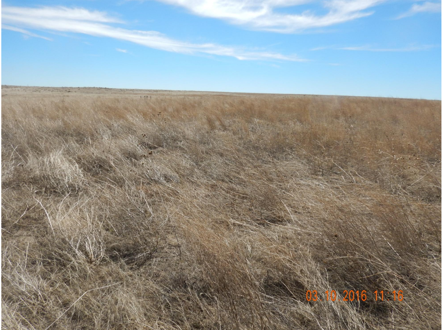
Figure 4: Photo taken from the northeast corner of the interim location, facing south. Photo shows vegetation on interim area.