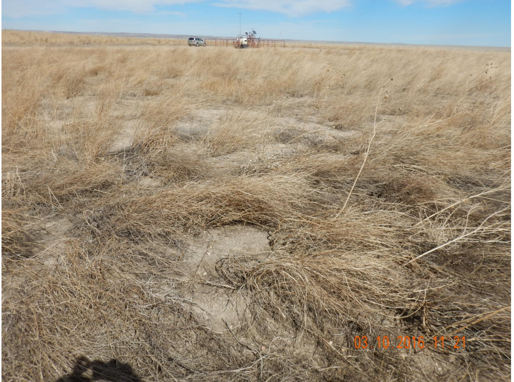
Figure 9: Photo taken from the southern end of the interim area, facing north. Photo shows vegetation not uniformly distributed, and predominantly undesirable weedy plant species.