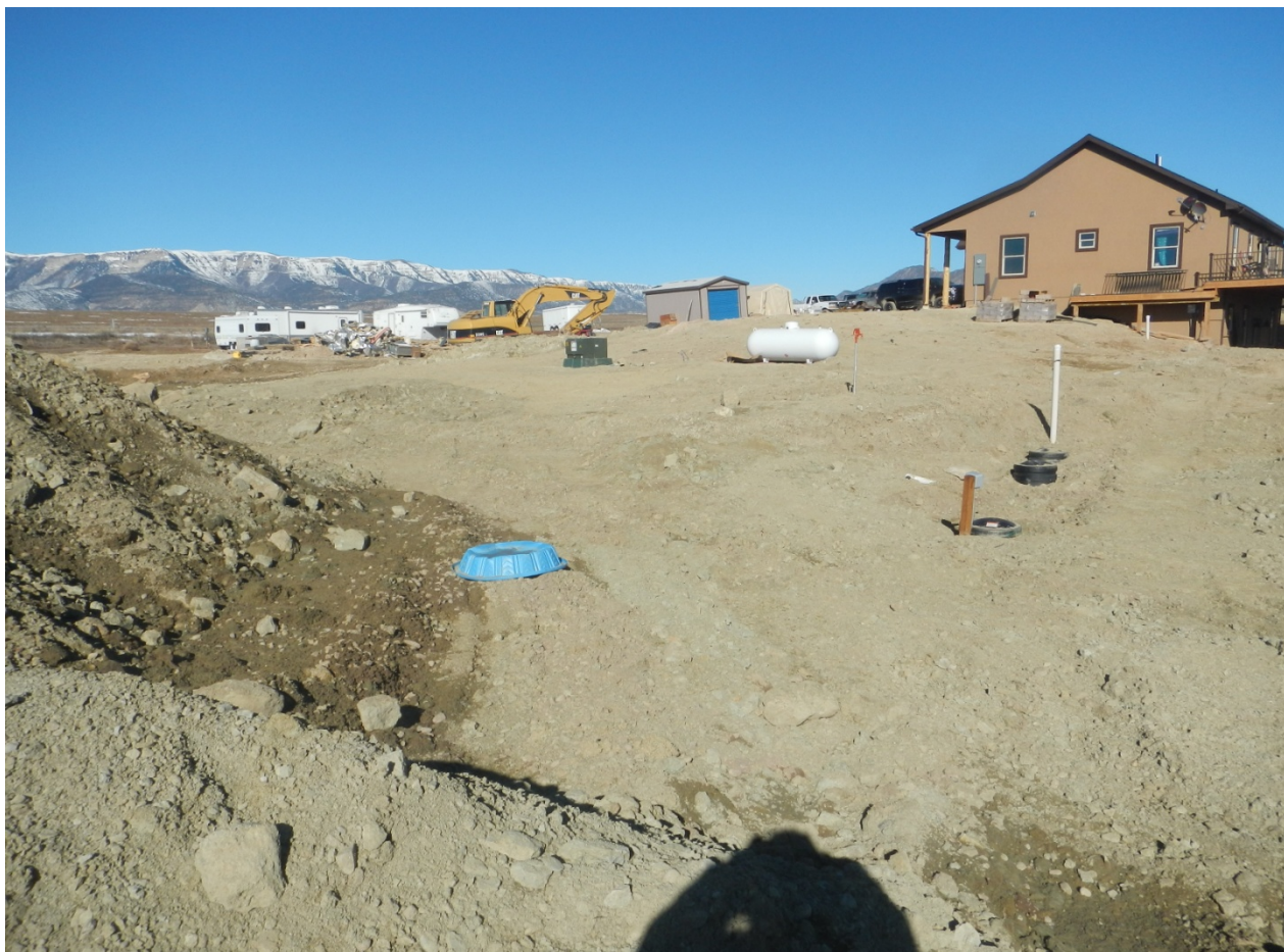
Photo#6: View to NW of Utilities set up and Equipment adjacent to Location Entrance. Access Road runs between House and equipment.