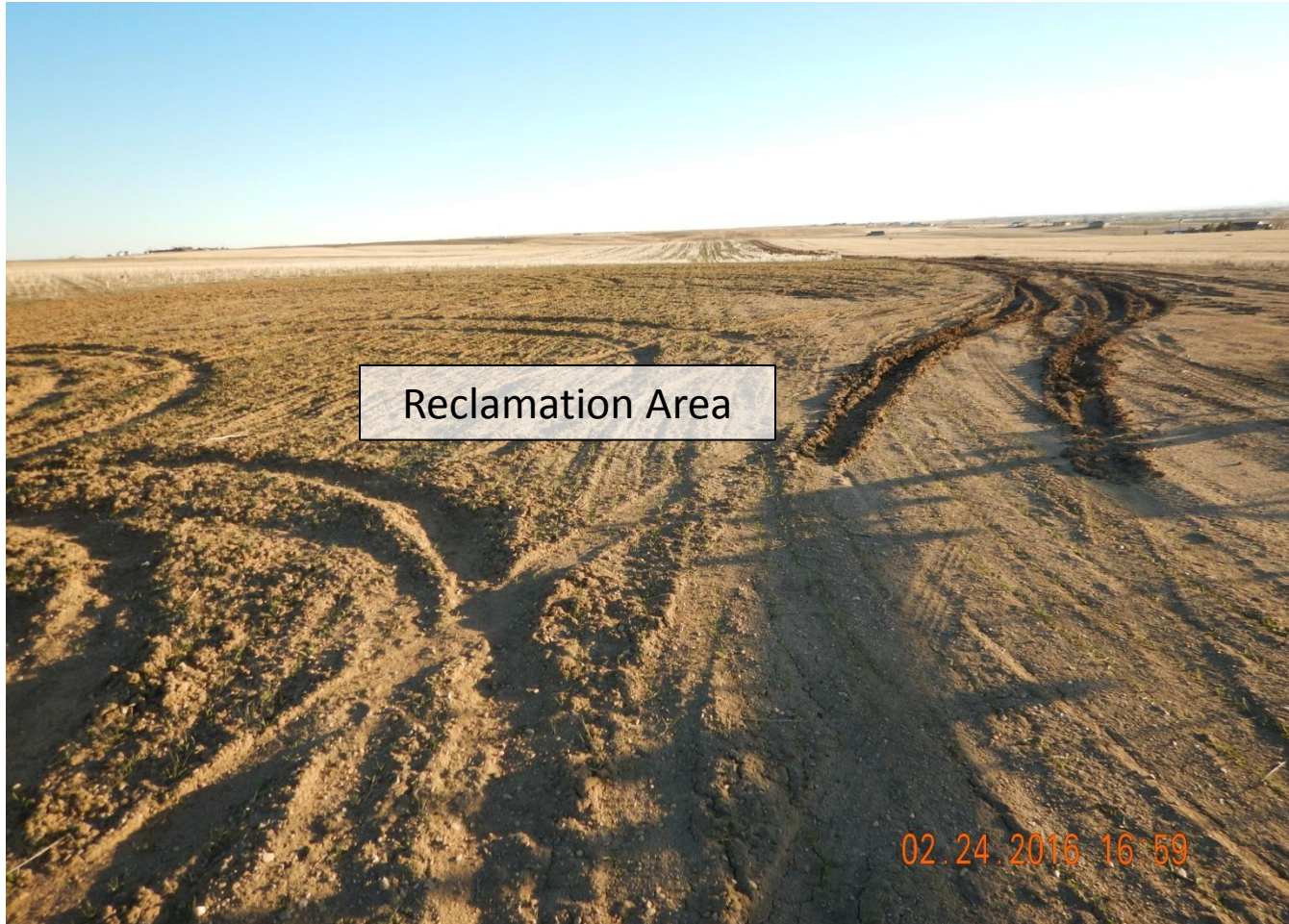
Photo 5. Photo taken from southern location, facing South. Reclamation area has been seeded but vegetative growth in process. Area will be reinspected next growing season to determine successful vegetative growth comparable to the reference area. Vehicle traffic on reclamation area is negatively affecting vegetative growth.