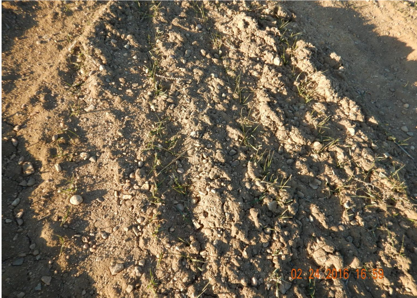
Photo 6. Photo taken from reclamation area indicating seeding attempt. Final reclamation area in process.