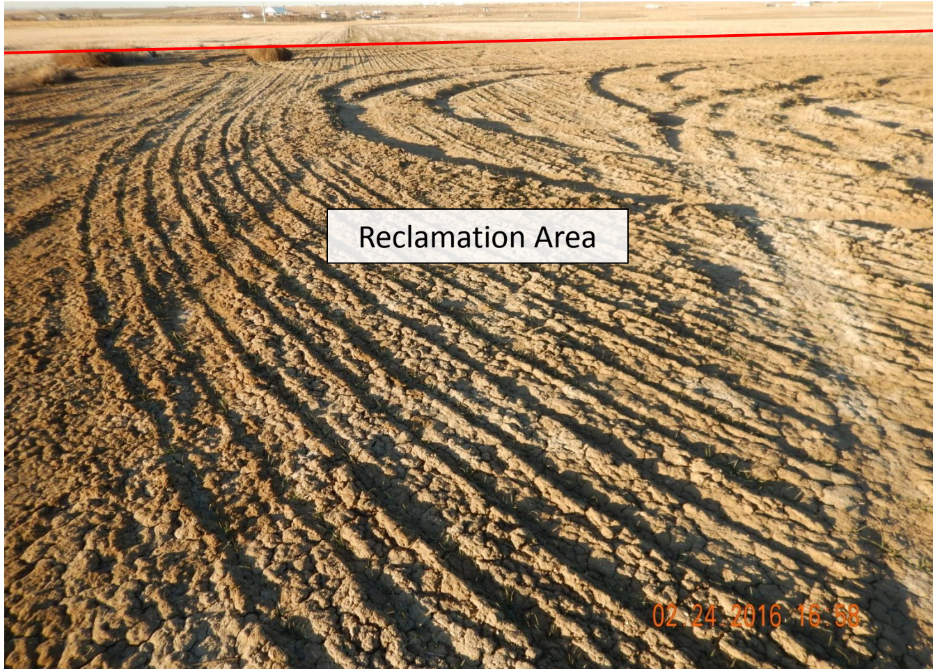
Photo 2. Photo taken from northern location, facing North. Reclamation area has been seeded but vegetative growth in process. Area will be reinspected next growing season to determine successful vegetative growth comparable to the reference area. Vehicle traffic on reclamation area is negatively affecting vegetative growth.