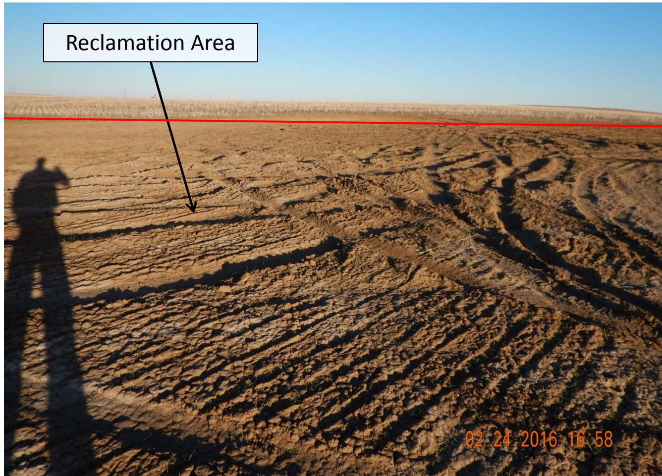
Photo 4. Photo taken from north location, facing East. Reclamation area has been seeded but vegetative growth in process. Area will be reinspected next growing season to determine successful vegetative growth comparable to the reference area. Vehicle traffic on reclamation area is negatively affecting vegetative growth.