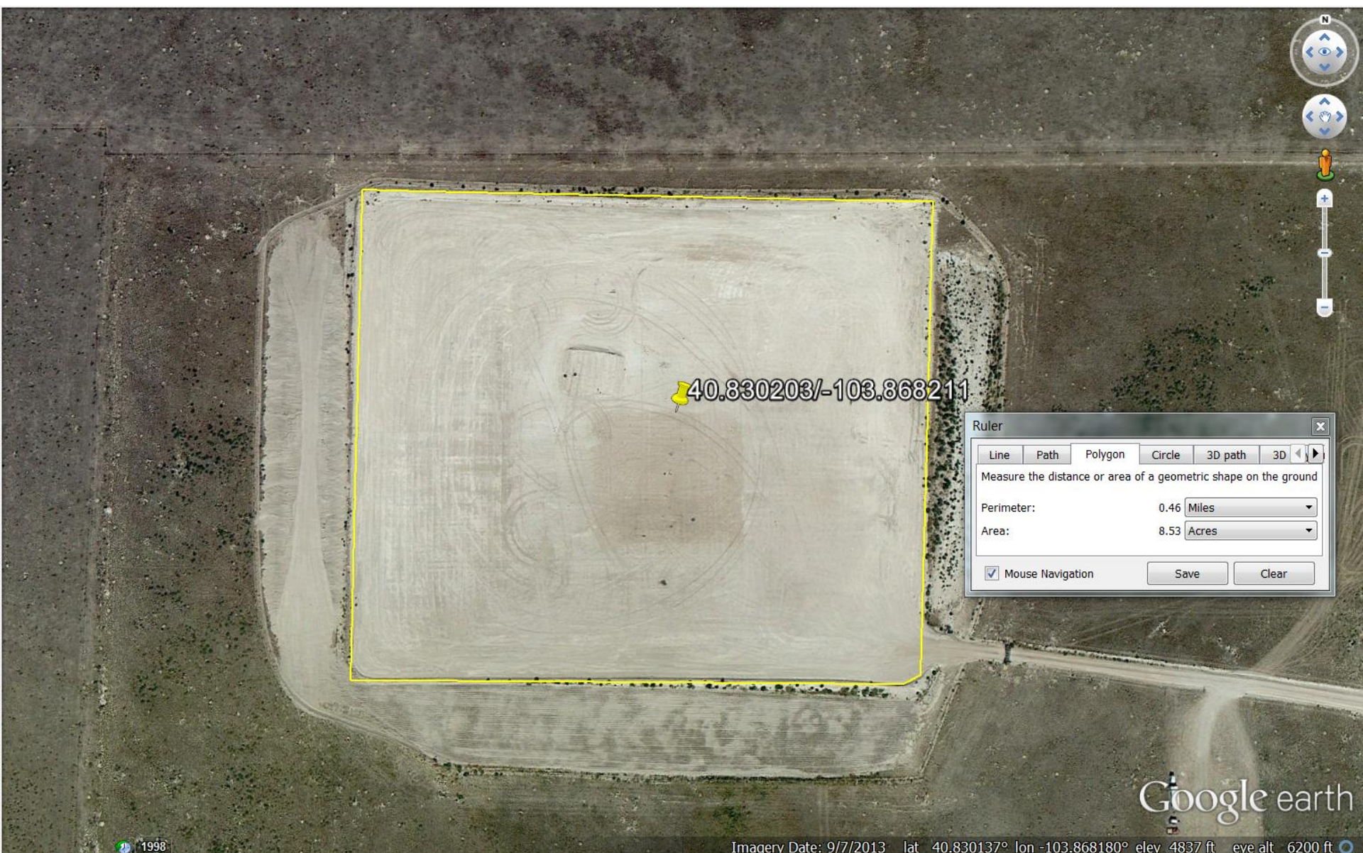
Figure 24: 2013 aerial image of location. Approximate area of project location (conservatively), not including total disturbed area, is 8.5 acres.