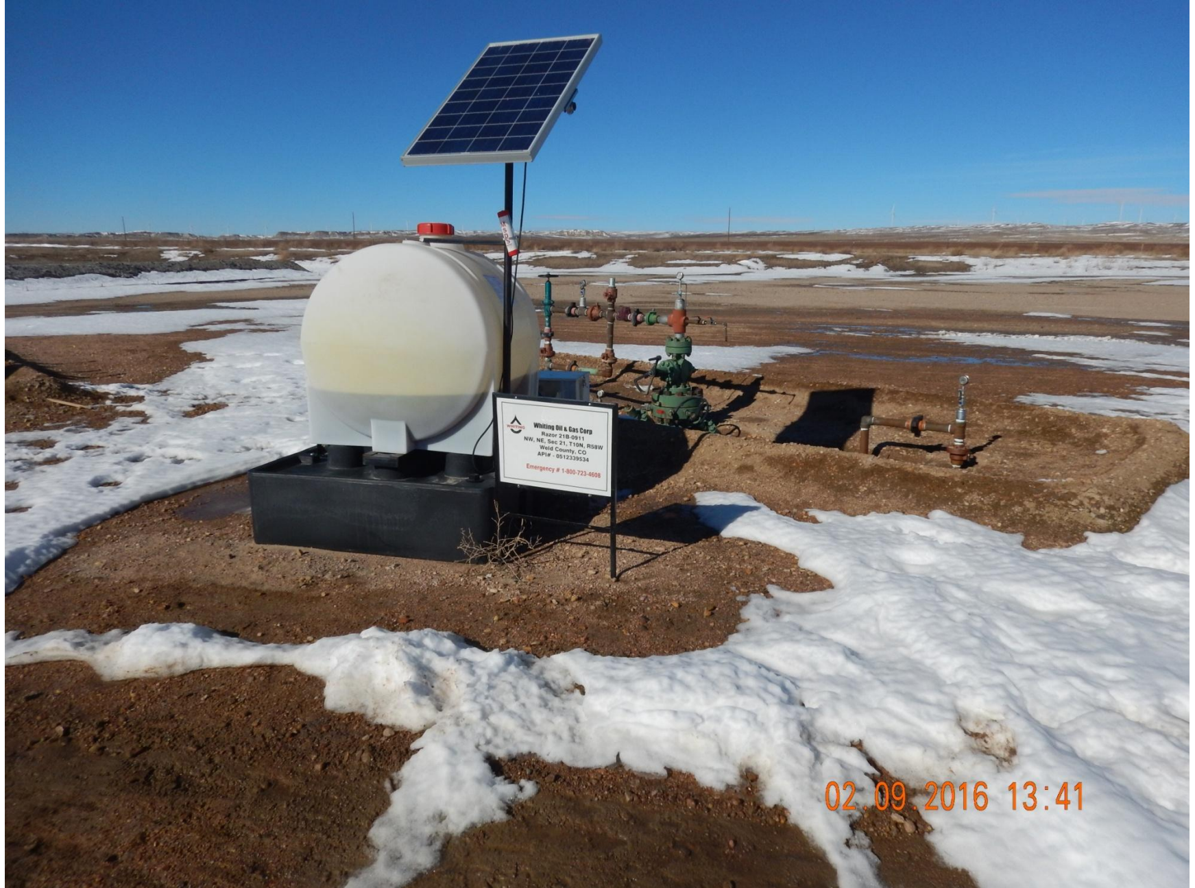
Figure 19: Photo taken from well #123-39534