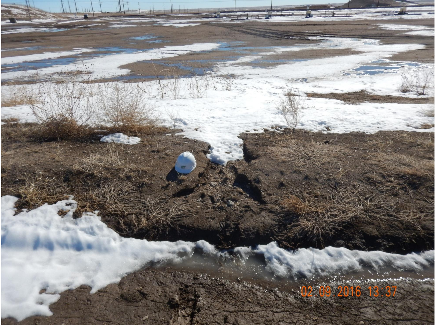
Figure 13: Photo taken from north end of location, facing south. Photo shows gully erosion beginning to encroach off project location.