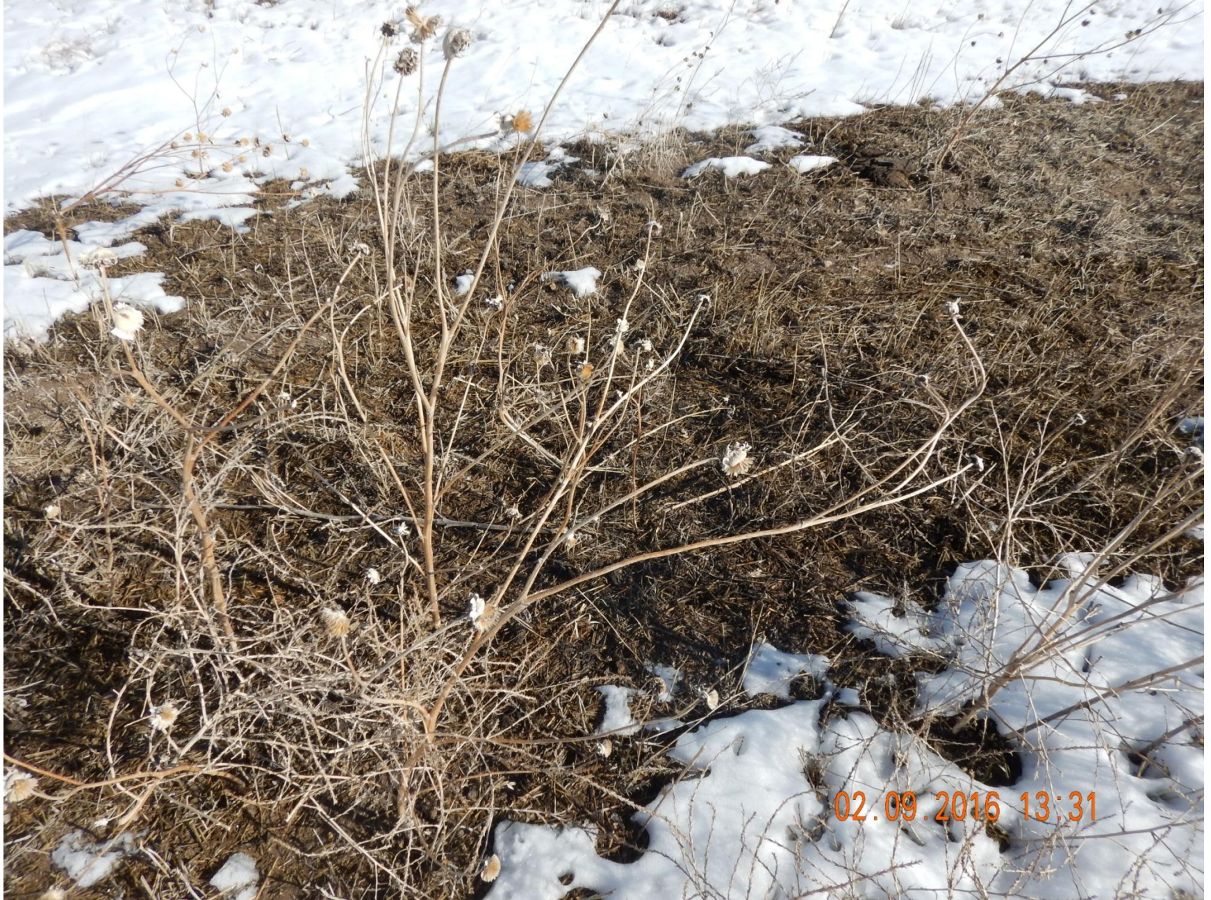
Figure 6: Photo taken from topsoil stockpile on the west end of location. Photo shows vegetation is predominantly undesirable weedy vegetation.