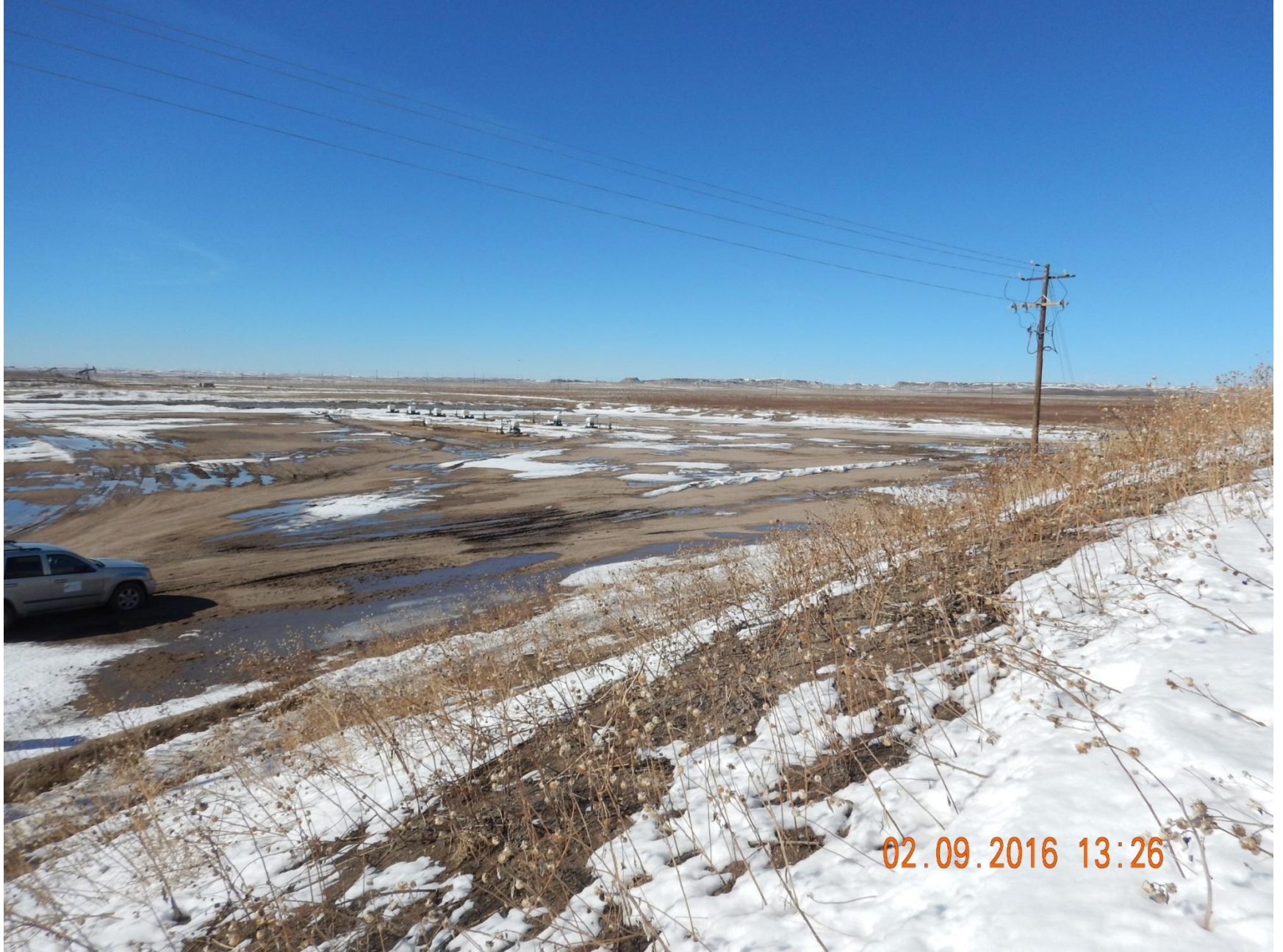
Figure 2: Photo taken from stockpile on the southeast end of location, facing northwest. Photo of location.