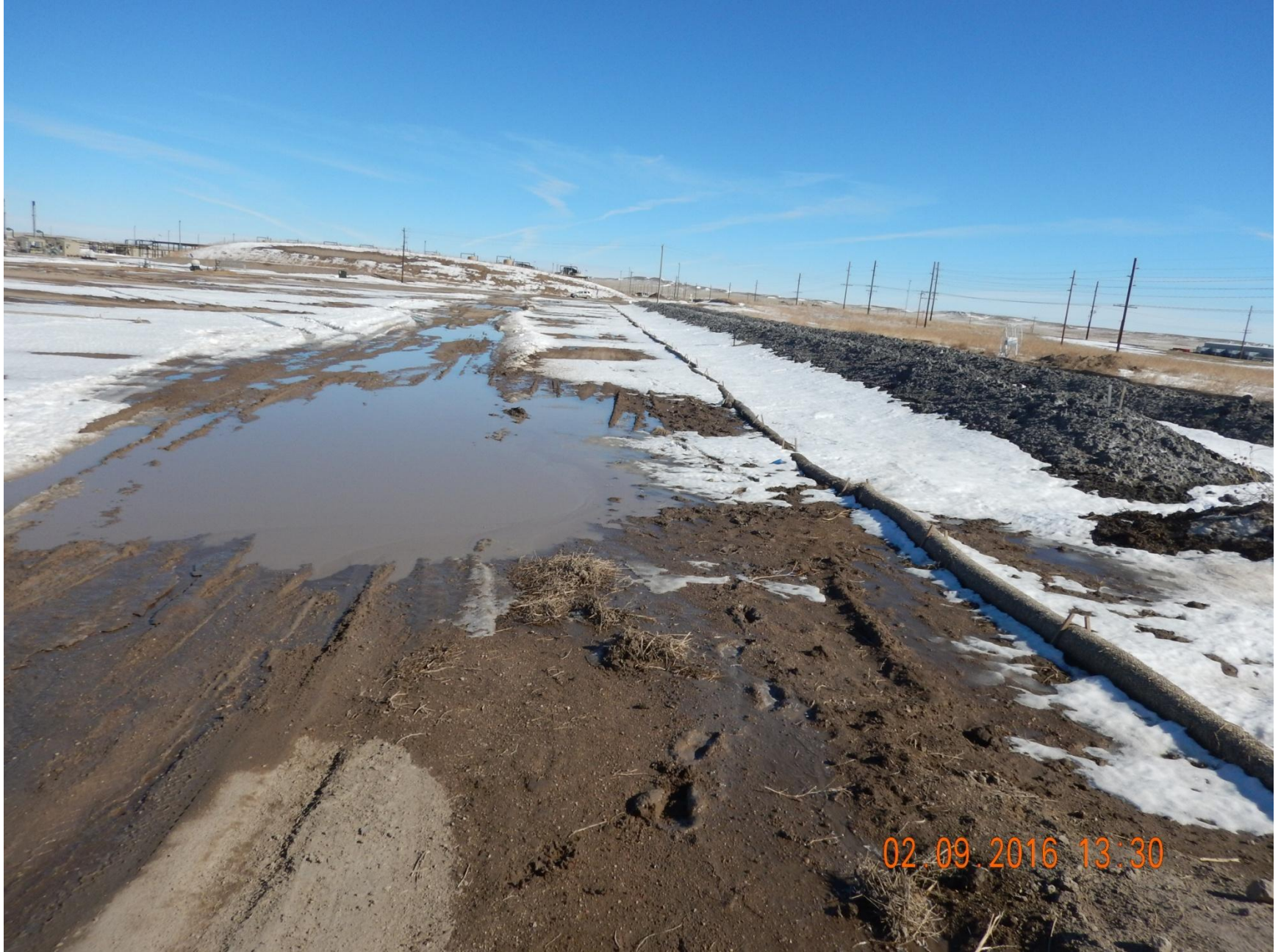
Figure 4: Photo taken from southwest portion of location, facing southeast. Photo of drill cuttings stored on location. Note pooling water on location/access road.