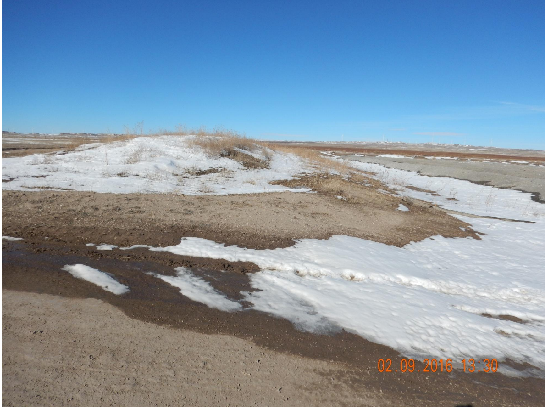
Figure 5: Photo taken from southwest corner of location, facing north. Photo shows topsoil stockpile on left side of photo, and drill cuttings on the right side of photo. Note lack of vegetative growth on topsoil berm.