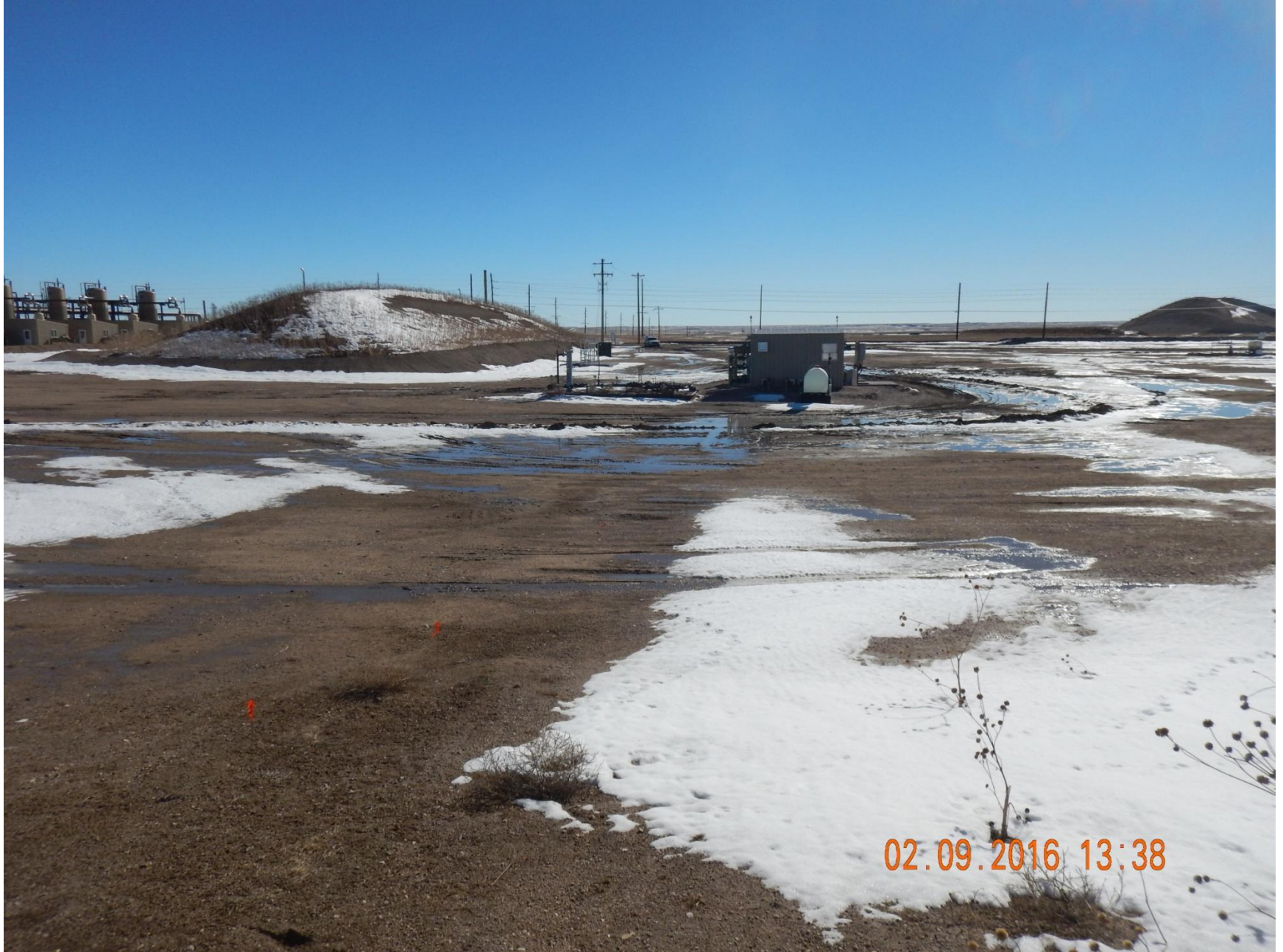
Figure 14: Photo taken from northeast corner of location, facing south. Note height of berm is excessive, adequate room exists to have extended its length to the north, thus reducing the height.