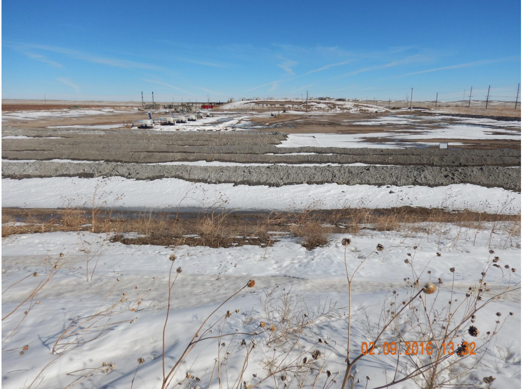
Figure 8: Photo taken from topsoil stockpile on the west end of location, facing east. Photo shows project area and drill cuttings.