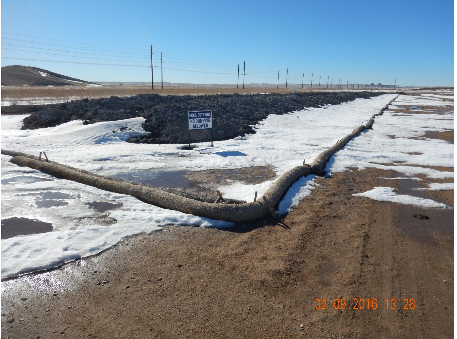
Figure 3: Photo taken from southeast portion of location, facing southwest. Photo of drill cuttings stored on location.