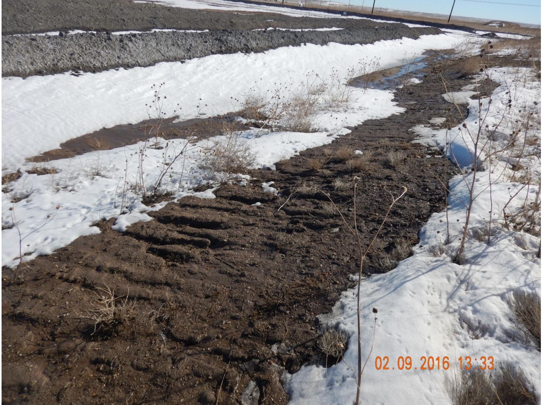
Figure 9: Photo taken from topsoil stockpile on the west end of location, facing southeast. Photo shows erosion occurring on topsoil stockpile, indicating lack of stabilization.