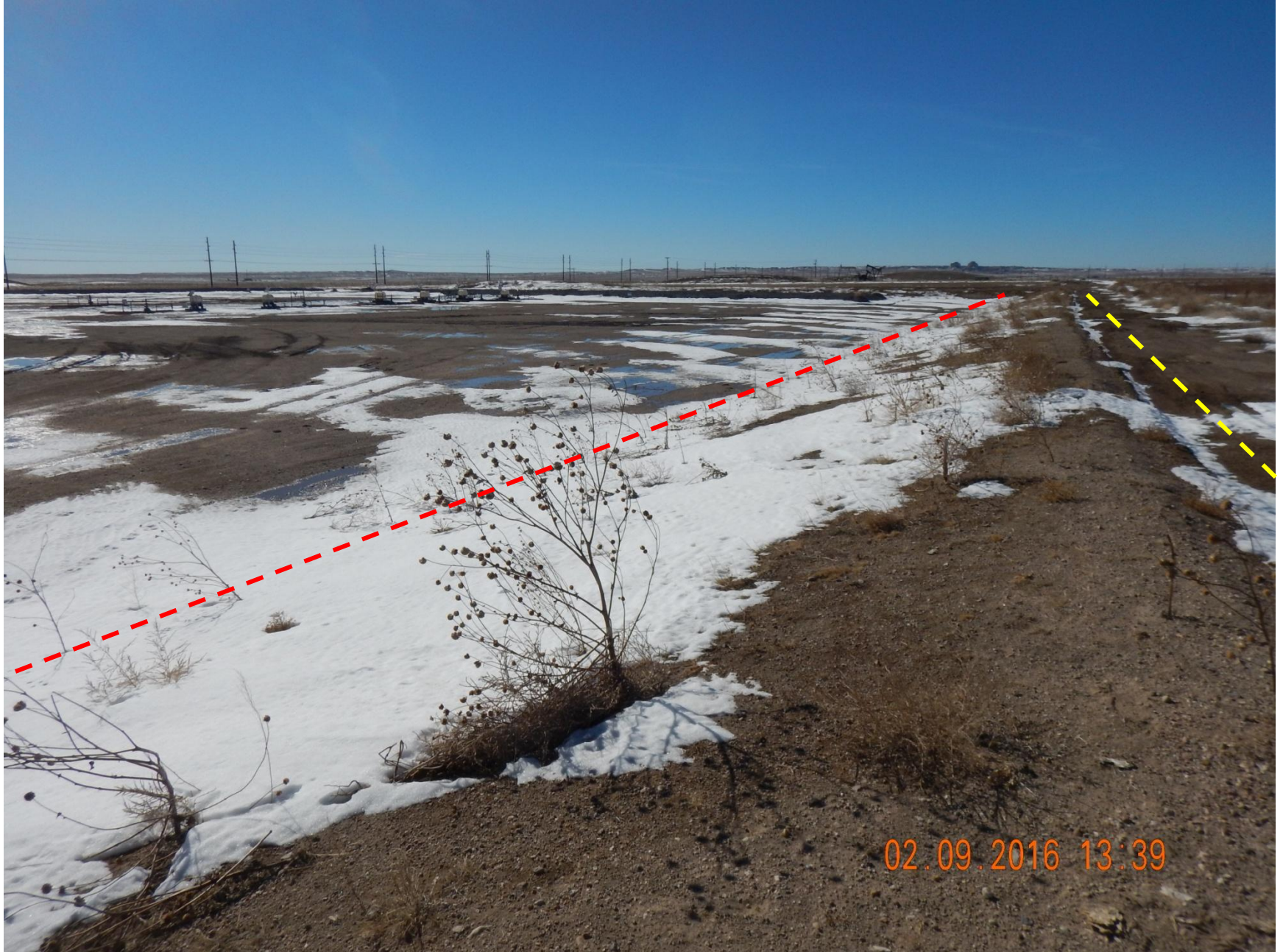
Figure 15: Photo taken from northeast corner of location, facing west. Photo shows project location (left of line), and interim area (right of line). Note location has yet to be reduced in size per interim reclamation requirements. Old ruts within area along yellow line indicated evidence of former use as an access road.