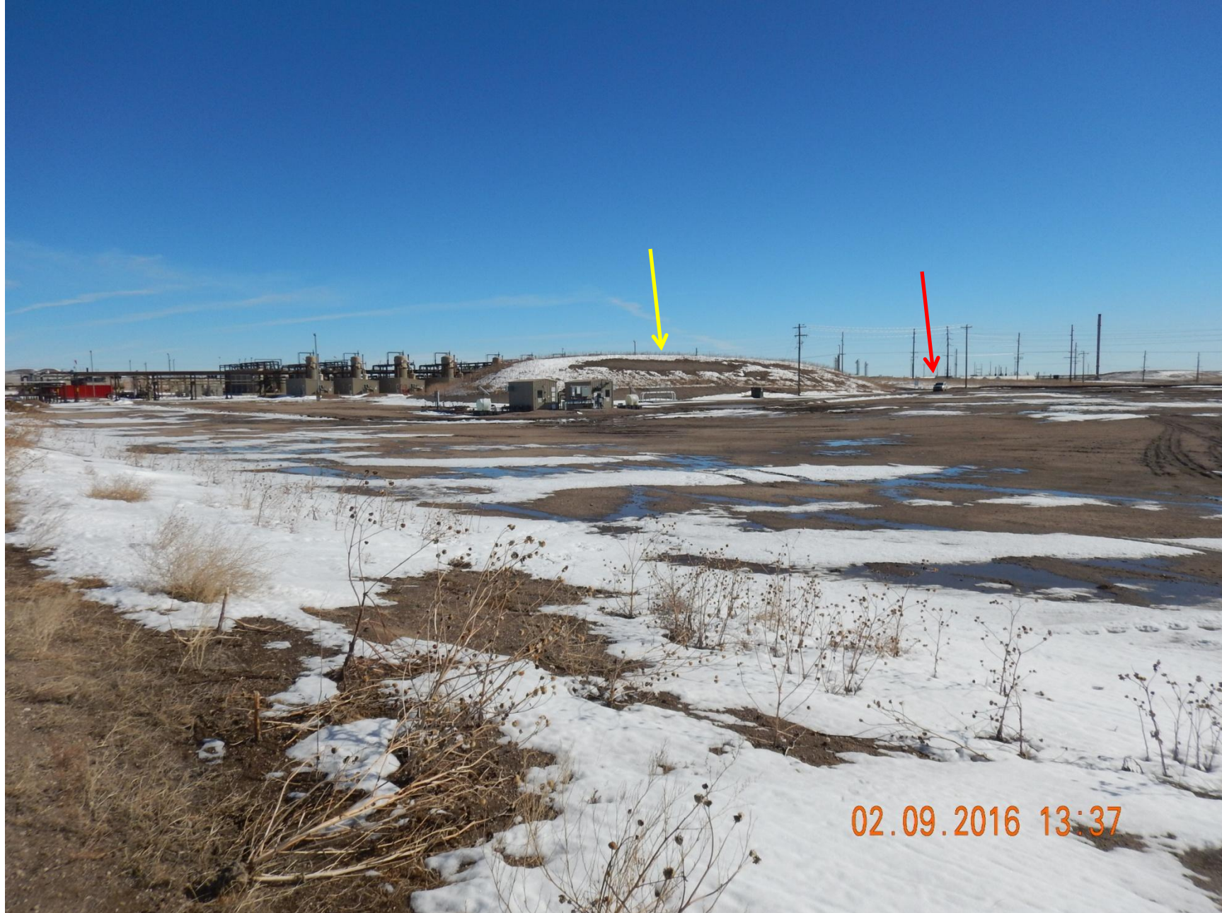
Figure 12: Photo taken the north end of location, facing southeast. Photo shows project location, and topsoil berm (yellow arrow). Note height of berm is excessive, adequate room exists to have extended its length to the north, thus reducing the height. Arrow indicates vehicle for reference.