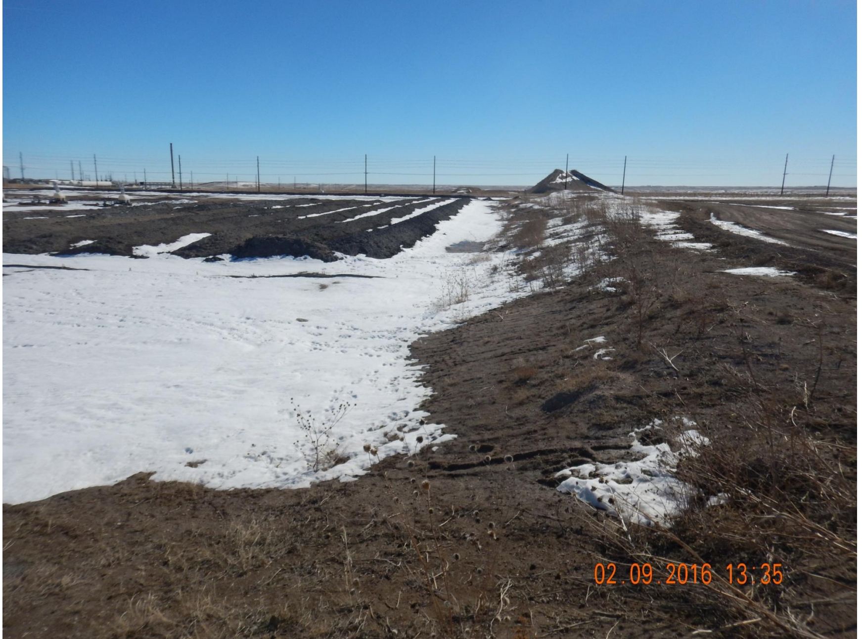
Figure 10: Photo taken from northwest corner of location, facing south. Photo shows drill cuttings on location, and topsoil berm. Note lack of vegetative growth on berm and rill erosion.