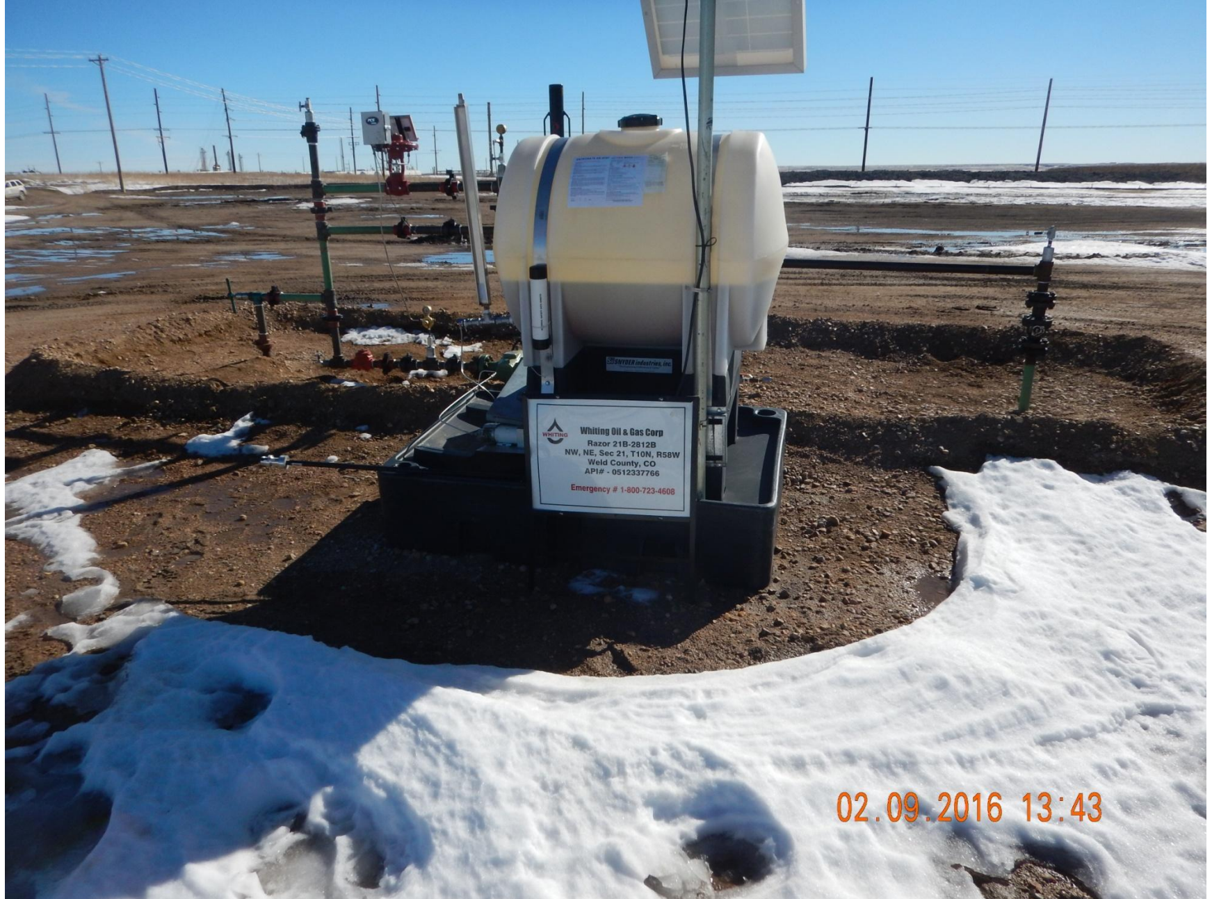
Figure 23: Photo taken from well #123-37766