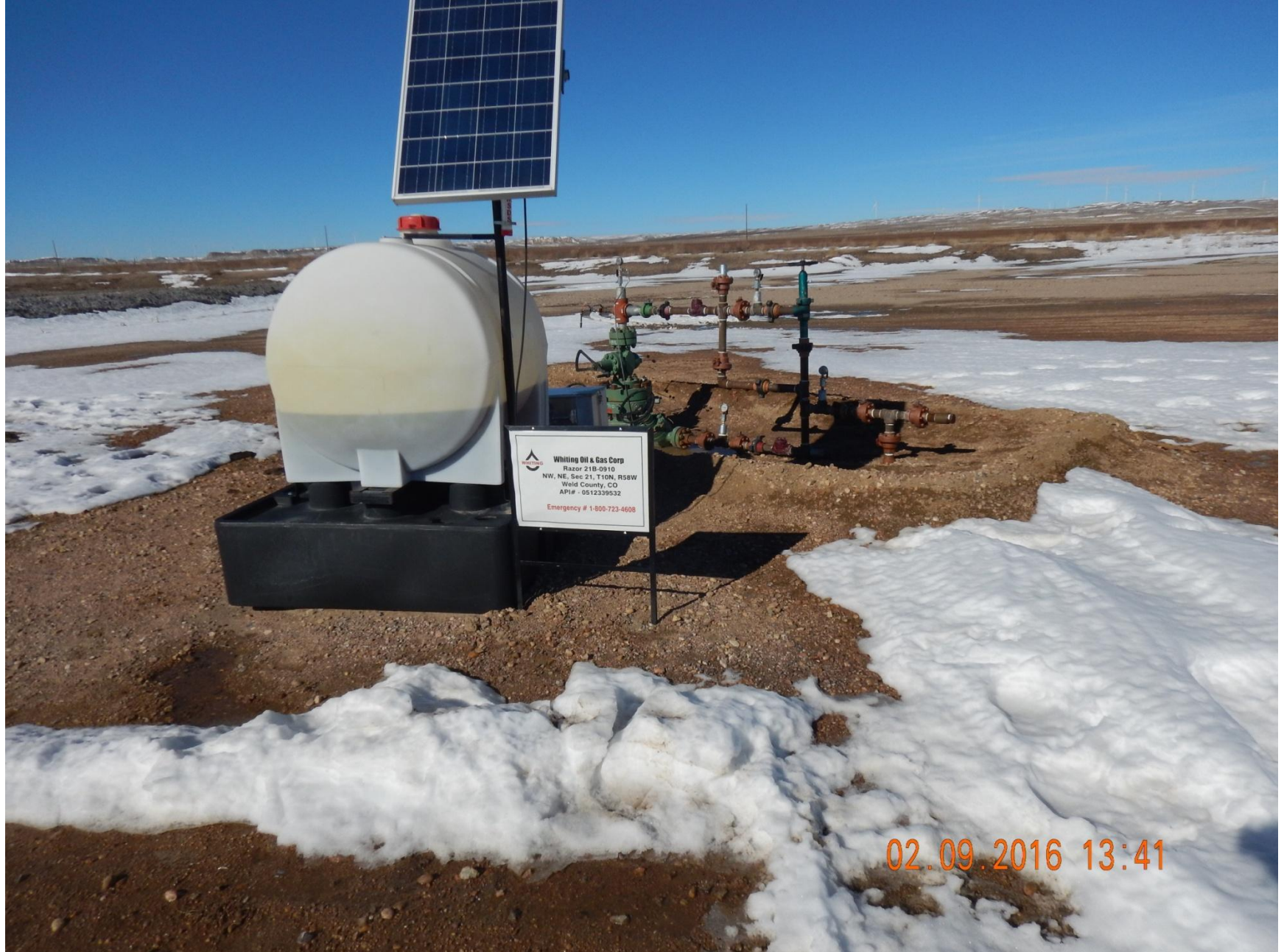
Figure 20: Photo taken from well #123-39532.