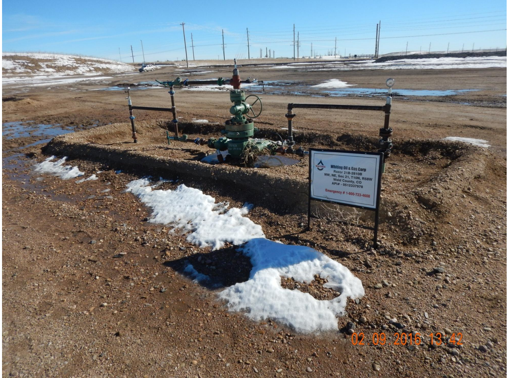
Figure 22: Photo taken from well #123-37978