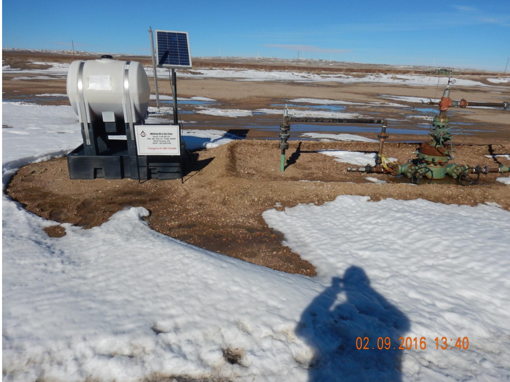
Figure 16: Photo taken from well #123-37765.