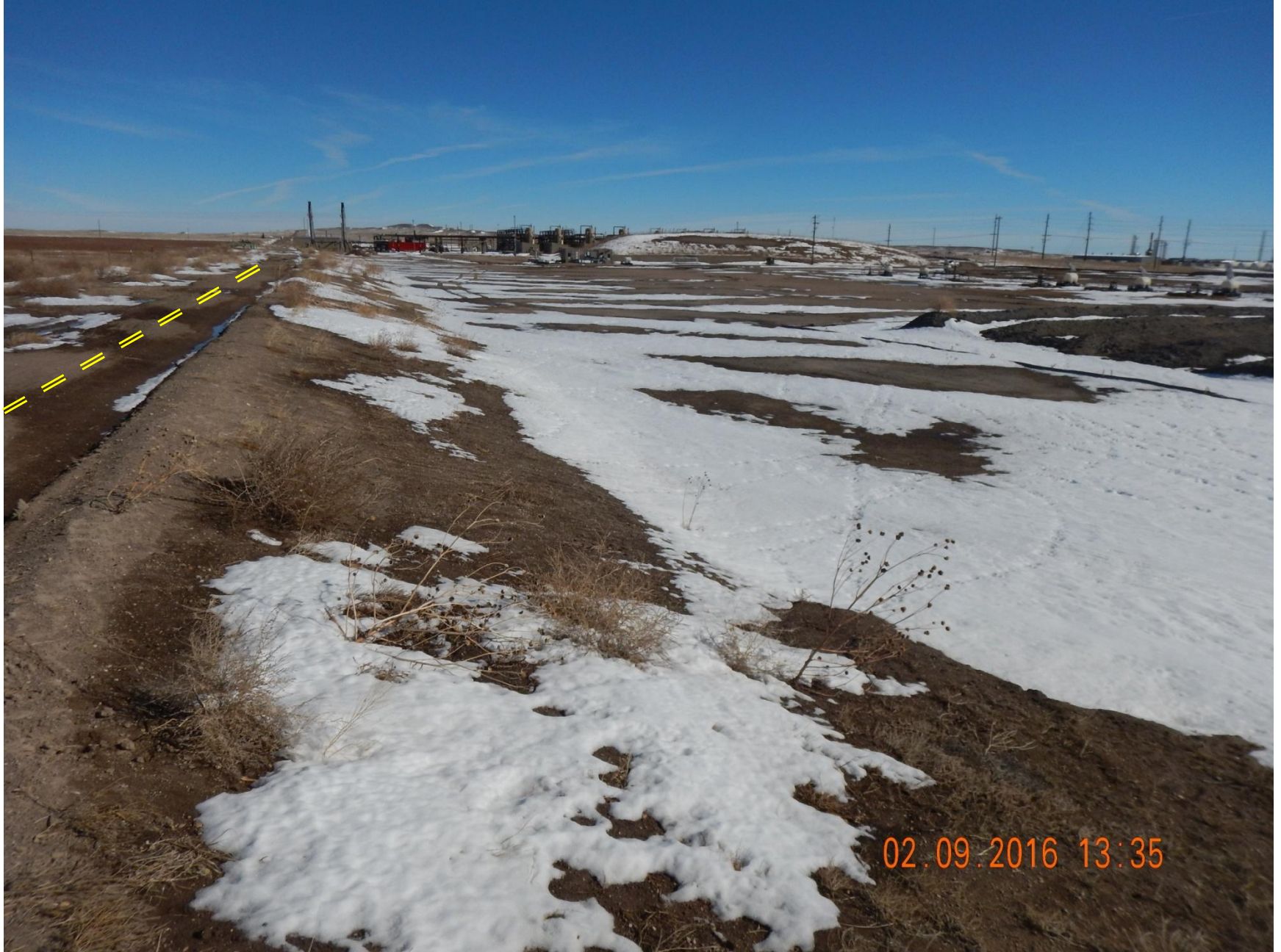
Figure 11: Photo taken from northwest corner of location, facing east. Photo shows project location yet to be reduced in size per interim reclamation requirements. Old ruts within area along yellow line indicated evidence of former use as an access road). Current access road is on the southern portion of the location.