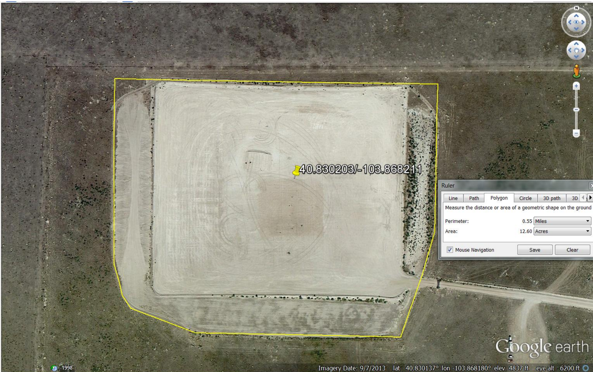
Figure 25: 2013 aerial image of location. Note the total area disturbed appears greater than 10.28 acres stated in the 2A (Doc. # 400437664) permitted area.