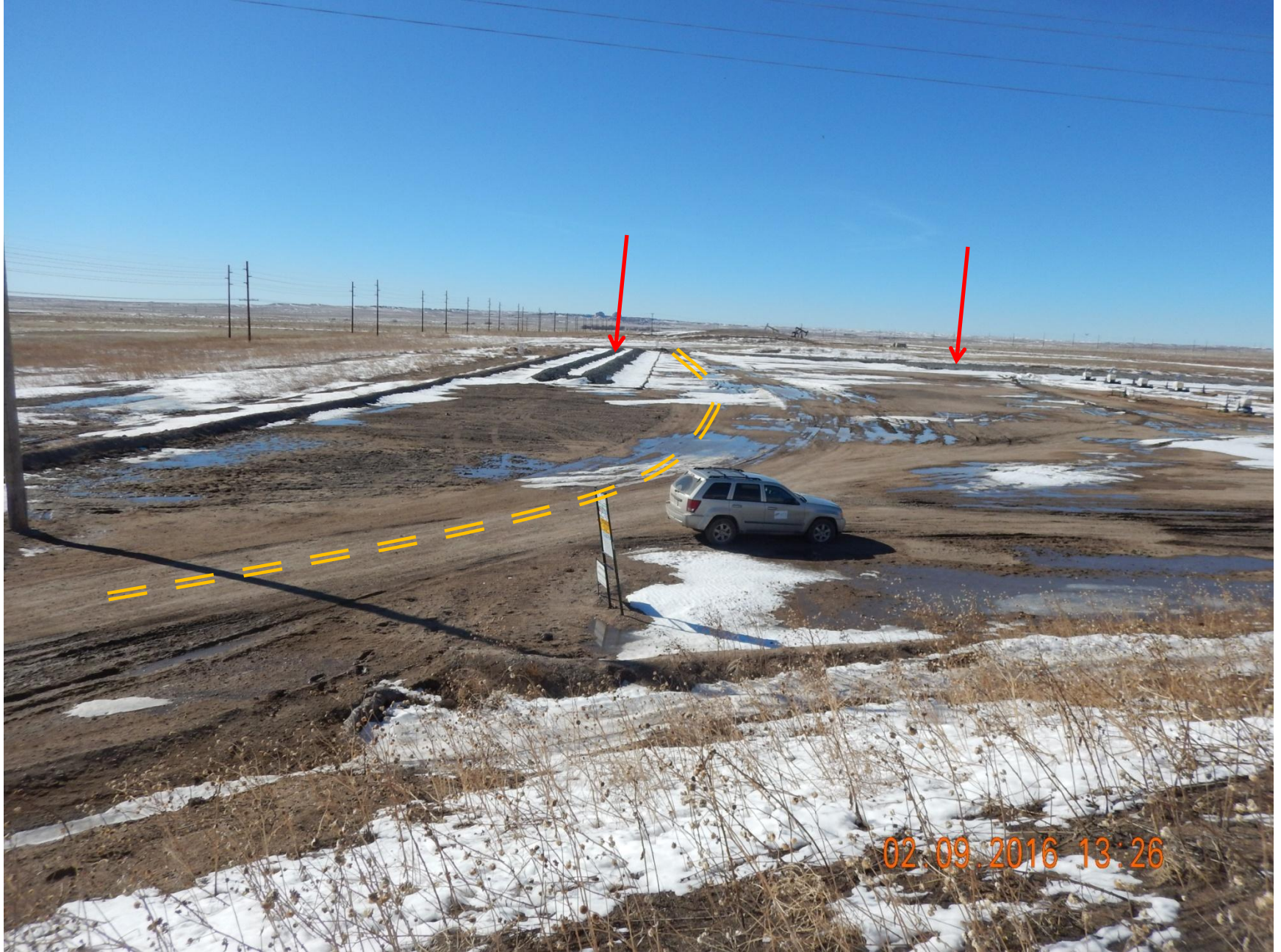
Figure 1: Photo taken from stockpile on the southeast end of location, facing west. Photo shows location, current access road being used (yellow line), and drill cuttings (red arrow).