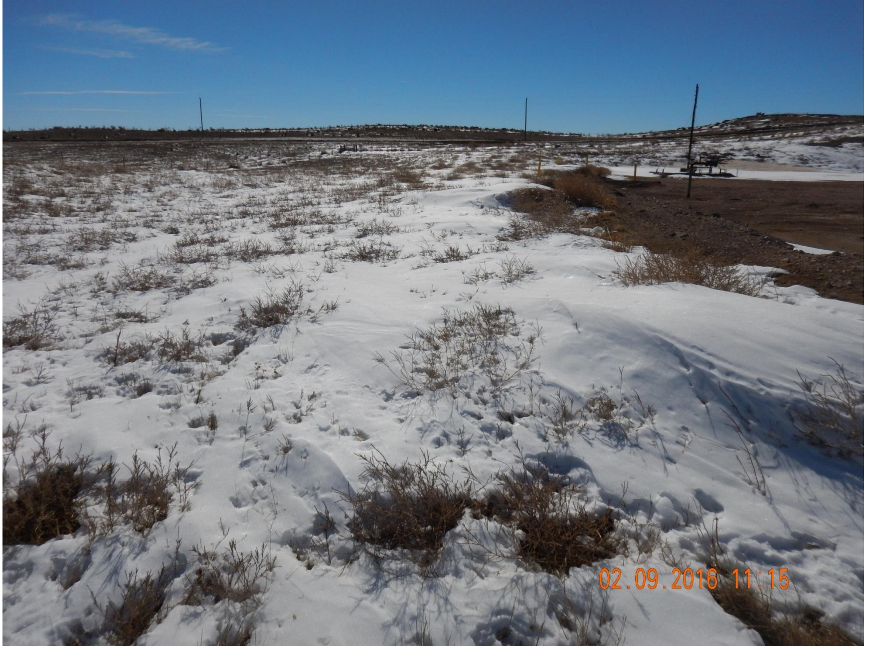
Figure 2: Photo taken from northeast end of location, facing south. Photo of interim and project areas.