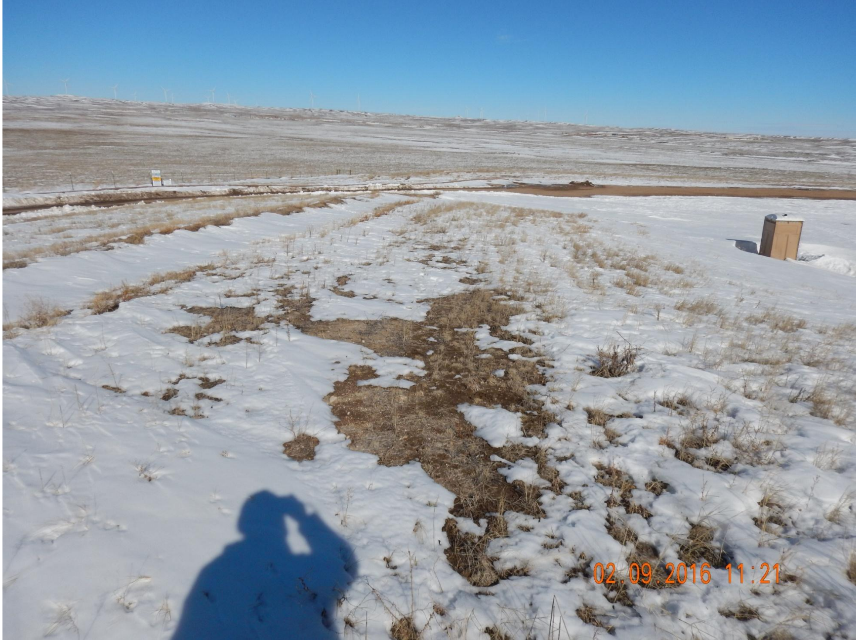
Figure 10: Photo taken from southwest end of location, facing north. Photo shows interim and project area, and stormwater berm.