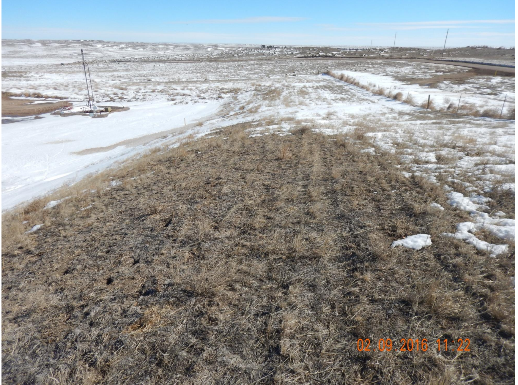
Figure 13: Photo taken from northern end of location, facing east. Photo shows vegetation on interim area.