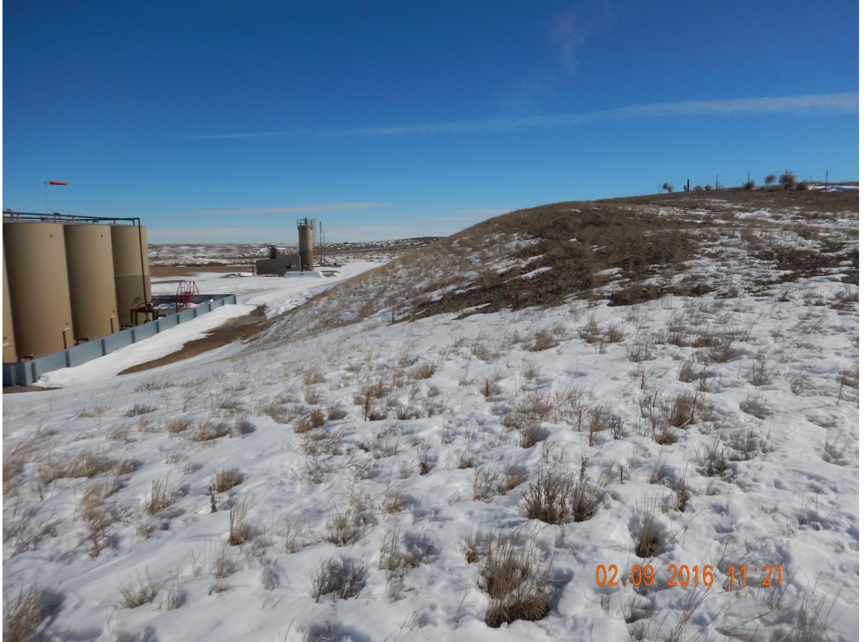
Figure 11: Photo taken from southwest end of location, facing east. Photo of interim and project areas.