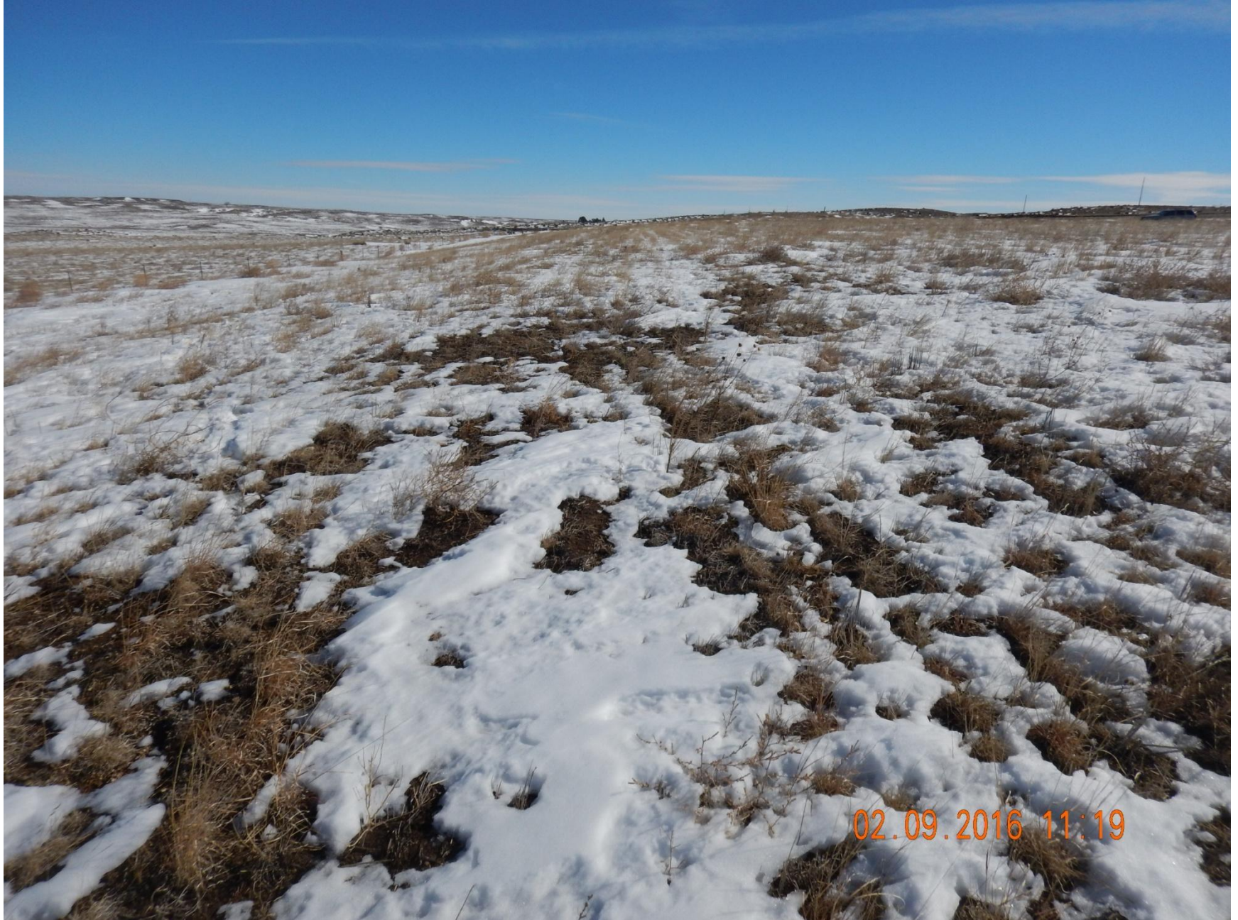
Figure 6: Photo taken from northwest end of location, facing east. Photo of interim and project areas.