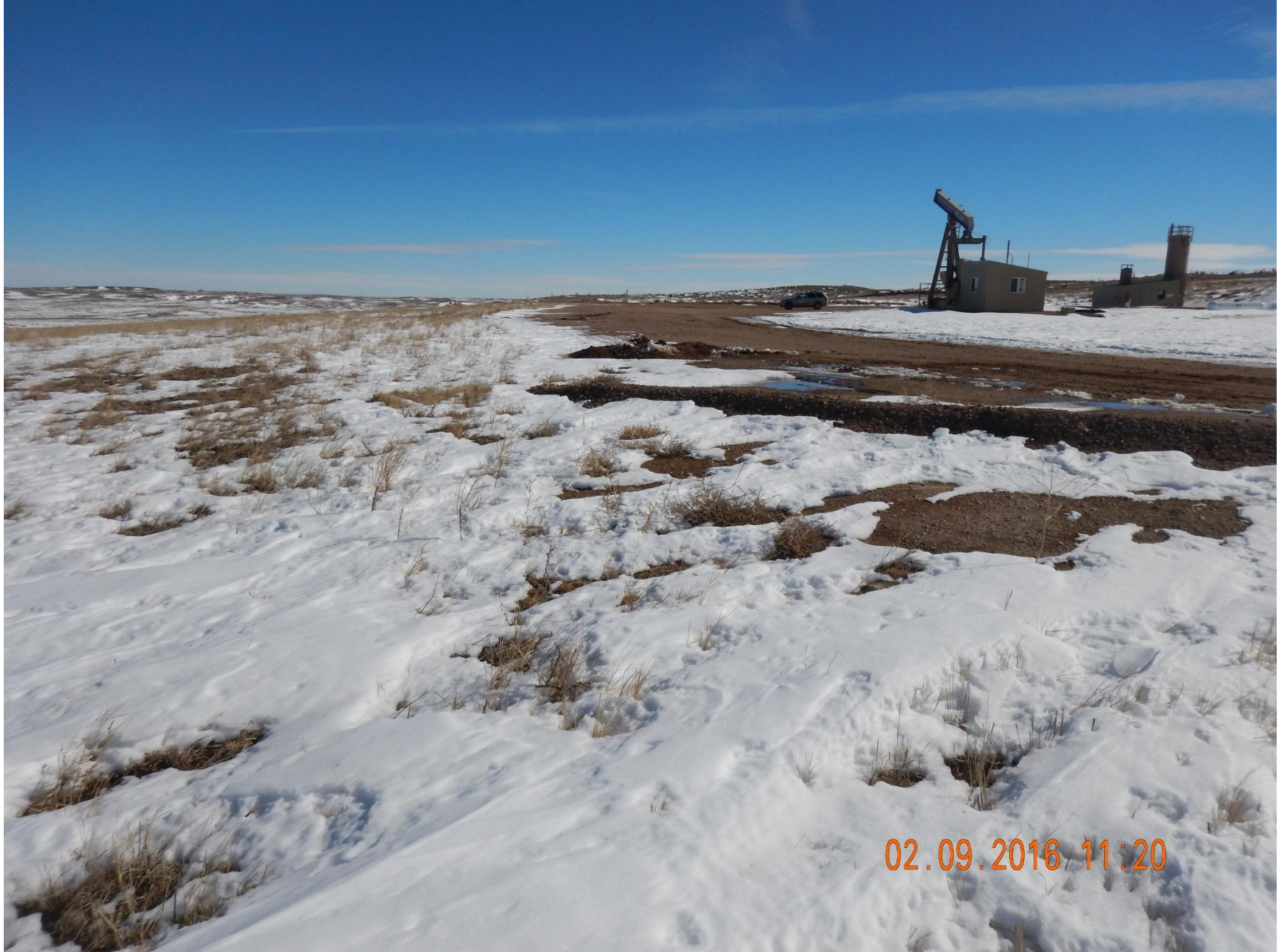
Figure 7: Photo taken from northwest end of location, facing west. Photo of interim, project areas and stormwater control berm.