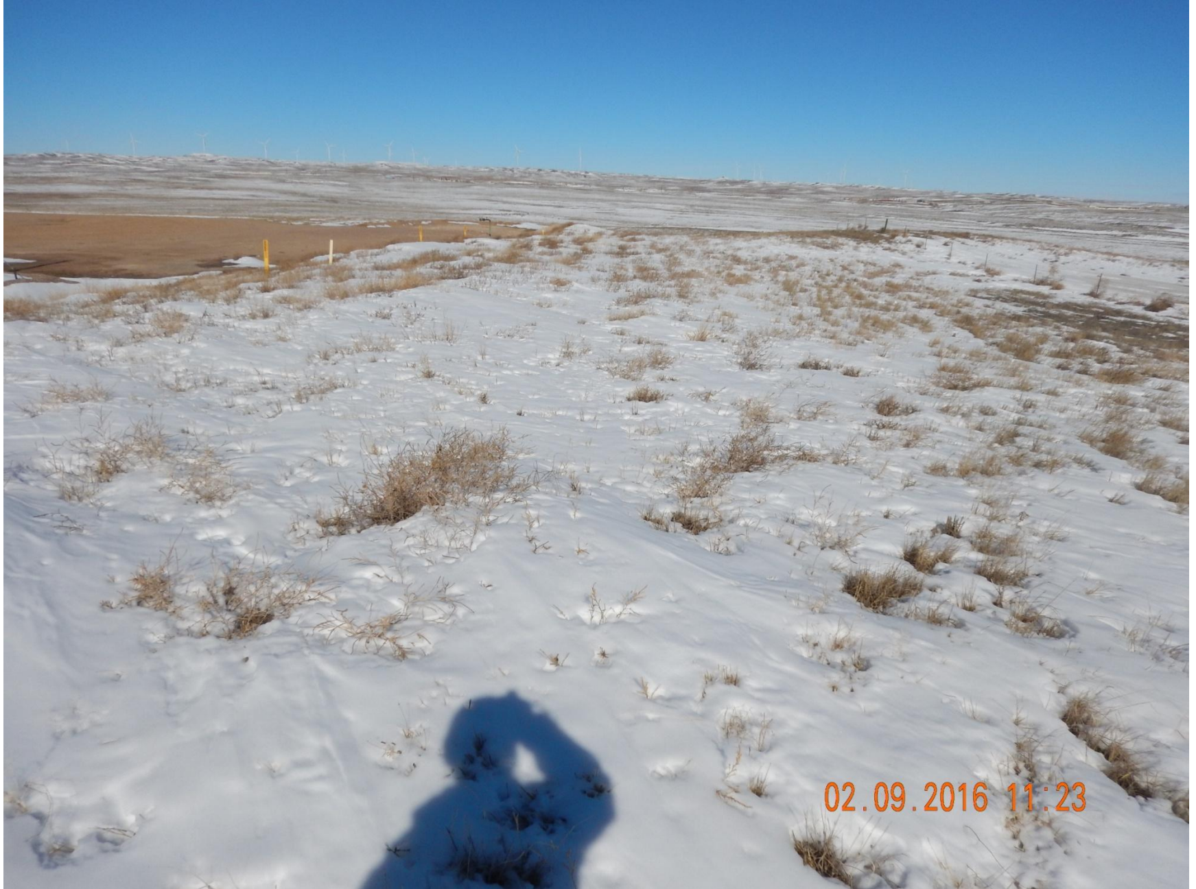
Figure 14: Photo taken from the southeast end of location, facing north. Photo of interim and project areas.