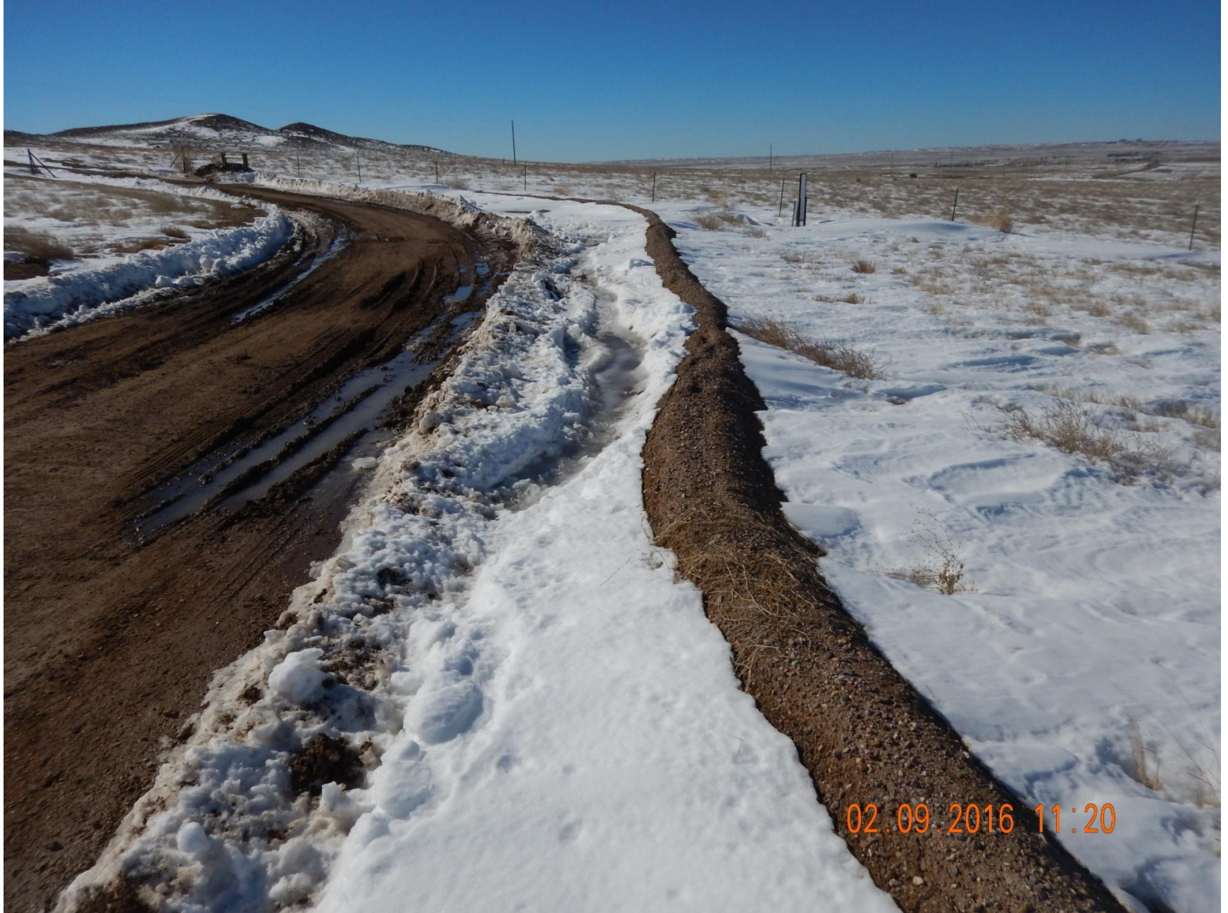
Figure 8: Photo taken from west end of location, facing west. Photo of stormwater control berm.