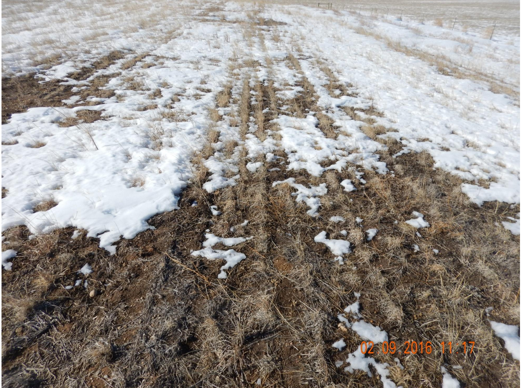
Figure 4: Photo taken from north end of location, facing west. Photo of vegetation on interim area.