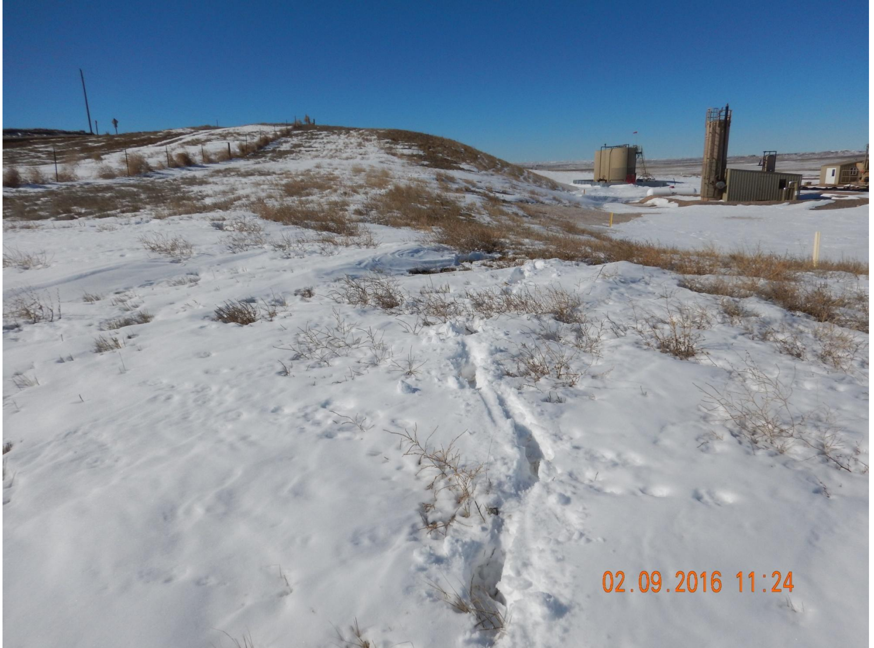
Figure 15: Photo taken from the southeast end of location, facing west. Photo of interim and project areas.