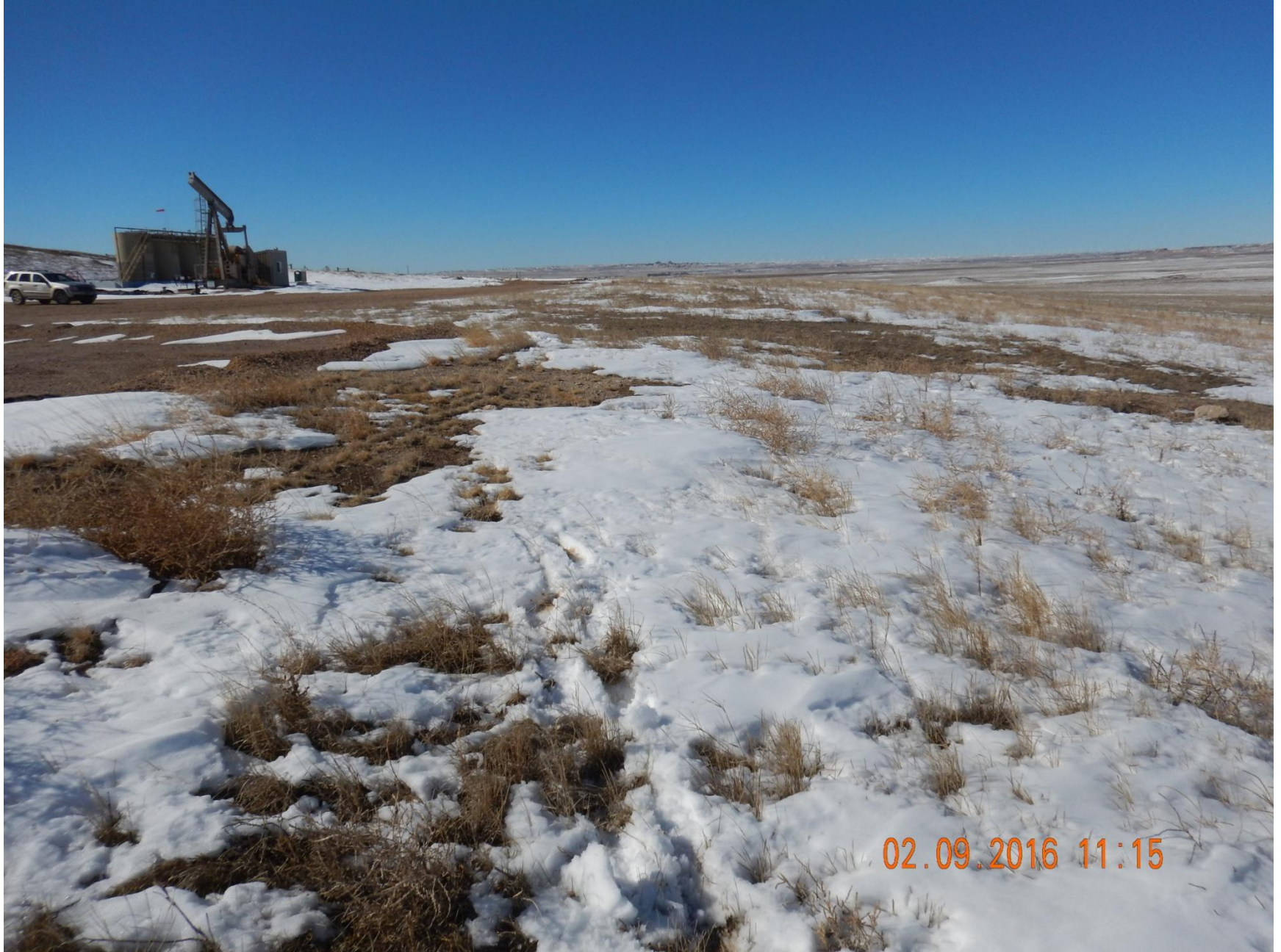
Figure 3: Photo taken from northeast end of location, facing west. Photo of interim and project areas.