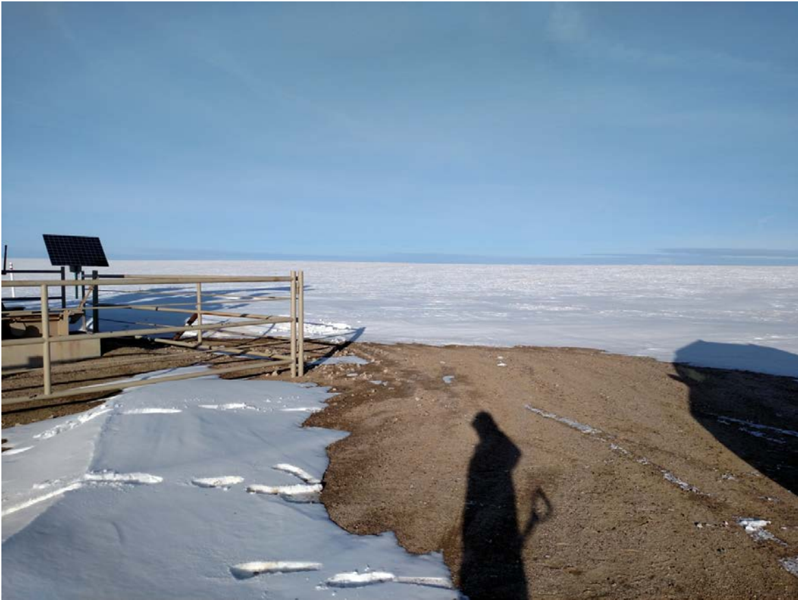
Figure 3 – Southeast part of well pad.