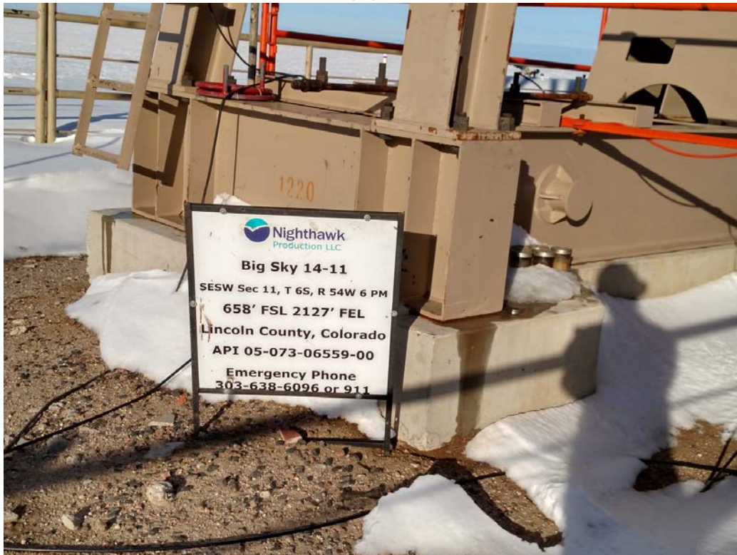
Figure 1 – Lease sign.