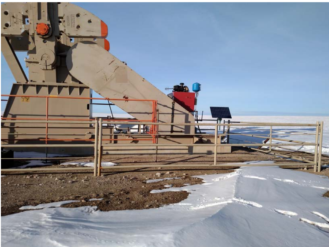
Figure 2 – From south of well looking north.