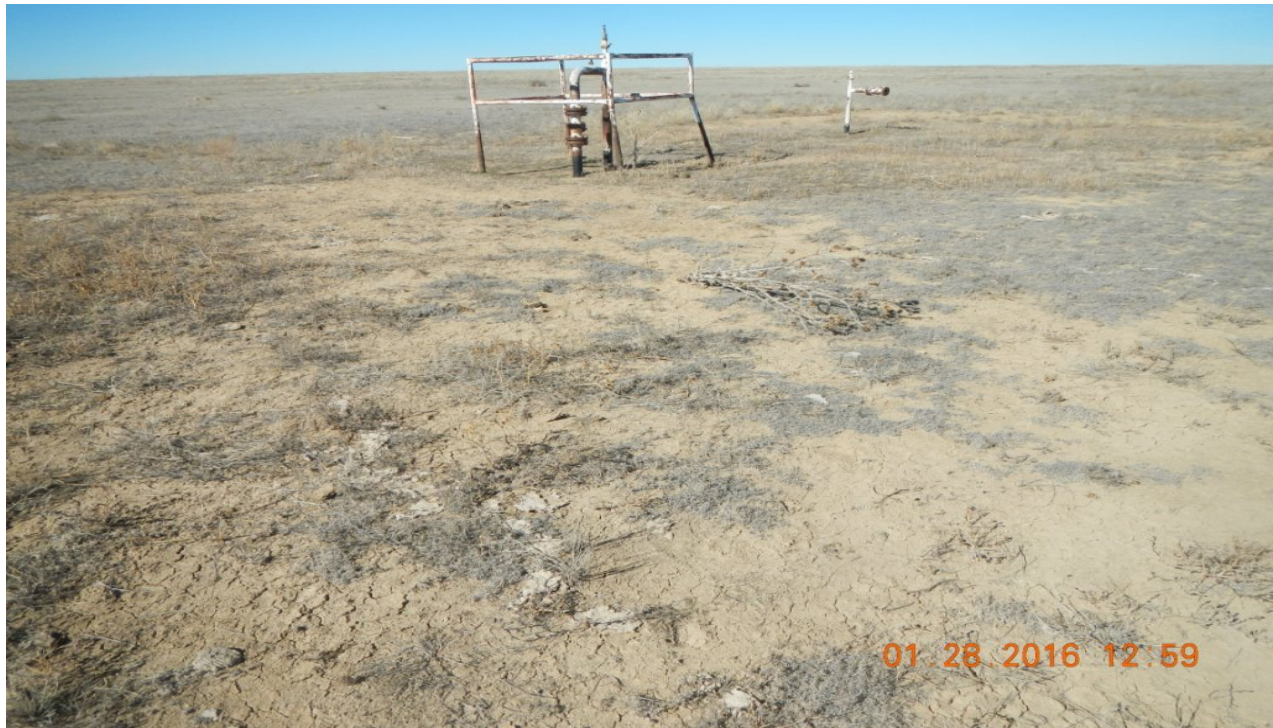
photo 7: One of three pipe risers that remain at the location. Lat/Long:37.87777,-102.72652.