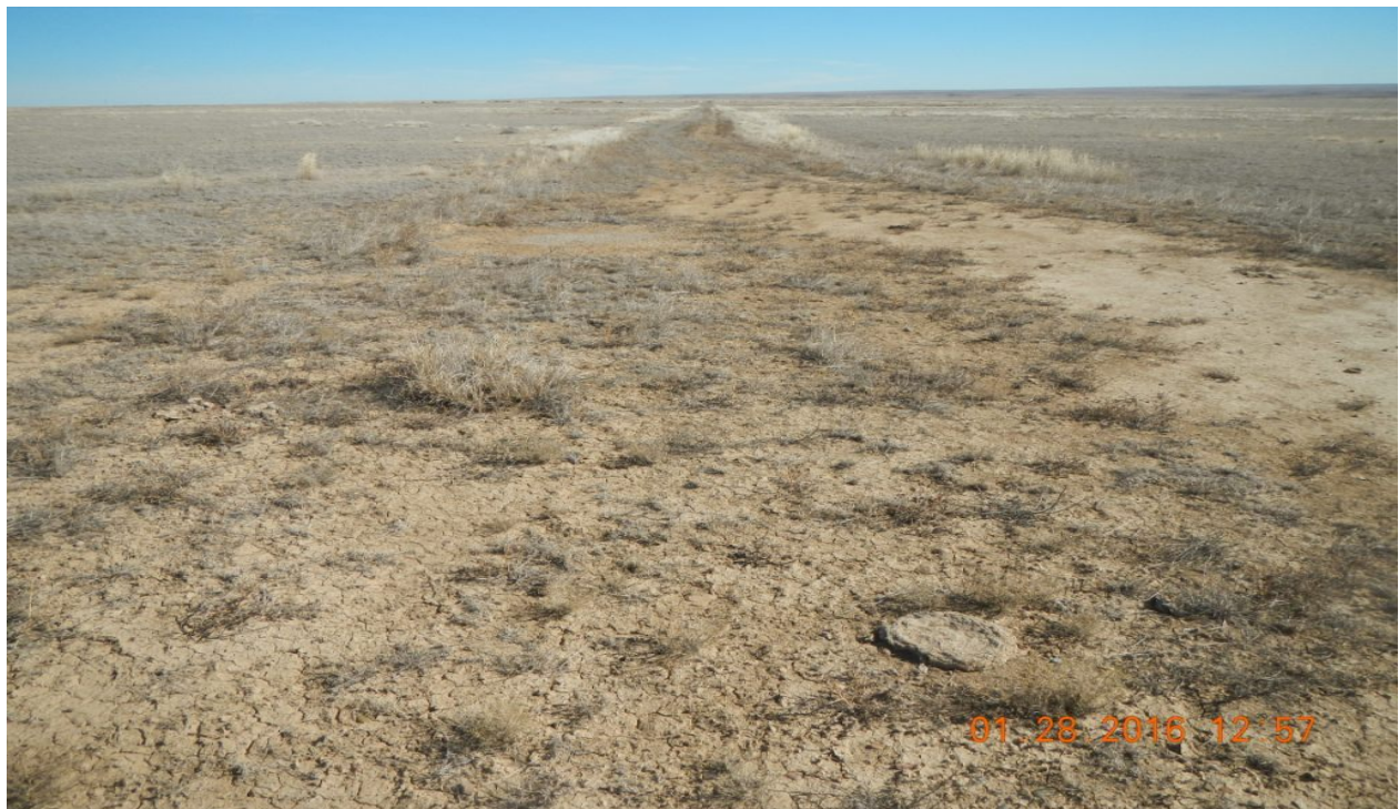
photo 4: East side of the location facing east toward the access road.