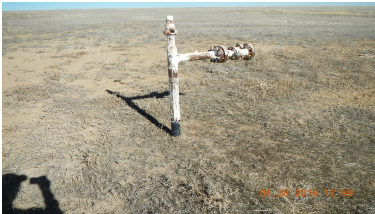
photo 8: One of three pipe risers that remain at the location. Lat/Long:37.87786,-102.72713.