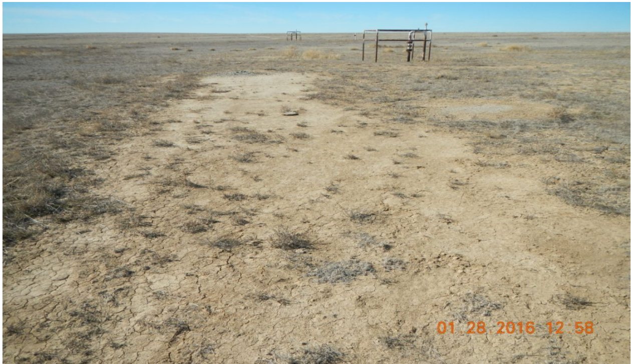
photo 5: East side of the location facing west. Note: vegetation has not established in this