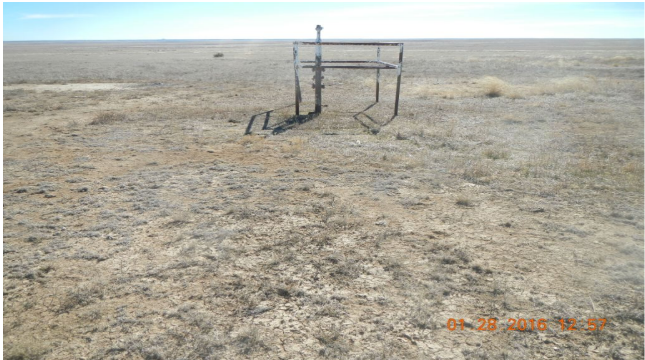
photo 3: One of three pipe risers that remain at the location. Lat/Long:37.87791,-102.72652.