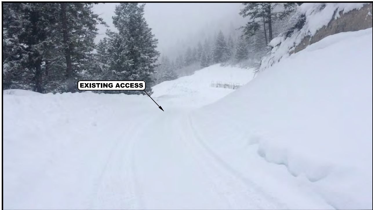
PHOTO: VIEW OF EXISTING ACCESS