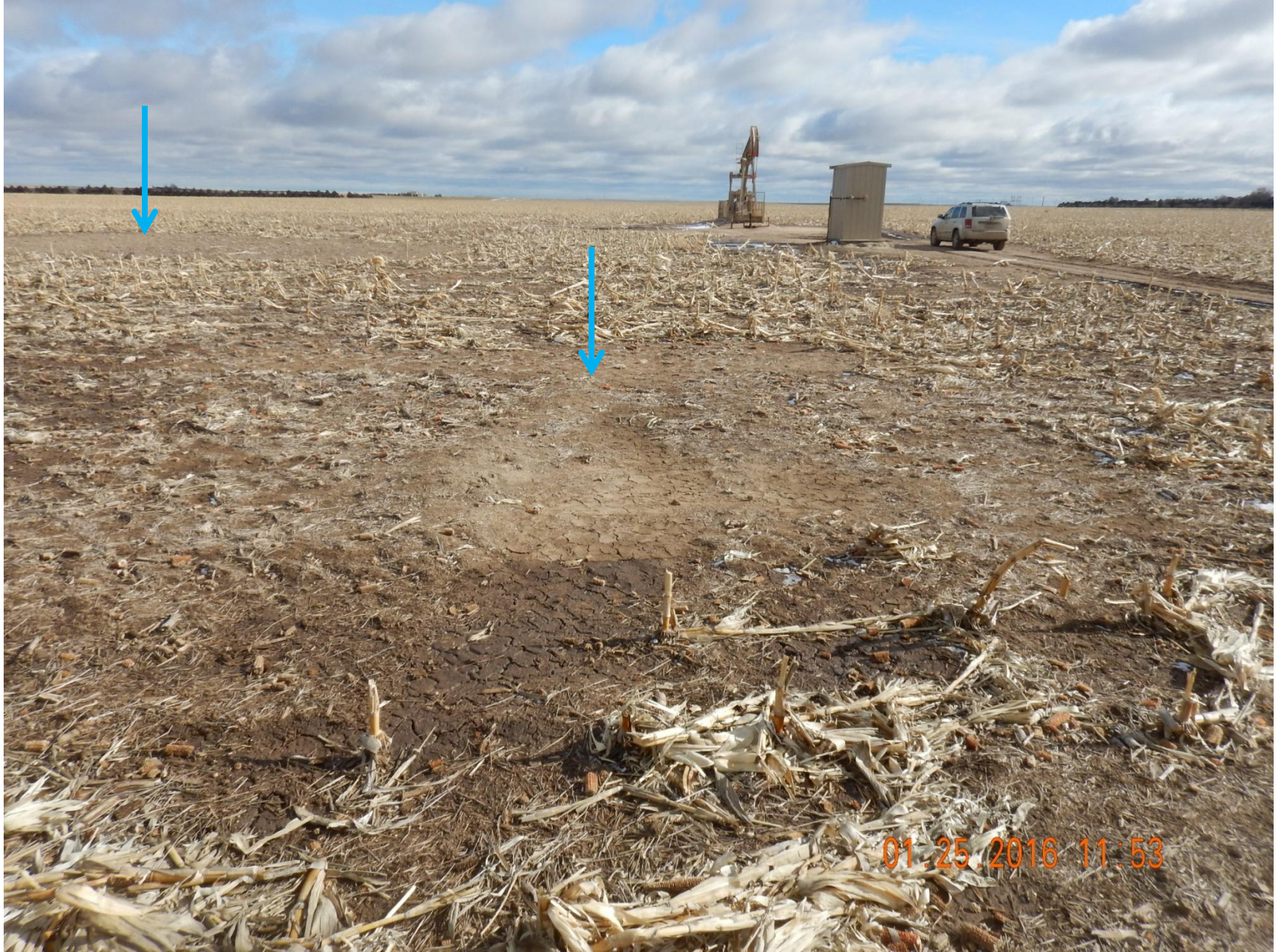
Figure 6: Photo taken west of location, facing east. Photo shows portions of the interim area with sparse vegetation and exposed soil (indicated by arrow).