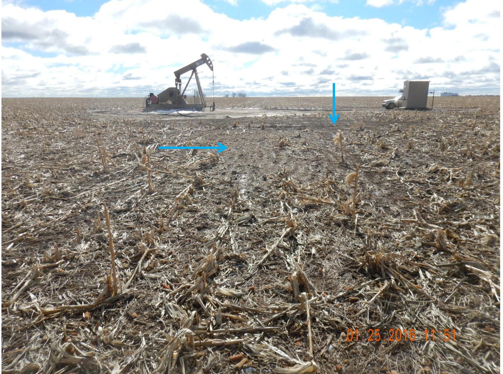
Figure 3: Photo taken north of location, facing south. Photo shows portions of the interim area with sparse vegetation and exposed soil (indicated by arrow).