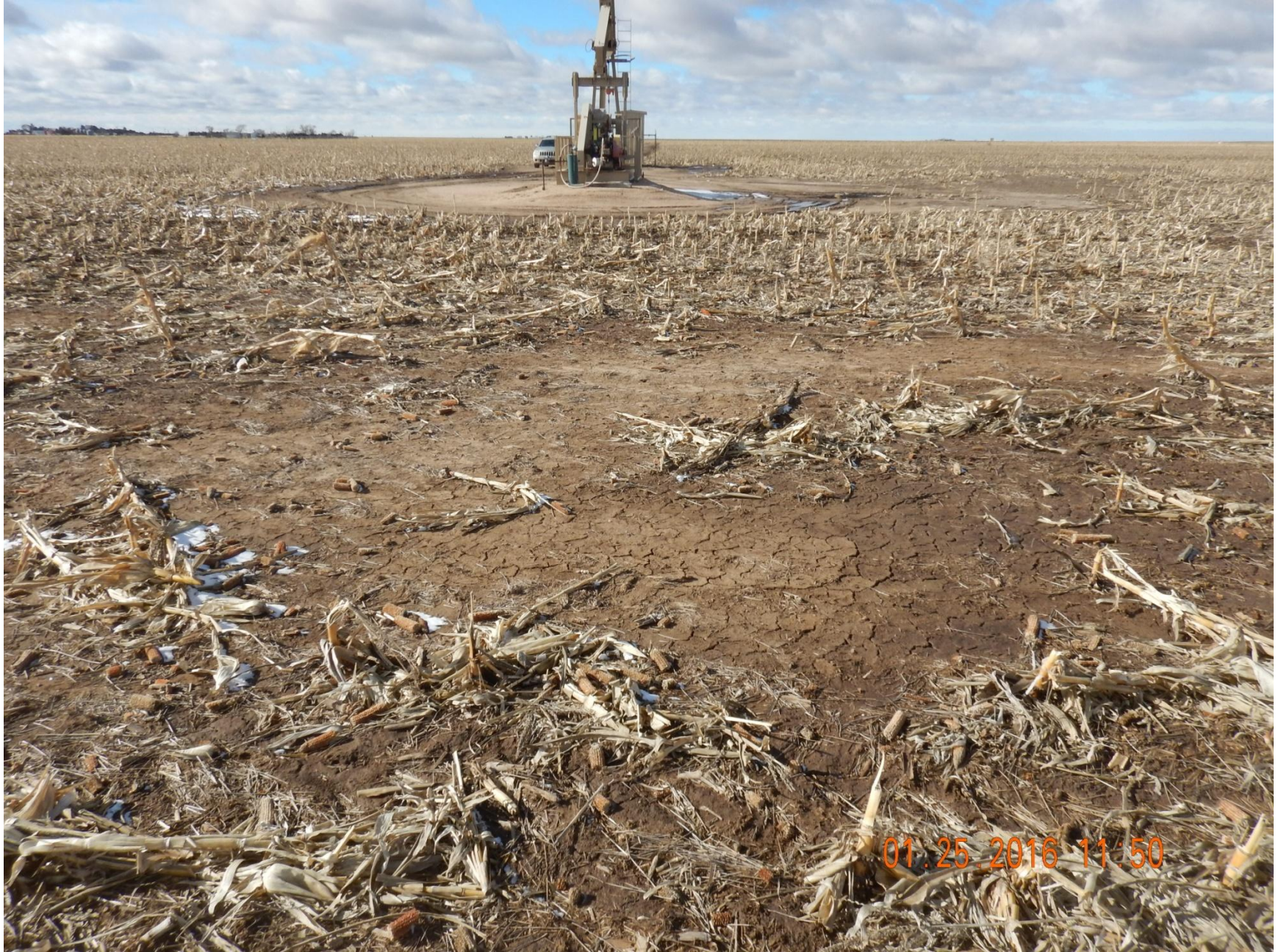
Figure 2: Photo taken east of location, facing west. Photo shows portions of the interim area with sparse vegetation and exposed soil.