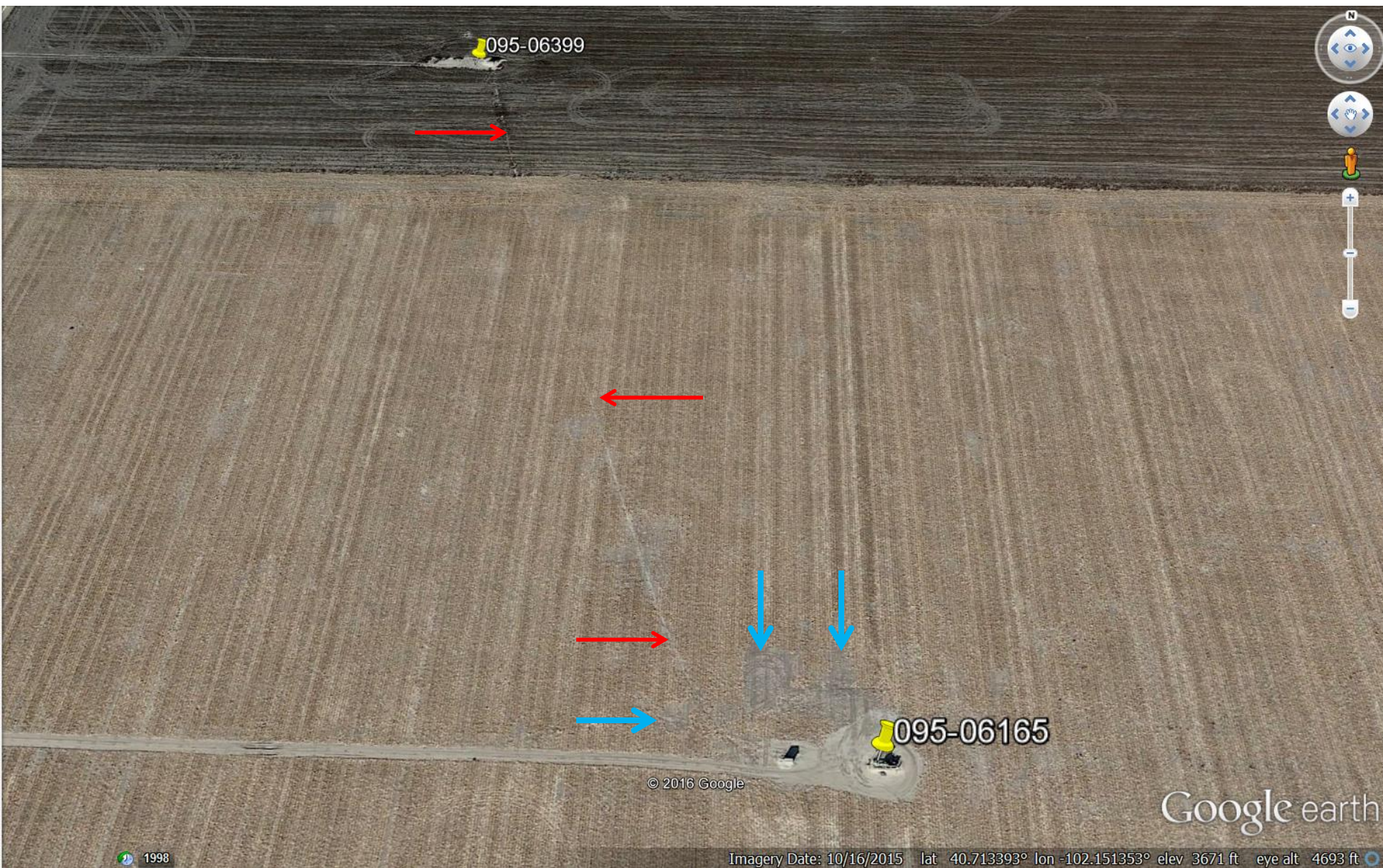
Figure 7: Aerial image of wells 095-06165 and 095-06399. Blue arrows indicates portions of interim area with sparse cover and bare soil. Red arrow indicates pipeline between wells with subsidence concerns.