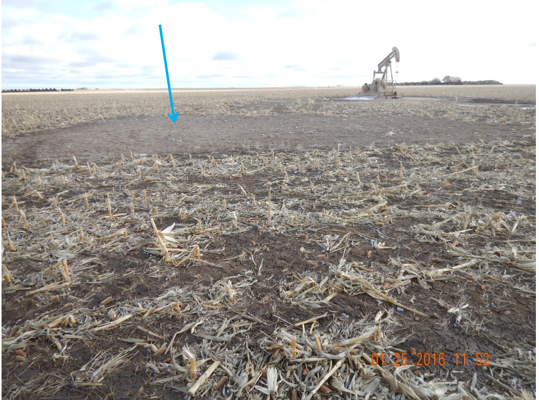
Figure 5: Photo taken northwest of location, facing east. Photo shows portions of the interim area with sparse vegetation and exposed soil (indicated by arrow).