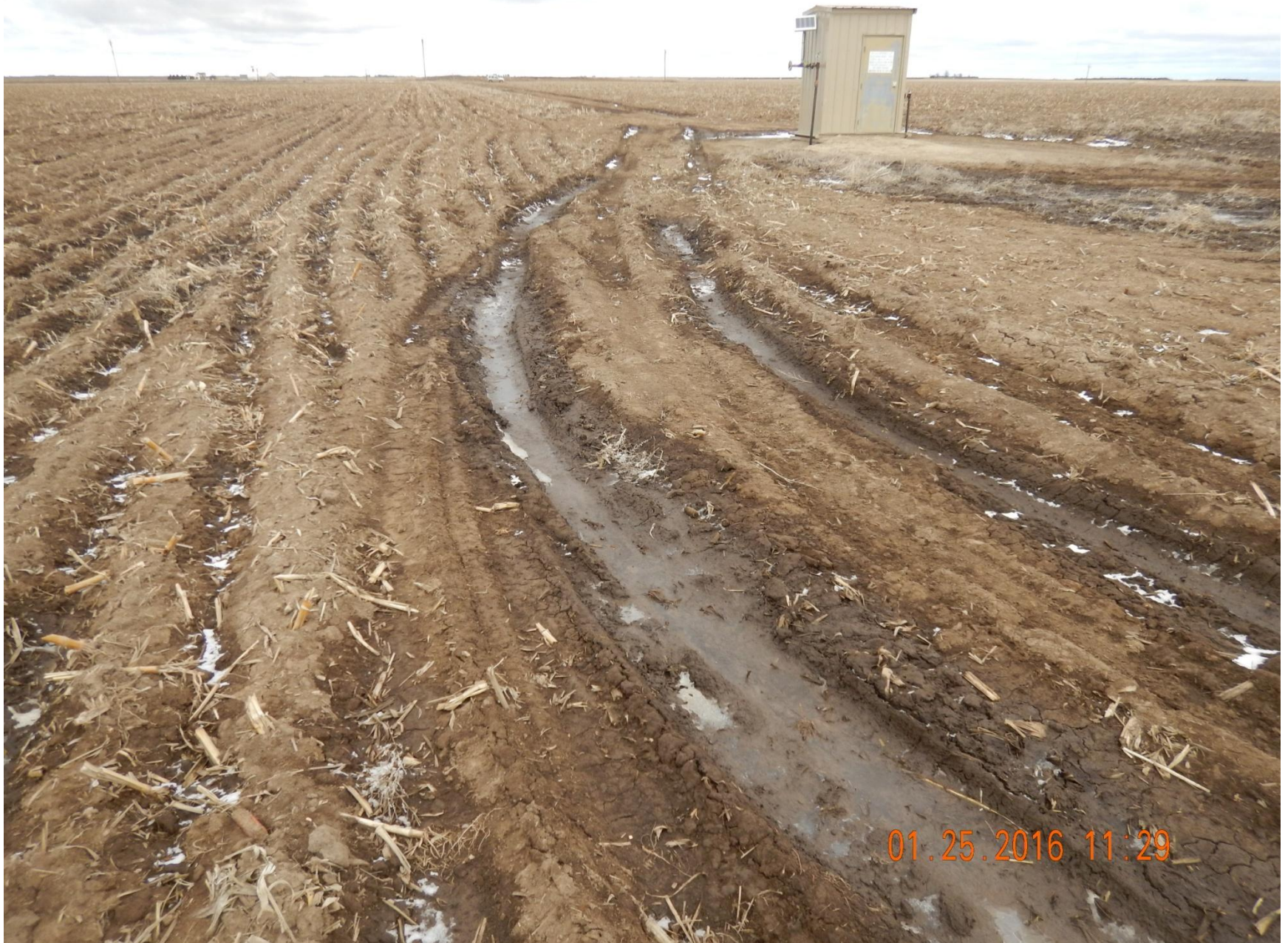
Figure 3: Photo taken from the west end of location, facing north. Photo deep ruts beginning to form on location.