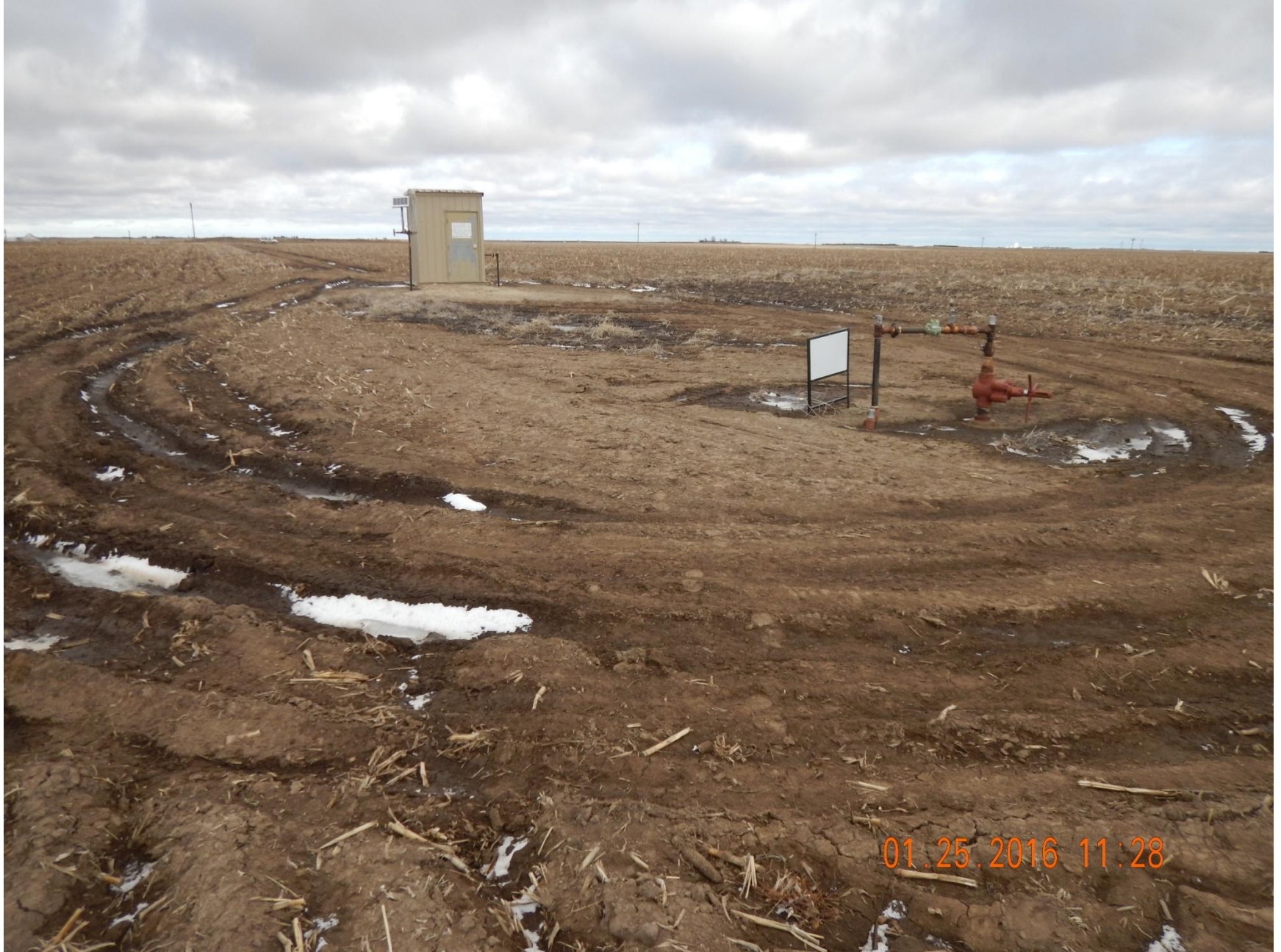
Figure 2: Photo taken south of location, facing north. Photo shows interim and project areas.