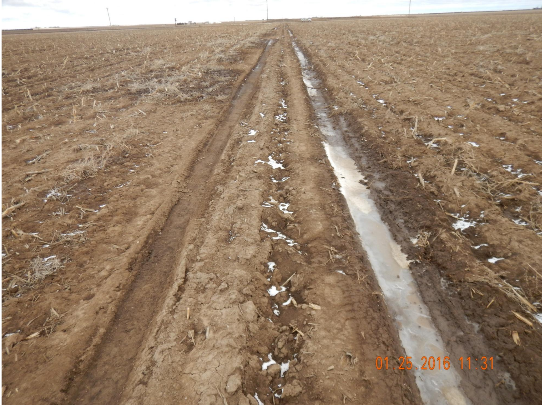
Figure 5: Photo taken north of location, facing south. Photo shows large ruts forming in access road.