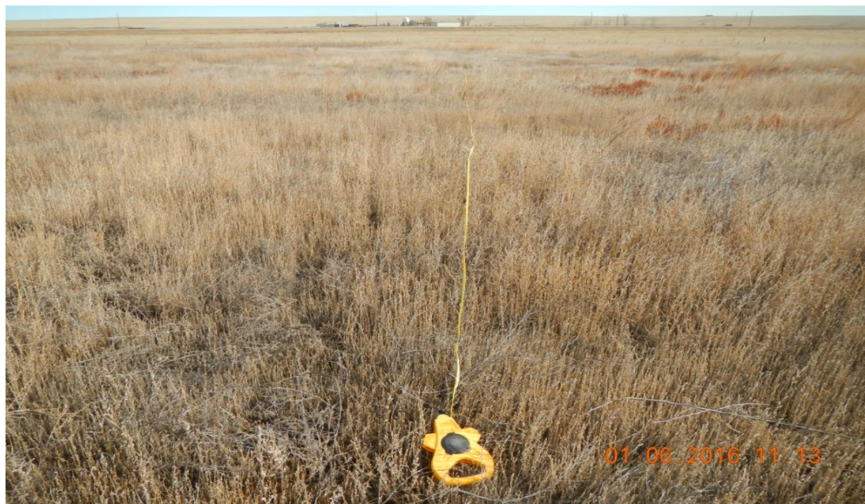
photo 5: End of the vegetation transect facing southeast at the location.