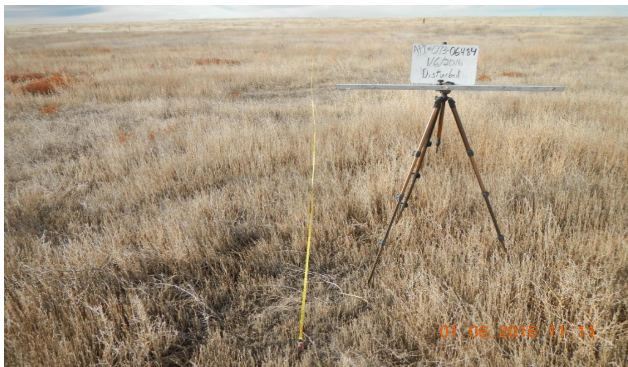
photo 1: Beginning of the vegetation transect facing northwest at the location.