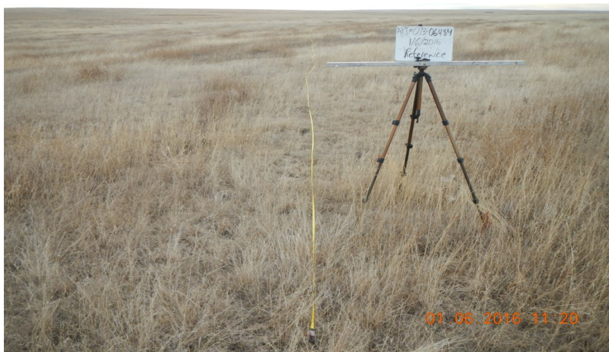
photo 6: Beginning of the vegetation transect facing southeast at reference area.