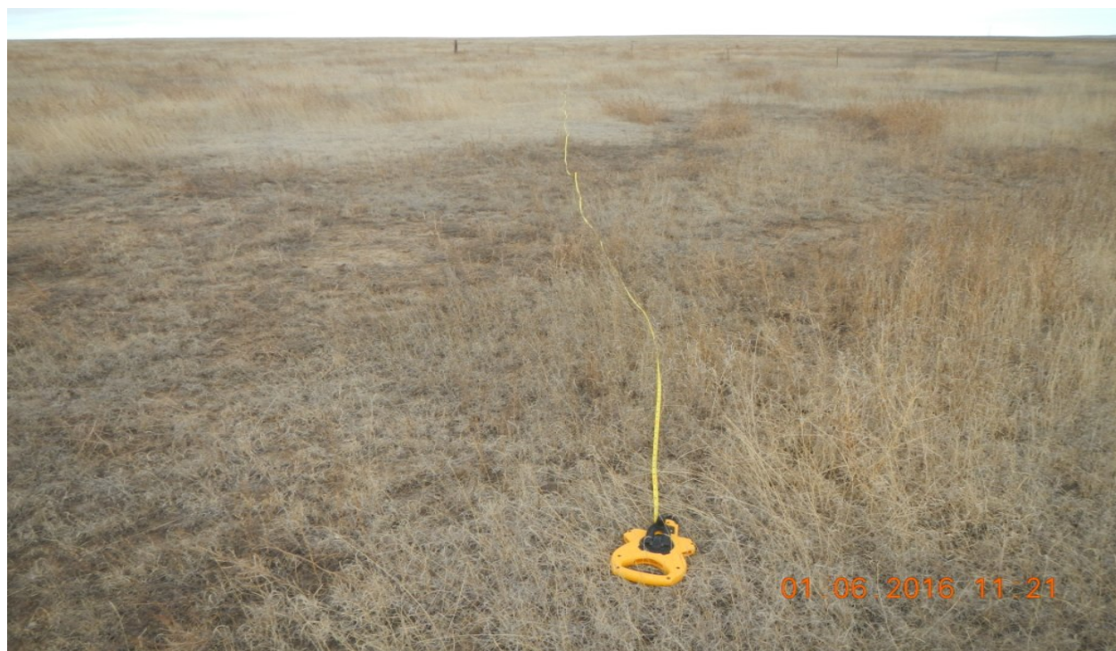
photo 10: End of the vegetation transect facing northeast at the reference area.