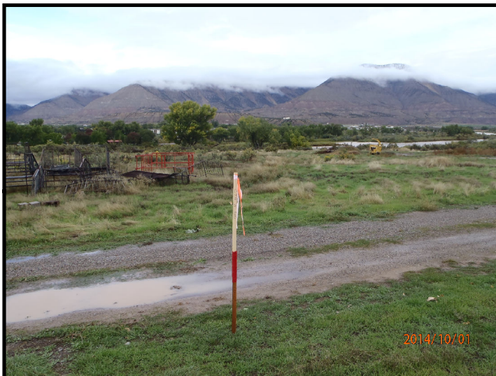
BMC B Looking West