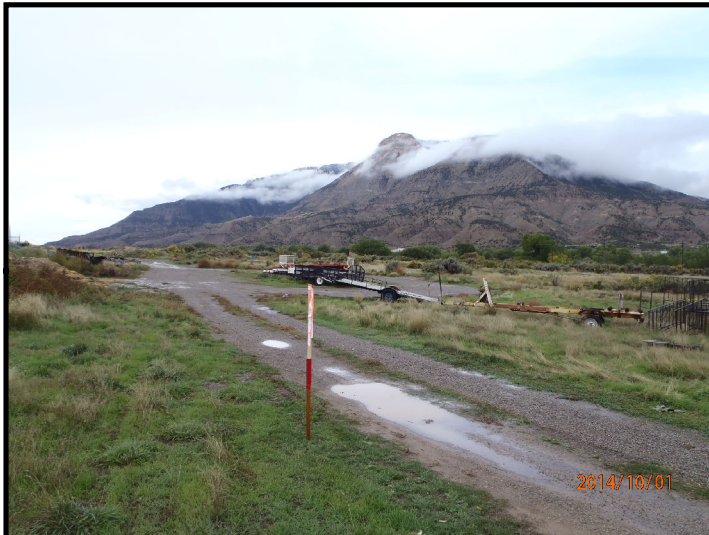
BMC B Looking North