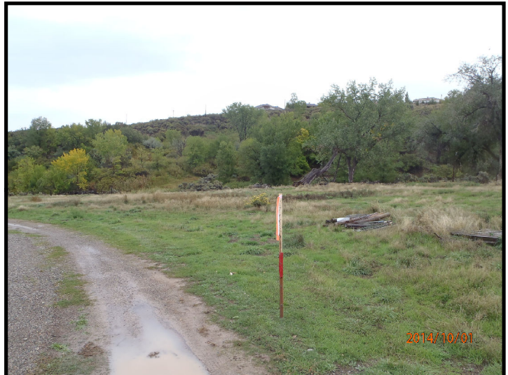
BMC B Looking East