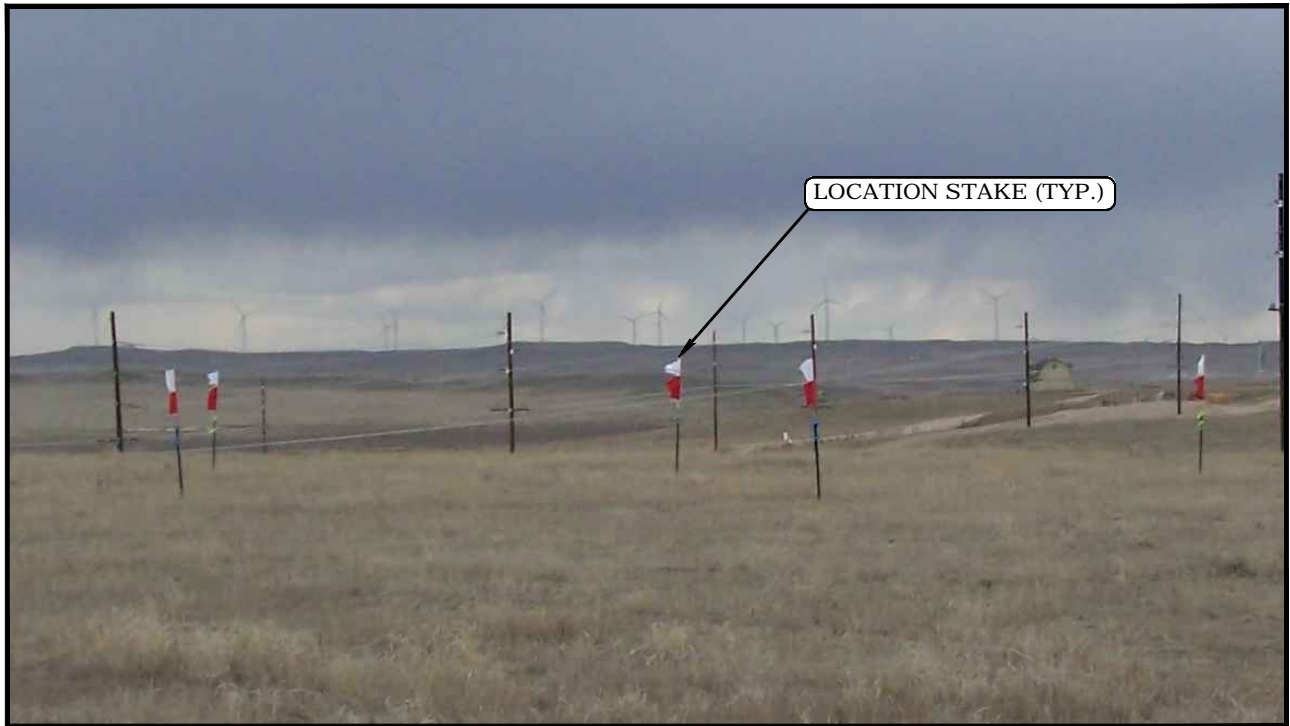
PHOTO: VIEW OF LOCATION STAKES