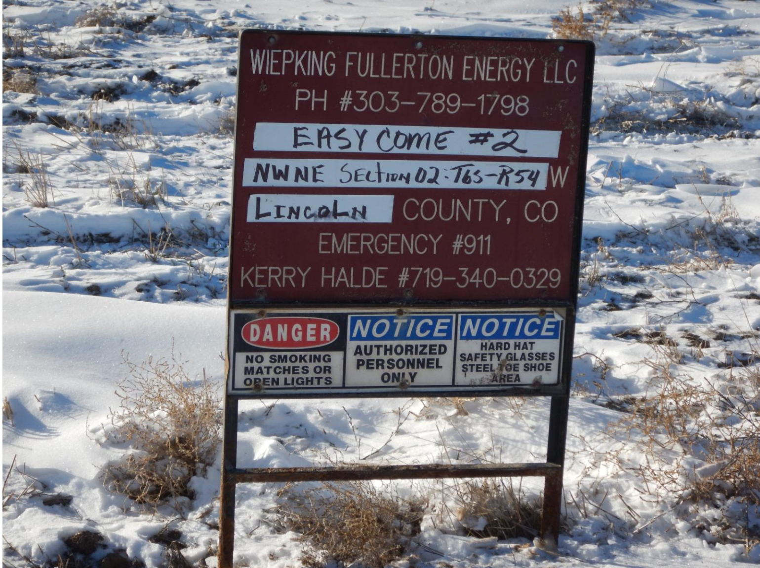
Figure 1: Photo of sign for Loc. ID 443145, on northern end of location