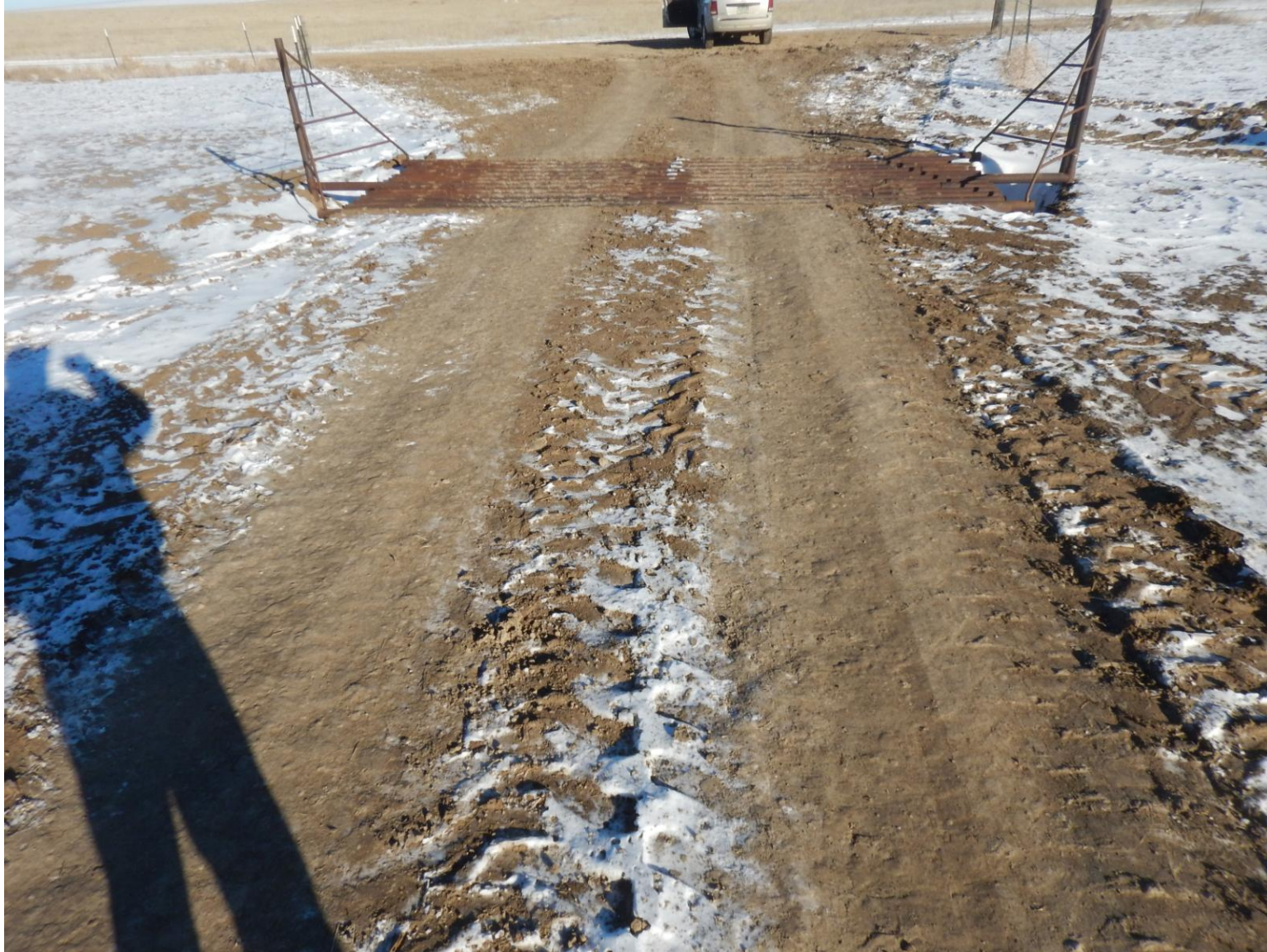
Figure 4: Photo taken from access road entrance, facing north.