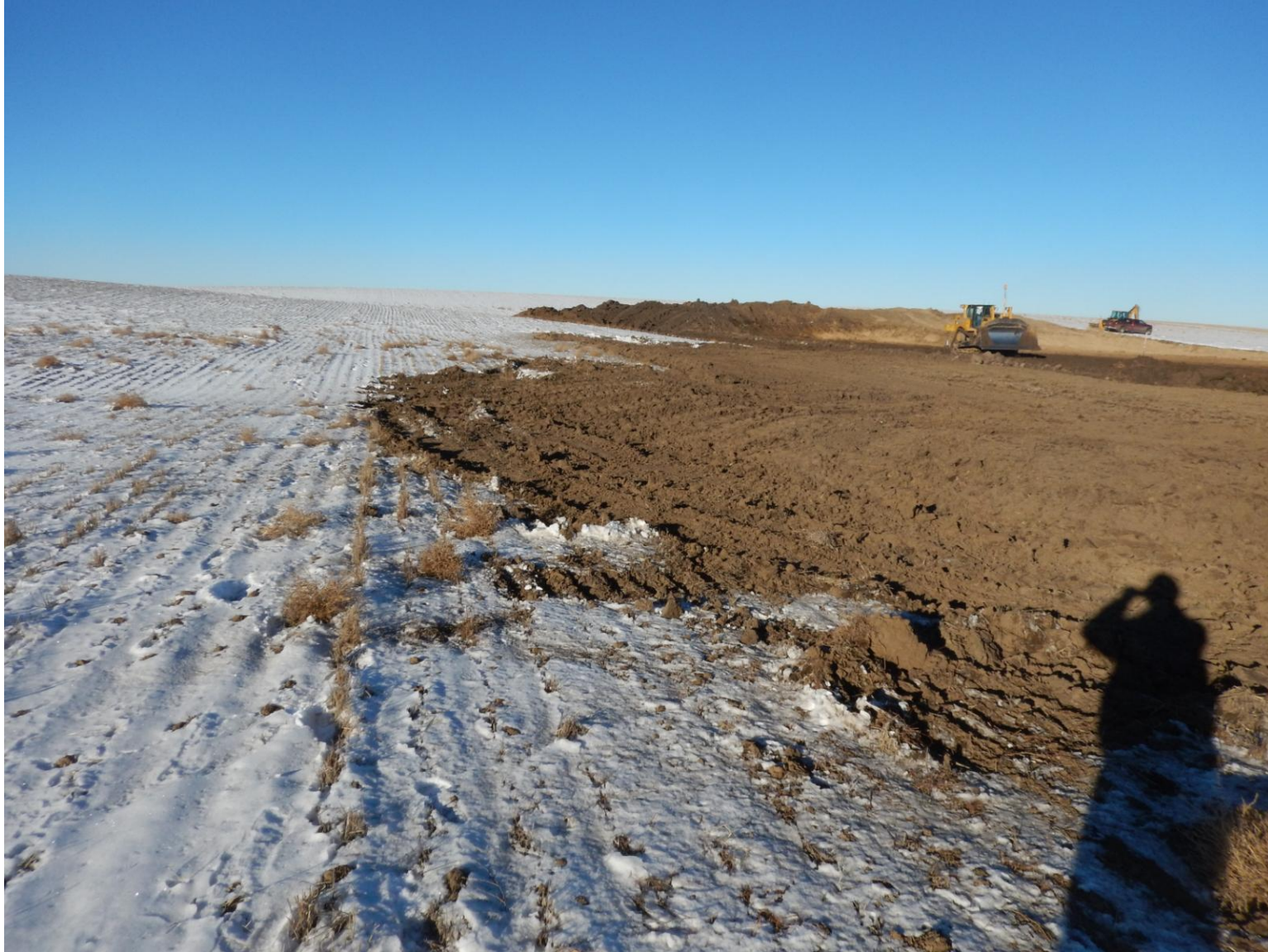
Figure 12: Photo taken from southeast corner of location, facing west.