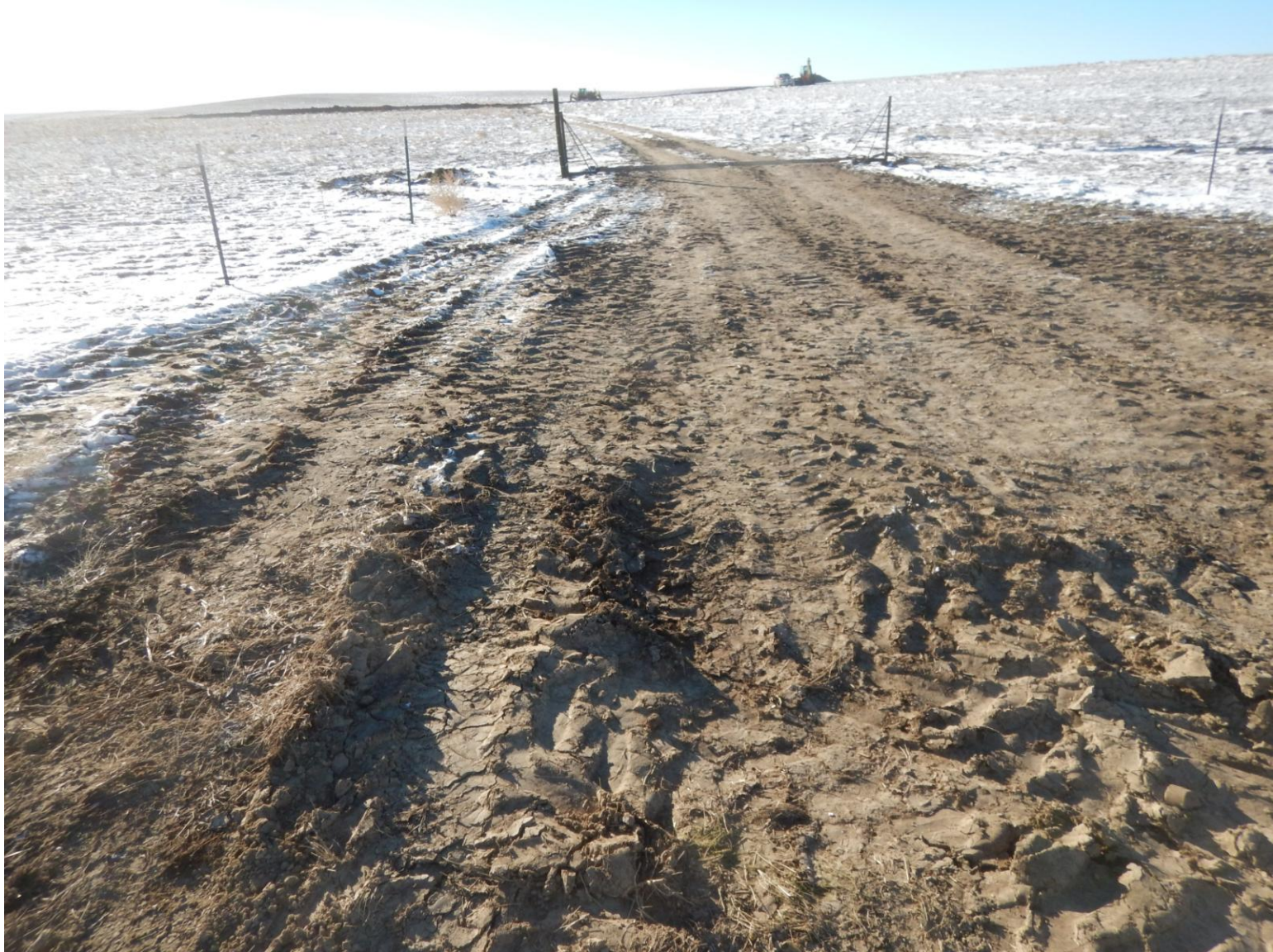
Figure 2: Photo taken from County Road 0 facing south. Photo shows access road entrance.