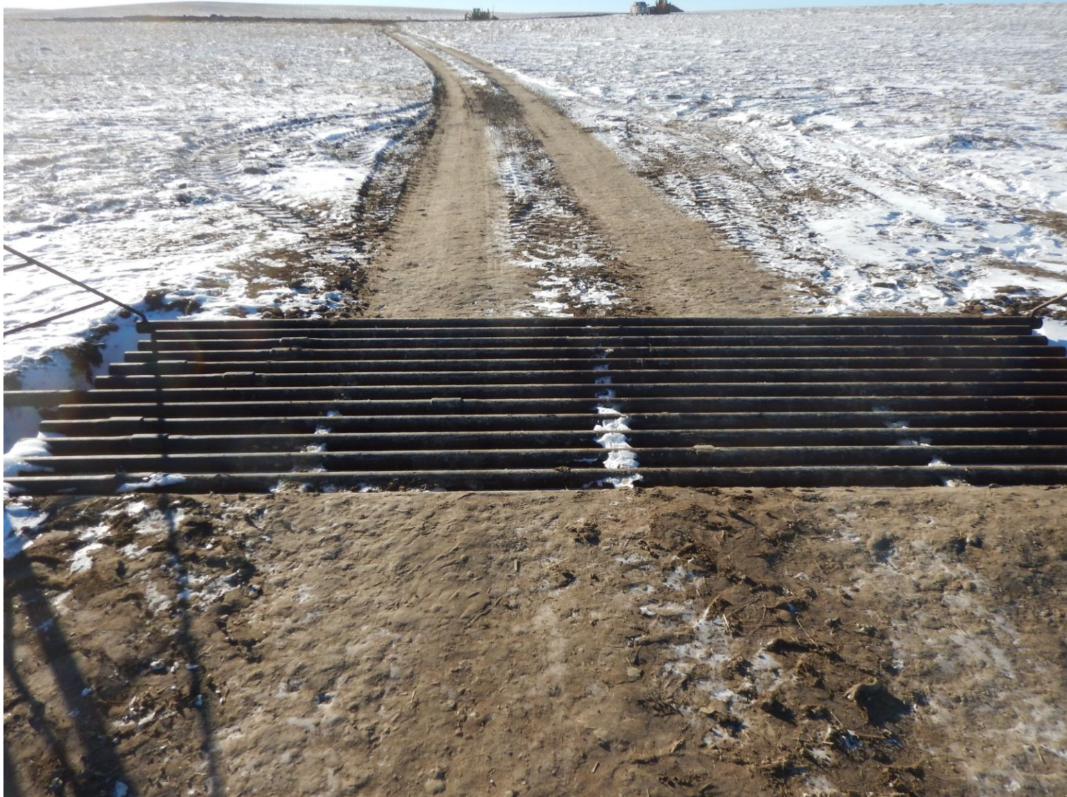
Figure 3: Photo taken from access road entrance, facing south.