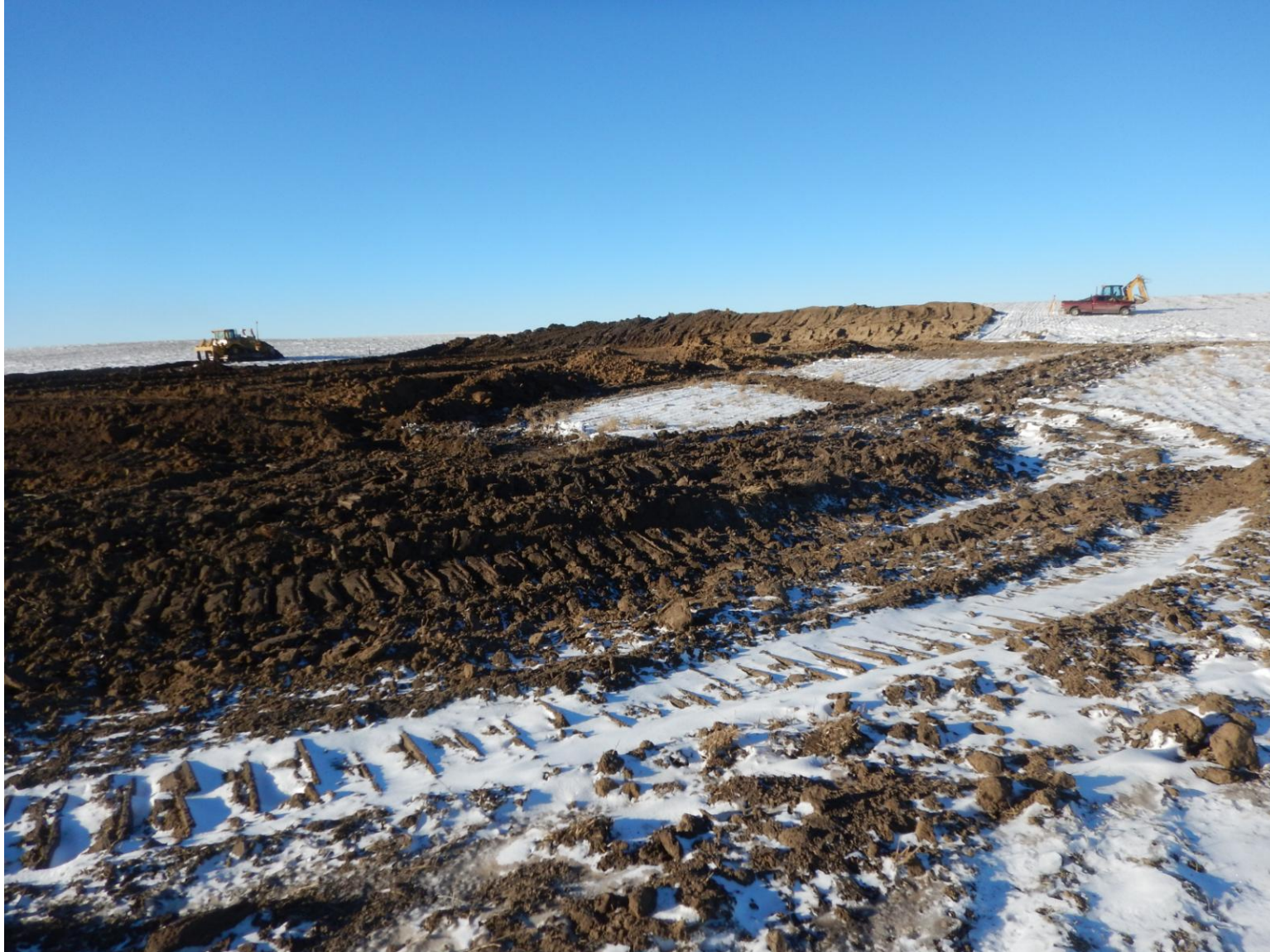
Figure 16: Photo taken from northeast corner of location, facing west. Photo shows disturbed areas exceeding stormwater BMPs.