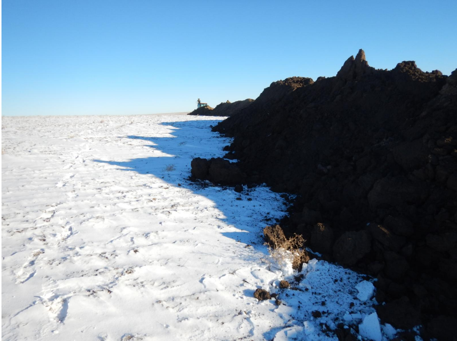
Figure 8: Photo taken from western end of location, facing north. Photo of topsoil berm being constructed. Photo shows insufficient stormwater BMPs for site on western end of location prior to construction activities. .