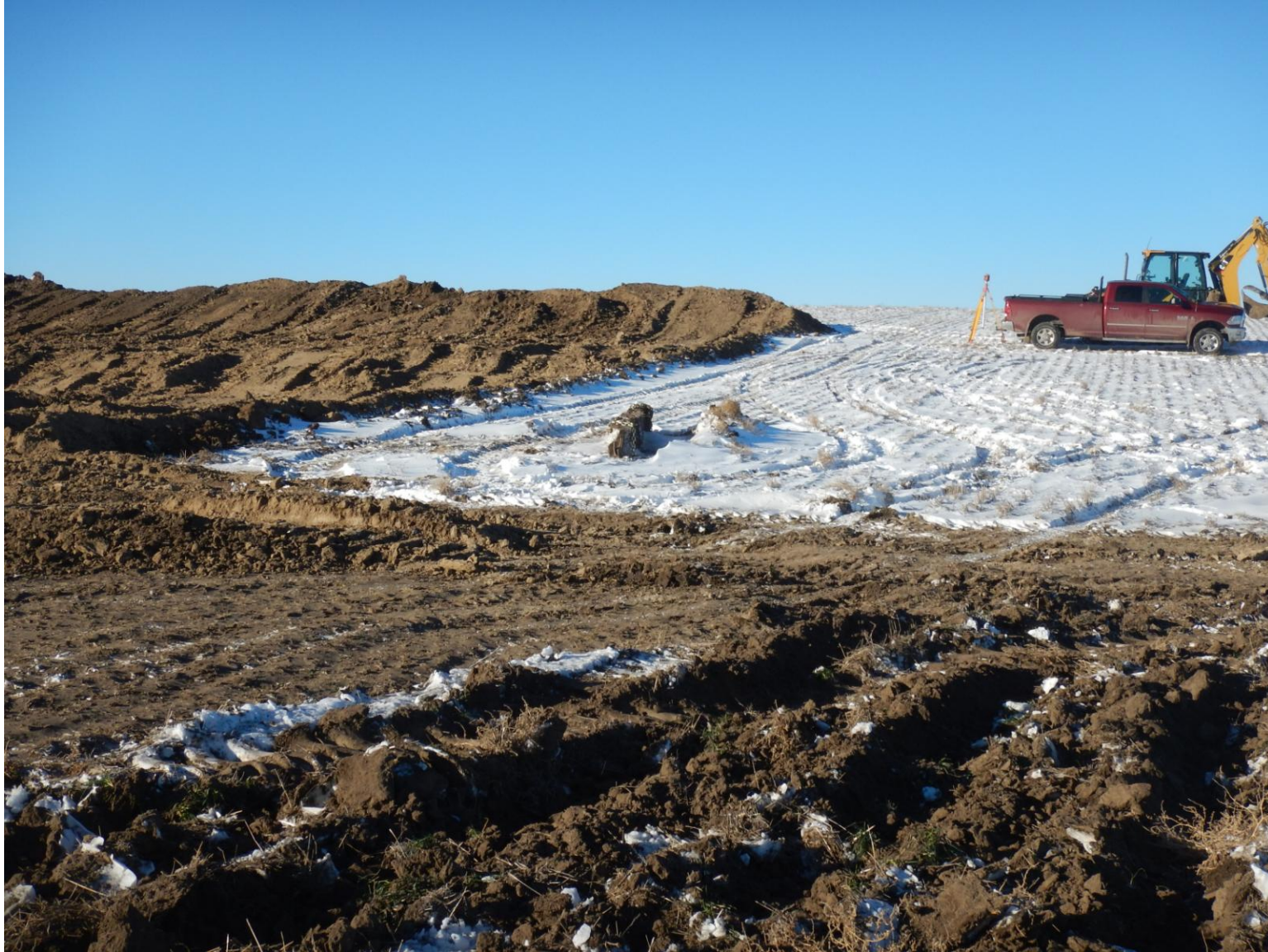
Figure 5: Photo taken from northern area of location, facing west. Photo shows insufficient stormwater BMPs on northwest portion of location prior to construction activities.