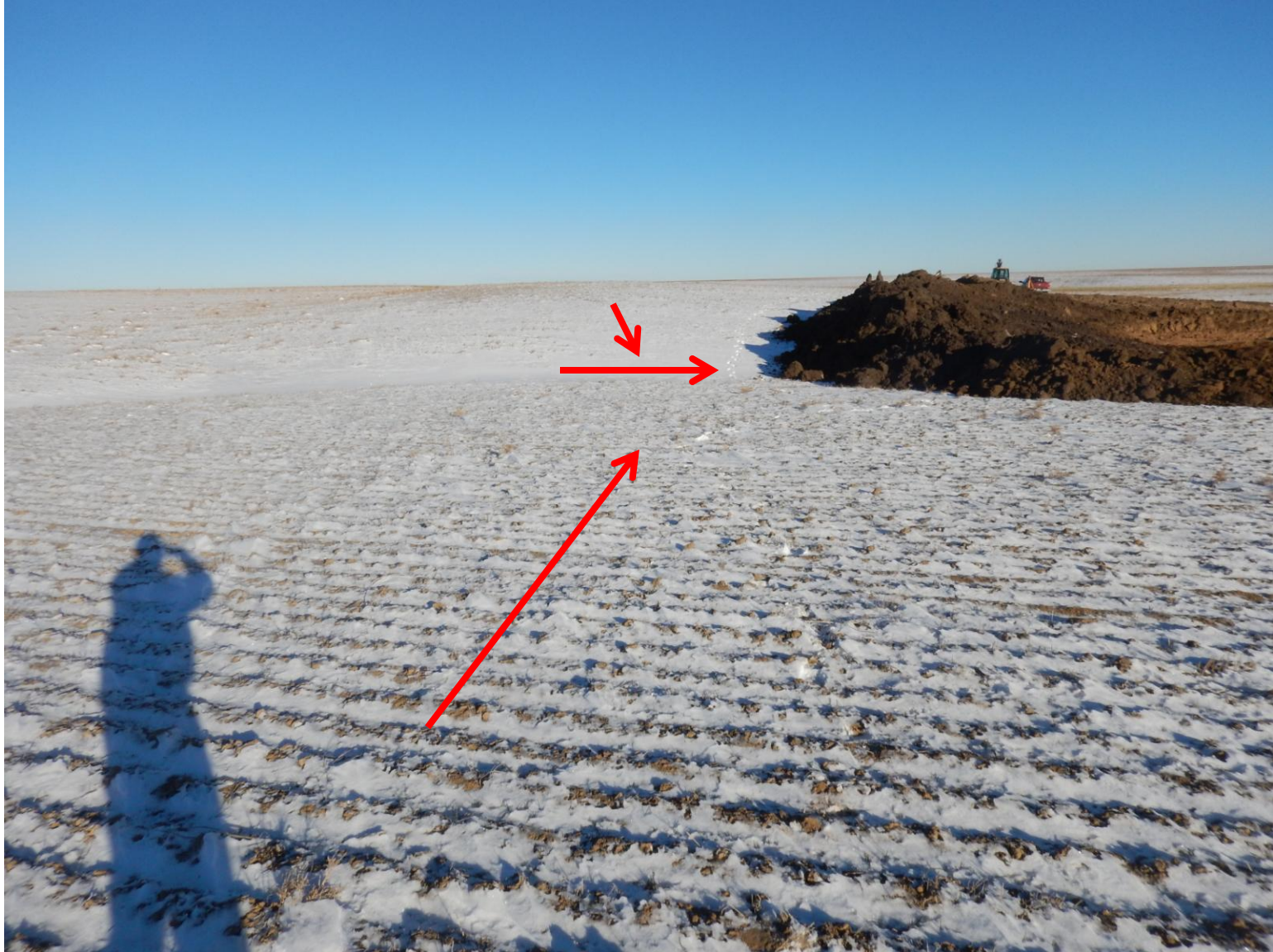
Figure 10: Photo taken from southwest corner of location, facing north. Photo shows insufficient stormwater BMPs for site on western end of location. Note location appears to be built within a drainage. Arrows indicate direction of slope.