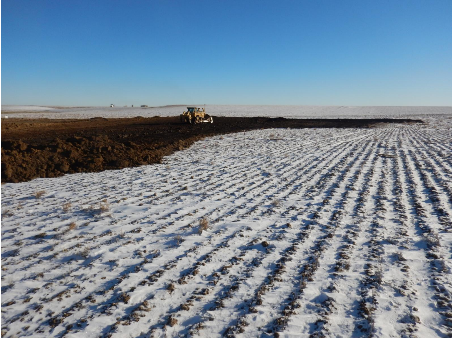
Figure 11: Photo taken from southwest corner of location, facing east. Photo of construction in process.