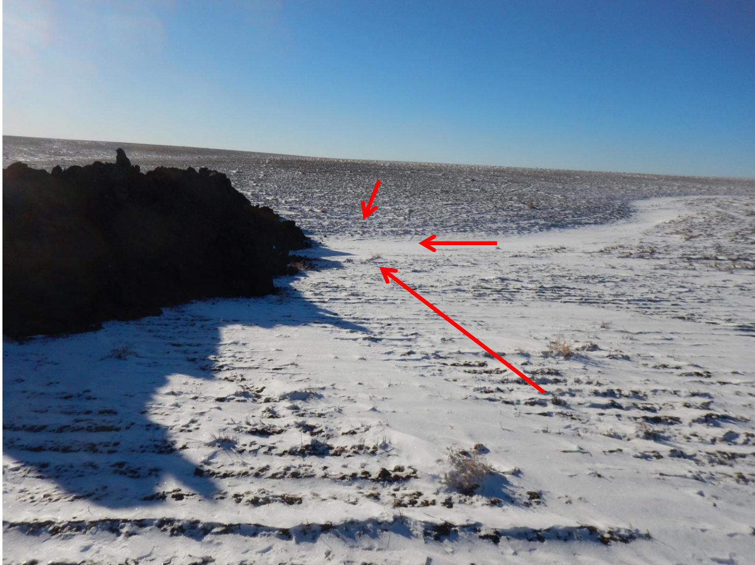
Figure 9: Photo taken from western end of location, facing south. Photo shows insufficient stormwater BMPs for site on western end of location. Note location appears to be built within a drainage. Arrows indicate direction of slope.