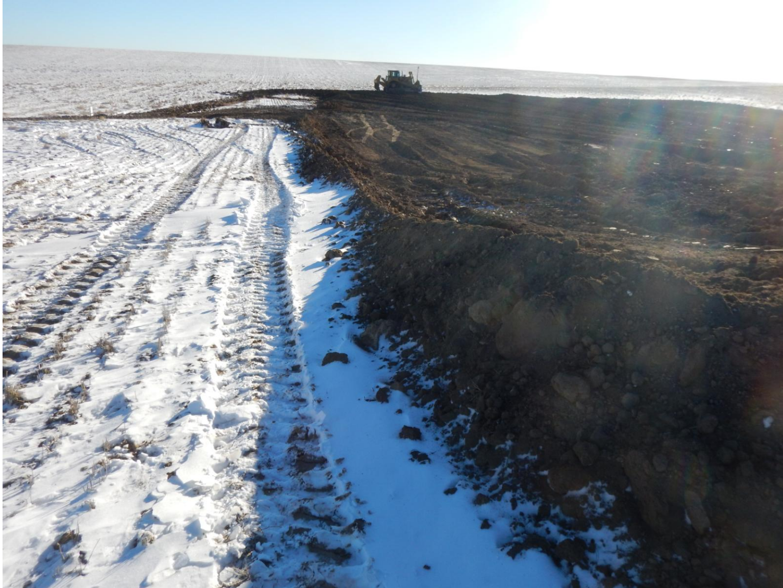
Figure 6: Photo taken from northwest corner of location, facing east. Photo shows insufficient stormwater BMPs for site prior to construction activities. .