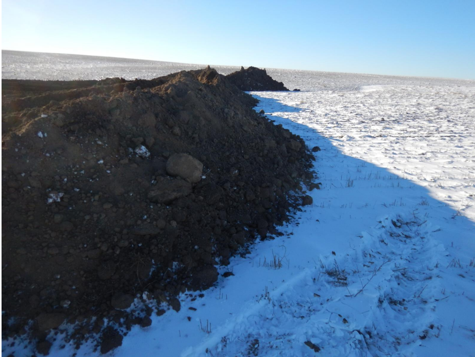
Figure 7: Photo taken from northwest corner of location, facing south. Photo of topsoil berm being constructed. Photo shows insufficient stormwater BMPs for site on western end of location prior to construction activities.