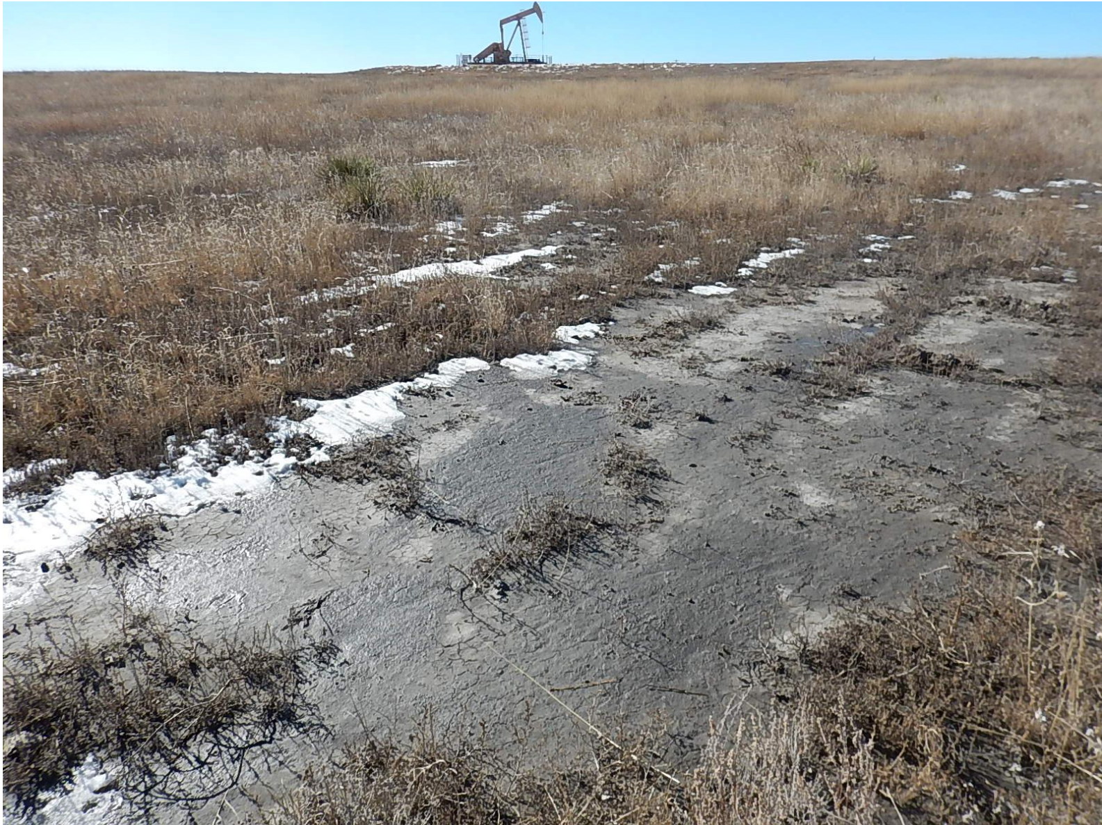
Figure 4 – Pond of drilling fluid.