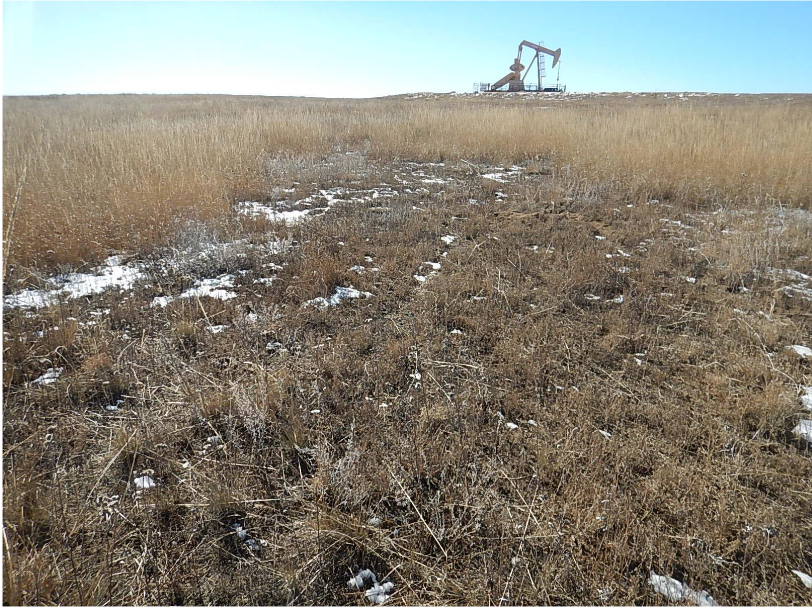
Figure 3 – Center of release. Native vegetation impacted by drilling fluid.