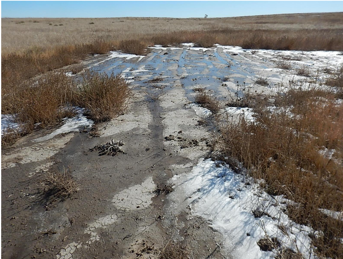
Figure 5 – Pond of drilling fluid at toe of release.