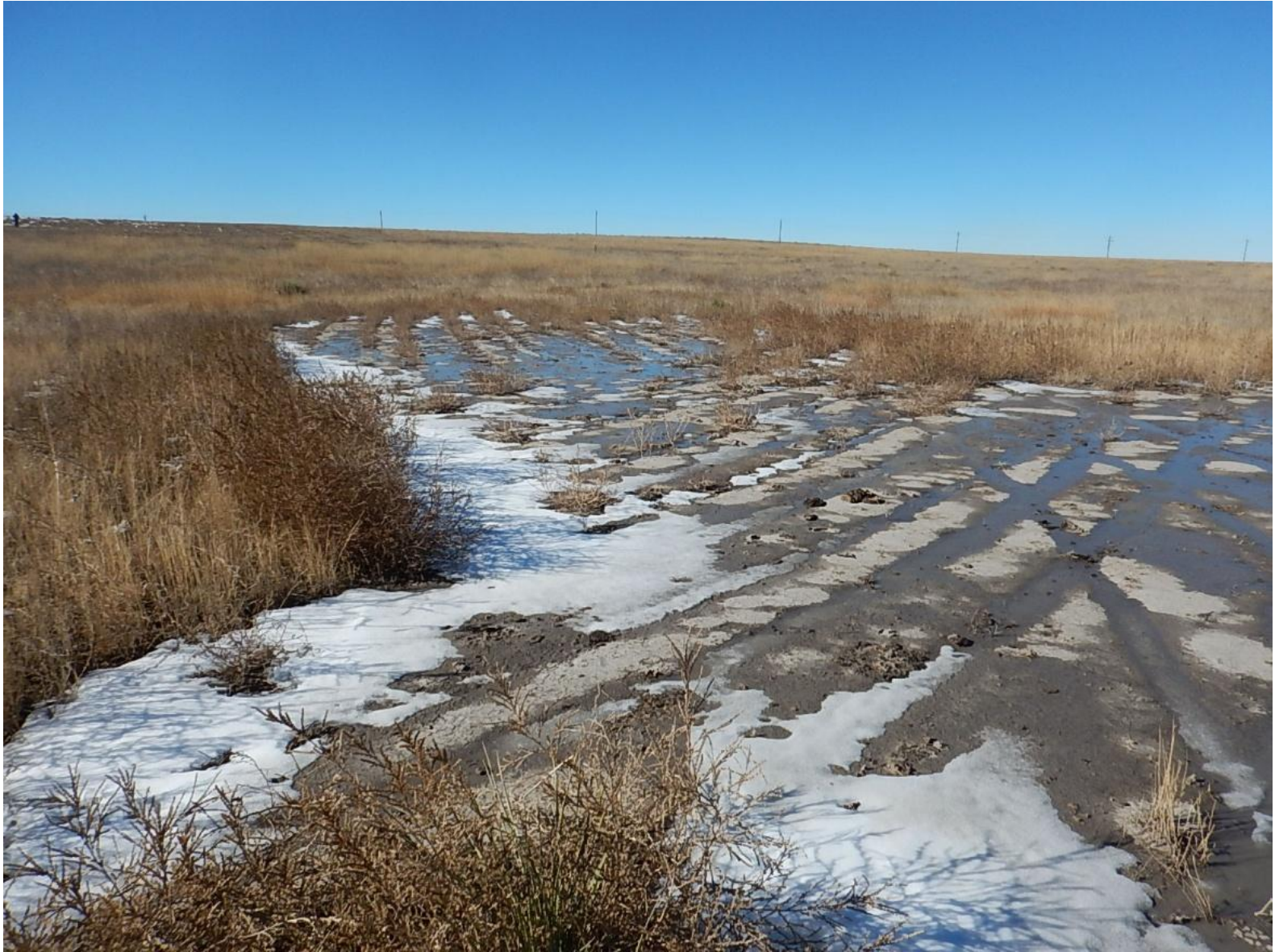
Figure 7 – Pond of drilling fluid at toe of release.