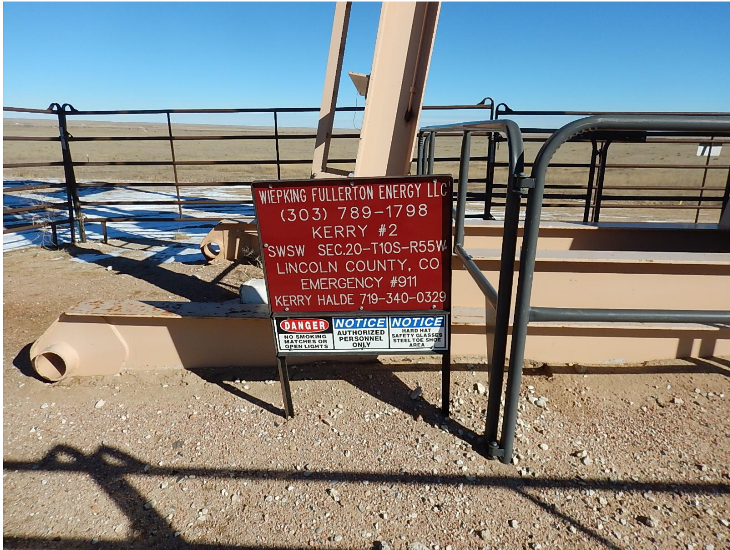
Figure 1 - Well sign. COGCC attempted to contact operator via phone number provided on sign, which went to a recorded message. COGCC could not leave message for operator because the voice mailbox was full