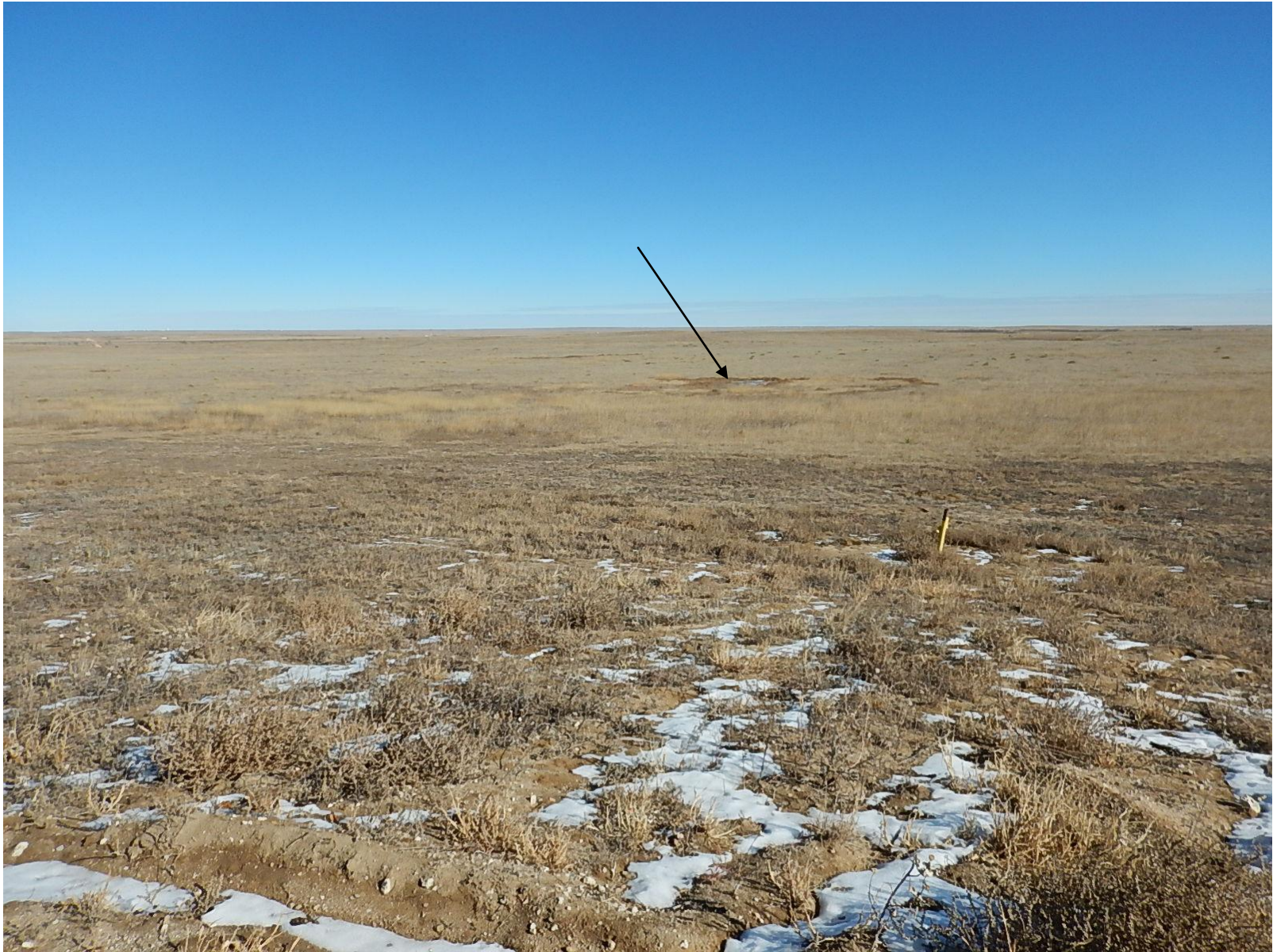
Figure 2 – Looking northeast from drill pad. Arrow showing ponds of drilling fluid at toe of release.