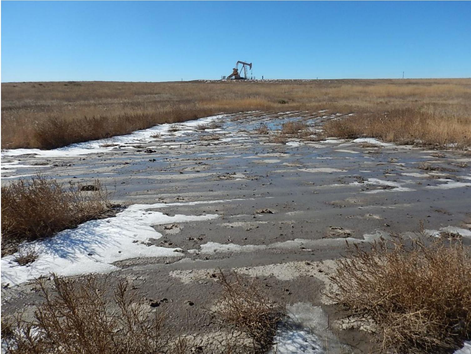
Figure 6 – Pond of drilling fluid at toe of release.