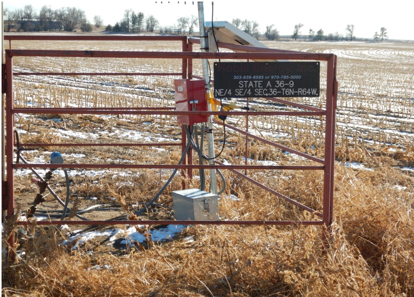
Photo 1. Photo taken of well sign.