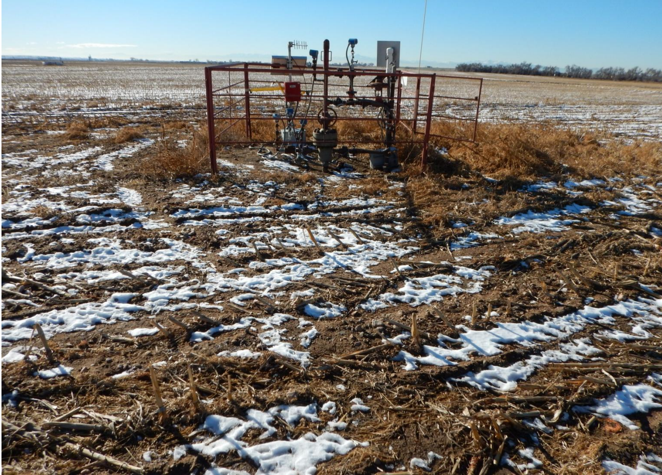
Photo 5. Photo taken from eastern location, facing West. Weeds need to be removed from around the well per Rule 603.f. Interim reclamation success can not be evaluated until the next growing season.