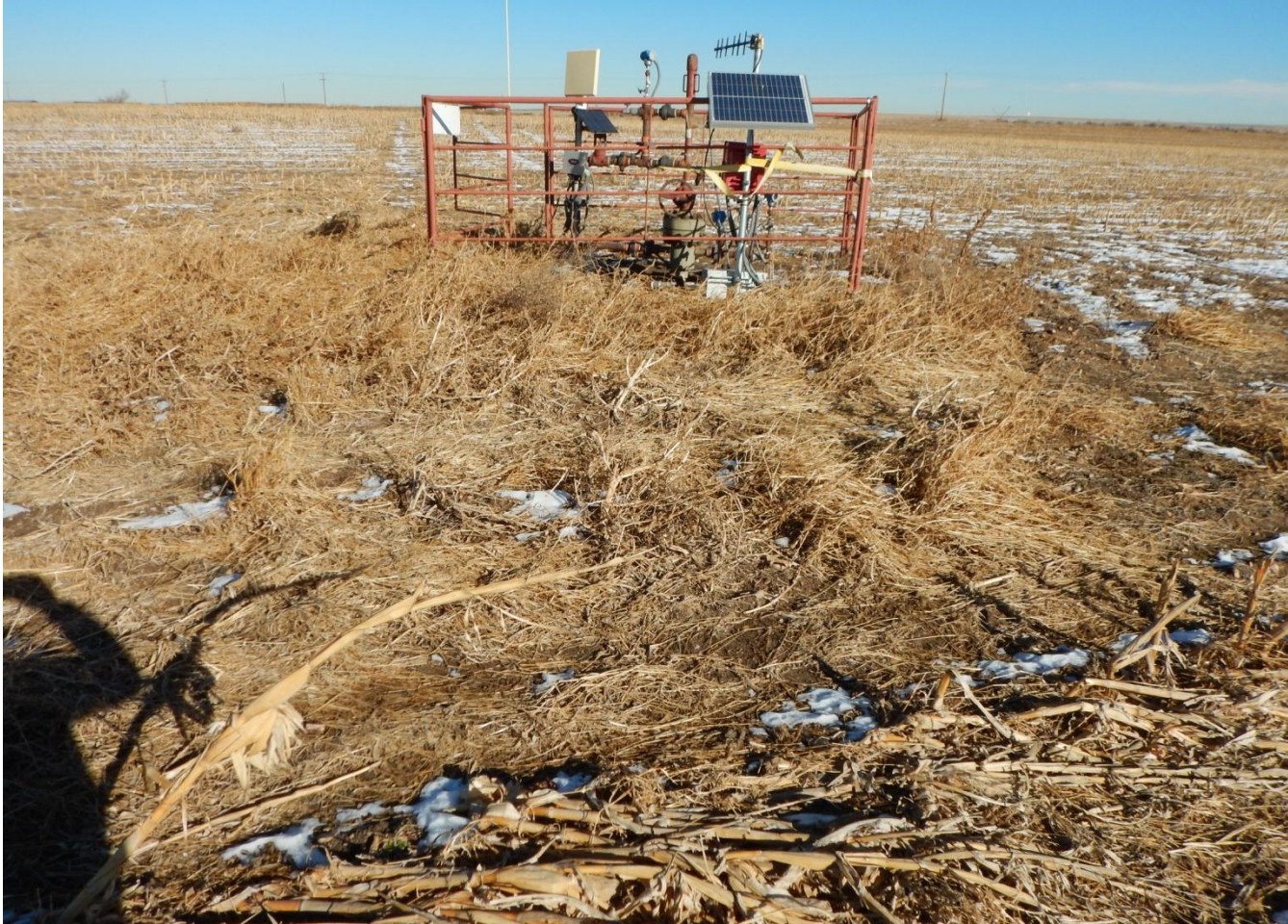
Photo 3. Photo taken from western location, facing East. Weeds need to be removed from around the well per Rule 603.f. Interim reclamation success can not be evaluated until the next growing season.