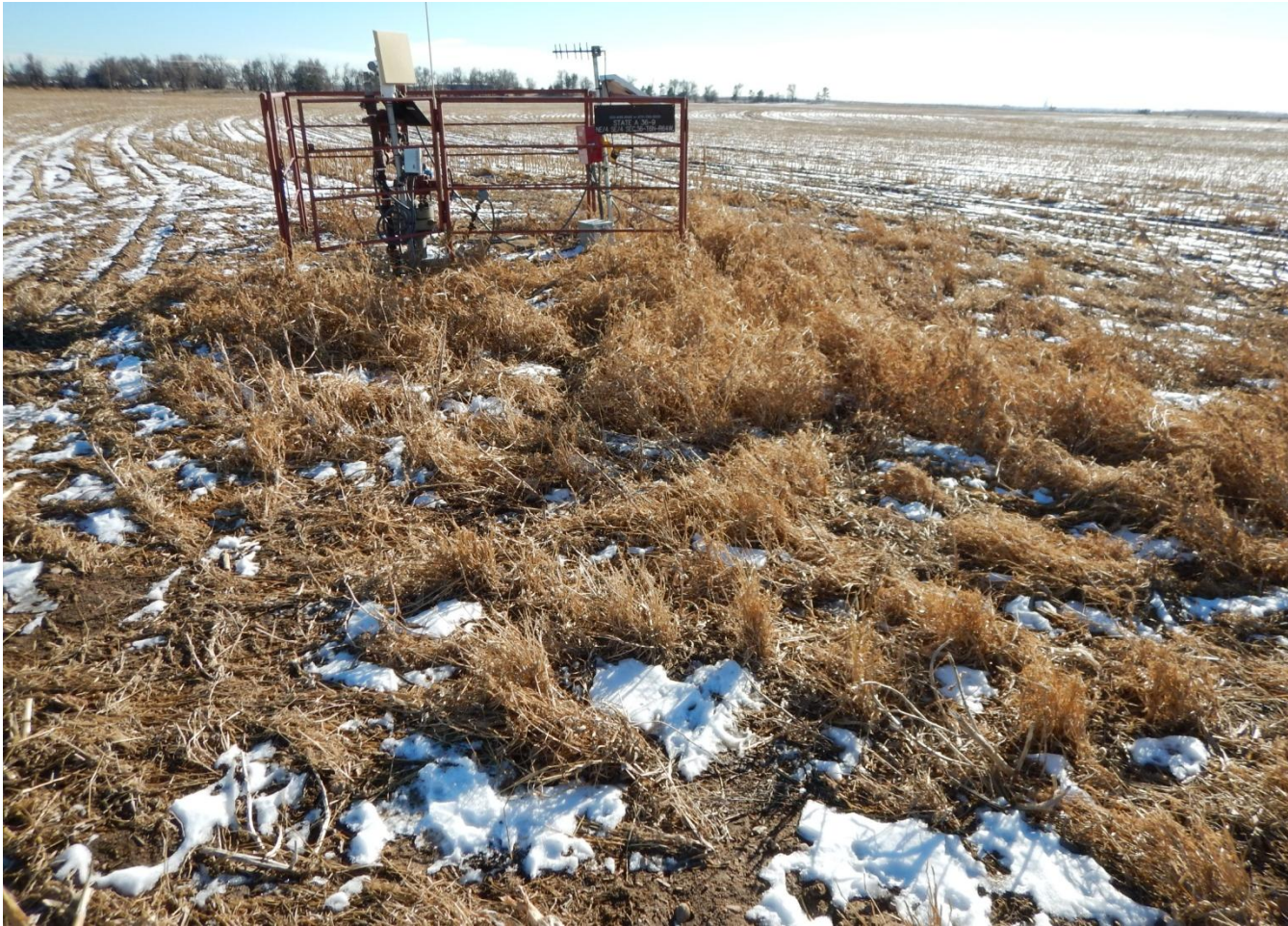
Photo 2. Photo taken from northern location, facing South. Weeds need to be removed from around the well per Rule 603.f. Interim reclamation success can not be evaluated until the next growing season.