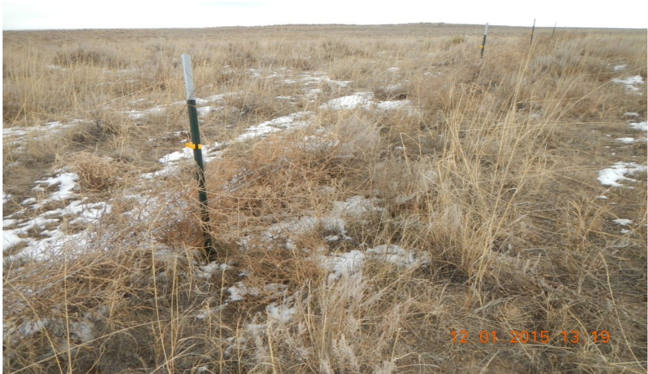
photo 7: North side of the location. The two wire strand fence is down low to the ground.