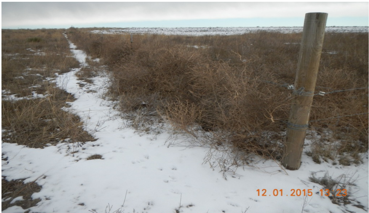
photo 8: Northwest corner, weed debris is beginning to accumulate along the fence line.