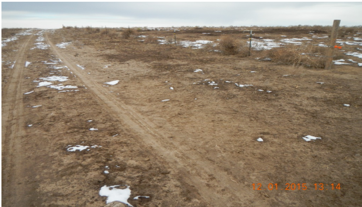
photo 2: Facing northeast, access road continues north past the location.