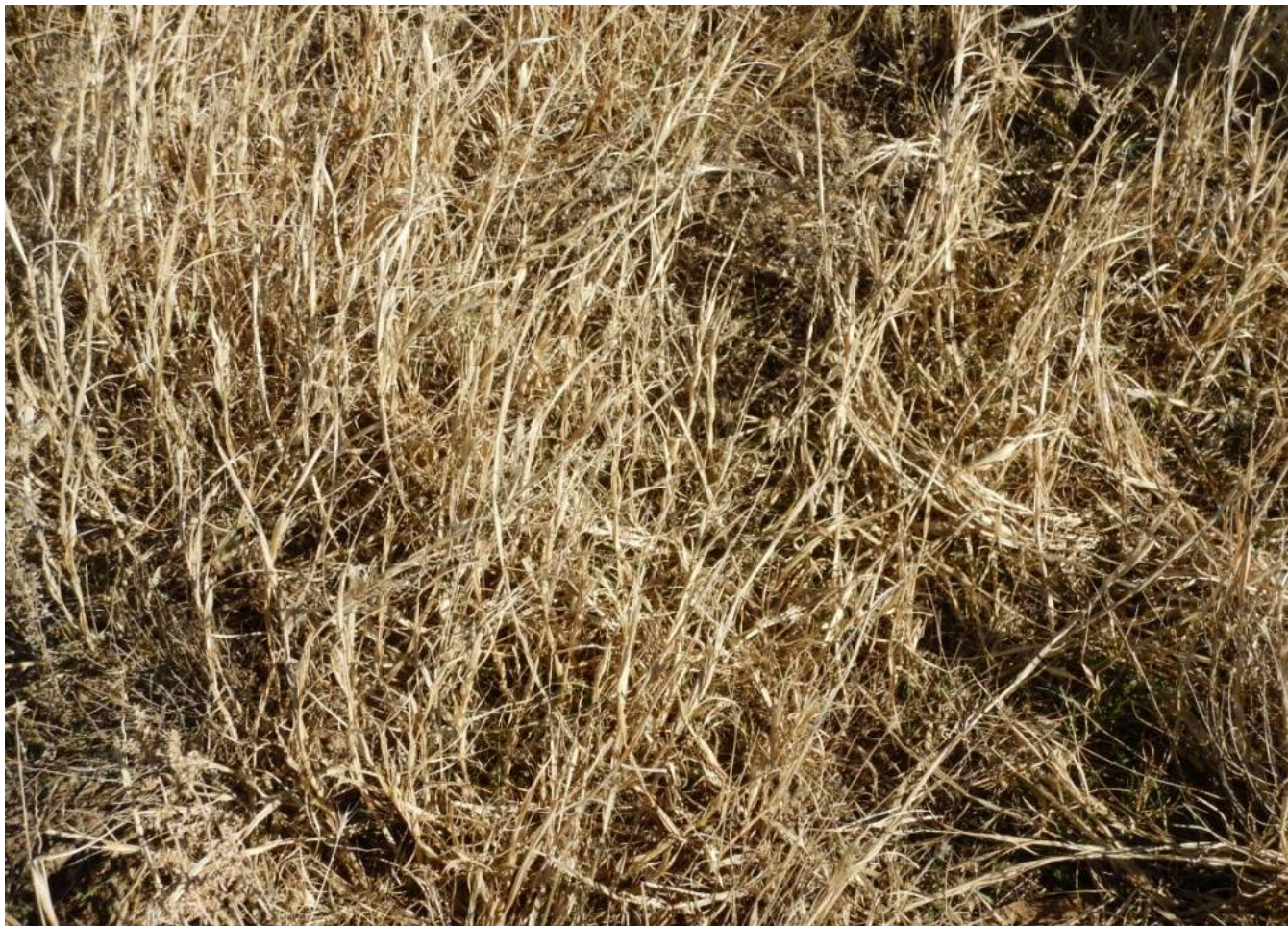
Photo 7. Close-up photo of longspine sandbur.