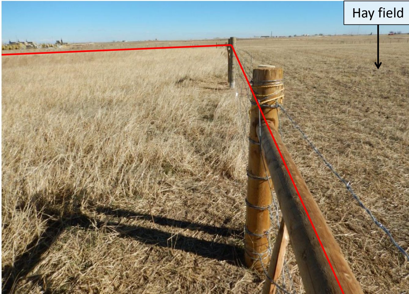
Photo 2. Photo taken from southwest corner of well pad, facing East. Sandbur dominants well pad area with very little to no perennial vegetation.