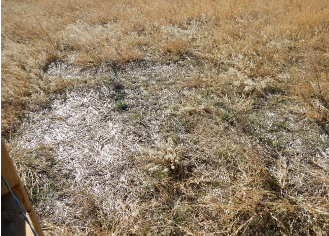
Photo 6. Photo taken from southeast corner of well pad. Sandbur is the dominant plant species with no vegetative growth in areas.