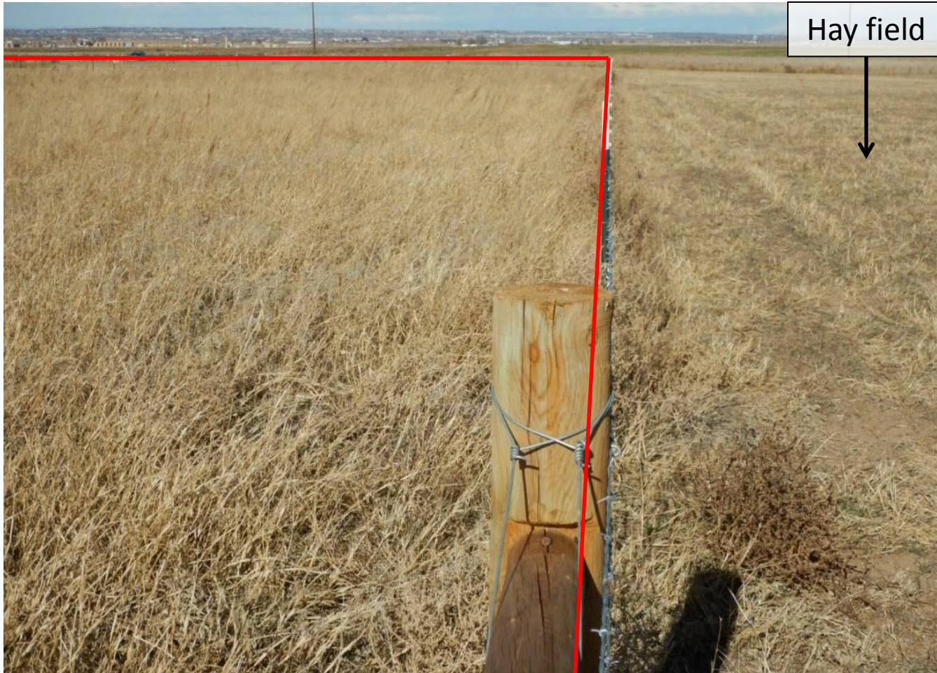
Photo 4. Photo taken from southeast corner of well pad, facing North. Sandbur dominants well pad area with very little to no perennial vegetation.