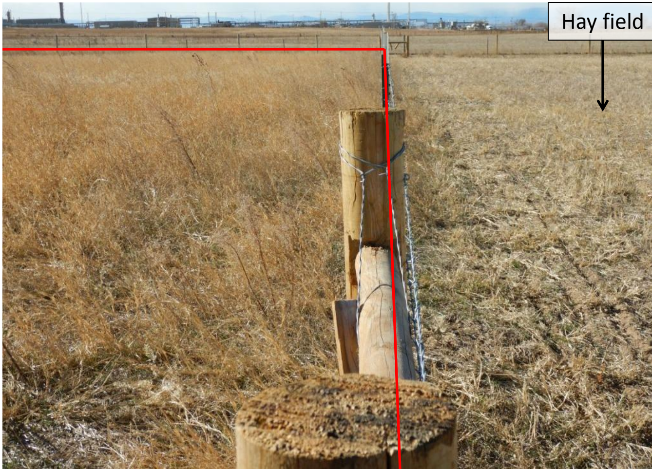
Photo 5. Photo taken from northeast corner of well pad, facing West. Sandbur dominants well pad area with very little to no perennial vegetation.