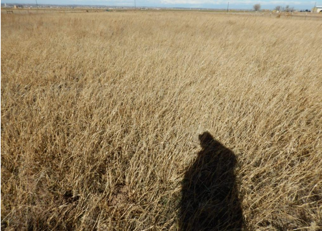
Photo 3. Photo taken from southern well pad, facing North. Sandbur dominants well pad area with very little to no perennial vegetation.