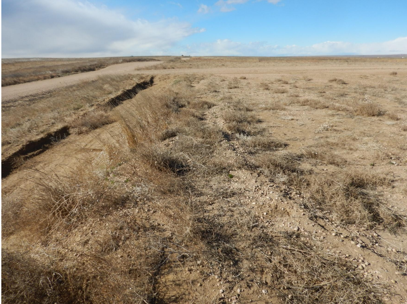
Photo 9: Photo taken from southeast side of location, facing west.