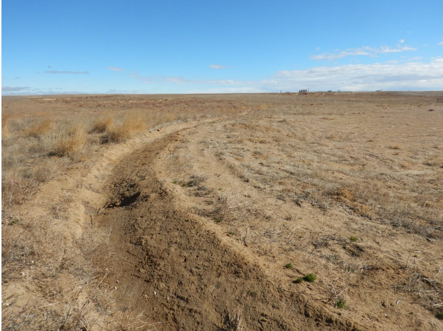
Photo 2: Photo taken on northwest side of location, facing east. Photo of interim reclamation. Note the lack of perennial vegetation.