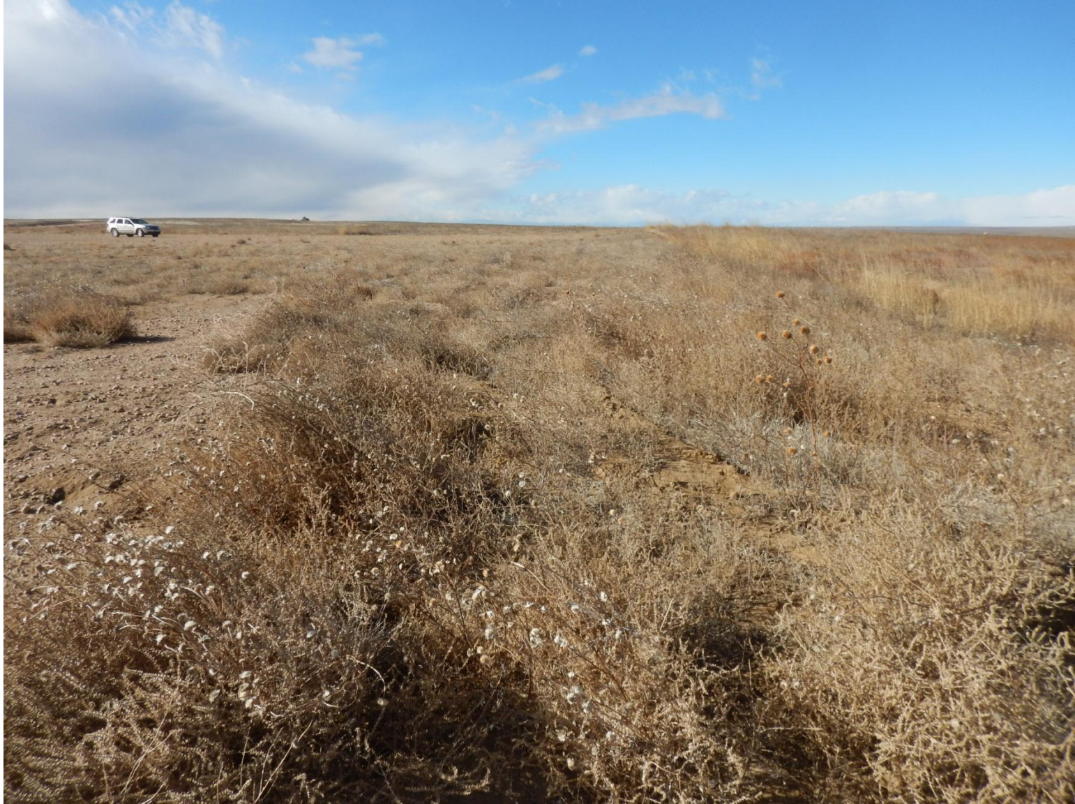
Photo 5: Photo taken from northeast side of location, facing west. Photo of interim reclamation. Note the lack of perennial vegetation. Vegetation in photo predominantly Russian thistle.