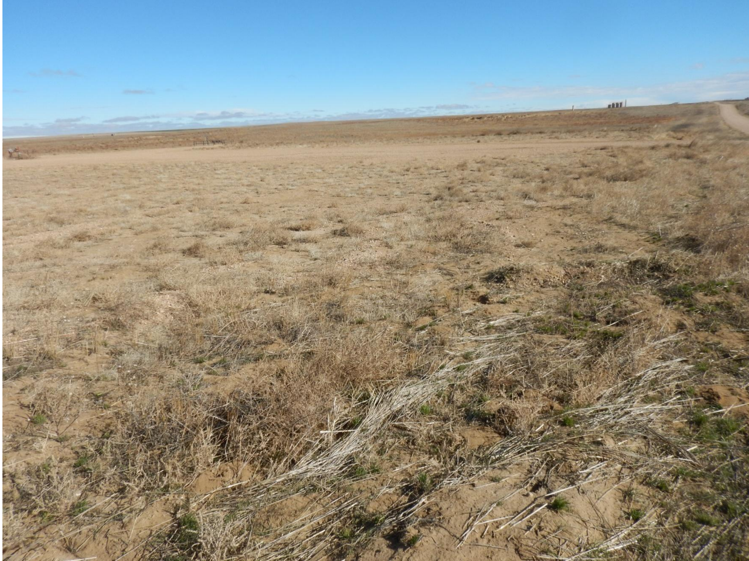
Photo 11: Photo taken from southwest side of location, facing east.