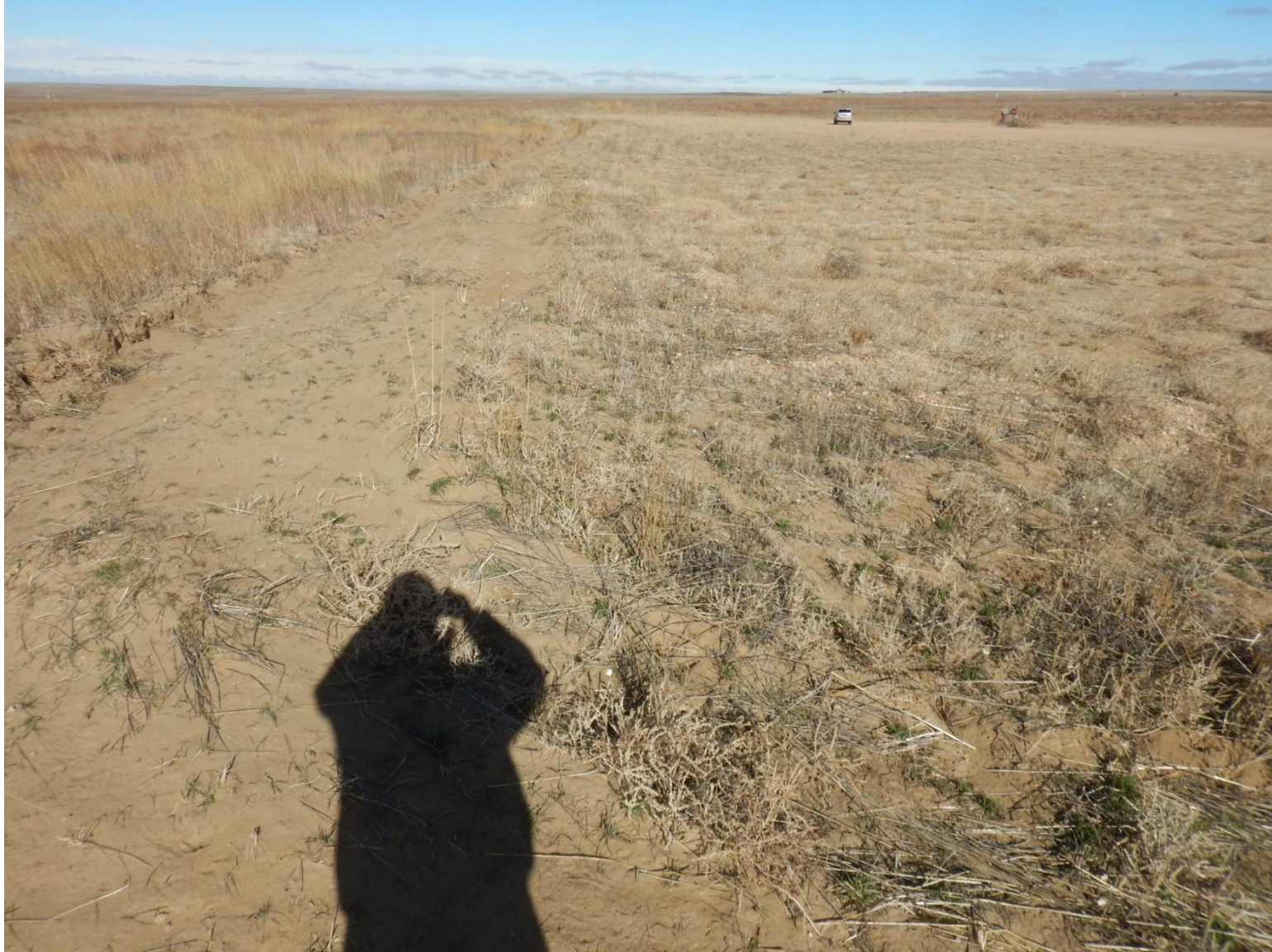
Photo 10: Photo taken from southwest side of location, facing North. Photo of interim reclamation. Note the lack of perennial vegetation.