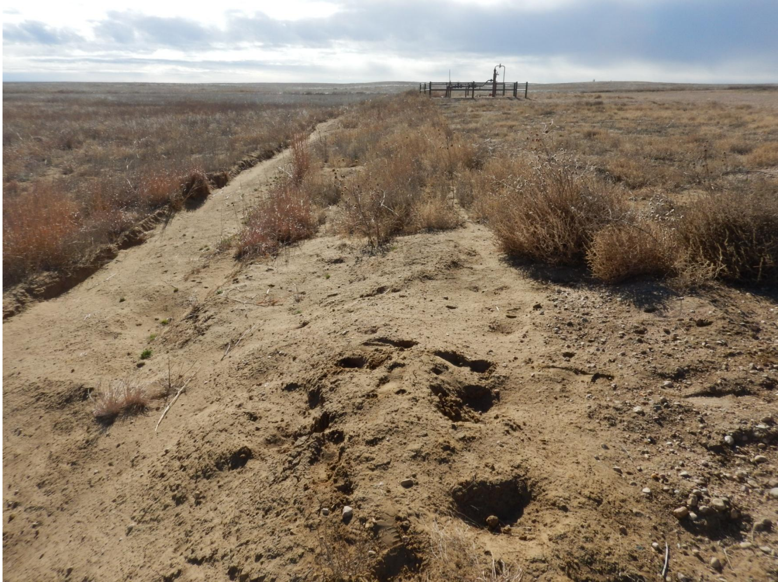
Photo 6: Photo taken from northeast side of location, facing south.