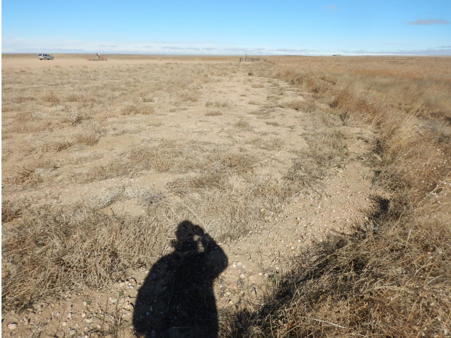
Photo 8: Photo taken from southeast side of location, facing North. Photo of interim reclamation. Vegetation predominantly Russian thistle and Kochia weed debris.