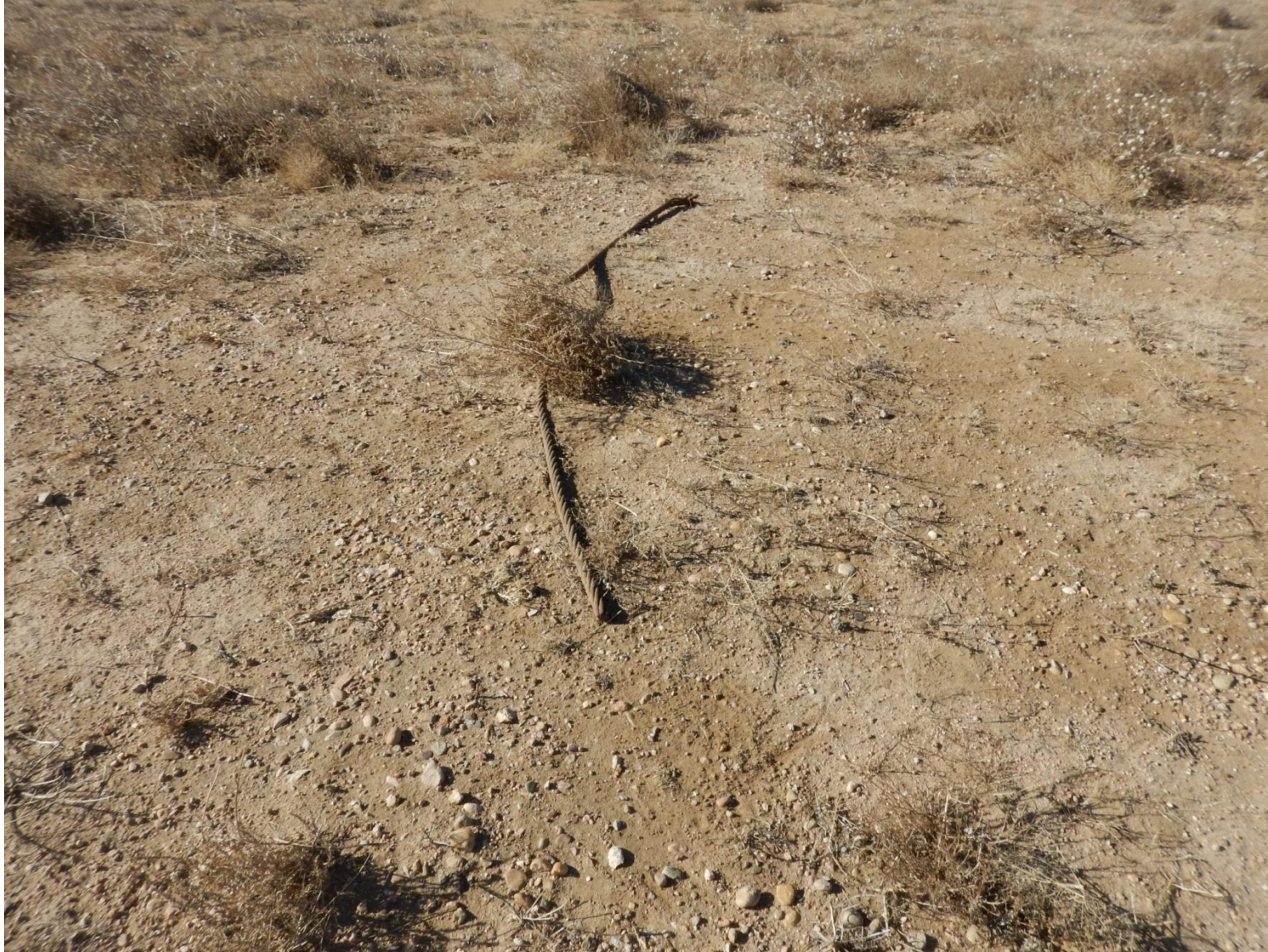
Photo 7: Photo taken from east side of location. Photo of trash on location, appears to be cable.