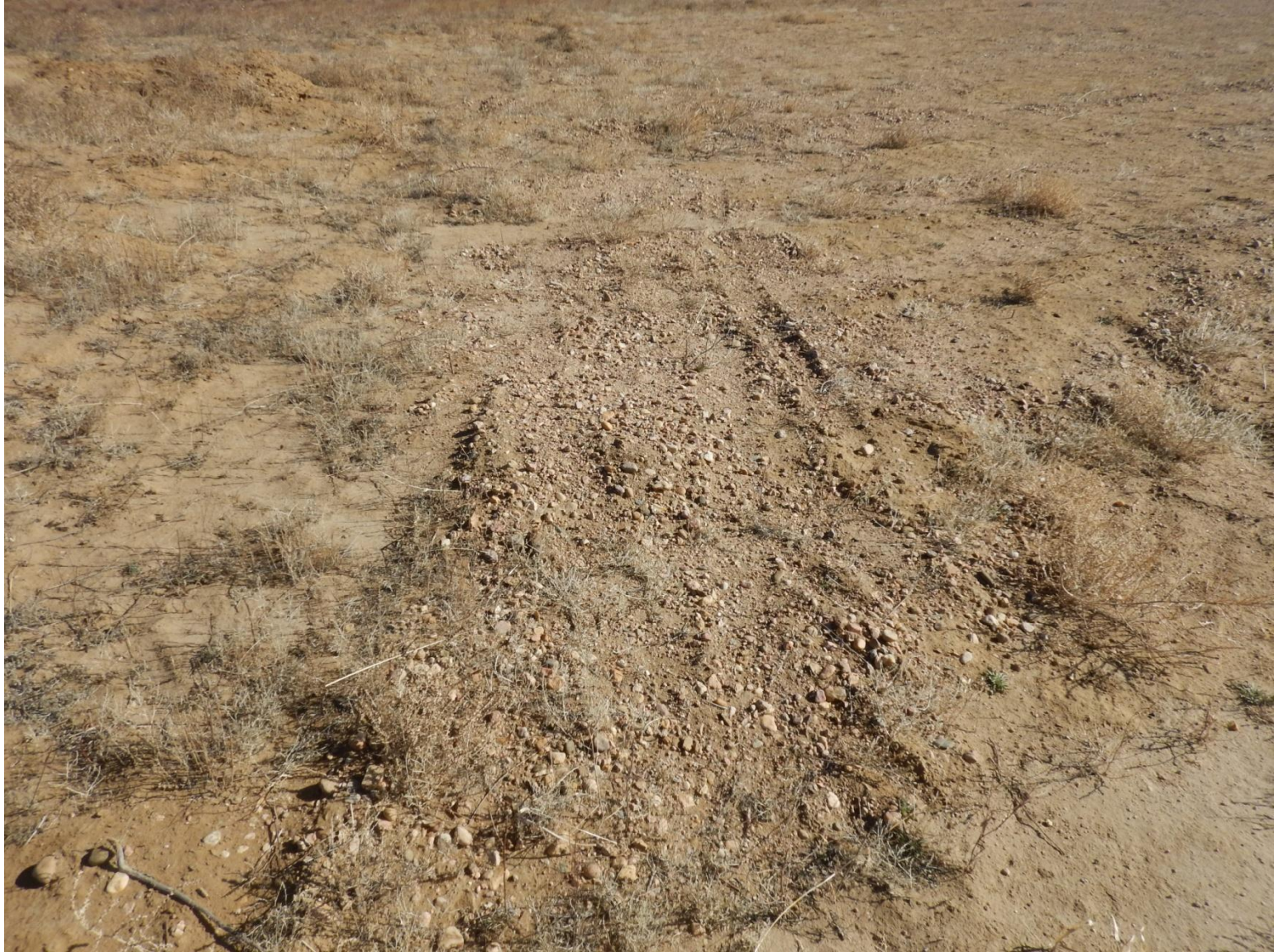
Photo 3: Photo taken on north end of location. Photo of gravel remaining on interim portion of location.