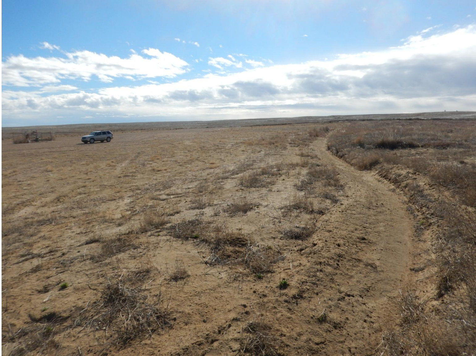
Photo 1: Photo taken from Northern side of location facing South. Photo of interim reclamation. These areas need to be minimized and reclaimed.