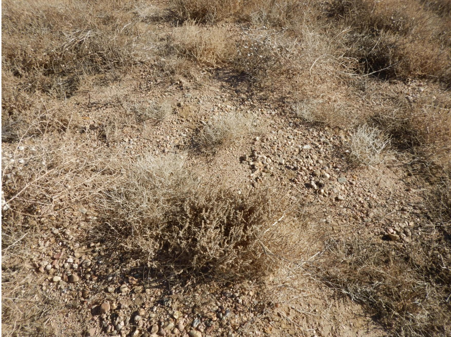
Photo 4: Photo taken from north side of location, facing North. Photo of Russian thistle weed debris, and gravel.