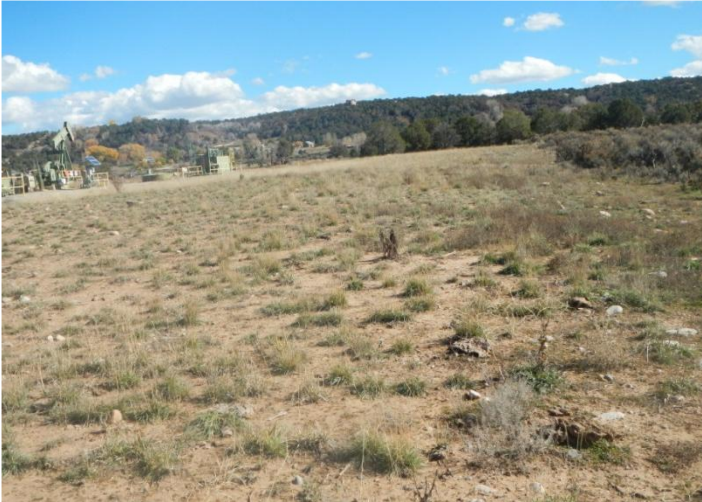
Photo 5. View of southern portion of project area from southwestern corner facing eastward.