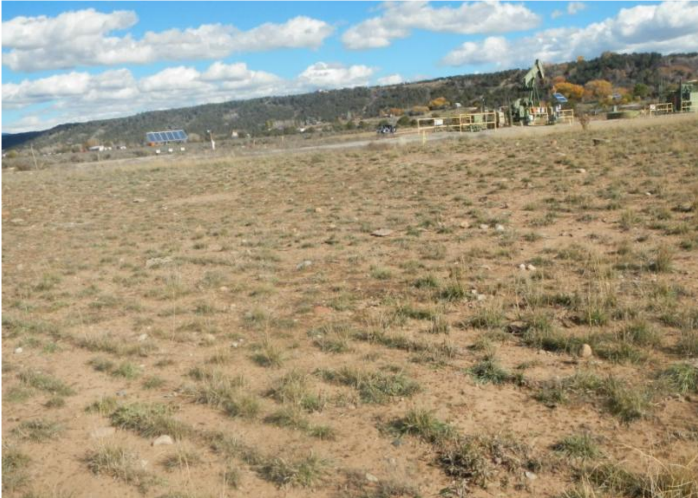
Photo 4. View of project area from southwestern corner facing center. Revegetation is largely comprised of grasses such as western wheatgrass ( Pascopyron smithii ), crested wheatgrass ( Agropyron cristatum ), and intermediate wheatgrass ( Thinopyron intermedium ).