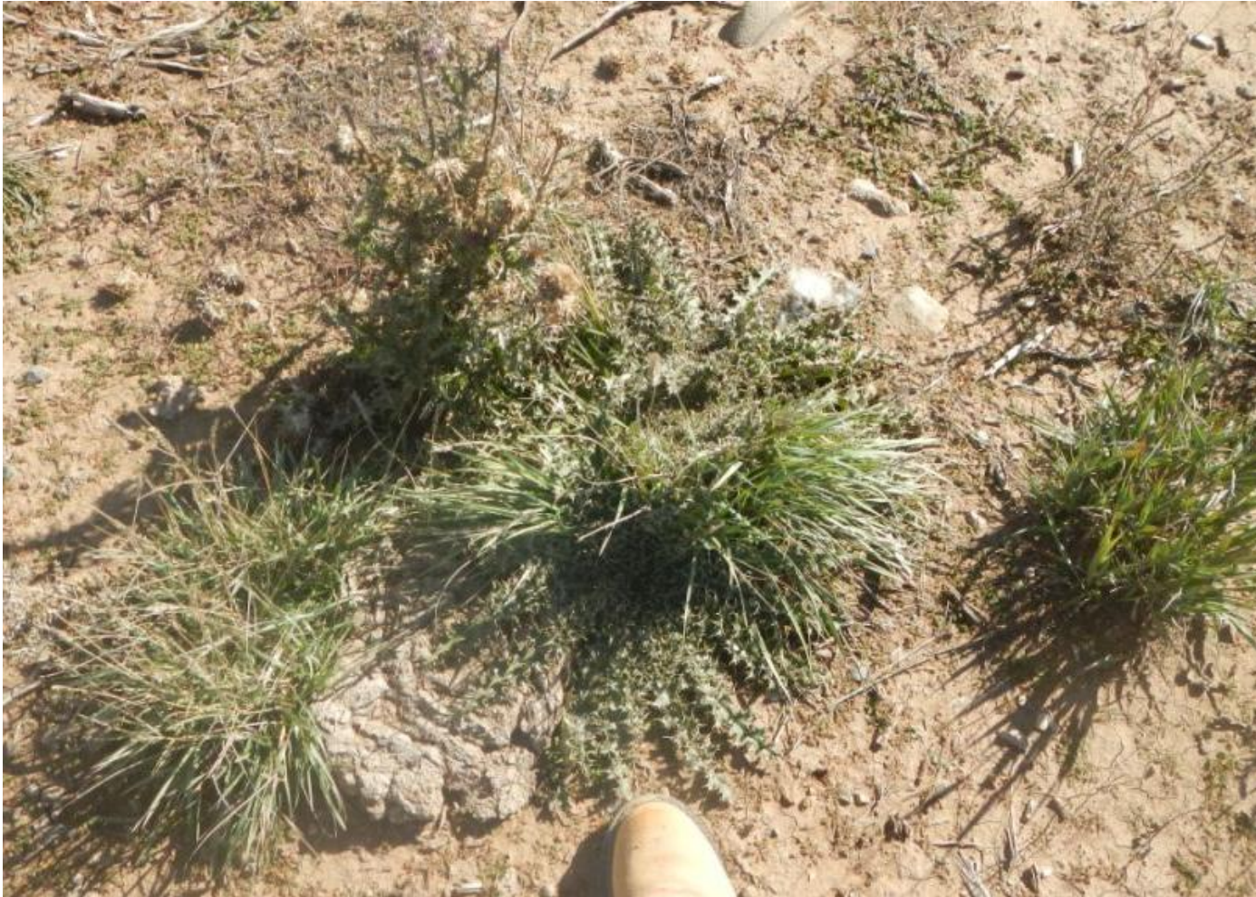
Photo 2. View of musk thistles ( Carduus nutans ) growing within the interim reclamation area.