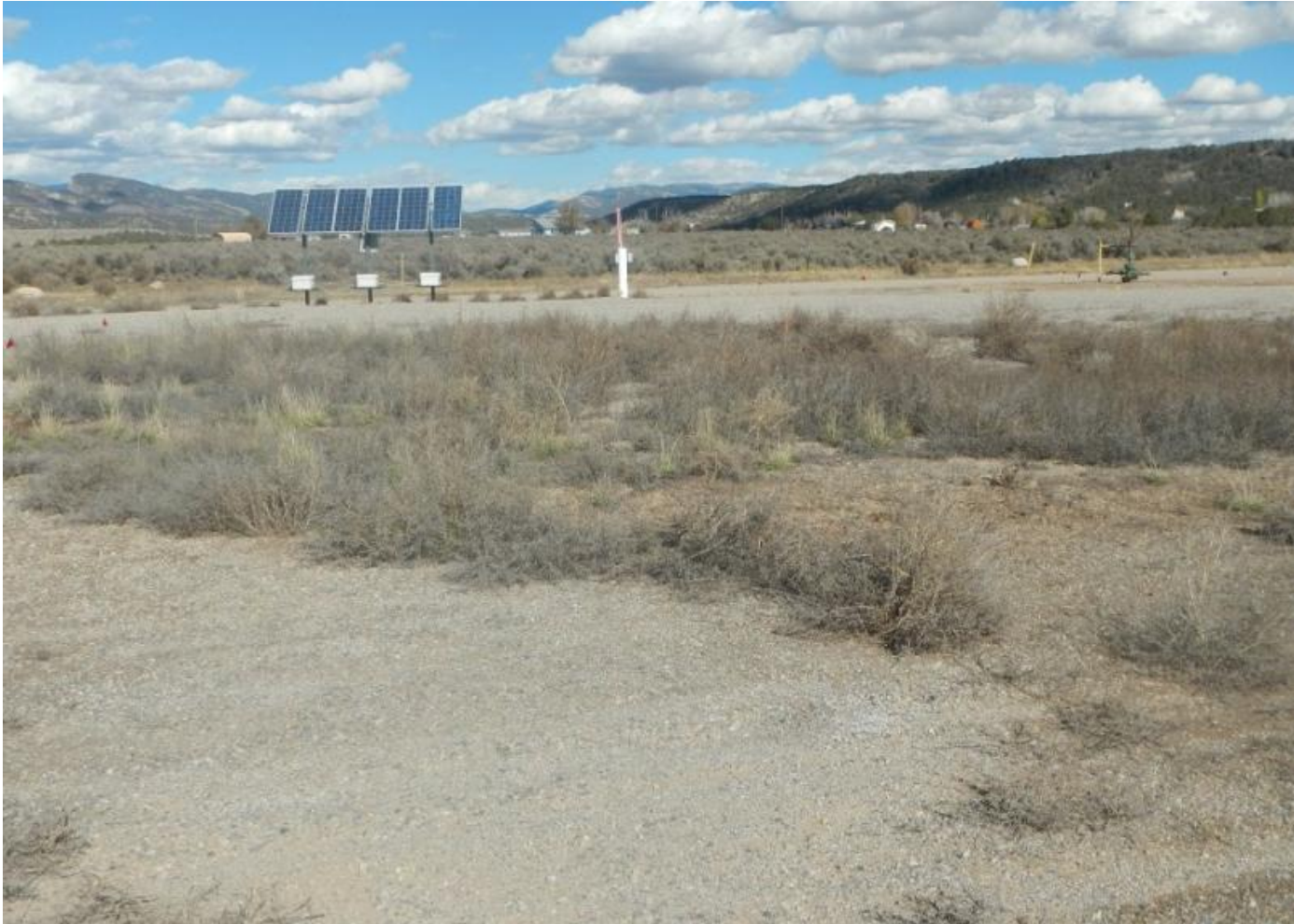
Photo 1. View of vegetation within “teardrop” on working surface of well pad. Gray vegetation is kochia ( Kochia scoparia ) debris that needs to be removed. Green and yellow vegetation is desirable grasses that should not be removed.