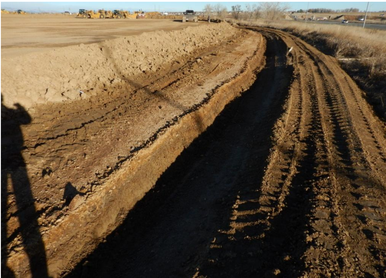
Photo 7. Photo taken from eastern location, facing North. Stormwater BMP installed in center of photo.