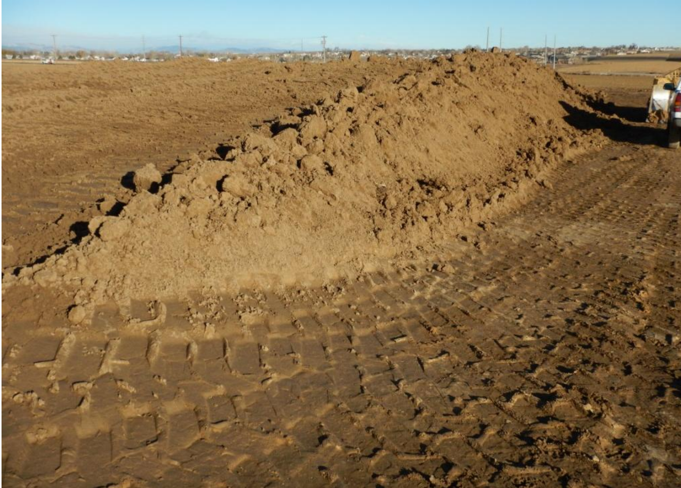
Photo 3. Photo taken from western location, facing North. Topsoil salvage stockpile from northern pad in center of photo.