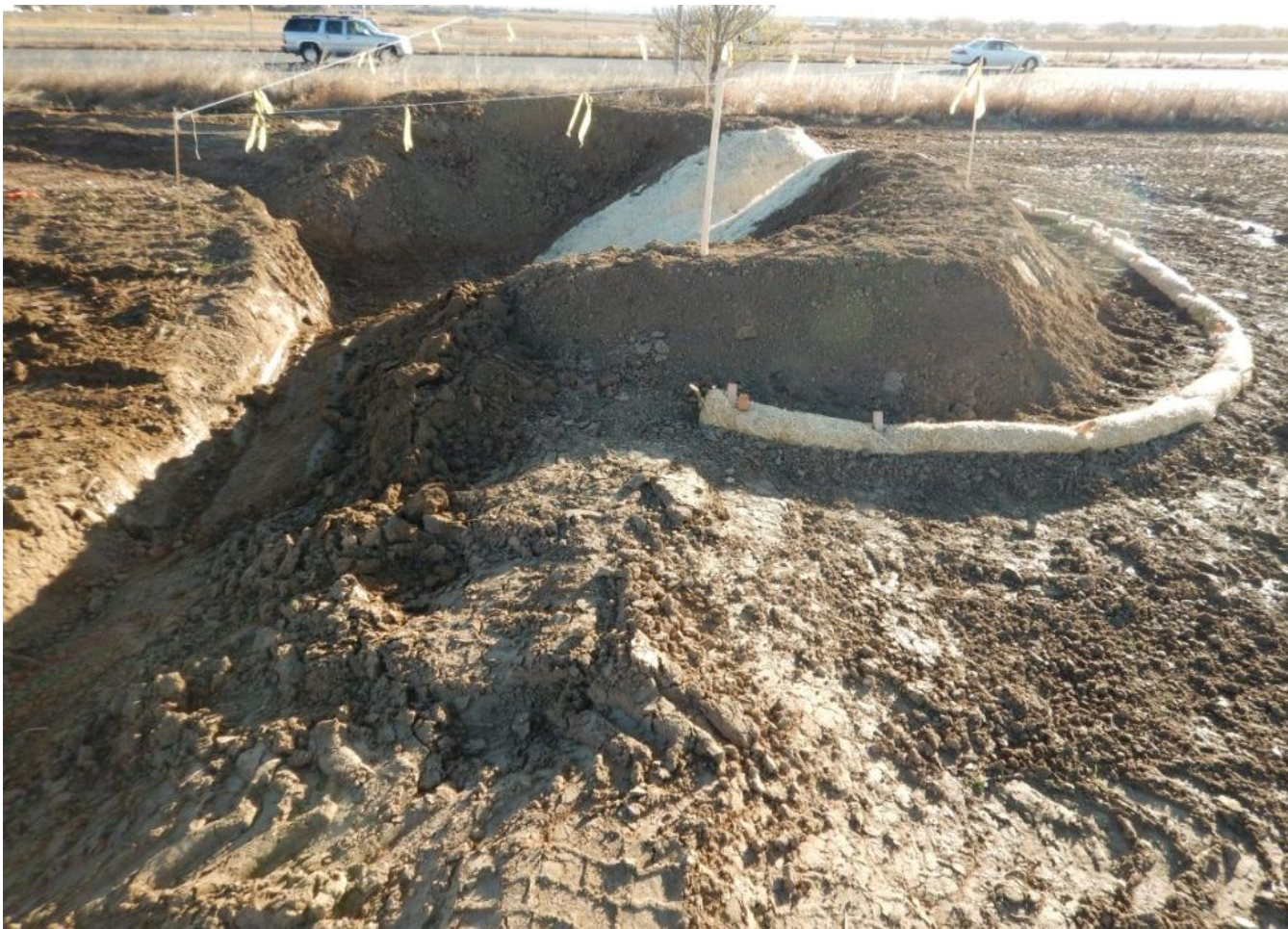
Photo 6. Photo taken from southeast location, facing East. Stormwater BMP installed in center of photo.