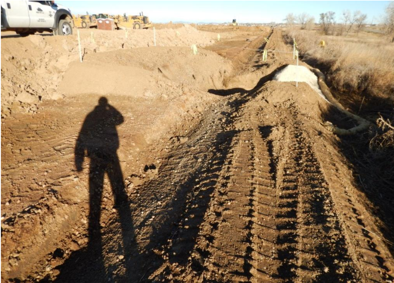
Photo 8. Photo taken from eastern location, facing North. Stormwater BMP installed in center of photo.