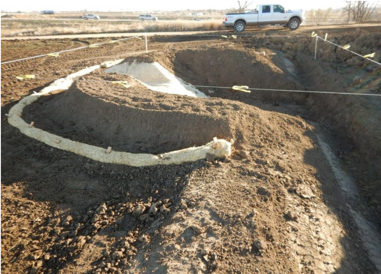
Photo 1. Photo taken from northeast location, facing East. Stormwater BMP installed in center of photo.