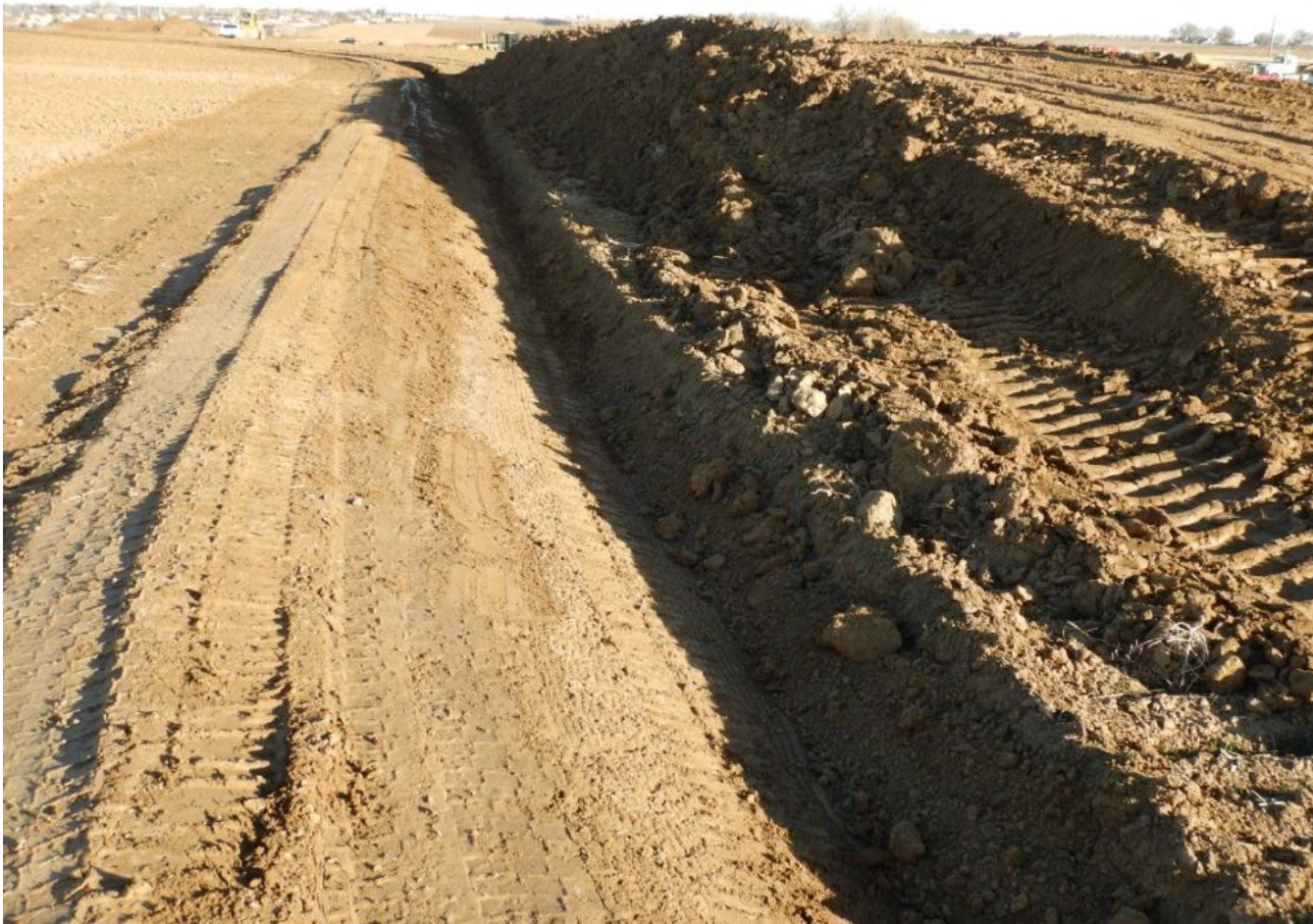
Photo 4. Photo taken from western location, facing North. Topsoil salvage stockpile from southern pad in center of photo with stormwater BMP.