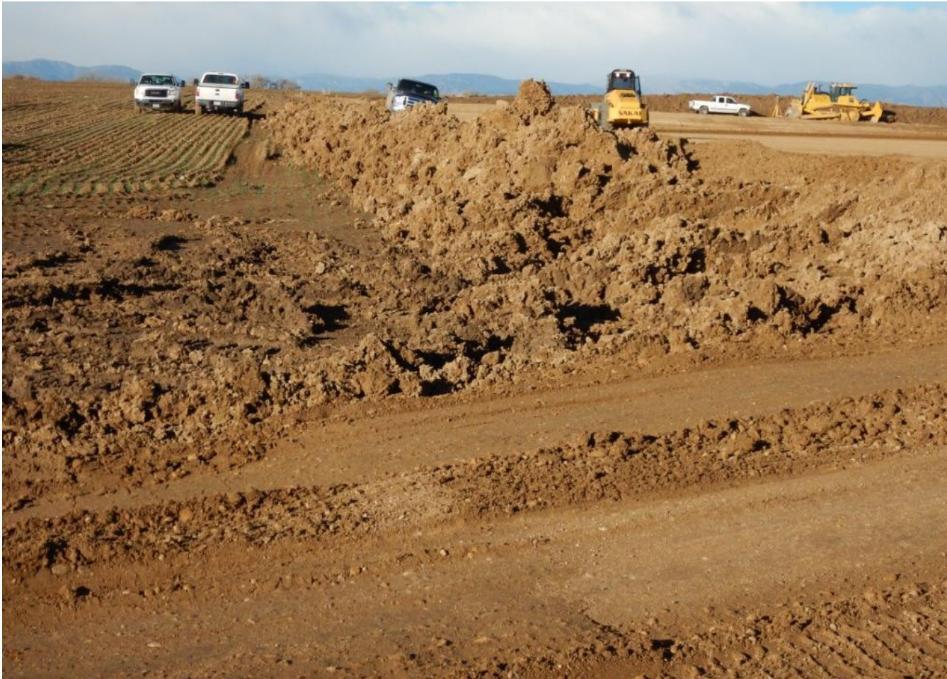
Photo 9. Photo taken from eastern location, facing West. Operator waiting for soil to dry before tracking and stabilizing soil pile.