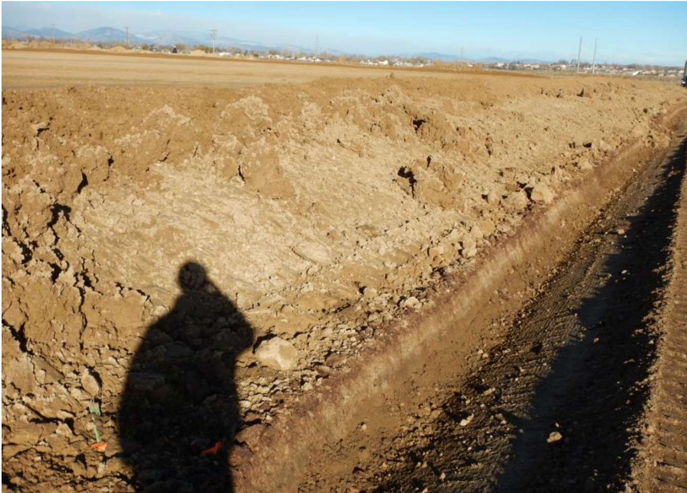
Photo 10. Photo taken from eastern location, facing North. Operator waiting for soil to dry before tracking and stabilizing soil pile.