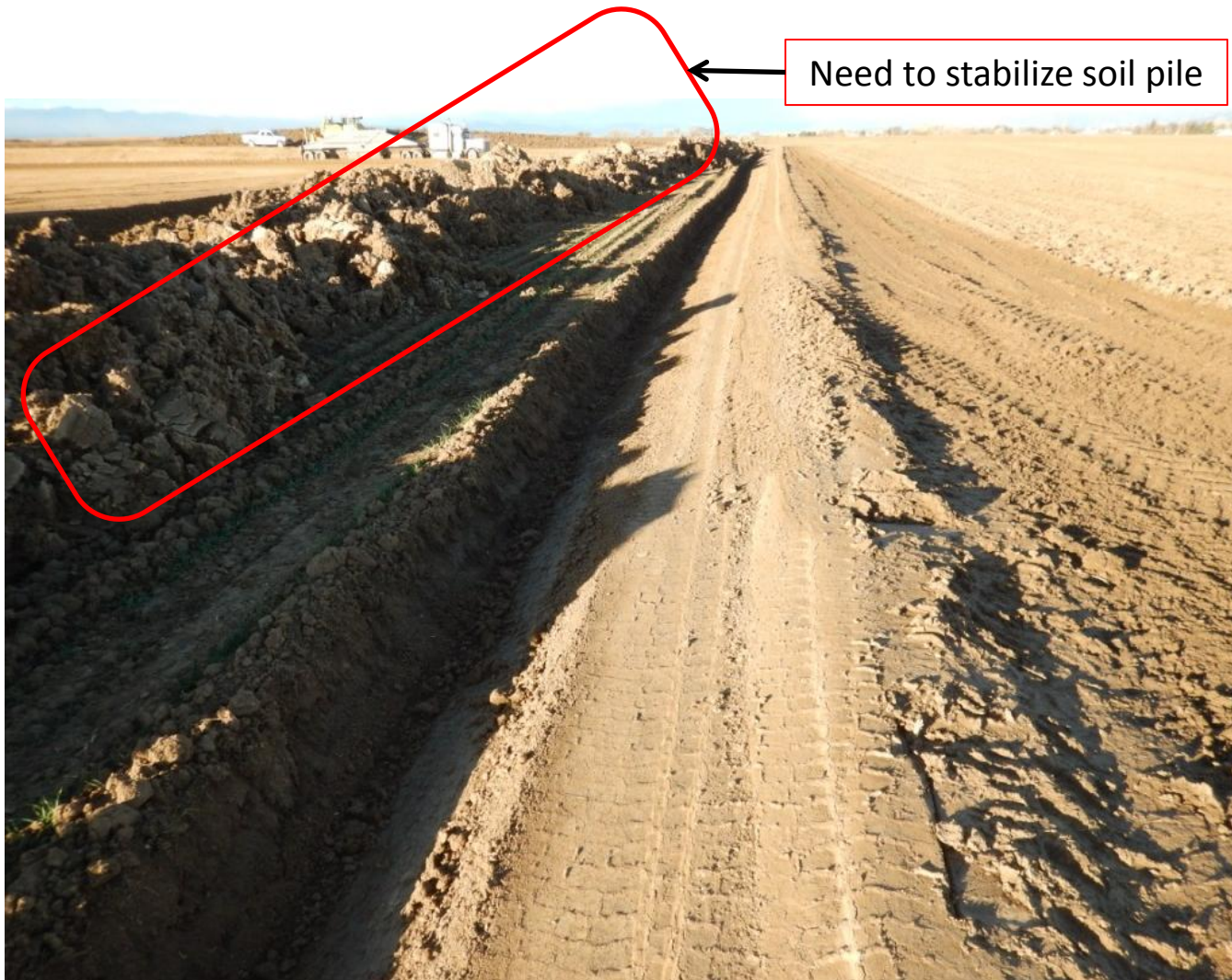
Photo 2. Photo taken from northern location, facing West. Stormwater BMP installed in center of photo. Operator waiting for soil to dry before tracking and stabilizing soil pile.