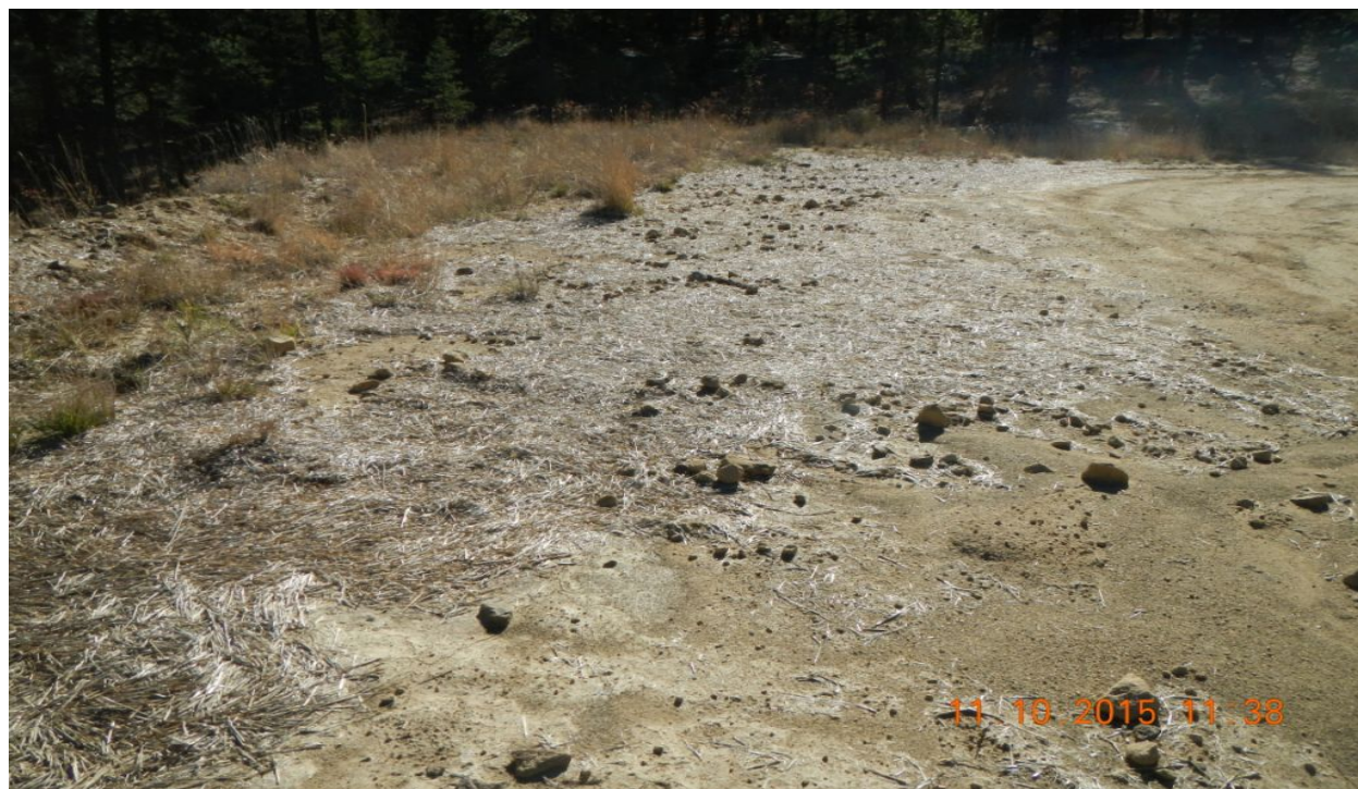
photo 2: East side of the location facing south at area of the location that looks to have been seeded and mulched.