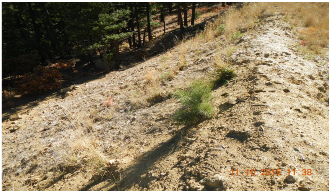
photo 3: East side of the location facing south at area of the location that looks to have been seeded and mulched.