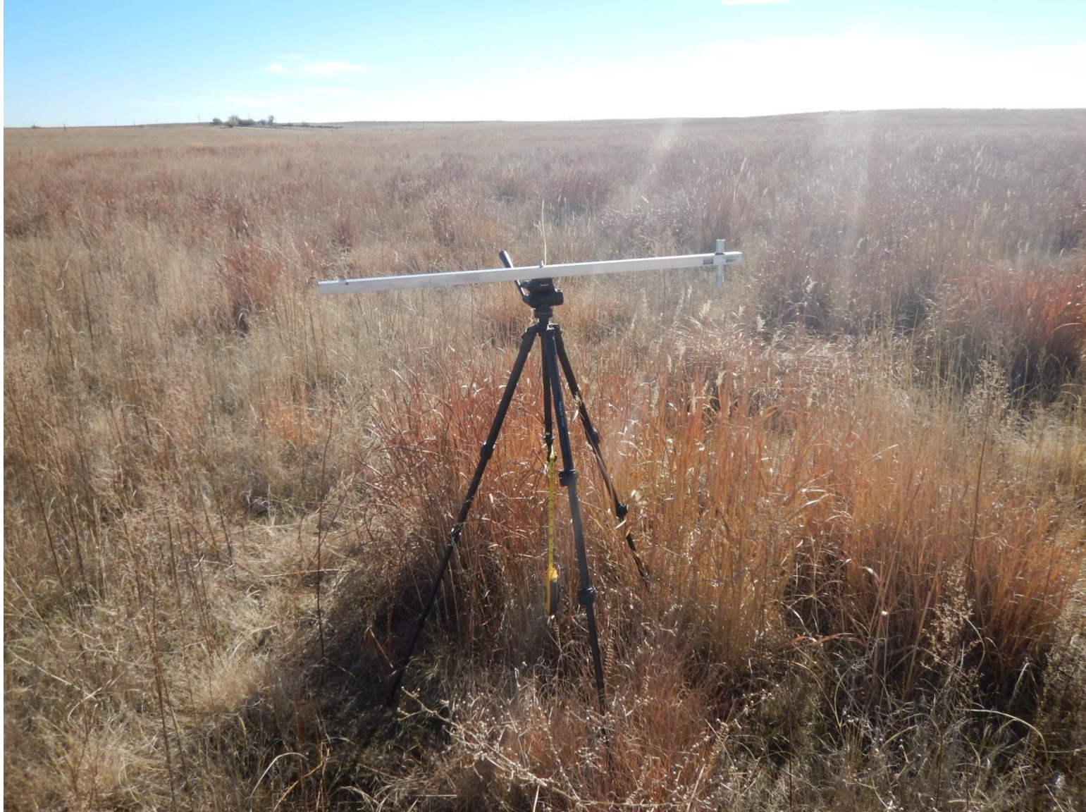
Photo 9: Photo of reference transect ending point, facing southeast.