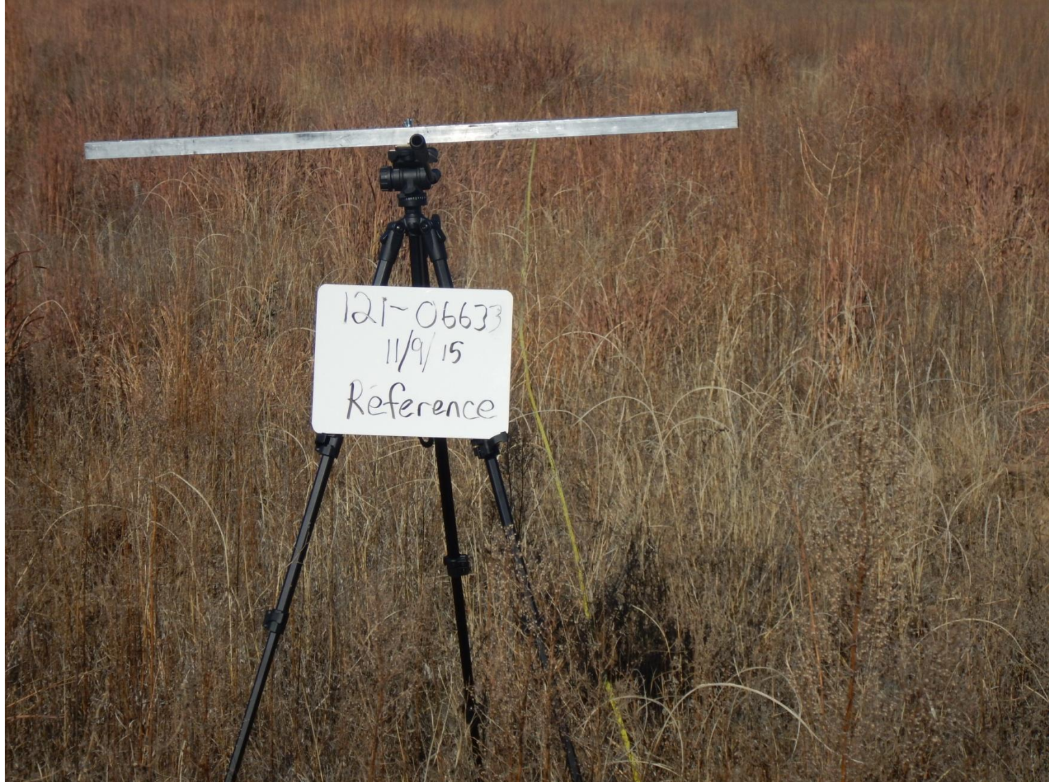
Photo 11: Photo of reference area, transect starting point, facing northwest.