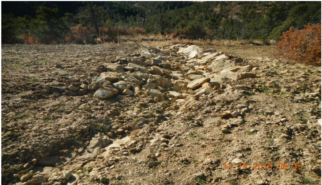
photo 3: Drainage channel installed where water is diverted from the main road.