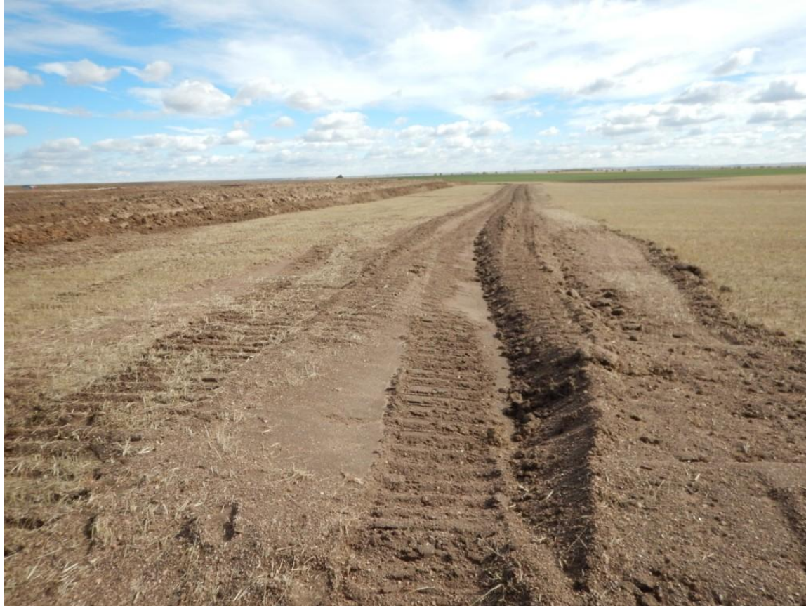
Photo 8. Photo taken from southern location, facing East on 10/23/2015. Stormwater control ditch about 30 feet south of disturbed location.