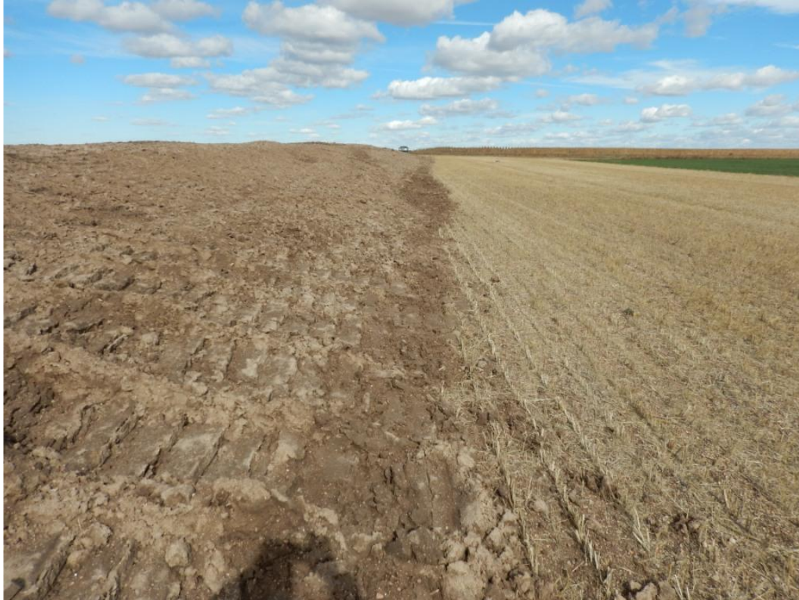
Photo 11. Photo taken from east location, facing North on 10/23/2015. Topsoil stockpile was placed on top of east stormwater control ditch (refer to Photo 10). Need to reconstruct stormwater control ditch and stormwater controls need to be in place for the topsoil stockpile.