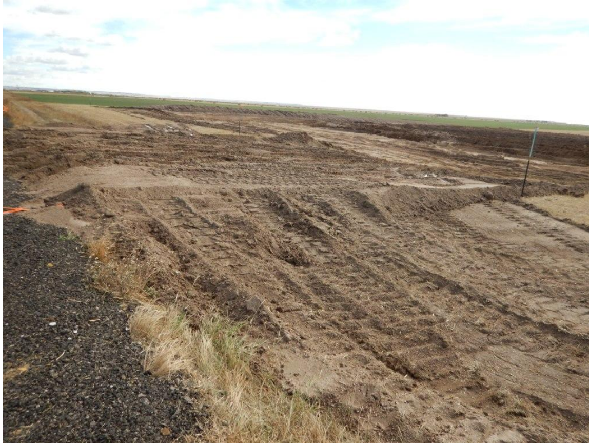
Photo 4. Close-up photo taken from northern access road with no stormwater BMP's, facing East on 10/23/2015. Also, the County road bar ditch disturbance is exceeding the permitted area. This will be forwarded onto OGLA for further review.