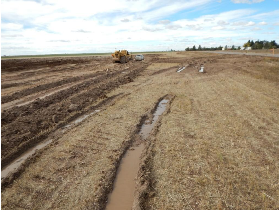
Photo 6. Photo taken from northern location, facing West on 10/23/2015. No stormwater control BMPs. Corrective action was not met.