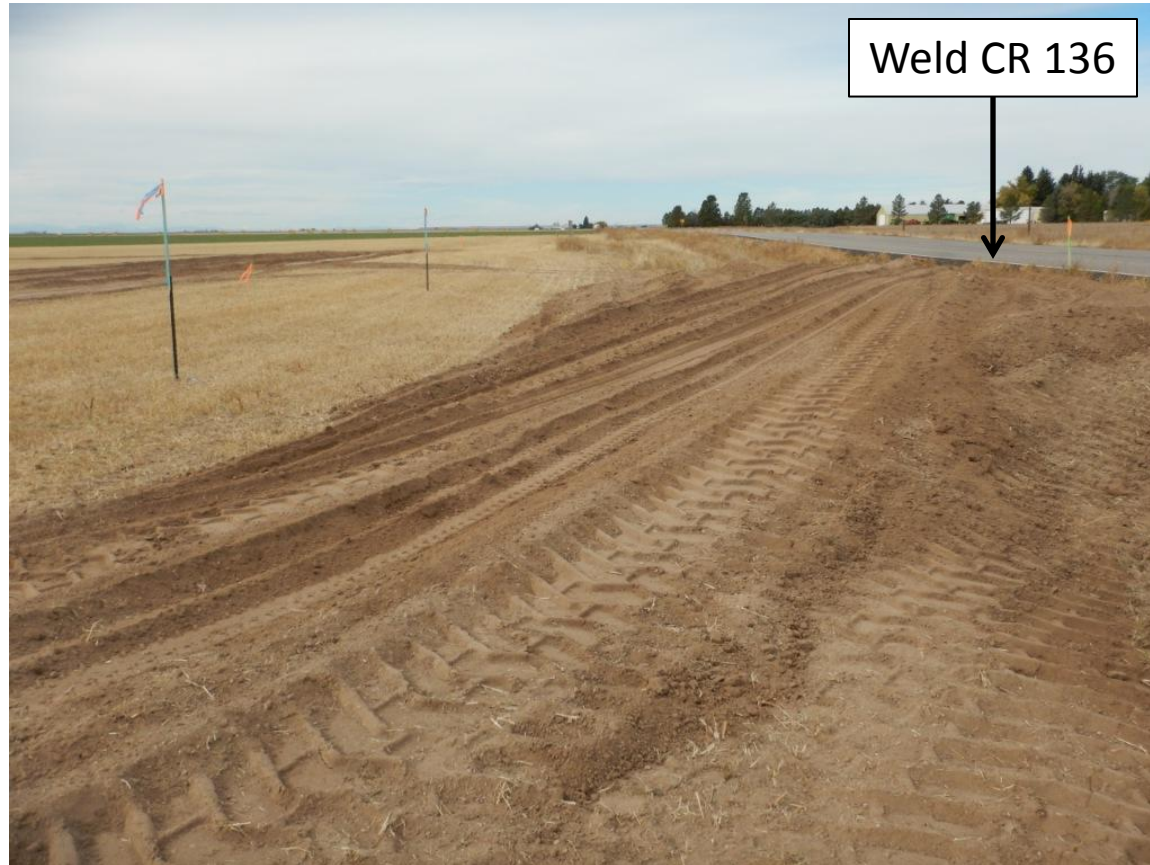
Photo 2. Photo taken from northern location, facing West on 10/20/2015. No stormwater control BMPs.