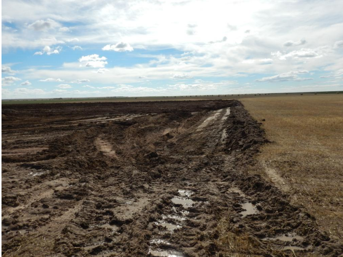
Photo 7. Photo taken from west location, facing South on 10/23/2015. No stormwater control BMPs. Corrective action was not met.