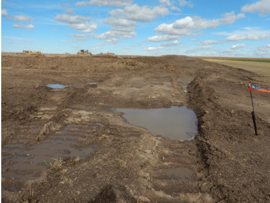
Photo 9. Photo taken from Southeast corner of location, facing North towards topsoil stockpile on 10/23/2015. No stormwater controls. Also, pooling water in center of photo. Corrective action was not met.