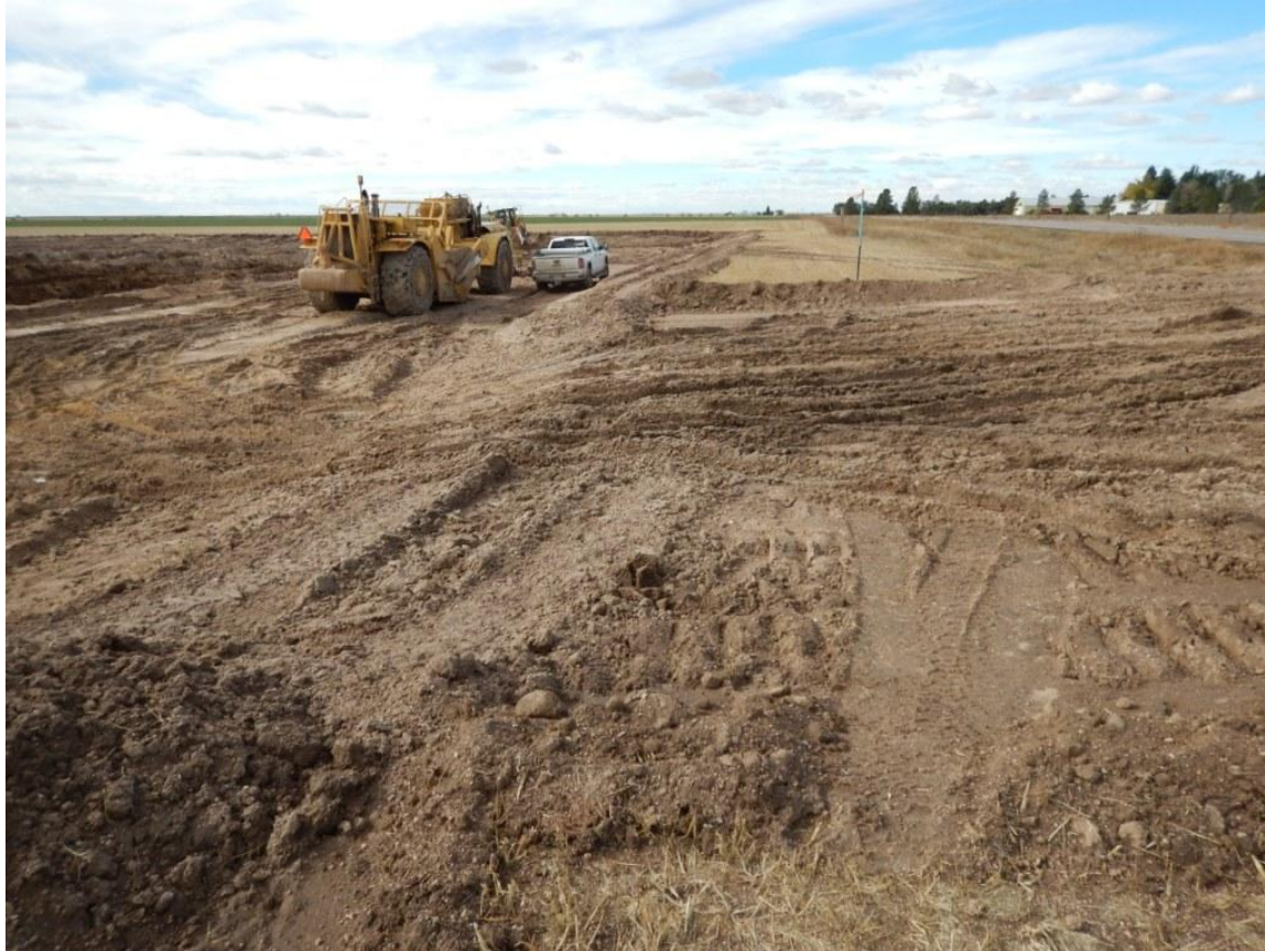
Photo 5. Close-up photo taken from northern location, facing West on 10/23/2015. No stormwater control BMPs. Corrective action was not met.