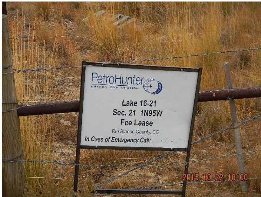
Battery sign @ entrance