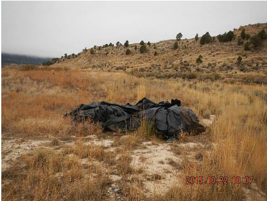
Pit liner – debris