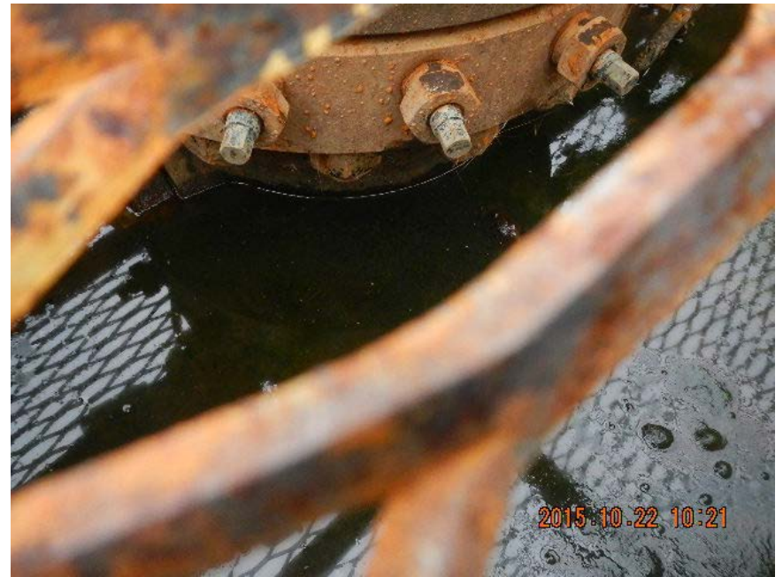
Fluid in cellar