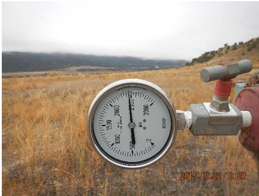
Gauge on wellhead