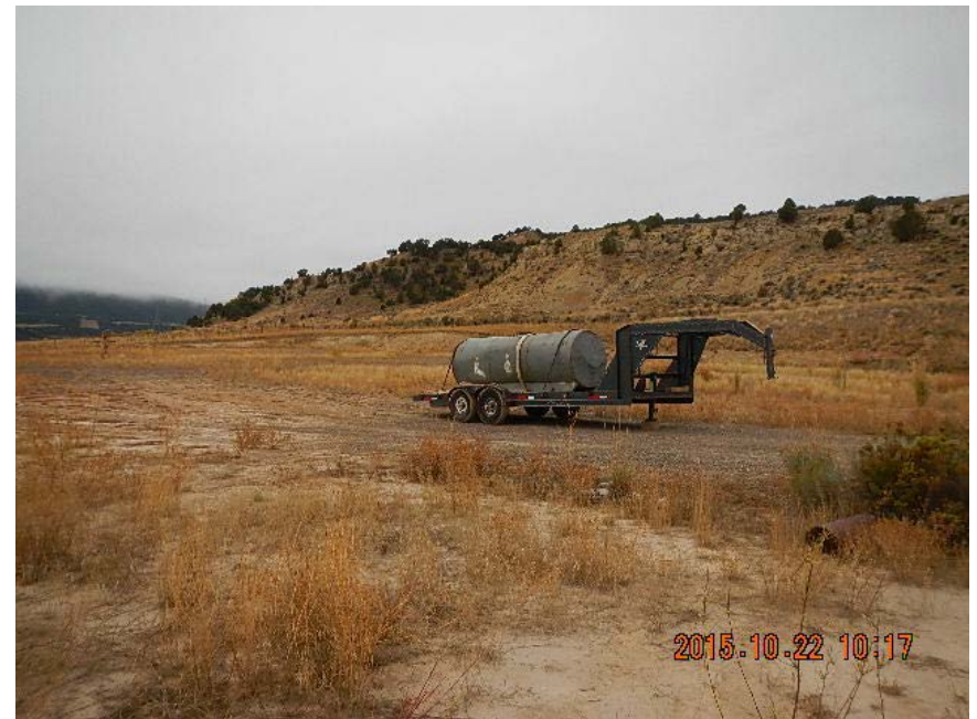
Trailer on location