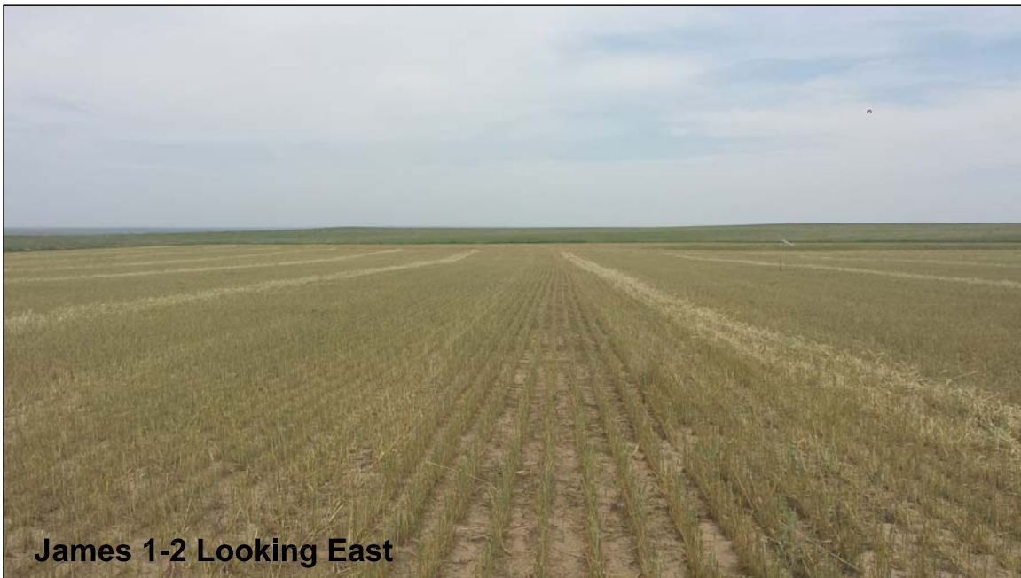
James 1-2 Looking East