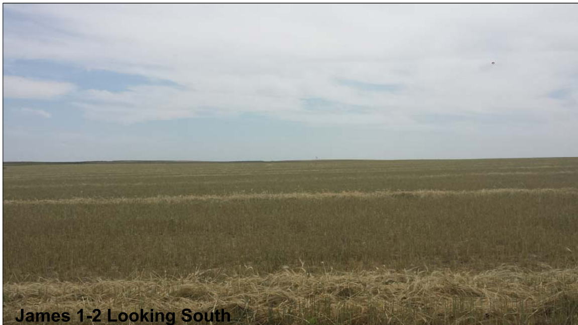
James 1-2 Looking South