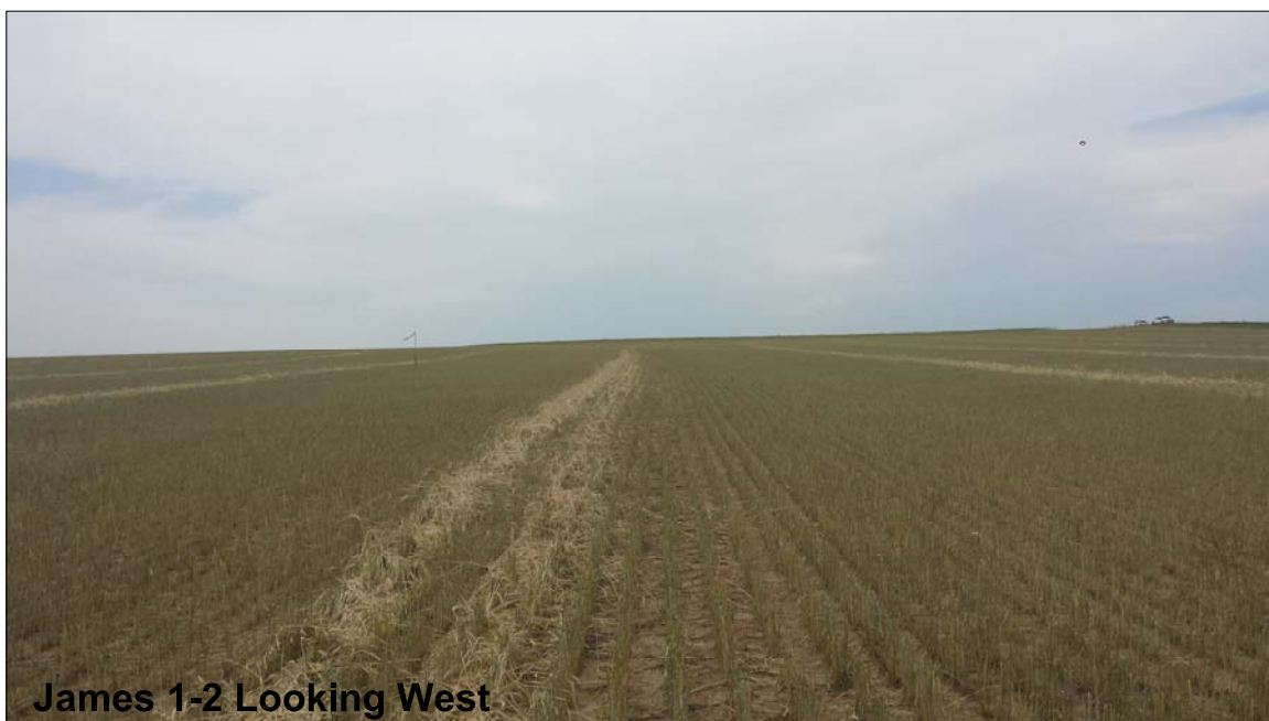
James 1-2 Looking West