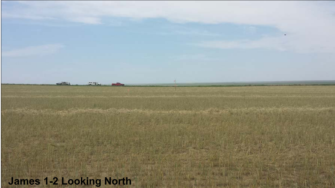
James 1-2 Looking North