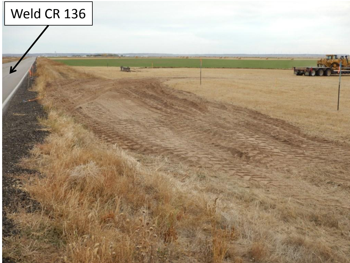
Northern temporary access road with no stormwater BMP's. Photo location is facing east.