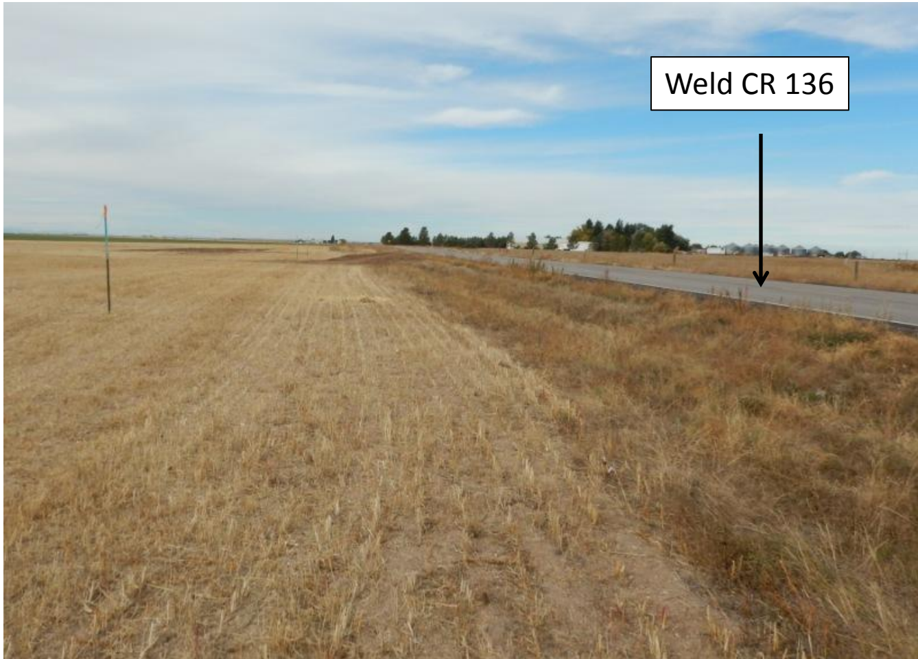
Northeast corner of well location facing west. No stormwater BMP's.