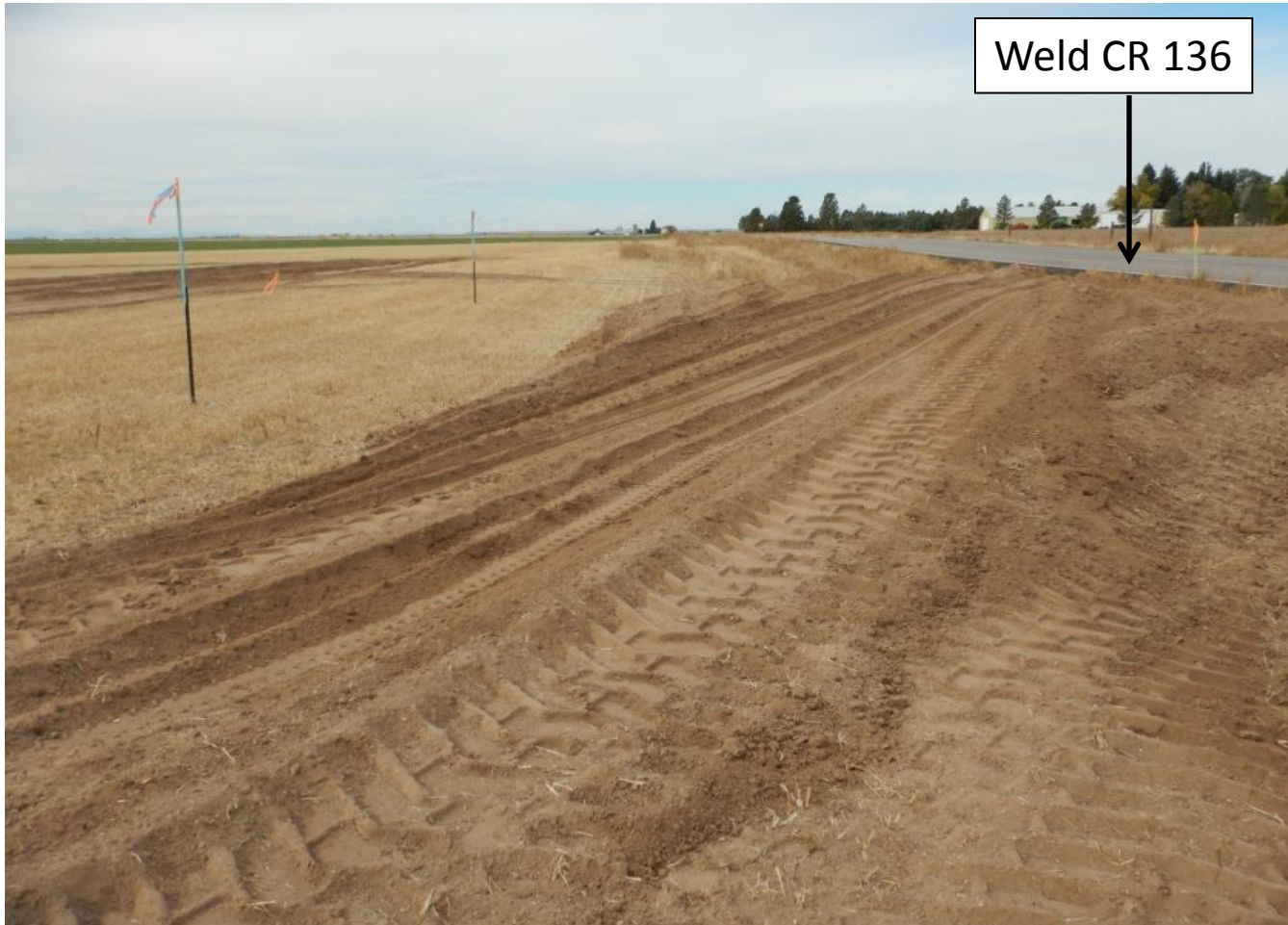
Northern temporary access road with no stormwater BMP's. Photo location is facing west.