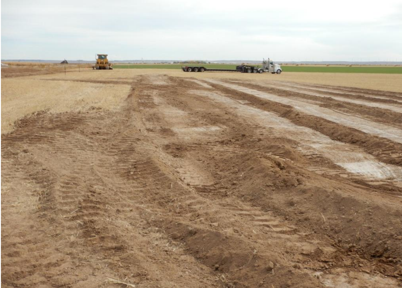
Northwest corner of well location facing east. Scraper made some cuts for temporary access road (next photo).