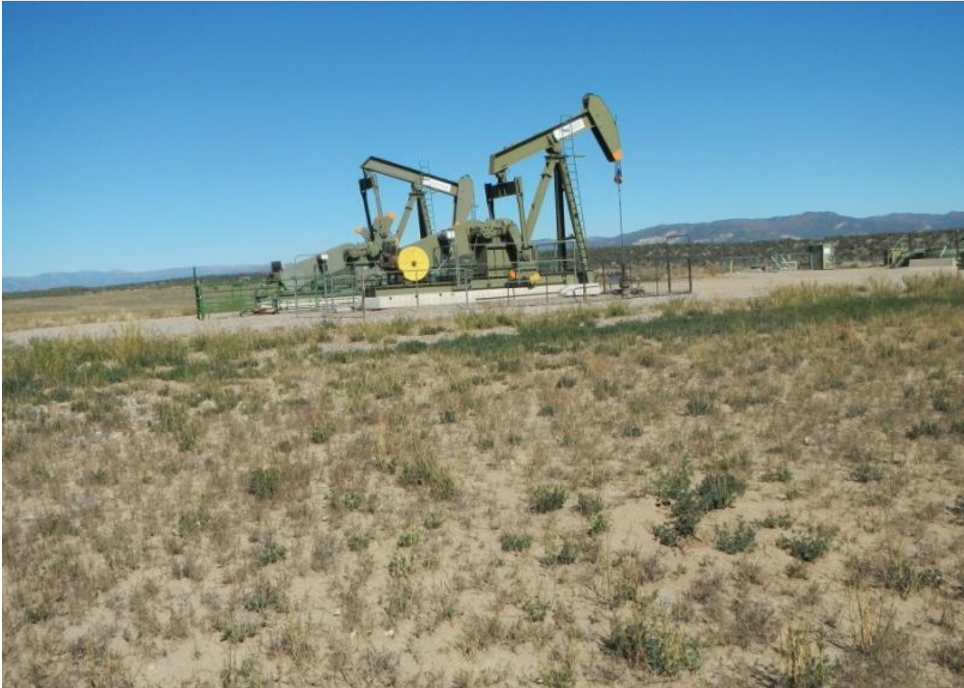
Photo 1. View of project area from southwestern corner facing center. Location is within a dry pasture. Revegetation is comprised of vegetation such as alfalfa ( Medicago sativa ) and meadow barley ( Hordeum brachyantherum ).