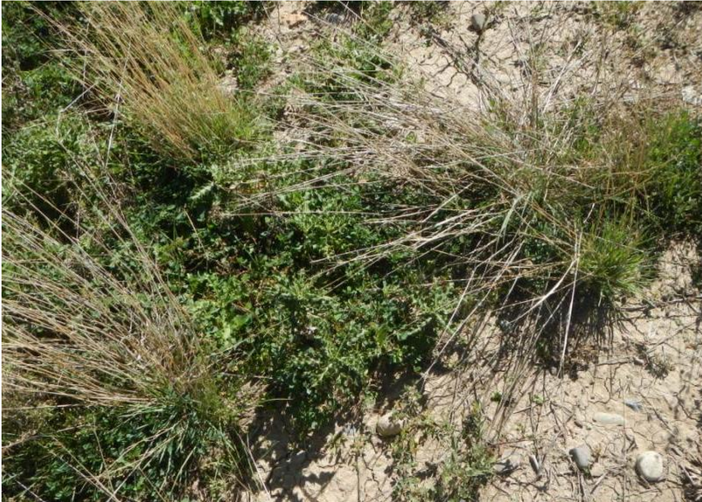
Photo 5. View of Canada thistle ( Cirsium arvense ) plants within the northern portion of the project area.