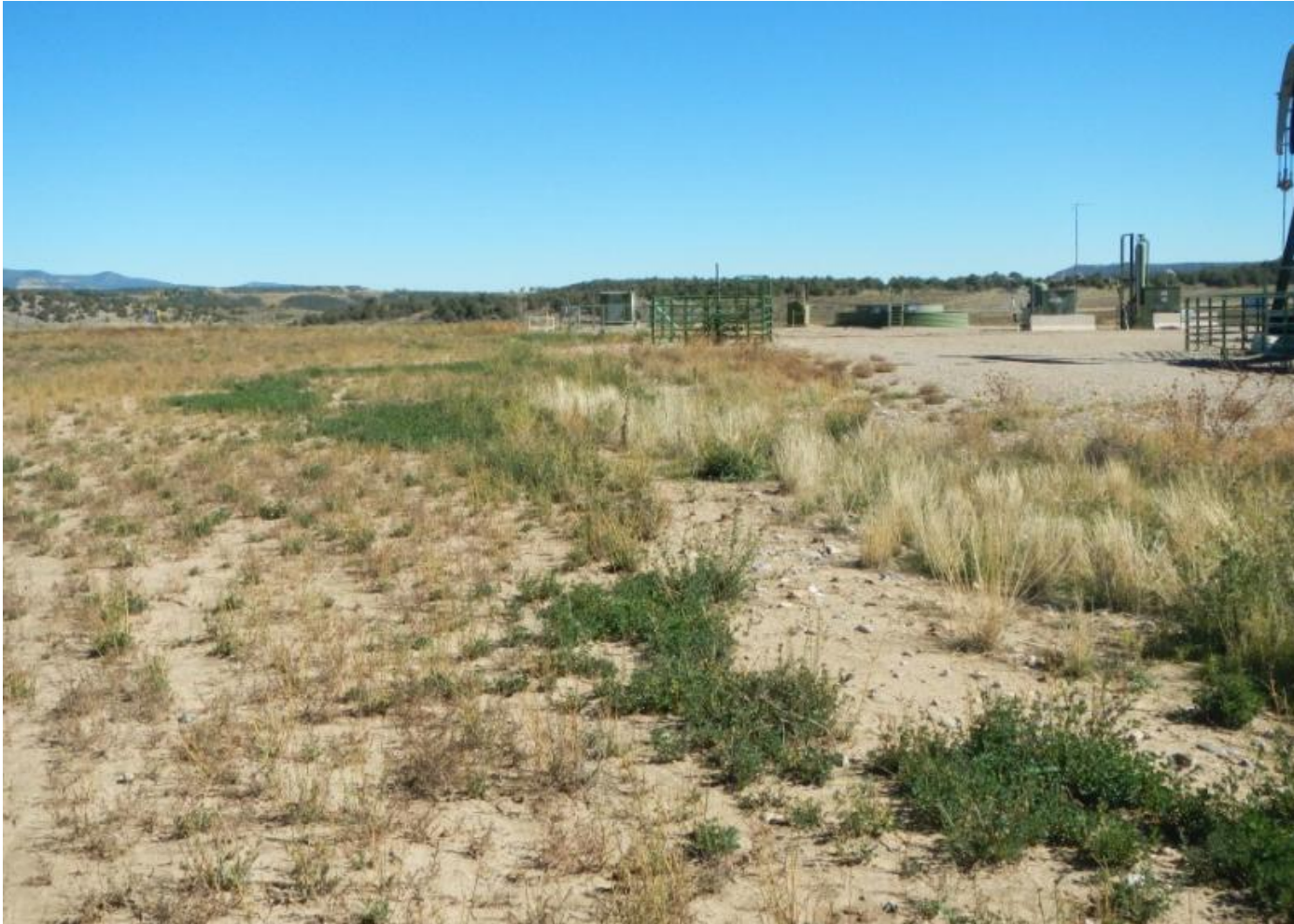
Photo 3. View of northern portion of project area from northwestern corner facing eastward.