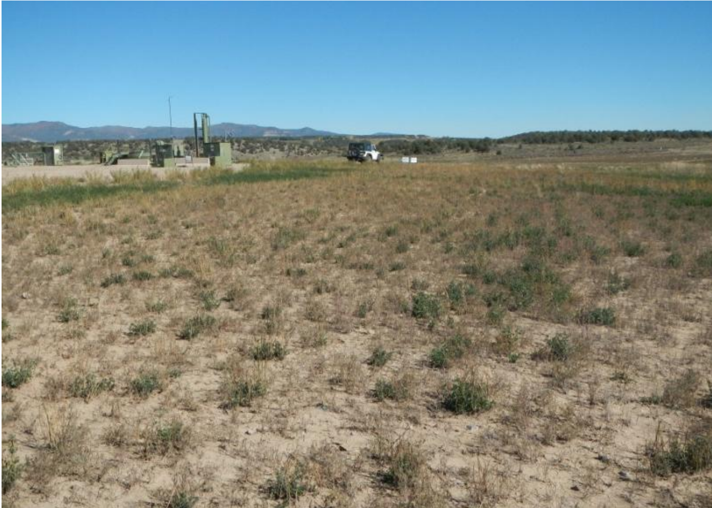
Photo 2. View of southern portion of project area from southwestern corner facing eastward.