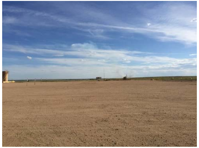
LOCATION LOOKING NORTH

Z:\Projects\1319-01_BONANZA\5N-61W\DWG\MAP24_5-61.dwg SAVED DATE 2015-09-03 09:09