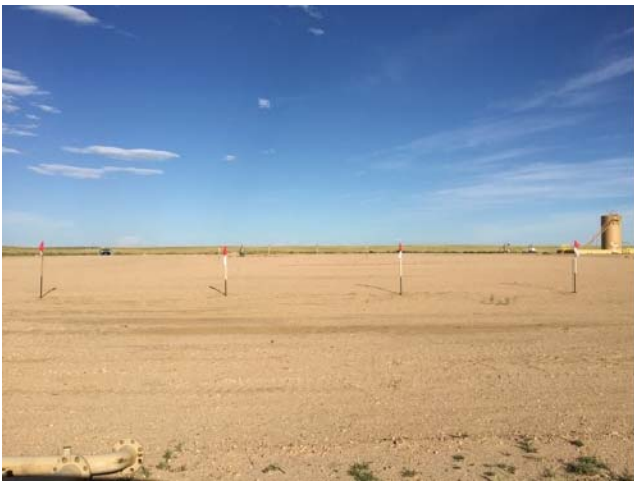
LOCATION LOOKING WEST