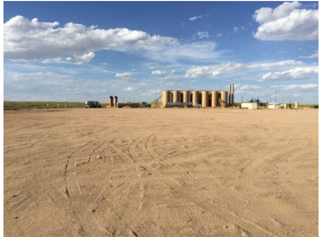
LOCATION LOOKING SOUTH