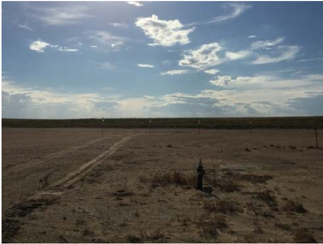
LOCATION LOOKING EAST