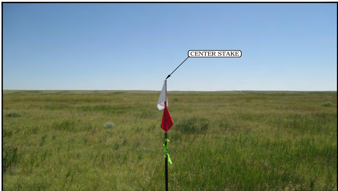
PHOTO: VIEW OF CENTER STAKE