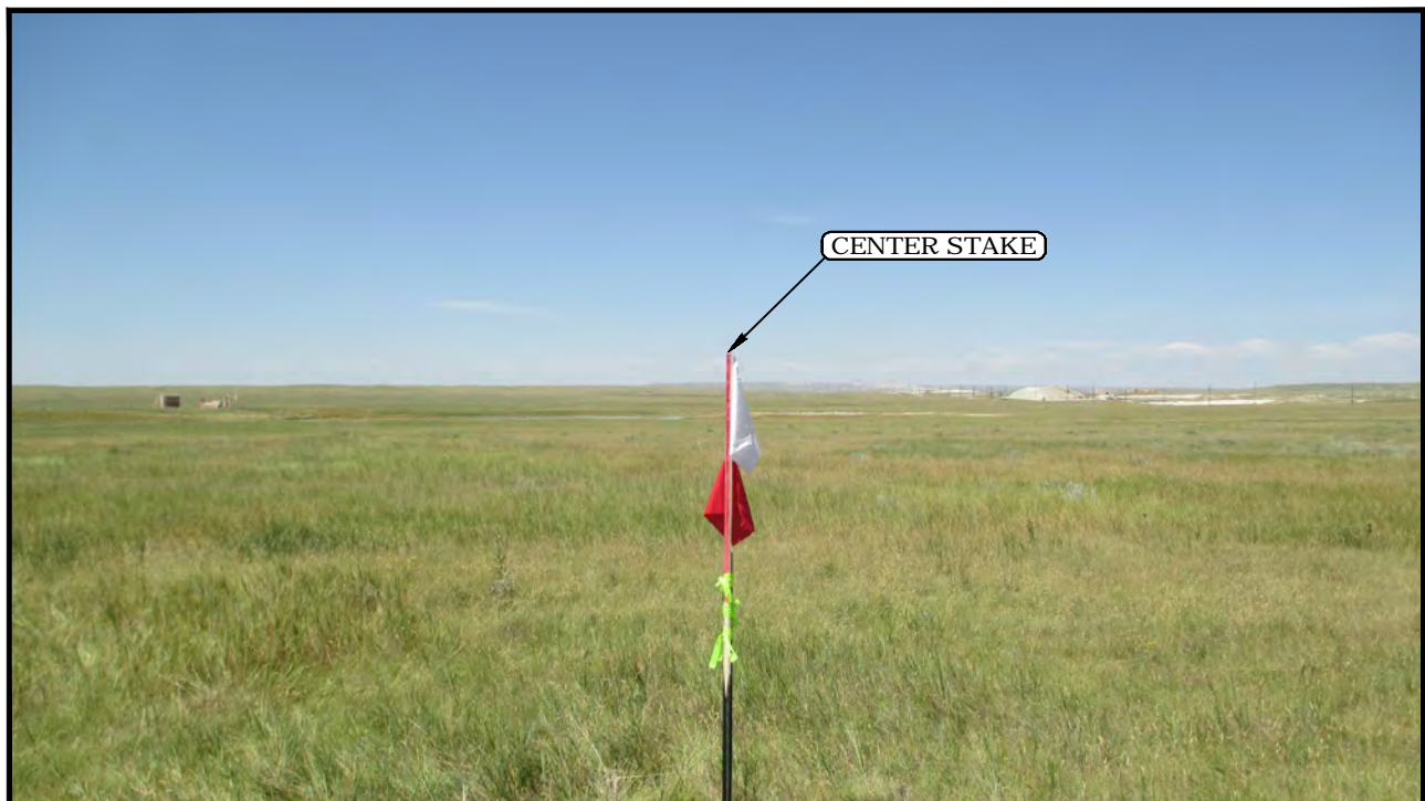
PHOTO: VIEW OF CENTER STAKE