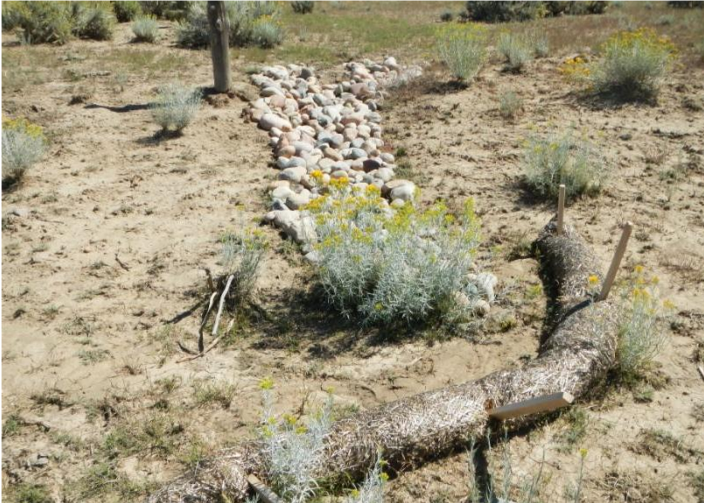
Photo 1. View of new cobble armoring and straw wattle in eastern portion of project area from well pad facing upstream.