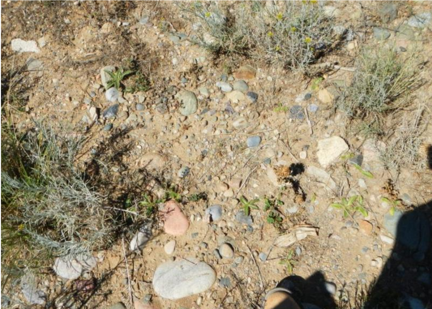
Photo 4. View of numerous small musk thistle rosettes within the southern portion of the project area.