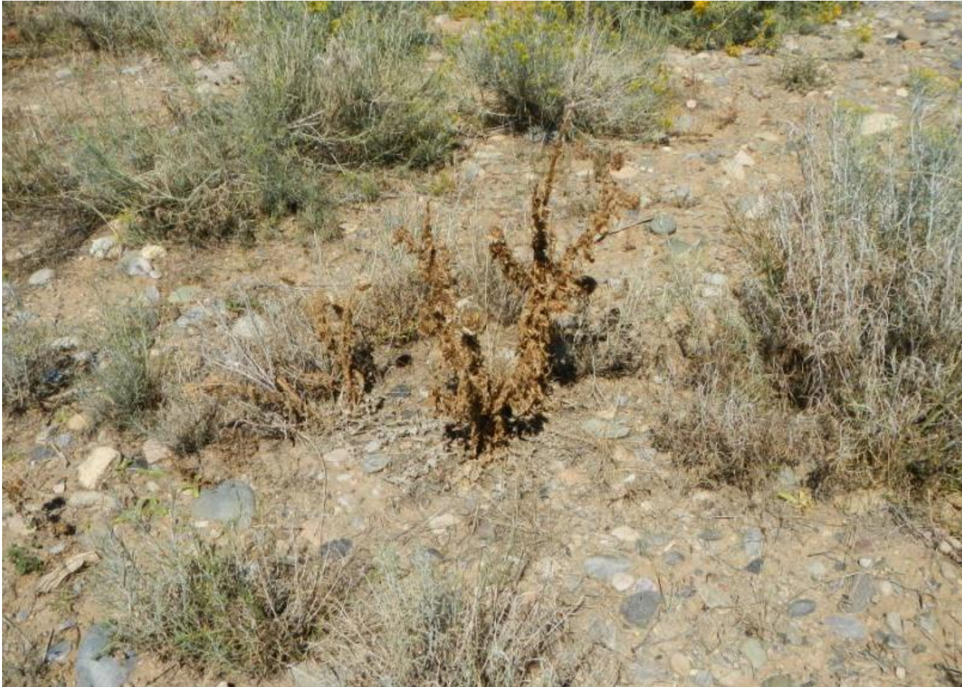
Photo 3. View of musk thistle ( Carduus nutans ) within the project area that appears to have been treated.