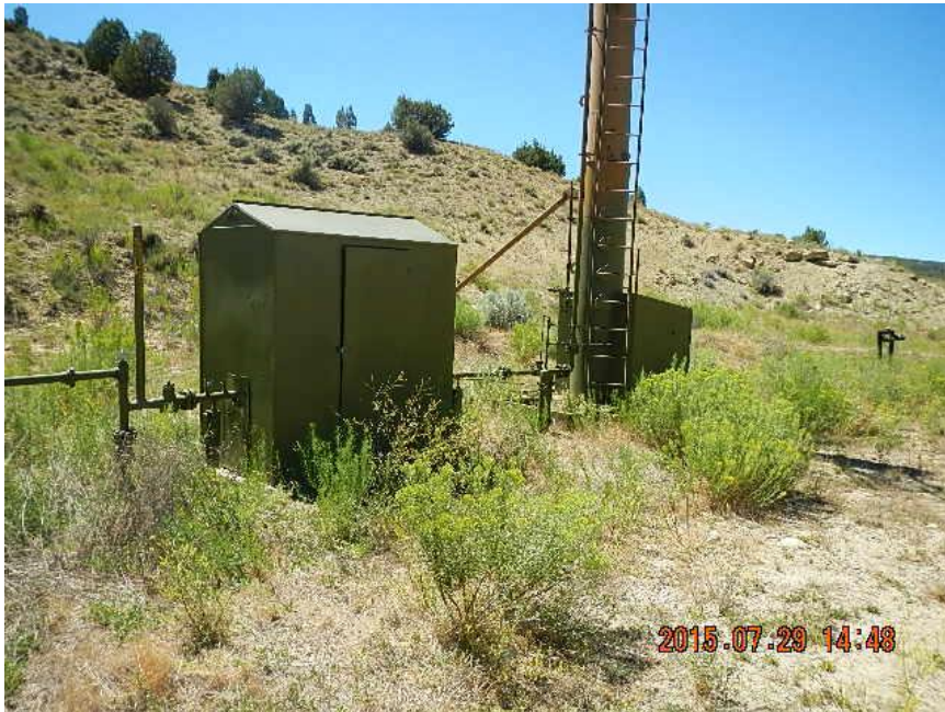
^ - Initial inspection