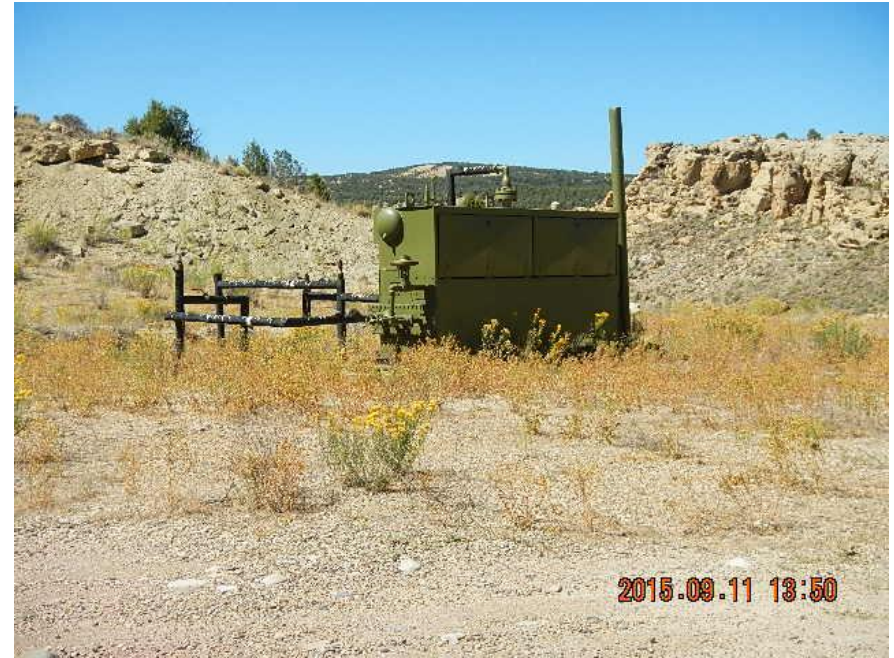
^ - Follow up inspection