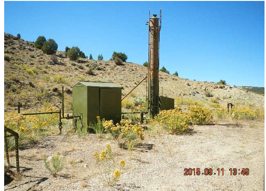
^ - Follow up inspection

Weeds/brush within 25' of production equipment.