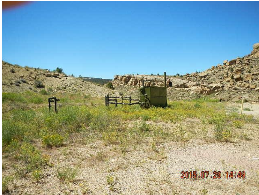
^ - Initial inspection Brush/weeds within 25' of production equipment.