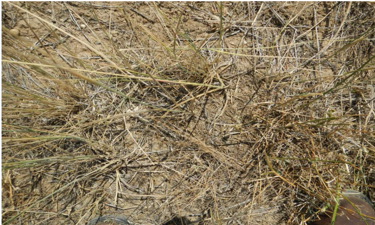
Photo 2: Ground view at the midpoint of Transect #1, Disturbed Area.