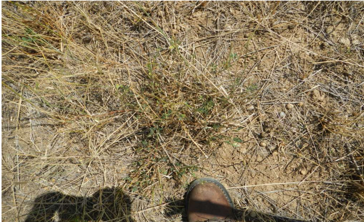
Photo 7: Ground view at the midpoint of the Transect #2, Disturbed Area.