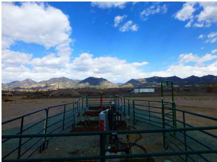
Hangs A Pad Looking North