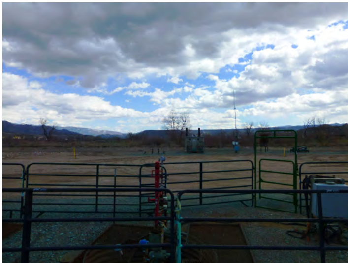
Hangs A Pad Looking East