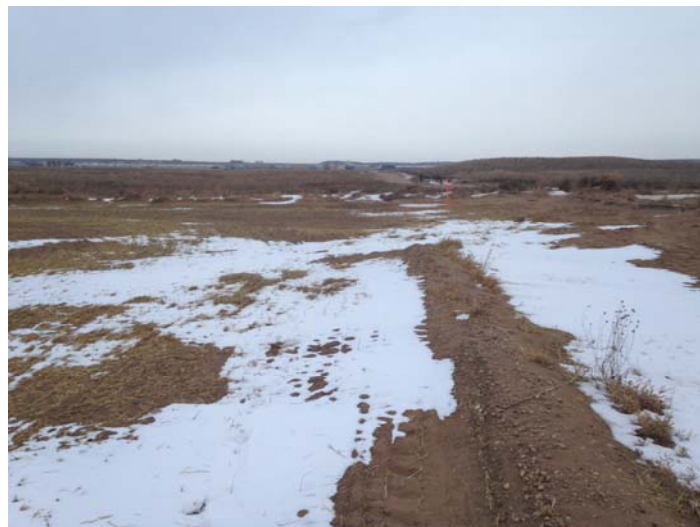
LOCATION LOOKING EAST