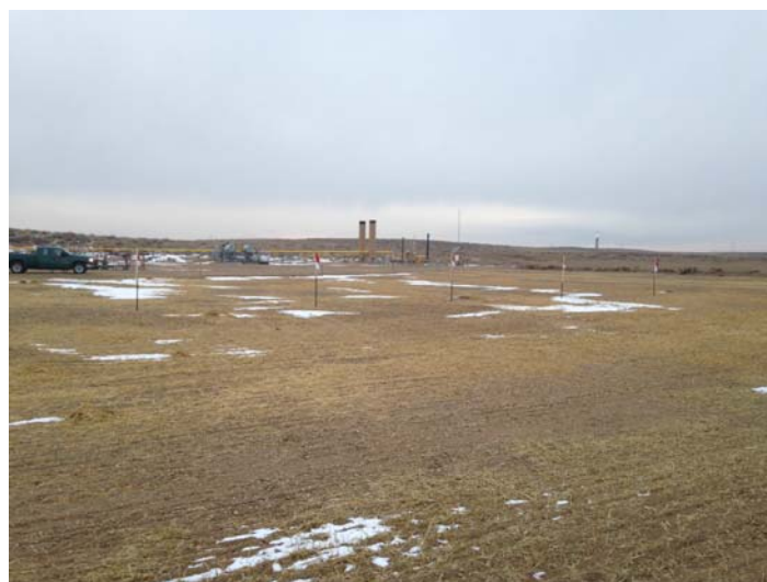
LOCATION LOOKING WEST

Z:\Projects\1319\01_BONANZA\63\WID\NORTH PLATTE T-13_MAP.dwg SAVED DATE 2015-07-09 08:41