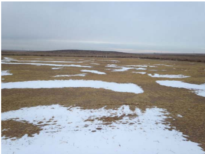
LOCATION LOOKING NORTH