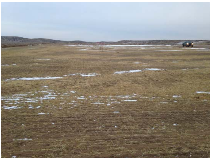
LOCATION LOOKING SOUTH